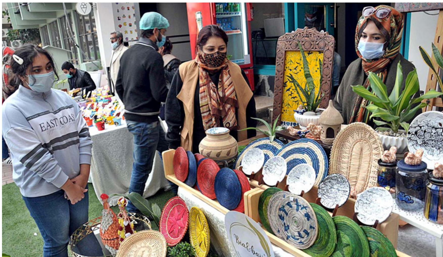
ISLAMABAD: Stalls holders displaying different stuff to attract the visitors during Happiness Bazaar setup in F-7 Sector.