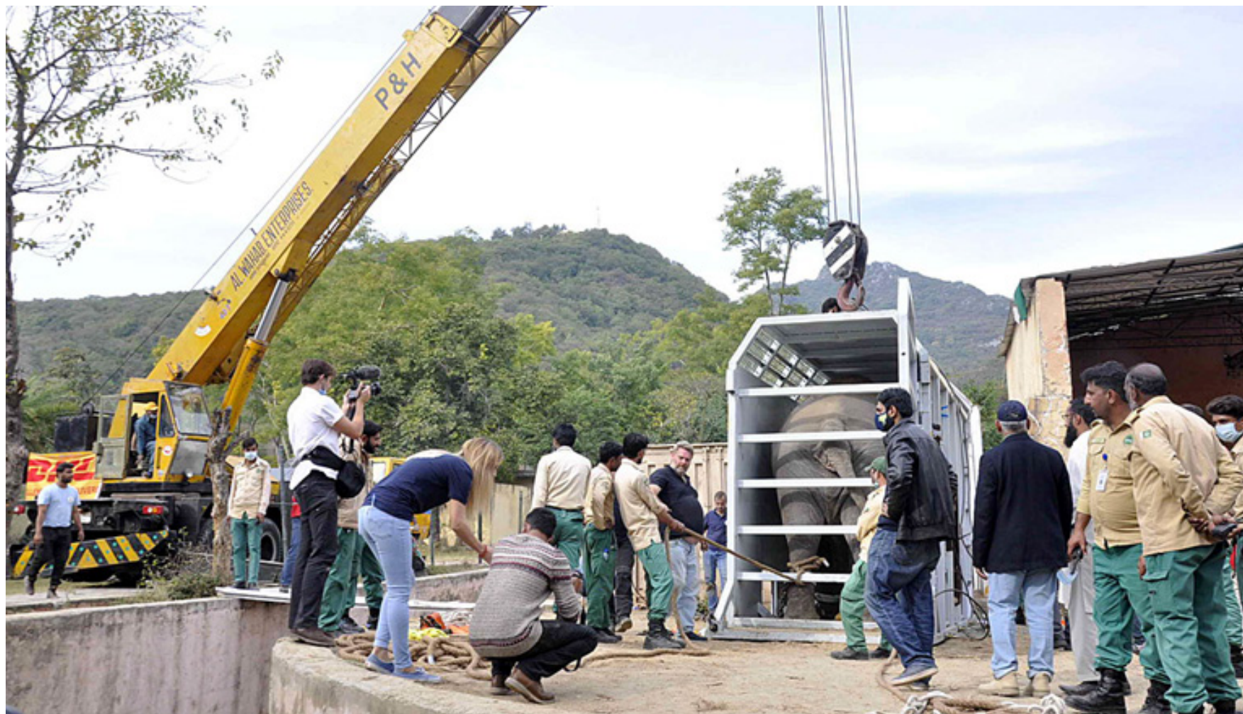
ISLAMABAD: Kavaan the elephant being loaded on a delivery truck for shifting to airport. The elephant is being shifted to Cambodia. - APP

ISLAMABAD: Indus River System Authority (IRSA) on Sunday released 115,600 cusecs water from various rim stations with inflow of 54,200 cusecs. According to the data released by IRSA, water level in the Indus River at Tarbela Dam was 1489.46 feet, which was 97.46 feet higher than its dead level 1386 feet. Water inflow in the dam was recorded as 26,200 cusecs and outflow as 75,000 cusecs. The water level in the Jhelum River at Mangla Dam was 1184.80 feet, which was 144.80 feet higher than its dead level of 1040 feet whereas the inflow and outflow of water was recorded as 9,400 cusecs and 22,000 cusecs respectively. - APP