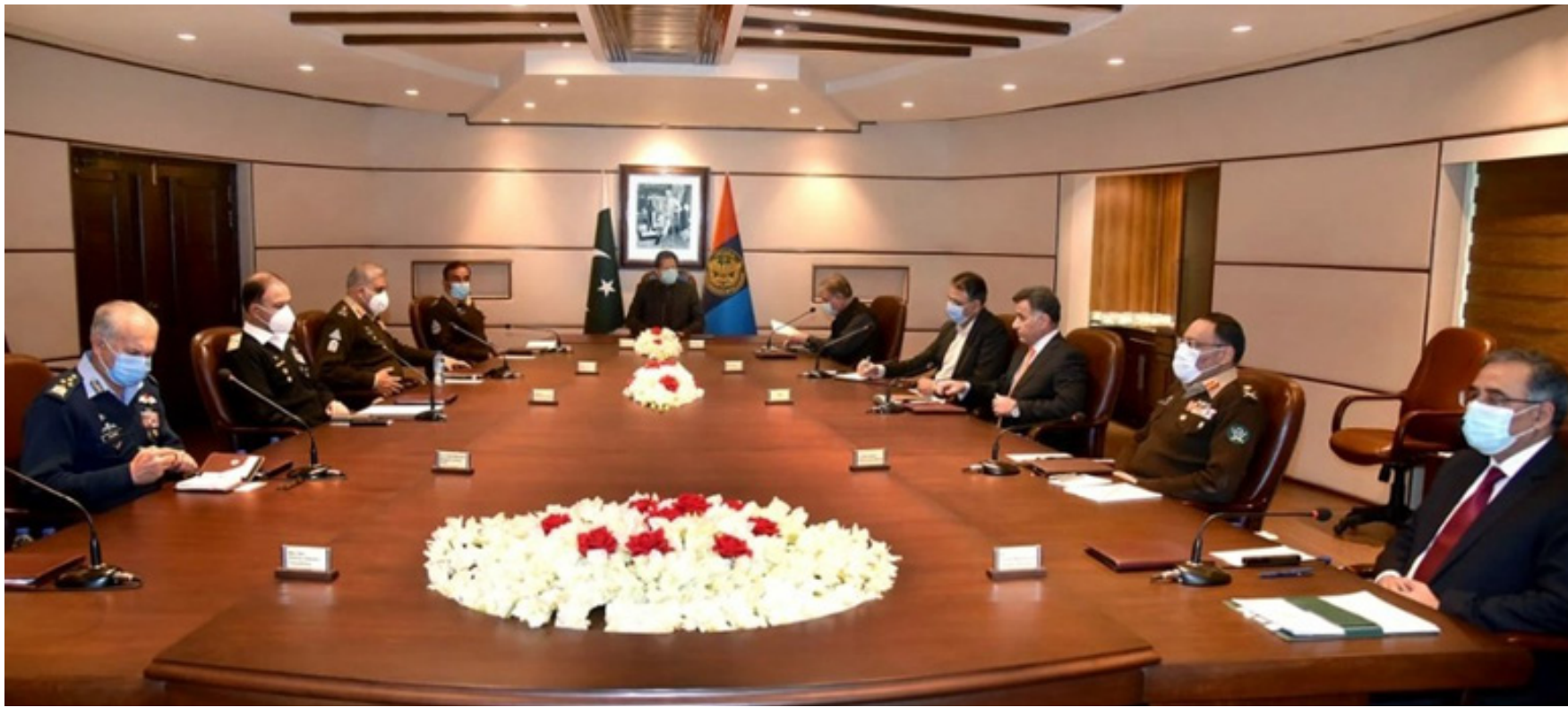
ISLAMABAD: Prime Minister Imra Khan, along with Army, Air & Naval Chiefs visit ISI headquarters. They were given briefing on "national security and regional" situation by ISI chief Lt Gen Faiz Hameed

MULTAN: As many as eighty Pakistan Democratic Movement (PDM) on Sunday booked over taking out a rally and storming into Qila Qasim Bagh by violating coronavirus SOPs. The FIR was registered against over 80 people including Abdul Qadir Gilani, Moosa Gilani, Haider Gilani and Qasim Gilani, the four sons of former prime minister Yousuf Raza Gilani under charges of vandalizing government properties, interfering in government duty and torture. Meanwhile, the police have launched a crackdown against political workers in various cities and towns of South Punjab and arrested several workers of the Pakistan Democratic Movement (PDM) ahead of a scheduled public meeting of the opposition alliance in Multan on November 30. According to reports, police arrested local leaders of PML-N Chaudhry Shahbaz Jutt, Sohail Butt, JUI's Qari Khalil Rehman and Maulana Muneer Ahmed Abbasi from Tiranda Mohammad Panah in the vicinity of Liaquatpur.