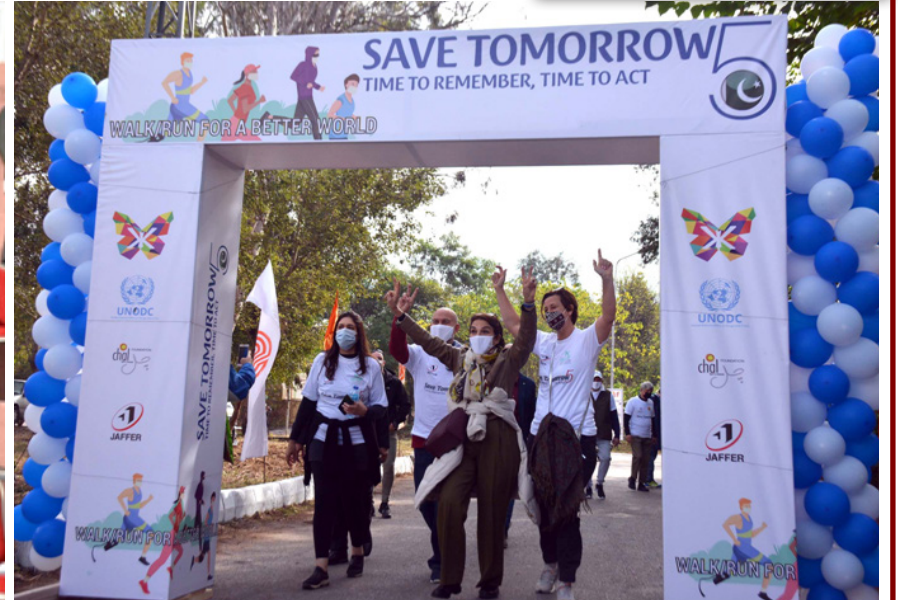
ISLAMABAD: Islamabad Serena Hotel arranged a walk titled RUN FOR A BETTER WORLD. A number of diplomats and members of civil society took part in the walk. UNODC also partnered with Serena Hotel. The participants gathered at the Jasime Garden and walked up to open theatre in Shakarprian. Prize distribution took place at the end of the event. Full coverage of the event in the coming issue of CENTRELINE magazine. - DNA