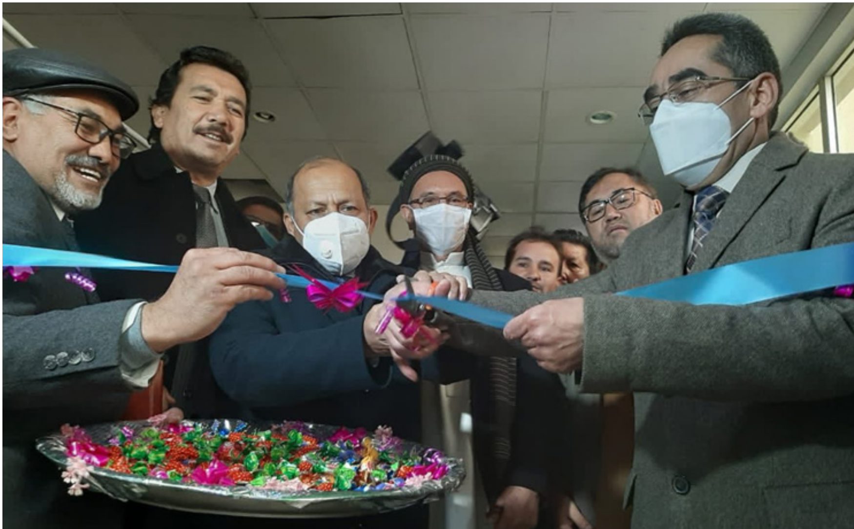
KABUL: Mansoor Ahmad Khan, Ambassador of Pakistan to Afghanistan along with Afghan health minister, Ahmad Jawad Usmani inaugurated new oxygen production plant provided by Pakistan to Jinnah hospital Kabul. - DNA

The national squad also underwent serology tests along with routine PCR testing for the COVID-19 virus yesterday. "Following serology (blood) testing, two of the original six positive cases are now considered to be historic cases and are therefore not infectious," the NZ health ministry said in its media release. The media release further said that 11 individuals return positive serology due to having historical infections. Names were not revealed by the ministry. "As a result, a further 11 people (in addition to the two mentioned above) returned previous serology indicating previous 'historic' infections," the ministry added.