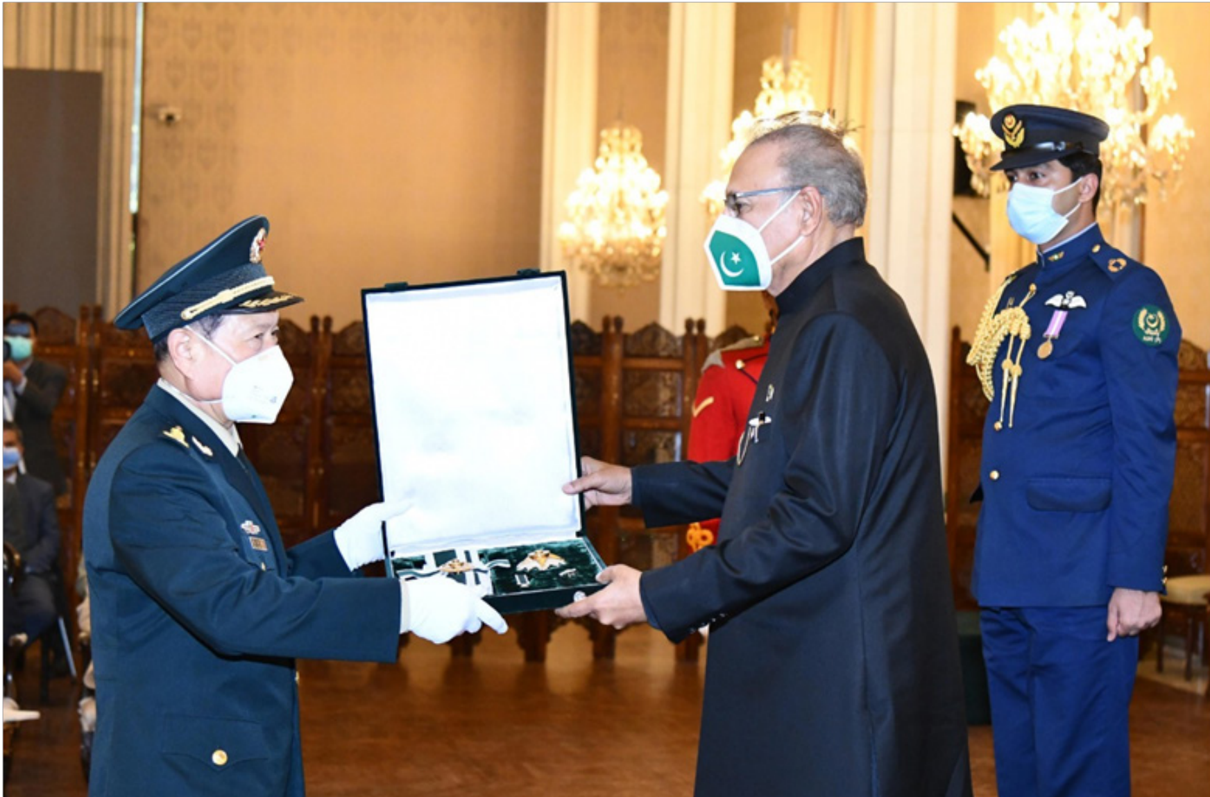
ISLAMABAD: President Dr Arif Alvi conferring Nishan-e-Imtiaz (Military) on minister of national defence of China, General Wei Fenghe, at Aiwan-e-Sadr.

The enraged protestors are urging the government to take back its decision to laying-off their services. The 4,544 PSM employees, including teachers, drivers, firemen, operators, health and security staffers, SEDGMs, managers and others had been sacked, a spokesperson from the Steel Mill said the other day. Pakistan People's Party (PPP) Chairperson Bilawal Bhutto Zardari while criticising the PTHed federal government, last week, had said in his tweet that the heartless government has sacked 4500 workers of Pakistan Steel Mills. PPP will return each and everyone back to work.