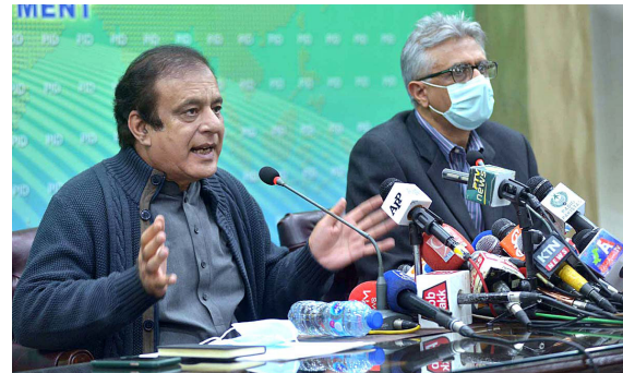
Tuesday. The Special Assistant shortlisted, contacted and few companies have been

ISLAMABAD: The Federal Cabinet has approved the grant of 150 million dollars to procure anti-Covid vaccine. This was announced by Prime Minister's Special Assistant on National Health Dr. Faisal Sultan along with Minister for Information and Broadcasting Shibli Faraz while giving details about decisions taken by the federal cabinet, which met in Islamabad on