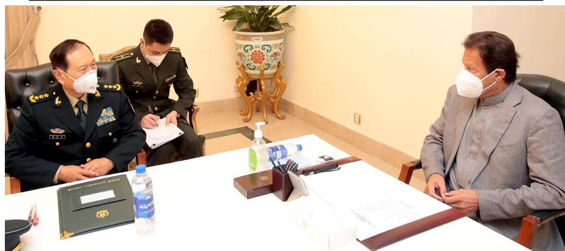
ISLAMABAD: Chinese State Councillor and Minister of Defence, General Wei Fenghe called on Prime Minister Imran Khan.