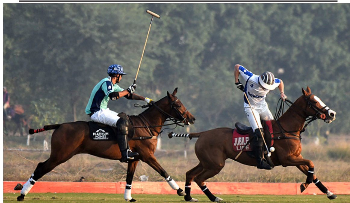
LAHORE: Players struggling to get hold on the ball during Maj Gen Saeed-uz-Zaman Janjua Memorial Polo Cup 2020 played between Newage and Platinum Homes. Newage won by 7.5-6 at Jinnah Polo & Country Club. – DNA

Claiming that Riyadh's policies have always been in line with maintaining peace and stability in the region, Al-Moallemi labeled Iran's missile program as "corruptive". The Saudi envoy also criticized Iran's decision to increase the level of uranium enrichment in response to the lack of commitment by the European parties to the JCPOA and the assassination of its prominent scientist.