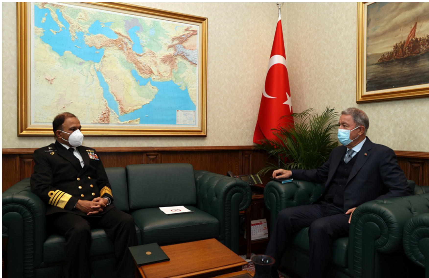
ANKARA: Chief of Naval staff of Pakistan Admiral Amjad Khan Nizai during his Turkey visit met Turkish defense minister, Hulusi Akar in Ankara. The two sides discussed the further development of Pakistan-Turkey relations.

Khalilzad praised the development, saying that it was proof that both parties to the conflict can "agree on tough issues". "We congratulate both sides on their perseverance. We thank Qatar for its facilitating role as host," he tweeted. The US envoy said that as negotiations seeking a political roadmap and comprehensive ceasefire begin, the US will work hard for "serious reduction in violence and even a ceasefire during this period". Pakistan has been instrumental in persuading the Afghanistan government and the Taliban to discuss options for peace. The move by Islamabad aims to put an end to the conflict that has been raging for the past 19 years in Afghanistan now. However, Islamabad has time and again warned the world against spoilers in the peace process, saying that New Delhi was against peace and stability in the war-torn country. In a video conference a few days ago, Pakistan's Foreign Minister Shah Mahmood Qureshi had said that the objective of the negotiations was for the Afghans to make decisions about their future. "The Afghans alone must be the masters of their destiny without outside influence or interference." "Spoilers from within and from without will pose formidable challenges. Constant vigilance will be required to guard against their machinations," Qureshi had said.