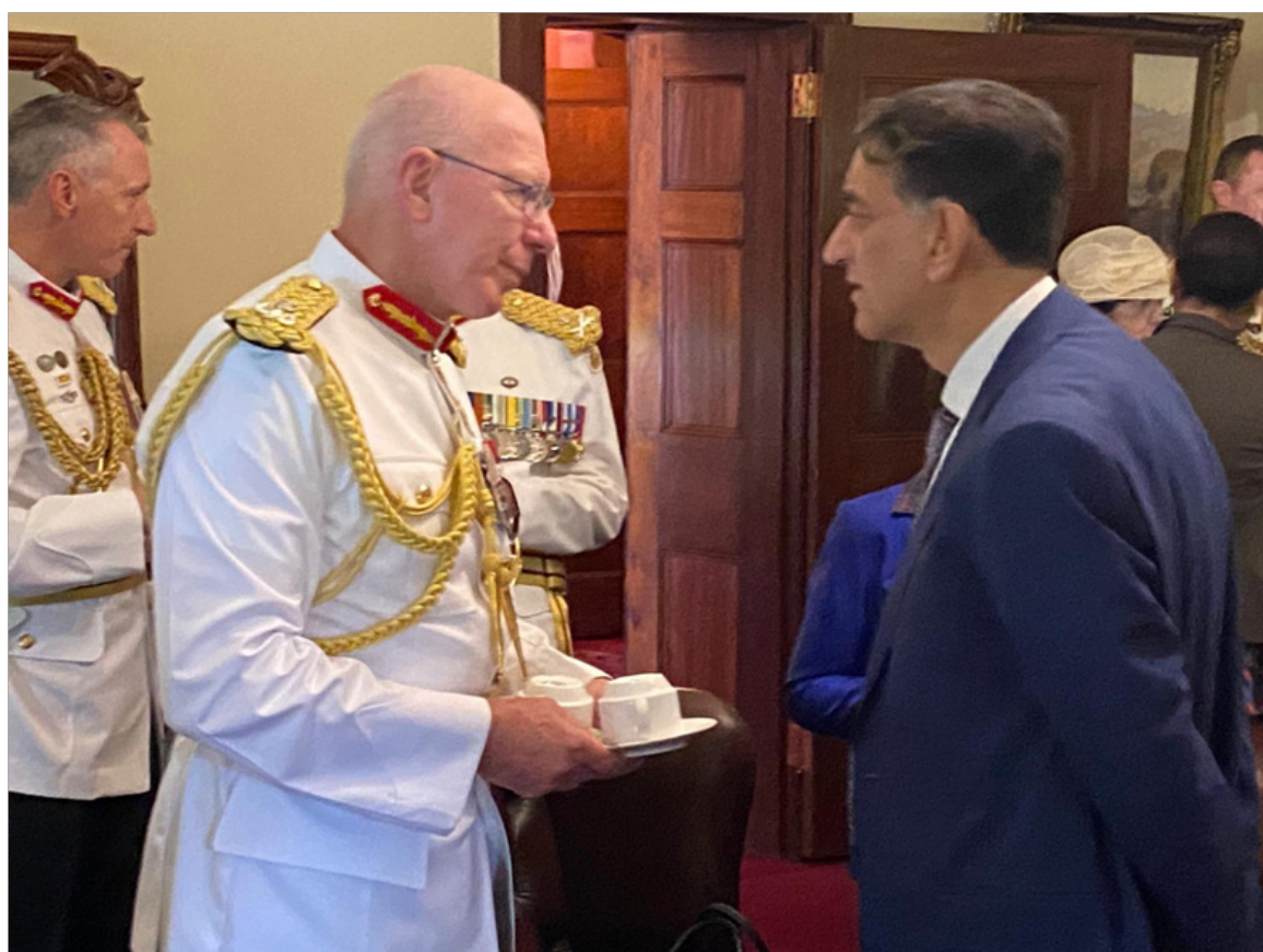
Canberra : The High Commissioner of Pakistan Babar Amin, today attended, the full time general service officer commissioning course graduation parade, on the invitation of Royal military college (RMC) – Duntroon in Canberra. – DNA

there had been no discussion of a statement. The Security Council is charged with maintaining international peace and security and has the ability to authorise military action and impose sanctions. But such measures require at least nine votes in favour and no vetoes by the United States, France, Britain, Russia or China. While no party has claimed responsibility for the killing of Fakhrizadeh – viewed by Western powers as the architect of Iran's abandoned nuclear weapons programme – Iran has accused Israel. Israeli Prime Minister Benjamin Netanyahu's office has declined to comment. The US traditionally shields Israel from any action at the Security Council. Washington has declined to comment on the assassination of the scientist.