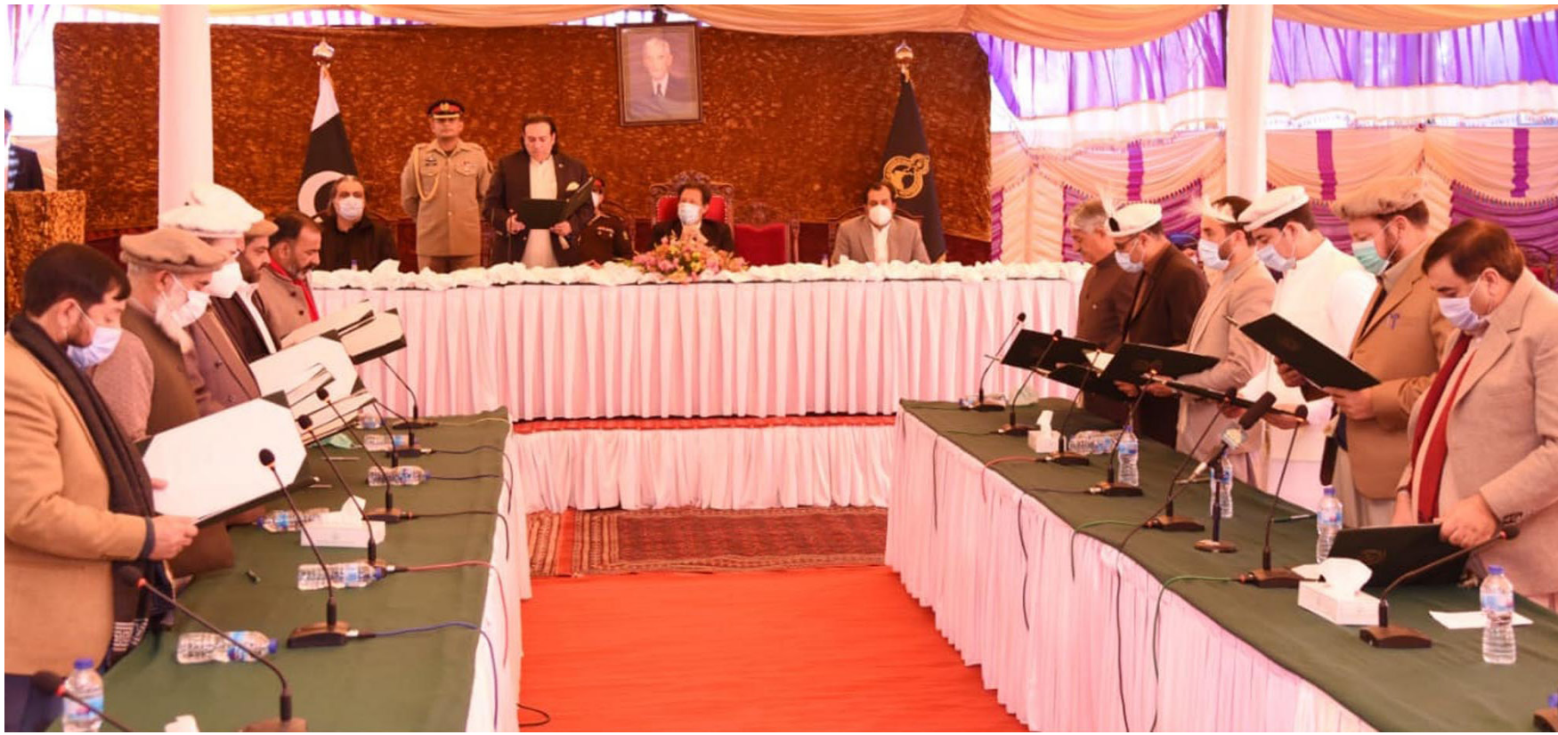
GILGIT: Prime Minister Imran Khan witnessing the oath taking ceremony of Gilgit-Baltistan cabinet. — DNA

LAHORE: Punjab Chief Minister Sardar Usman Buzdar on Wednesday said the PDM had no regard for human lives and this bandit brigade even tried to point-scoring on coronavirus. In a statement issued here, the Chief Minister regretted the opposition was indifferent to public safety as coronavirus was still spreading. Those who had no regard for human lives could not understand the public issues, he said, adding the opposition always adopted an irresponsible behaviour. The people of Multan had shown a mirror to the opposition, he said. The CM asserted the PDM was a mixture of rejected elements having no agenda for people. He said that 11 opposition parties could never compete with an honest and trustworthy leader like Imran Khan. He said holding public meetings would be enmity with the people as the corona situation was becoming serious. The intransigence of the PDM had put the lives of the people at stake because this bandit brigade had no pain for the masses, he remarked. — APP