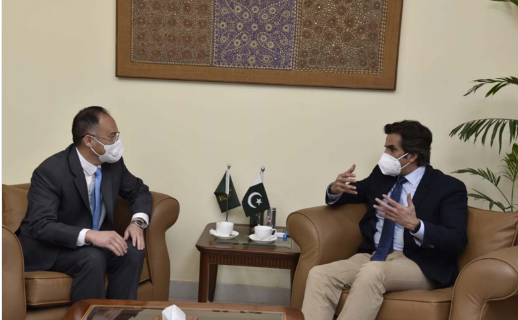
ISLAMABAD: Nong Rong, ambassador of Peoples Republic of China to Pakistan calls on federal minister for economic affairs, Makhdum Khusro Bakhtyar. – DNA

LONDON: Interpol has warned that criminals are planning to "infiltrate or disrupt supply chains" and target members of the public with fake vaccine scams as the world looks to immunize against Covid. On Wednesday, Interpol issued a global alert to its 194 member countries outlining potential criminal activity related to upcoming, large-scale Covid vaccination programs. The international policing body highlighted a number of threats posed by criminal activity, including the advertisement, sale and use of fake vaccines. "Criminal networks will also be targeting unsuspecting members of the public via fake websites and false cures, which could pose a significant risk to their health, even their lives," said Interpol Secretary General Jürgen Stock. Interpol also warned governments, pharmaceutical firms and logistics organizations to be aware of attempts by criminals to infiltrate Covid vaccine supply chains.