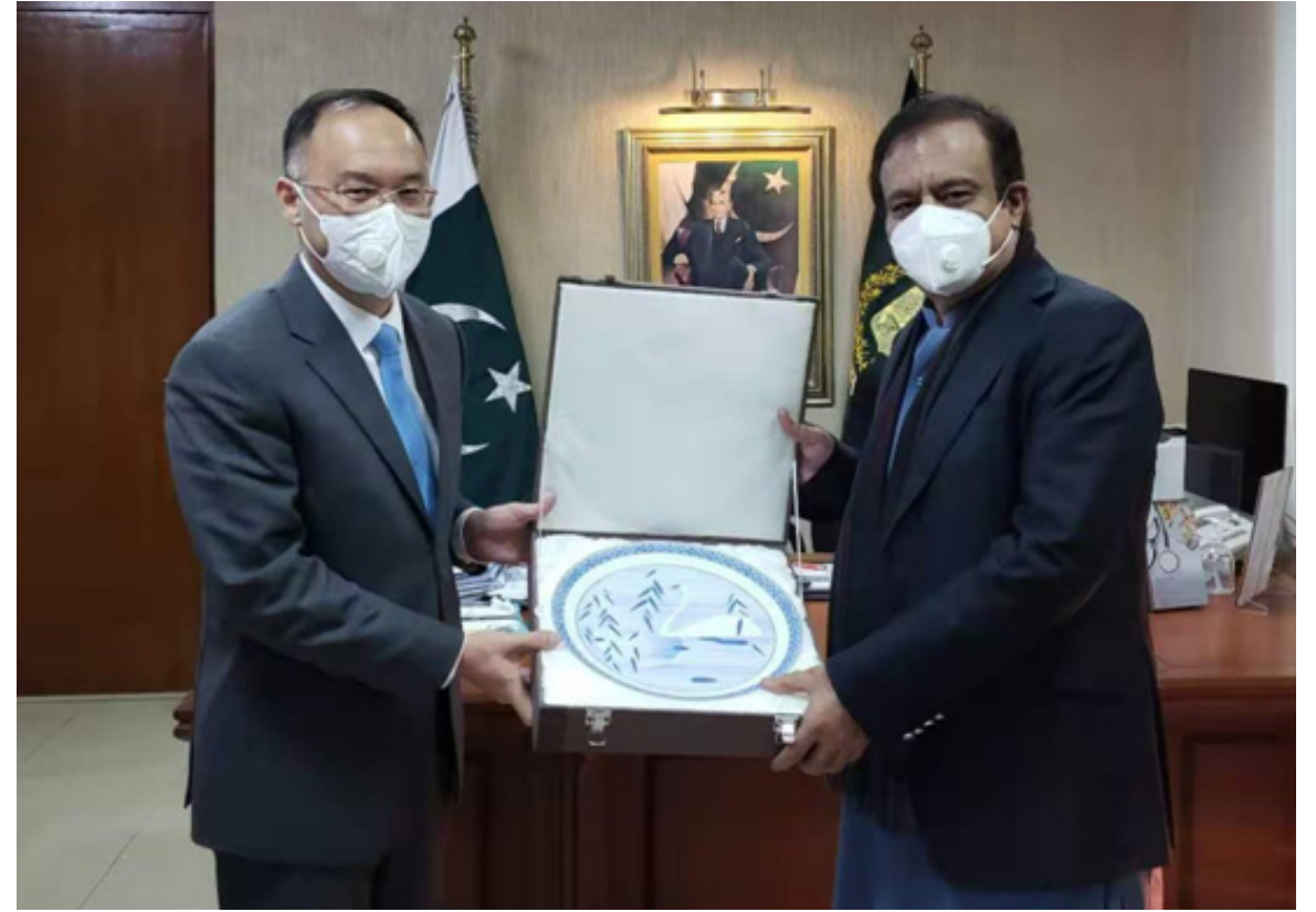
ISLAMABAD: Chinese Ambassador Nong Rong presenting a souvenir to Federal Minister for Information and Broadcasting, Senator Shibli Faraz. - DNA