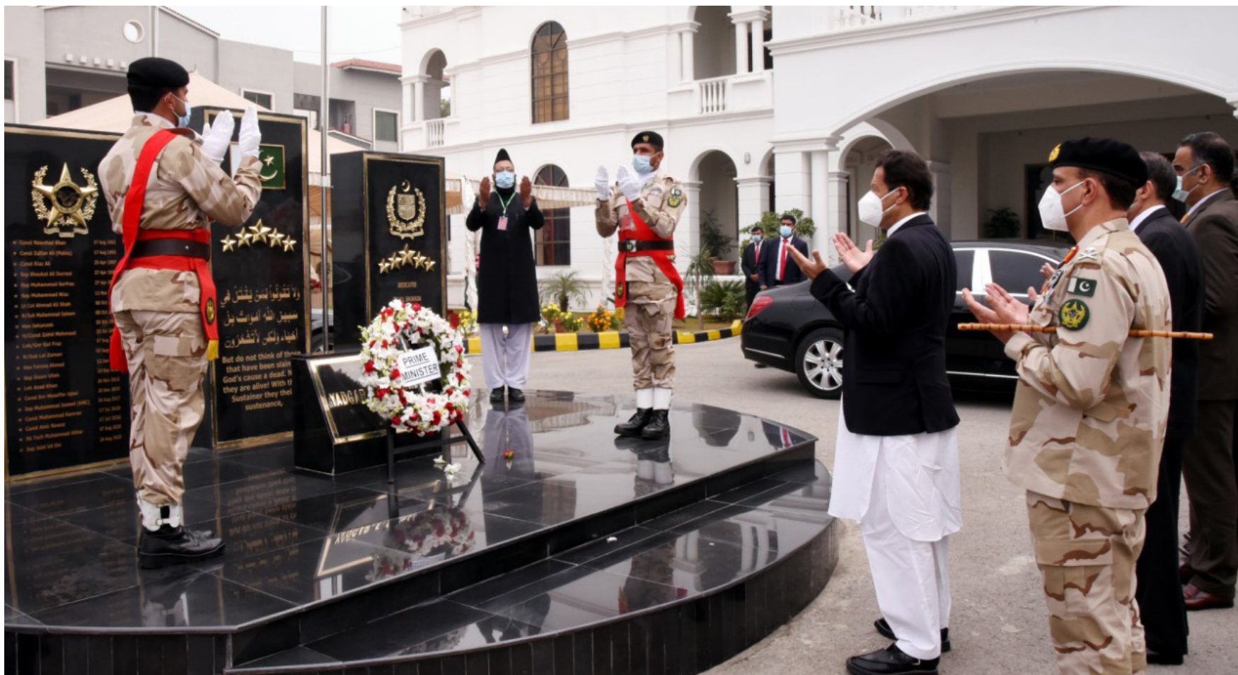
ISLAMABAD: Prime Minister Imran Khan offering fateha for shuhada during his visit to ANF headquarters, on Monday.