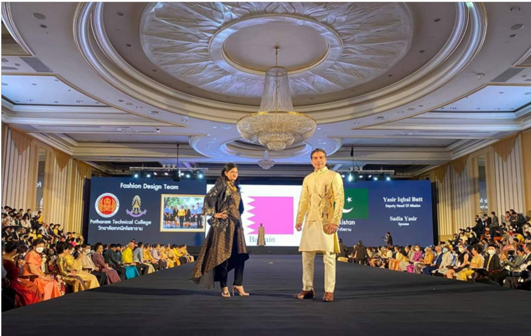
BANGKOK: Pakistan at the 10th Celebration of Silk-Thai Silk Road to World. Prime Minister Gen. Prayut Chan-o-cha presided over the opening ceremony. Talented students from the vocational colleges from Thailand designed the elegant Thai Silk dresses for the Diplomats and Embassy representatives from 100 countries.