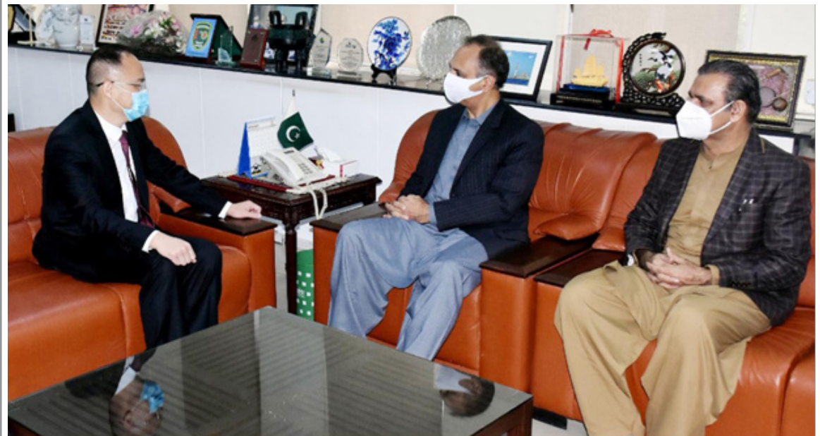
ISLAMABAD: Federal minister for energy, Omar Ayub Khan welcomed the newly appointed Ambassador of China to Pakistan, Nong Rong at his office. Chairman CPEC Authority, LT. Gen. (R) Asim Saleem Bajwa is also present on the occasion.

steps should continuously be taken for the restoration of all the other lights. The work of road carpeting, lane marking, and kerb stone should be expanded to all over the city, he added. He said that CDA is actively taking steps for improving the infrastructure of the city. Work on repairing of roads is continued in sectorial areas as well as in the rural areas. The work of repairing of roads of sector F-6, F-7, F-8, has been completed whereas the work is underway in G-5, G-6, G-7, G-8, G-9, G-10, and G-11, he further said.