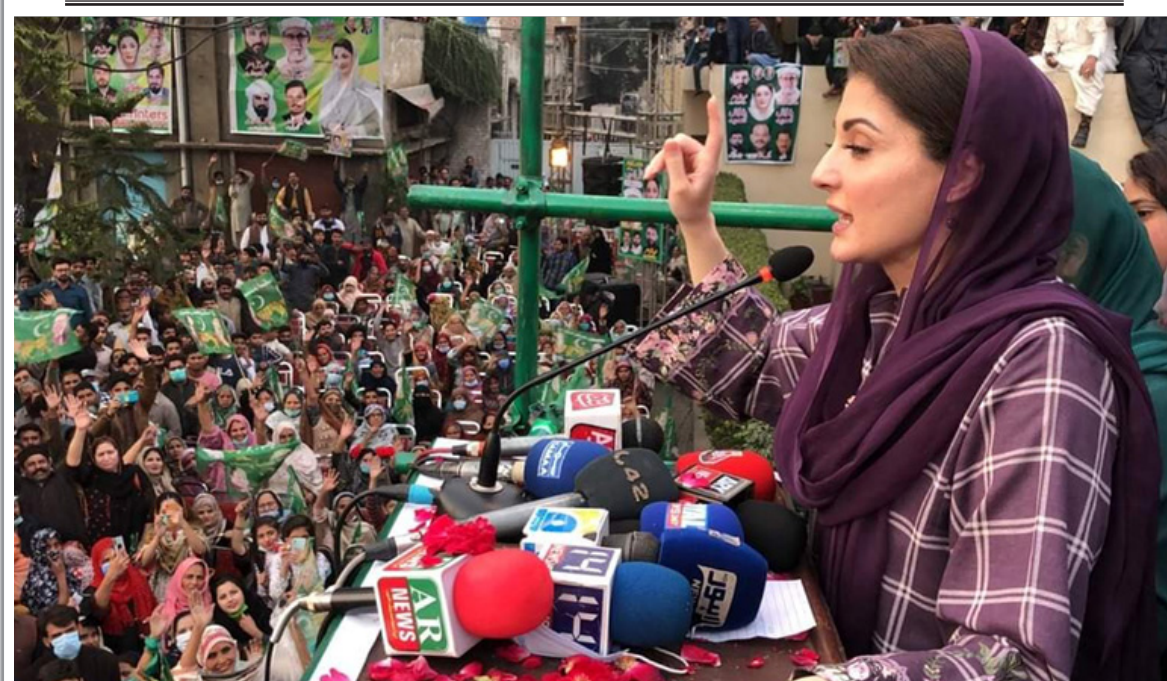
LAHORE: Pakistan Muslim League-Nawaz (PML-N) vice president Maryam Nawaz addressing a public gathering in Lahore.

the data up to 1st December 2020, reported by Pakistan Cotton Ginners' Association 4.6 million bales of cotton arrived in the industry while the figures of last year was 7.4 million, in the same manner, the unsold stock of this year is 0.9 million bales while last year it was 1.4 million. The data shows that cotton crop yield has declined by almost 13 percent, which is the major cash crop that could contribute significantly to the development and economic prosperity of the country.