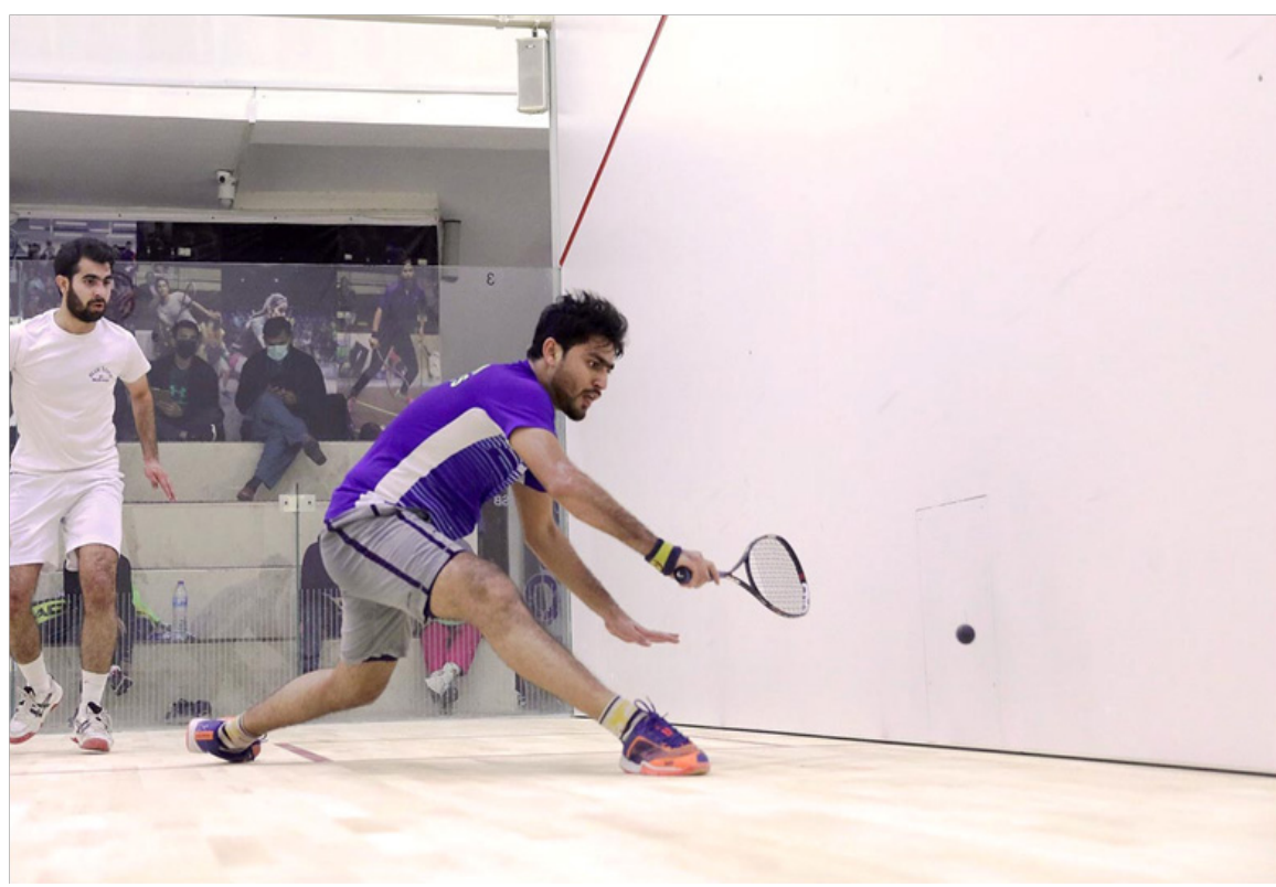
ISLAMABAD: Players in action during Pakistan International Squash Tournament for Men & Women organized by Pakistan Squash Federation (PSF) at Mushaf Squash Complex.