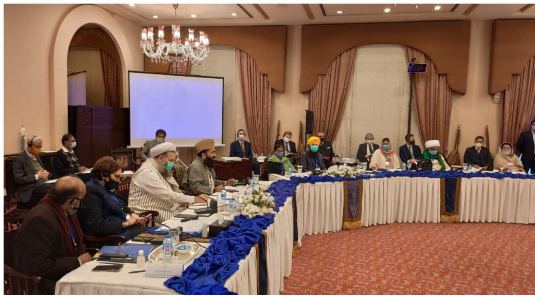
irrespective of religion, creed, colour, and race. The participants vowed to ensure that the message of inclusion and inter- and intra-faith harmony will be spread and amplified from the pulpits, places of worship of all religions and the platforms of other fora. The closing session took place in presence of the Ambassadors and diplomats of Belgium, Can-

Religious leaders from all Islamic Sects and religious minorities in Pakistan, faith-based organizations, civil society organizations, human rights and legal professionals as well as academics participated in the roundtable. The discussion aimed to seek common ground between participants in order to promote religious harmony and tolerance. Following the one-day discussion, participants committed to continue working together. They vowed to work for all constitutional rights to be extended to all citizens of Pakistan