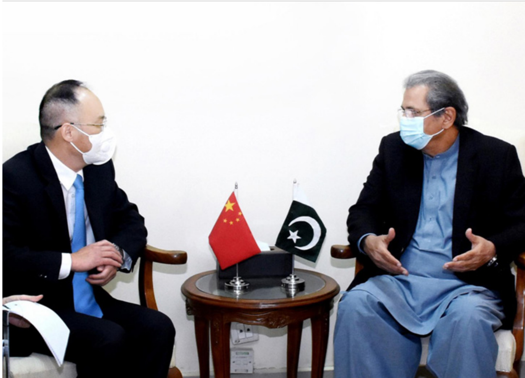
ISLAMABAD: China's newly appointed ambassador to Pakistan, Nong Rong calls on federal minister for education, professional training, national heritage and culture, Shafqat Mehmood.

In accordance with Article 2.22 of the ICC Code of Conduct for Players and Player Support Personnel, which relates to minimum over-rate offences, players are fined 20 per cent of their match fees for every over their side fails to bowl in the allotted time. Captain, Virat Kohli pleaded guilty to the offence and accepted the proposed sanction, so there was no need for a formal hearing. — APP