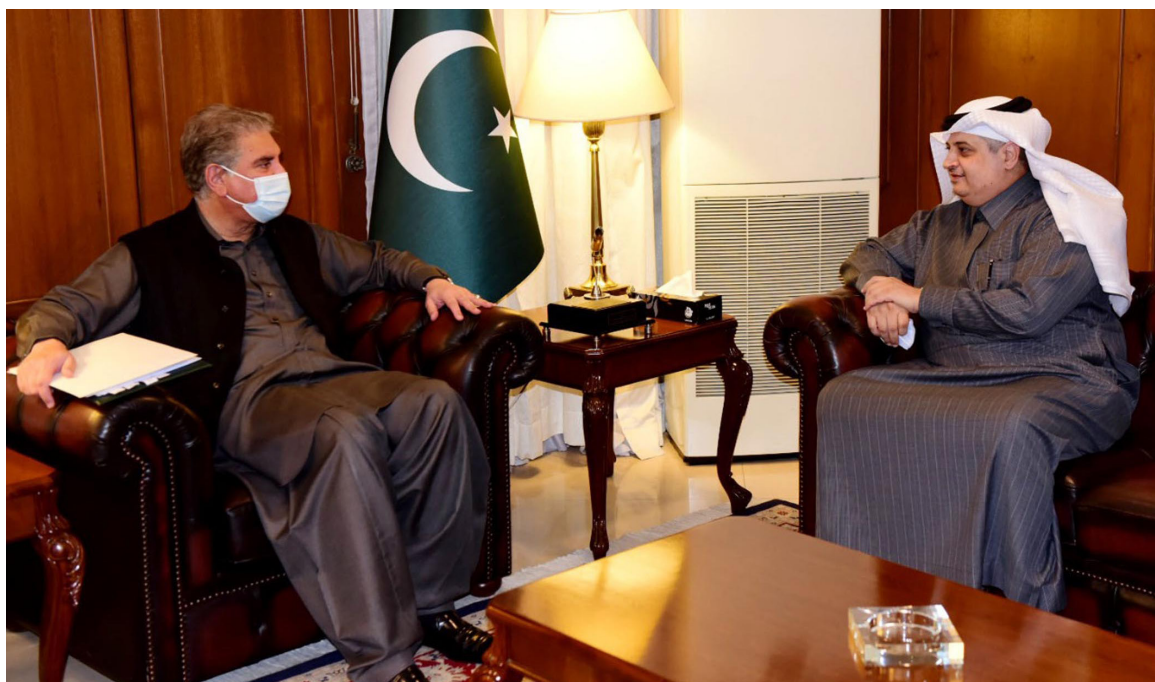
ISLAMABAD: Ambassador of Saudi Arabia Nawaf Saeed Al Malkiy called on Foreign Minister Shah Mahmood Qureshi. DNA