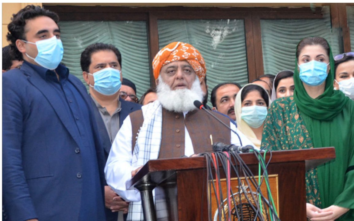
ISLAMABAD: Maulana Fazlur Rehman holding a press conference along with Bilawal Bhutto Zardari and Maryam Nawaz.

proval from Pakistan's aviation division as it is already allowed to operate flights from London. The aviation division has given approval for the flights from Manchester and a notification in this regard would be issued by the air transport department of the Civil Aviation Authority (CAA) today. It is pertinent to mention here that a cargo plane of British airline Virgin Atlantic has landed in Lahore, carrying staff and equipment ahead of beginning direct flights to Pakistan from December 13.