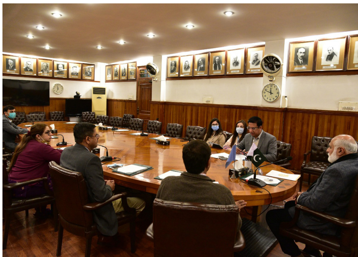
LAHORE: Delegation of CGSS meeting with Vice Chancellor of Punjab University.

breakthrough before Britain leaves the EU single market. "A good deal is still there to be done," Johnson told the UK parliament before setting off for Brussels, while insisting Britain would "prosper mightily" with or without agreement. Talks are blocked over the issue of fair competition, with Britain refusing to accept a mechanism that would allow the EU to respond swiftly if UK and EU business rules diverge over time and put European firms at a disadvantage. "Our friends in the EU are currently insisting that if they pass a new law in the future, with which we in this country do not comply, they want the automatic right... to punish us and to retaliate," Johnson said.