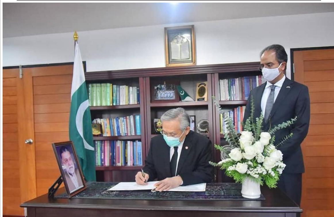
BANGKOK: Don Pramudwinai, deputy Prime Minister and minister of foreign affairs of Thailand visited the embassy and recorded a condolence message on behalf of the Thai government on the passing away of former Prime Minister of Pakistan Mir Zafarullah Khan Jamali. - DNA

three of which - including Sinopharm - use an inactivated form of the novel coronavirus to boost immunity. This means they only need to be refrigerated and can be easily distributed compared to jabs developed by rivals Pfizer and BioNTech or Moderna, which have reported efficacy of 95 percent and 94 percent respectively but need to be transported at minus 70 to 20 degrees Celsius. - APP