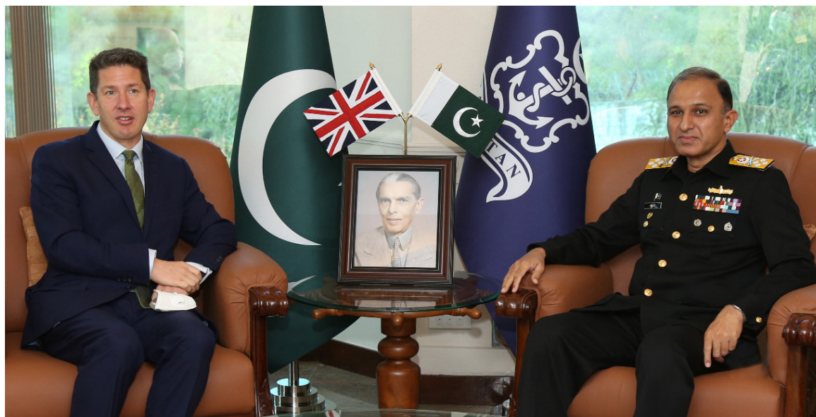
ISLAMABAD: Chief of Naval Staff Admiral Muhammad Amjad Khan Niazi exchanging views with British High Commissioner Dr. Christian Turner, at the Naval Headquarters.

Speakers stress religious harmony, inter-faith dialogue – Page 08