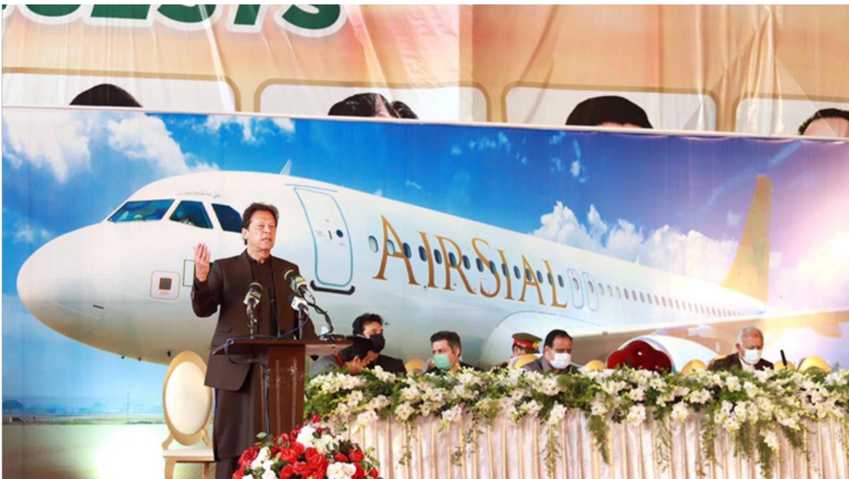
SIALKOT: Prime Minister Imran Khan addressing business community in inauguration ceremony of new private airline.

PESHAWAR: At least ten doctors of Mardan Medical Complex (MMC) have been found infected with coronavirus, the hospital's administration said on Wednesday. It said two lady doctors were also among the doctors tested positive for the virus. The medical tests of the two paramedics were also received as positive; the administration said adding all the positive patients have been asked to quarantine themselves. The ratio of coronavirus infection has reached 4 percent in Mardan district that was 1 percent in September, the administration added.