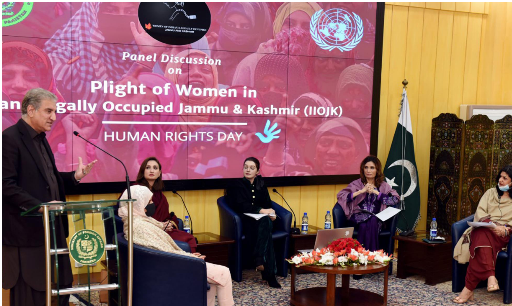
ISLAMABAD: Foreign minister Makhdoom Shah Mahmood Qureshi addressed at the concluding session of a panel discussion on "the plight of the women in IIOJK" at ministry of foreign affairs.

Following Misbah's exit, PCB had also reportedly discarded the National Selection Committee comprising provincial coaches. The board has decided to reinstate the traditional selection committee consisting of a Chief Selector and three members. While the regional coaches won't be officially a part of the new selection panel, they will still be consulted by the selectors.