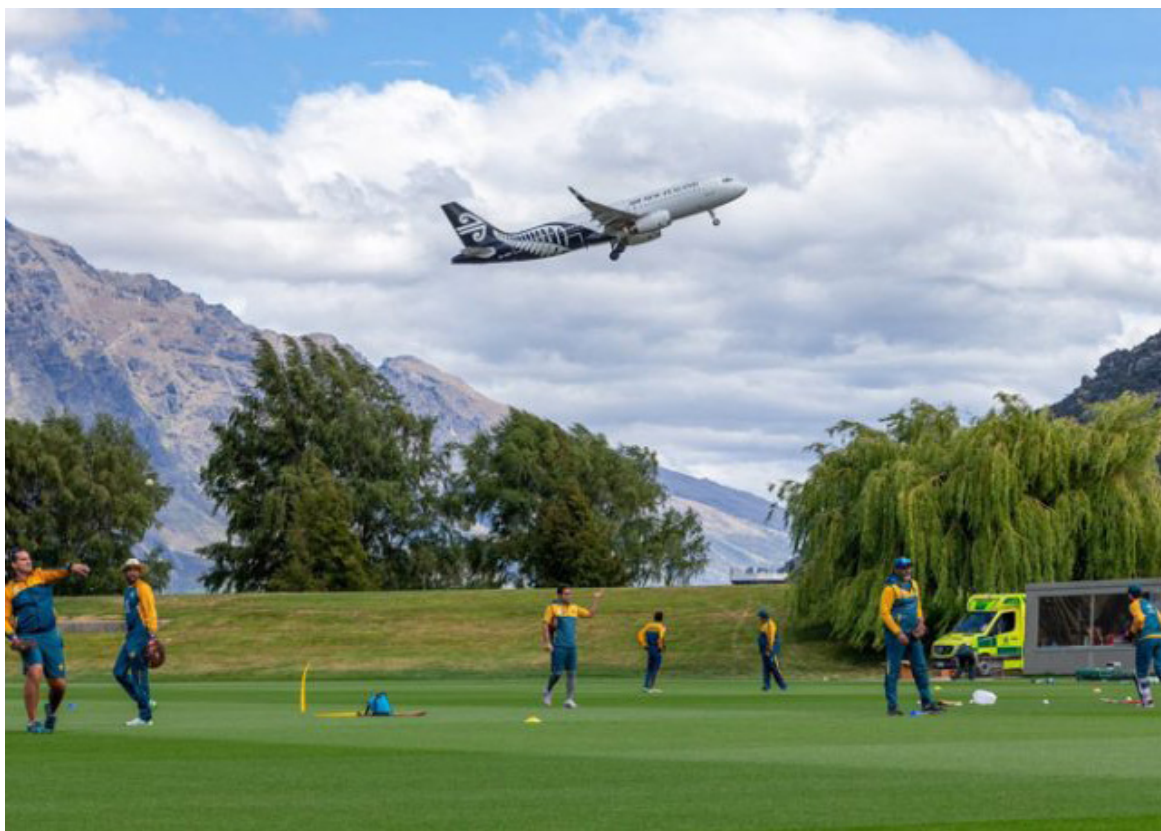
Queenstown: Day 2 of national team, Shaheens training in Queenstown.

SCO, from an early age, shares the principles of mutual support and calls for solidarity. The world is interconnected more than ever and solidarity and co-operation are key to defeating a virus that knows no borders. "Organising such exhibitions, we give children an idea of the cultural diversity across the SCO countries, encourage their interest in art and the right perception of current issues, and strengthen the bridges of friendship, contributing to the continuity of the dialogue of generations, the Secretary-General said. The event included a colourful demonstration of the traditional tea ceremony. After the ceremony, the participants visited other pavilions at the fair and saw more than 100 works by artists from 35 countries. The SCO pavilion at the Shanghai Art Fair 2020 was set up by a partner of the SCO Secretariat for cultural and humanitarian cooperation — the Shanghai Art Fair Company and Yunnan Shanghe Culture and Sport, with support from the People's Government of Shanghai. The Shanghai Art Fair was founded in 1997 by the Shanghai Culture Development Foundation and has been held annually since then. The event has gained status as a famous international art exhibition and is dedicated to compliance with top international standards. — APP