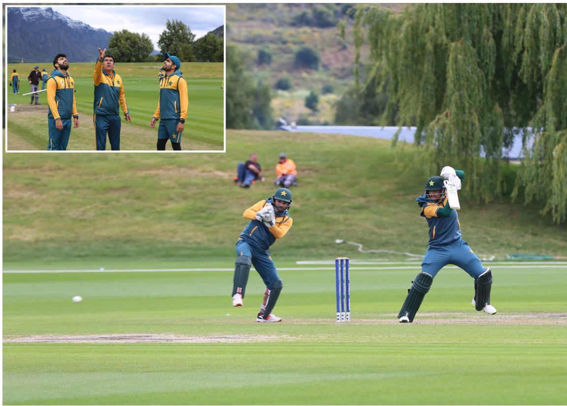
QUEESTWON: Pakistani players in action during 2nd practice match ahead of NZ series.

the second on Jan. 22. Both will be behind closed doors. England will be subject to quarantine in Hambantota on arrival in Sri Lanka. During that period, the players will be able to train for five days from Jan. 5-9 at the Mahinda Rajapaksa International Cricket Stadium. The series was called off in March because of the COVID-19 pandemic with England already in Sri Lanka. As well as Stokes and Archer, Surrey batsman Rory Burns will miss the Sri Lanka tour as his wife is expecting their first child during the second week of January. Ollie Pope, recovering from a shoulder injury sustained in September during the home test series against Pakistan, will join the squad and continue his rehab in readiness for the four-match test series against India starting in February.