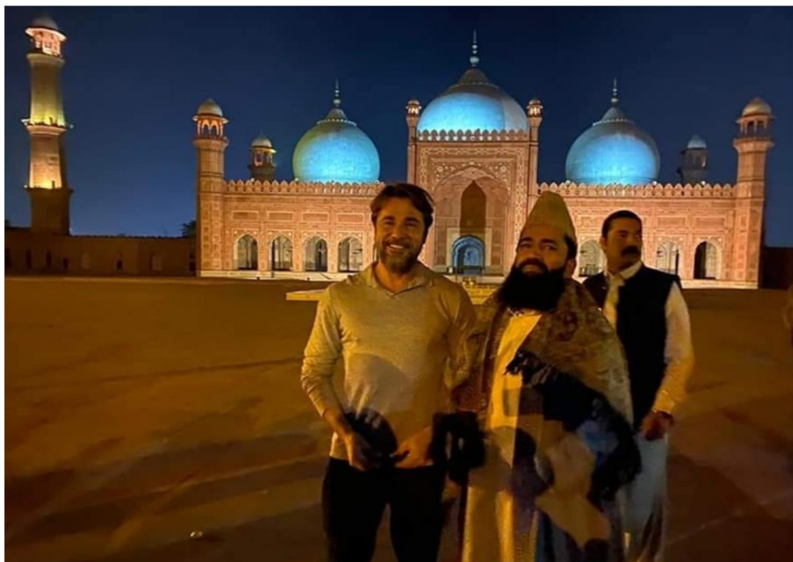
LAHORE: Famous Turkish actor Engin Altan aka Ertugrul Ghazi visited Badshahi mosque Lahore during his two day trip to Pakistan.

he tried his best to do justice to the role of the historical figure. "My peers worked very hard and we can see the fruit of it in all your love." Delivering some good news, he said he was open to working in Pakistan. "Why not?" he exclaimed. "If you have a good story for me, why not." He added that this was his first visit and he couldn't get an opportunity to explore the rest of the country. "But I'm aware how breathtaking the scenery is and InshaAllah whenever opportunity knocks, I would love to visit [again] one day." "I love the Lahori food as well! It's a bit spicy but very tasty," he said, exclaiming "Lahore, Lahore hai!" much to the delight of his fans who chanted the popular slogan back. We're keeping our fingers crossed for a Pakistani production starring Engin Altan.