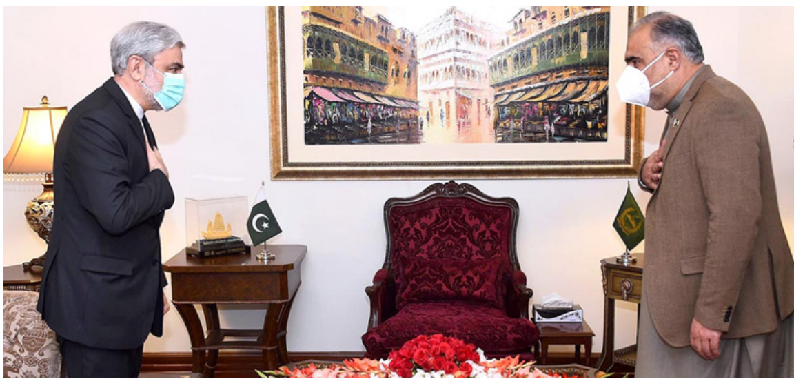
ISLAMABAD: Speaker National Assembly Asad Qaiser receiving Ambassador of Iran Syed Mohammad Ali Hosseini.

in the country and wanted to rest all the responsibility on the government, which we will not allow. "One of the opposition's agenda is to influence the senate election by threatening to resign", she added. She said that the opposition did not care for the lives of people, which was also their responsibility.