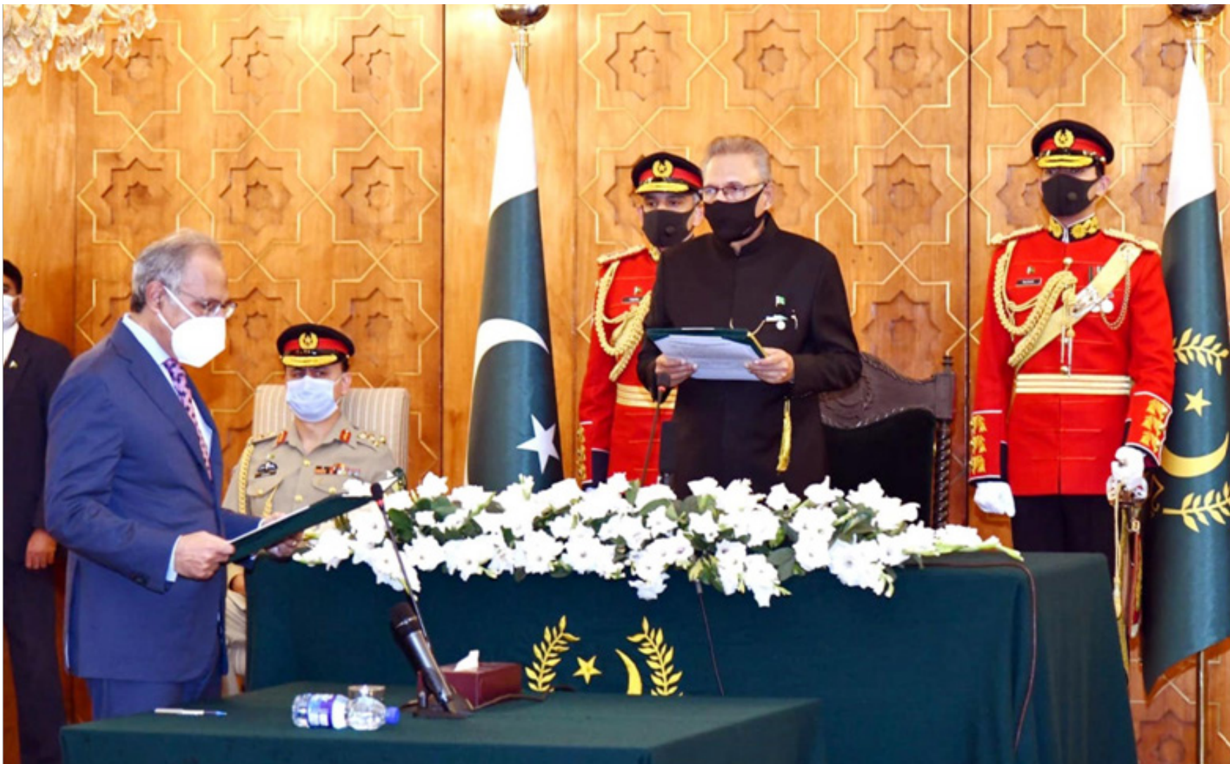
ISLAMABAD: President Dr. Arif Alvi administering oath to Dr. Abdul Hafeez Sheikh as federal minister at aiwan e sadr.