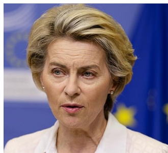
agreement to continue to work on a post-Brexit trade deal or end negoti-

"We will decide on Sunday whether we have the conditions for an agreement or not." Ursula von der Leyen's remarks came ahead of the Sunday deadline, which was agreed Wednesday night in a meeting with British Prime Minister Boris Johnson in Brussels. "One way or the other, in less than three weeks, it will be new beginnings for old friends," von der Leyen added. On Sunday, the UK and EU will decide whether there is