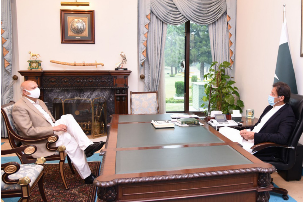
ISLAMABAD: Governer Punjab Chaudhry Sarwar calls on Prime Minister Imran Khan.

DNA ISLAMABAD: The Foreign Office on Friday summoned a senior Indian diplomat to record a strong protest on recent ceasefire violations along the Line of Control (LoC) by Indian forces and stressed compliance of the 2003 ceasefire understanding.