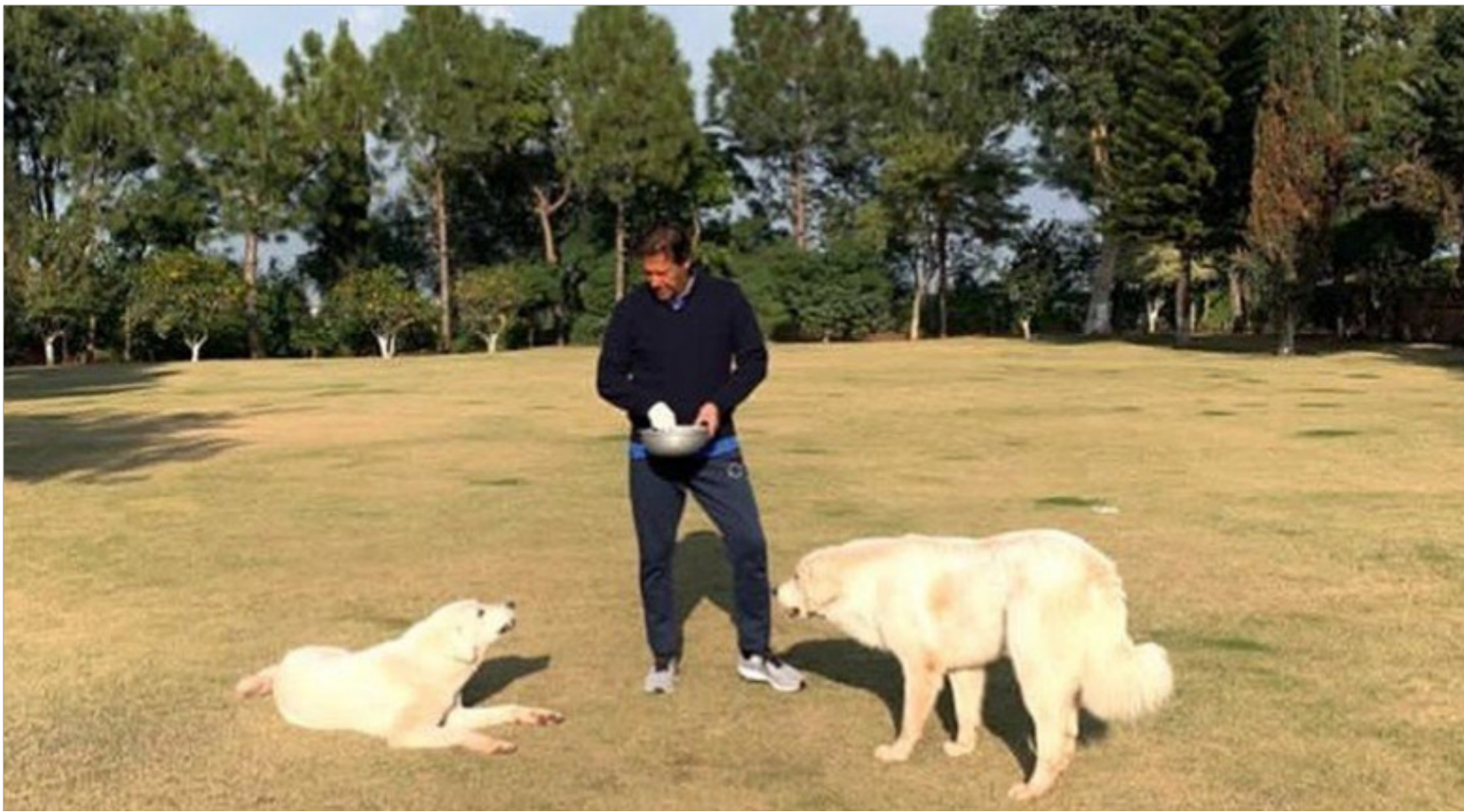
ISLAMABAD: Prime Minister Imran Khan enjoying a sunny day with his pet dogs at his residence.

He maintained that in the past, a large number of people from other cities visit the show but this time due to corona pandemic, only a limited number of gatherings were allowed in the annual chrysanthemum show. He said that anti-corona standard operating procedures (SOPs) were being strictly followed and the PHA was making arrangements to allow only those people in the park who wear face masks, adding that as per instructions of National Command and Operation Centre (NCOC), a group of 300 people was allowed in the park at a time to avoid spread of coronavirus. He said, "We are trying to engage the private sector including colleges, universities, hotels, real estate developers and others in plantation drives." He was of the view that private stakeholders would prove.