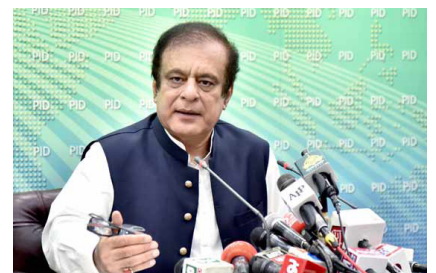
Federal Minister said that the people of Lahore have rejected the opposition. They failed miserably today and will continue to fail.

ISLAMABAD: Federal Minister for Information and Broadcasting Shibli Faraz while criticizing the Pakistan Democratic Movement (PDM) rally said that even 11 parties could not hold rally as big as PTI. In his statement, Shibli Faraz said that we did not disrupt the rally but the opposition leaders were acting irresponsibly during the Coronavirus. Shibli Faraz said that Allah Almighty protect the participants of the rally from Coronavirus. He said that opposition is pushing itself into a dead end. Maryam Nawaz destroyed her father's politics. The