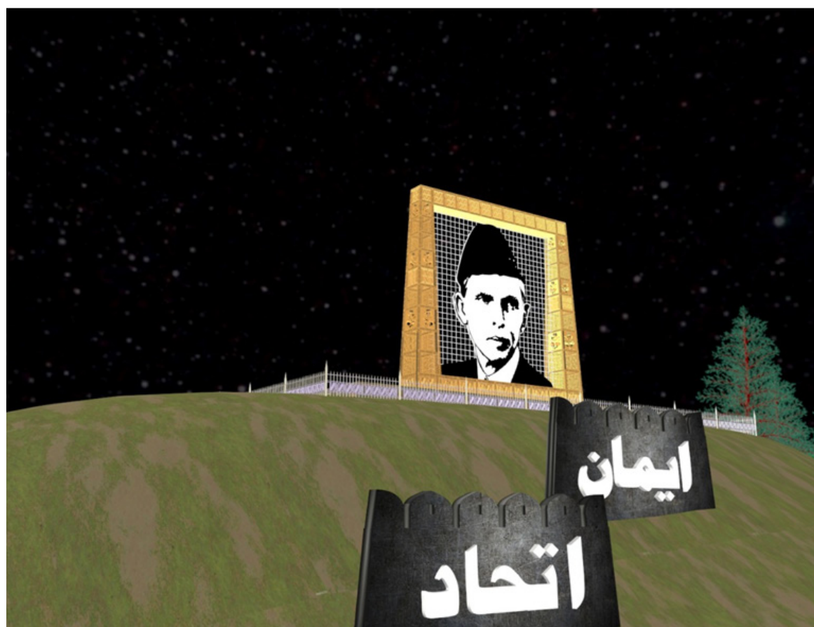
ISLAMABAD: A preview of Quaid e Azam portrait on Islamabad Expressway which will be renovated by CDA. For this purpose, a fund of Rs 50.6 million has been released.