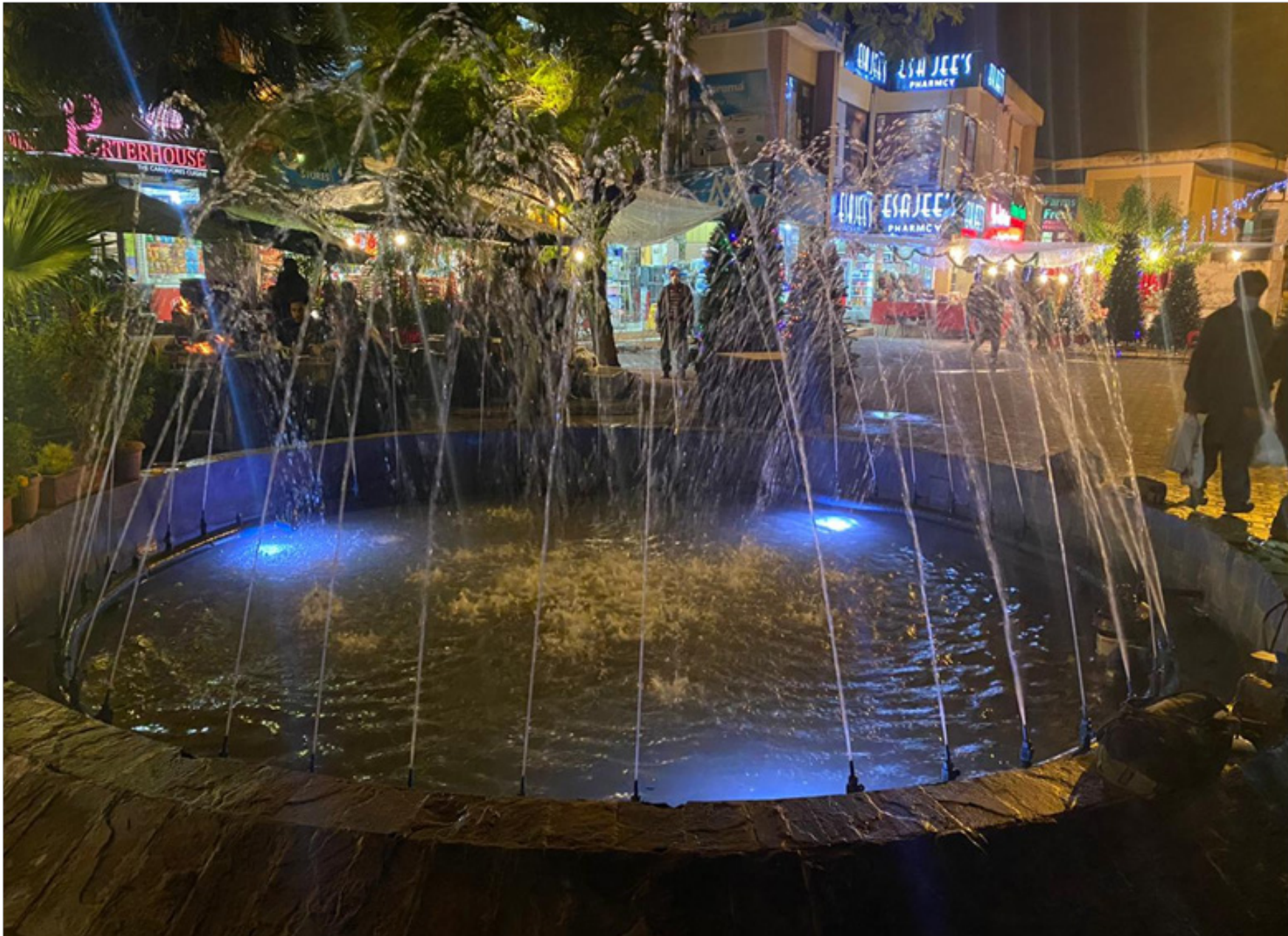
ISLAMABAD: Night visuals after restoration and beautification of fountain completed by CDA staff at Super Market sector F-6. — DNA

ISLAMABAD: Water and Power Development Authority (WAPDA) is currently executing five hydropower projects besides building two mega dams projects Mohmand and Diamer Basha. Sources told that the under construction hydropower projects were included Dasu, Keyal Khwar, Kurram Tangi, Warsak power and Mangla rehabilitation. Similarly, they said currently score of hydropower projects were under operation of WAPDA which were providing thousands megawatt cheap hydel electricity to the national grid. The projects which were currently under operation included Kurram Garhi Hydropower, Chitral Hydropower, Dubar Khwar, Golen Gol, Tarbela, Tarbela 4th Extension, Mangla, Neelum Jhelum, Ghazi Barotha, Jinnah, Rasul, Chashma, Dargai, Khan Khwar, Allai Khwar, Satapara, Renala, Shadiwal, Chichoki hydropower etc. Moreover, future hydropower projects were included Akhori Dam, Basha Hydropower, Chitral Power Enhancement, Hingol dam project, Lower Palas Valley, Lower Spat Gahm Middle Palas Valley hydropower, Murunji dam project, Patan, Tank Zam Project, Shyol dam, Tungas hydropower, Upper Palas Valley Hydropower, Upper Spat Gah Hydropower and Yulbo hydropower project. — APP