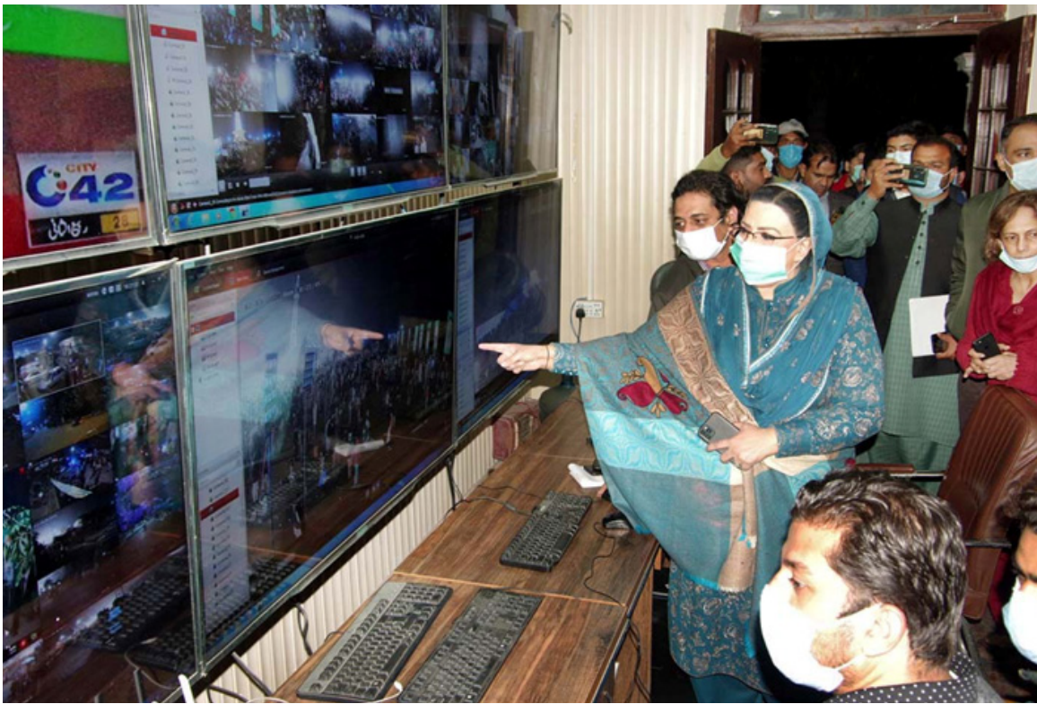
LAHORE: Special Assistant to Chief Minister Punjab Dr. Firdous Ashiq Awan visiting control room at DC Office.

countability and their main leadership is not in the forefront. They are holding public meetings but their own main leaders are not participating in their meetings, he added. To a question, he said that if the sacked employees of the Pakistan Steel Mills are given jobs in the Karachi Port Trust, the KPT would suffer losses because the organizations are destroyed due to political appointments. Syed Ali Haider Zaidi said that we have to make the organizations profitable through the process of restructuring. He told a questioner that around 70 to 75 percent of employees of Karachi Port Trust (KPT) are the holders of the domicile of Karachi, which is, double.