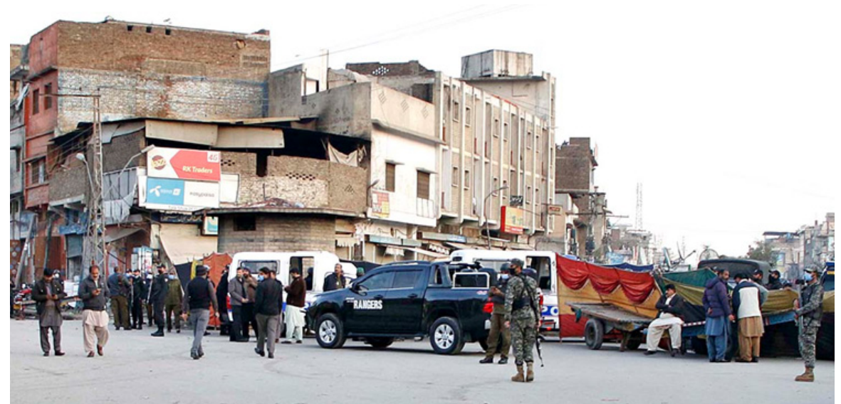
RAWALPINDI: Security officials stand high alert and cordon off area after an explosion resulted in injuring at least 25 people.

he said in a tweet. The minister had held a meeting on Thursday with all the companies working on coal to gas and coal to liquid projects. During the meeting, Asad Umar said induction of this new technology will unlock vast local energy reserves and go a long way in enhancing energy security of Pakistan and for this purpose a policy framework was being developed. The Embassy of China in Pakistan said the Chinese companies were committed to the new phase of CPEC cooperation under guidance of two governments. In a message on its official twitter account, the embassy appreciated Asad Umar and Chairman CPEC Authority Asim Saleem Bajwa for meeting with