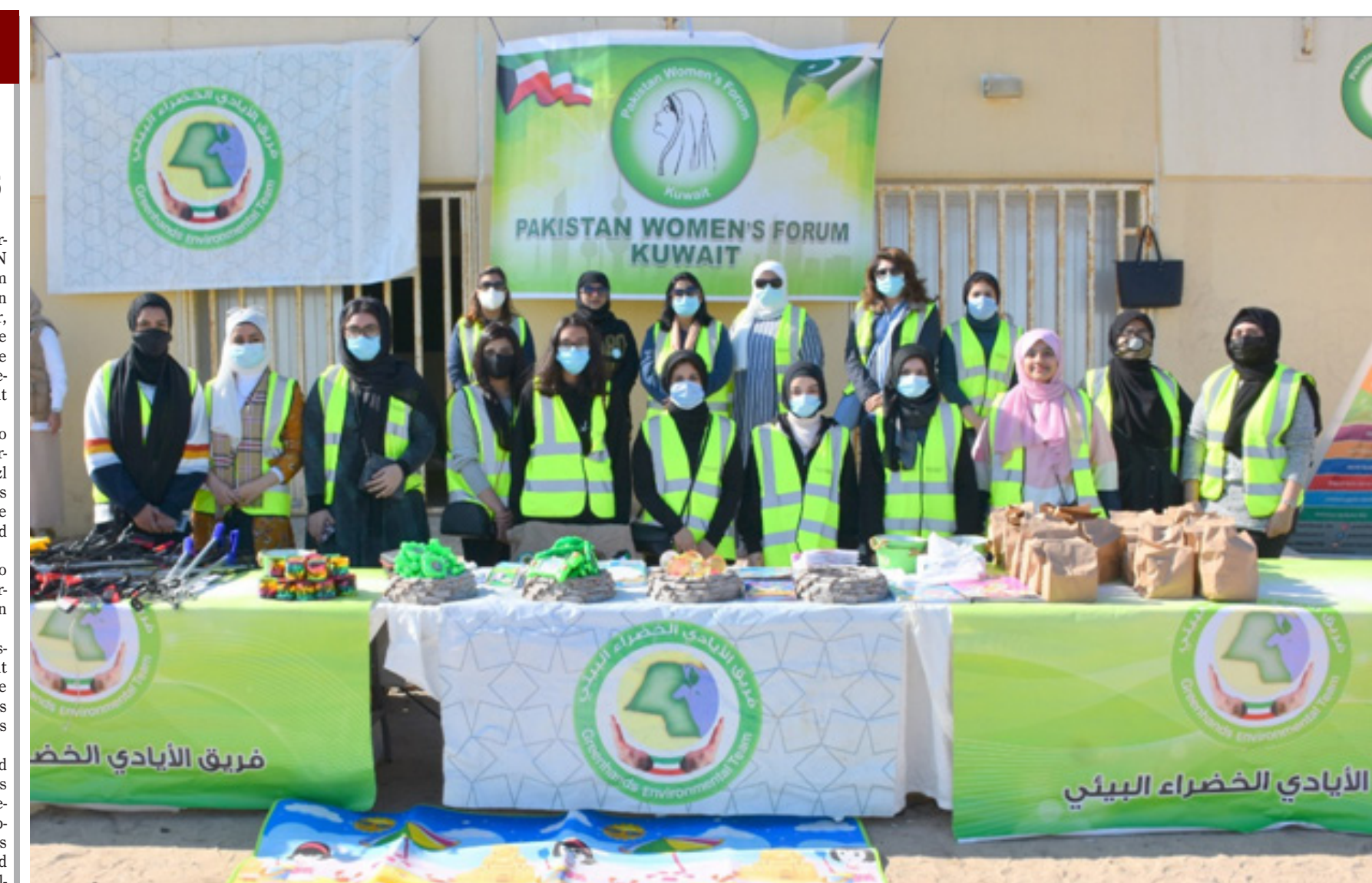
KUWAIT CITY: Clean beach save environment campaign organized by Pakistan women's forum Kuwait & green hands environmental team Kuwait. - DNA

From Page 01 The meeting focused on Pakistani students, tourism