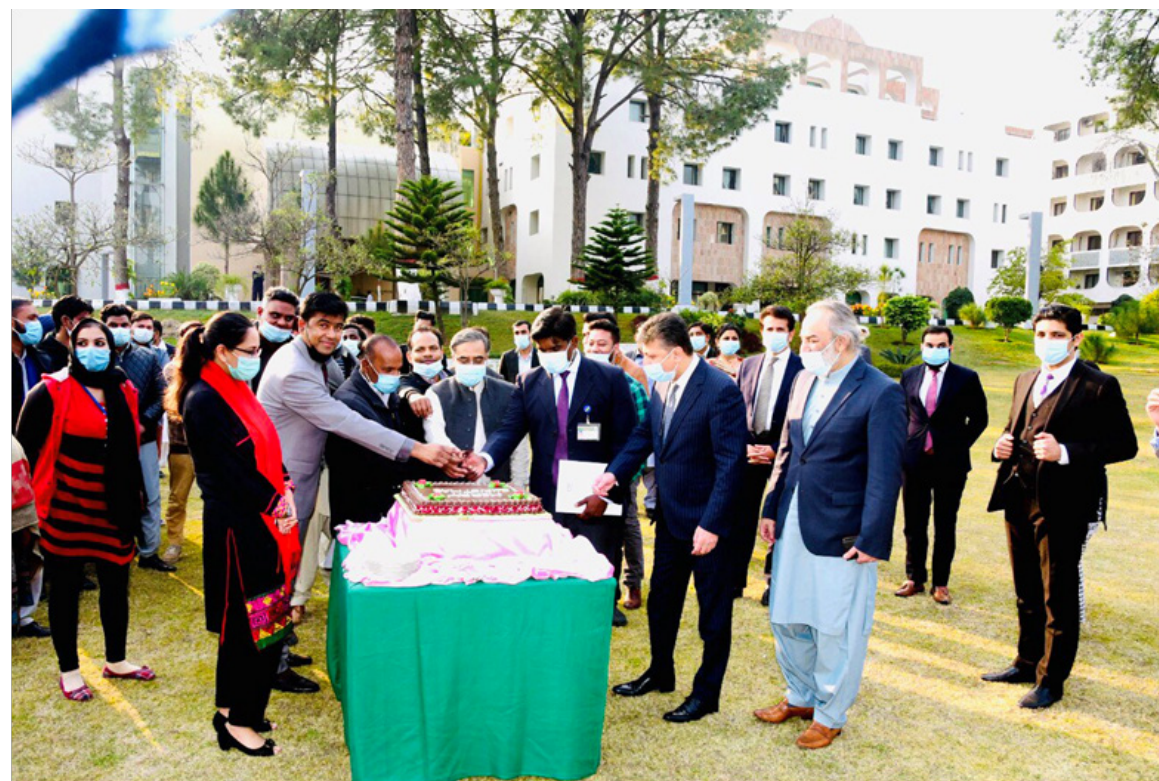
ISLAMABAD: Foreign Secretary, Sohail Mahmood cut the Christmas cake with Christian members of the Foreign office of Pakistan. FS wished Merry Christmas to them and extended best wishes for health, happiness and success in the New Year.

at inter-connection phase, tech trust deficit, finance issues, and inertia at the level of distribution companies (DISCOs) Overall great emphasis was made on the alignment of distributed generation growth in IGCEP, significant stakeholder consultations and support, and consolidated changes for overcoming the identified challenges. They took up the environmental impact assessment of coal power generation in the country that was not easily accessible.