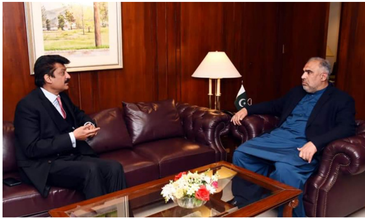
ISLAMABAD: Leader of house in senate Dr Shahzad Waseem meeting with Speaker National Assembly Asad Qaiser. Upcoming Senate elections and other parliamentary Affairs were discussed.

ISLAMABAD: Pakistan's anti-graft watchdog is engaged in human rights violations, Senate Deputy Chairperson Saleem Mandviwalla claimed on Wednesday, criticising the National Accountability Bureau (NAB) for "killing people and dropping off their bodies at hospitals". Mandviwalla said he spoke to civil liberty bodies about the anti-corruption watchdog's alleged malpractices but they feared highlighting that their alleged human rights violations would tarnish Pakistan's image around the world. "NAB accuses everyone of being thieves and robbers", he said, asking: "How dare it level such allegations against people?" "Women call and narrate what the National Accountability Bureau (NAB) has done to them and their families. This institution is killing people and, when they die, it leaves their bodies in the hospital. "NAB is violating human rights. I spoke to human rights organisations about it but they are afraid that talking about it will ruin Pakistan's image. Not a day goes by when I do not receive a call about the NAB's [alleged atrocities] and its actions," he said. The Senate official claimed he had received calls from abroad wherein people told him they left the country due to the anti-graft body's harassment. "We have made the NAB into a monster," he added, challenging the watchdog's representatives to appear in front of a committee if they had done nothing wrong.