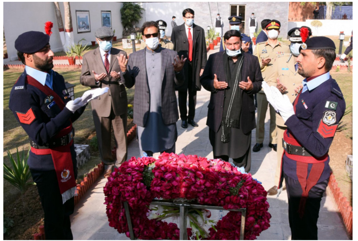
ISLAMABAD: Prime Minister Imran Khan lays floral wreath at the Shuhada Monument at Police Line Headquarters.