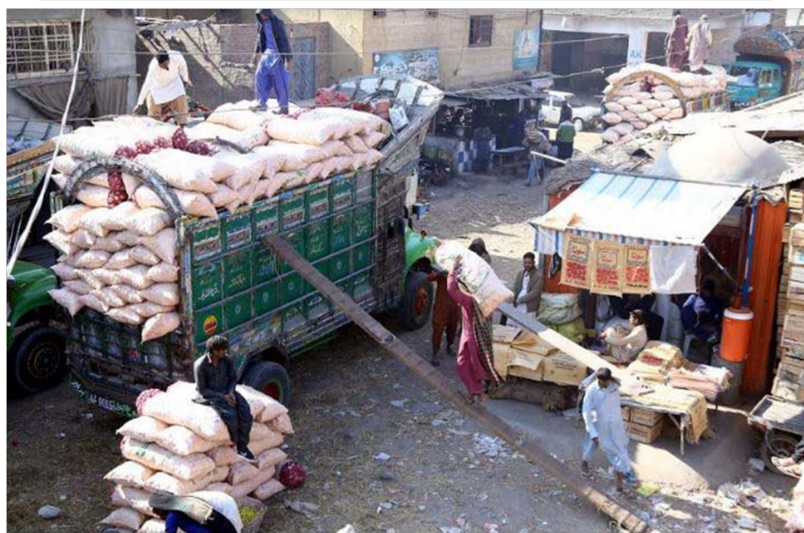
HYDERABAD: Labors busy in loading vegetables into delivery truck.

to two-way trade. "Setting up the proposed common economic zone will prove to be the first step in the documentation of the economy", he added. He said, "It is high time that Pakistan and Iranian governments, besides looking into the possibility of implementing a paper visa regime, must also agree upon giving duty free access to numerous products and we can start from any 5 to 10 items having immense trade potential in the beginning and after seeing the impact, this list can be enhanced further by adding more items being traded between the two brotherly countries."