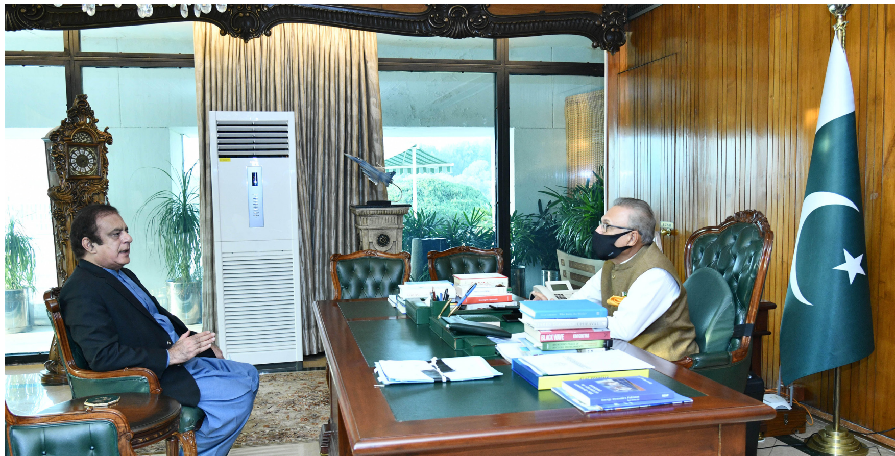
ISLAMABAD: Federal minister for information and broadcasting Senator Shibli Faraz calls on President Arif Alvi.

ISLAMABAD: PPP senior leader Qamar Zaman Kaira has said the party is not in favour of boycotting the elections and will contest the by-polls with full force. Appearing on a private channel, the PPP stalwart said the government would get a walk-over if the field was open for the Pakistan Tehreek-e-Insaf government. If the PPP is to go for the Senate elections, it would have to maintain its majority in the Sindh Assembly, he said. PML-N leader Ahsan Iqbal said his party had held discussions about taking part in the by-polls and Senate elections. The party, he said, will issue a policy statement after consultation with the Pakistan Democratic Movement (PDM) leadership. PML-N had not asked the party senators to submit their resignations yet, he said, adding that discussions were also underway with the PDM leaders about taking part in the by-elections. He said a consensus statement will be issued in a day or two. — APP