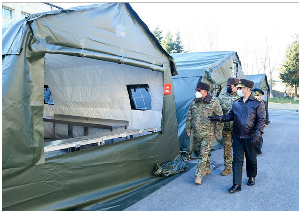
BAKU: Provision of Azerbaijan Army units in liberated land of Karabakh are being improved. – DNA

when the Armenian military occupied Nagorno-Karabakh, recognized as an Azerbaijani territory, and seven adjacent regions. When new clashes erupted on Sept. 27, the Armenian army launched attacks on civilians and Azerbaijani forces and violated several humanitarian cease-fire agreements.