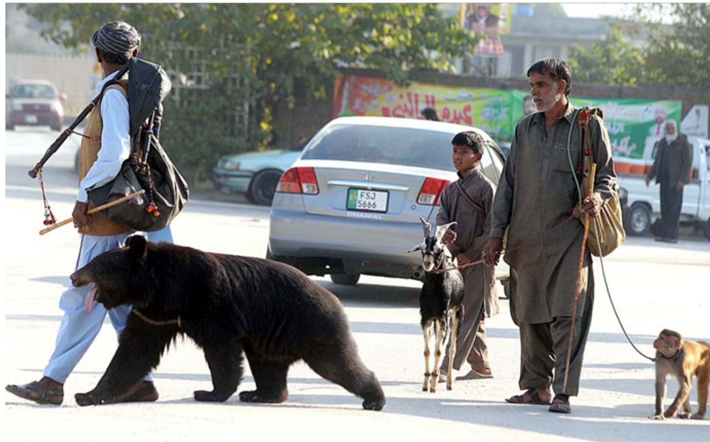
RAWALPINDI: Jugglers along with their pets on the way to show tricks to earn livelihood.

ISLAMABAD: PNCA will launch a mega musical series titled "Seen Studio" to remix old songs by emerging singers on January 1st. The series named "Sur Sargam Sangeet" aimed to medley old song into modern tunes like all kinds of musical genres like pop, classical, folk and fusion. This opportunity would provide a platform to new singers to show and discover their hidden talent in appropriate way. Different recording sessions would be held with limited audience, an official said on Monday. He said that the trend of remixing old classics is a way of keeping the songs relevant and remixing them to make them popular among the youth who have not heard them before. He said that musical sequel was meant to provide a recreational platform to audience trapped by the 2nd wave of pandemic which restricted the music lover's mobility.