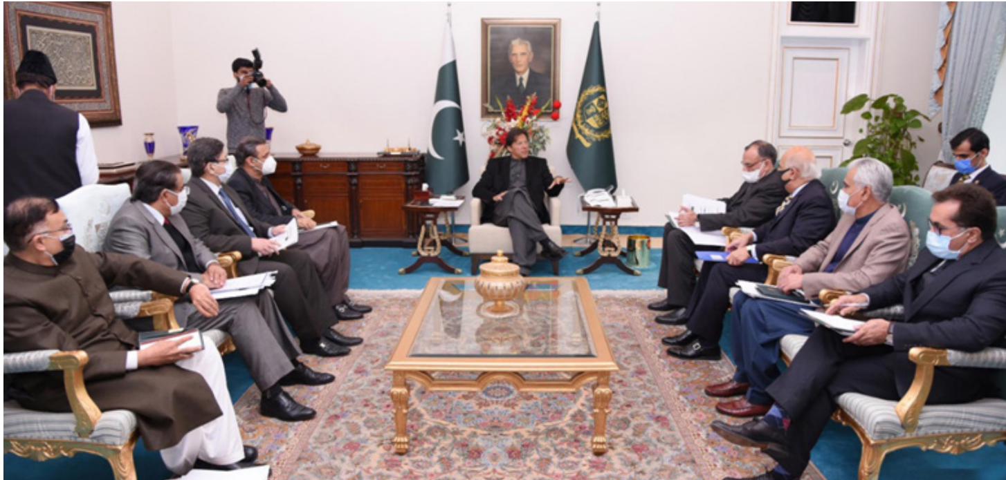
ISLAMABAD: Prime Minister Imran Khan chairing a meeting on ML-1 project.

ISLAMABAD: The national tally of total active COVID-19 cases in Pakistan on Monday reached 39,488 with 1,974 more people tested positive for the deadly virus and 1,760 people recovered from the Coronavirus during the last 24 hours. Fifty Five corona patients, 50 of whom were under treatment in hospital and Five in their respective homes or quarantines died on Saturday, according to the latest update issued by the National command and Operation Centre (NOC). During the last 24 hours most of the deaths had occurred in Sindh followed by the Punjab. It added that out of the total 55 deaths during last 24 hours 35 patients died on ventilators. No COVID affected person was on ventilator in Azad Jammu and Kashmir (AJK), Balochistan and Gilgit Baltistan (GB) while 321 ventilators were occupied elsewhere in Pakistan. The maximum ventilators were occupied in four major areas including Multan 45 percent, ICT 45 percent, Peshawar 36 percent and Lahore 34 percent. The Oxygen beds (oxygen providing facility other than ventilator as per patient's medical requirement) were also occupied in four major areas as in ICT 31 percent, Rawalpindi 32 percent, Peshawar 62 percent and Multan 38 percent. - APP