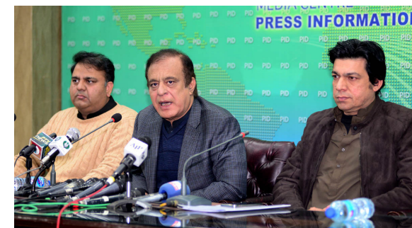
can never be in favour of democracy. Senator Shibli Faraz has said that the government was ready for dialogue with serious minded leadership of the Opposition and the forum would be the Parliament as it represented the people's will. The Information Minister said that

ISLAMABAD: Information Minister Shibli Faraz has said opposition's campaign is aimed at creating chaos in the country to protect their looted money. Addressing a news conference along with Minister for Science and Technology Chaudhry Fawad Hussain and Minister for Water Resources Faisal Vawda in Islamabad Monday, he said those who desire to topple an elected government