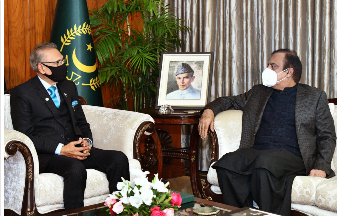
ISLAMABAD: Federal Minister for Information and Broadcasting, Senator Shibli Faraz called on President Dr. Arif Alvi at Aiwan-e-Sadr.