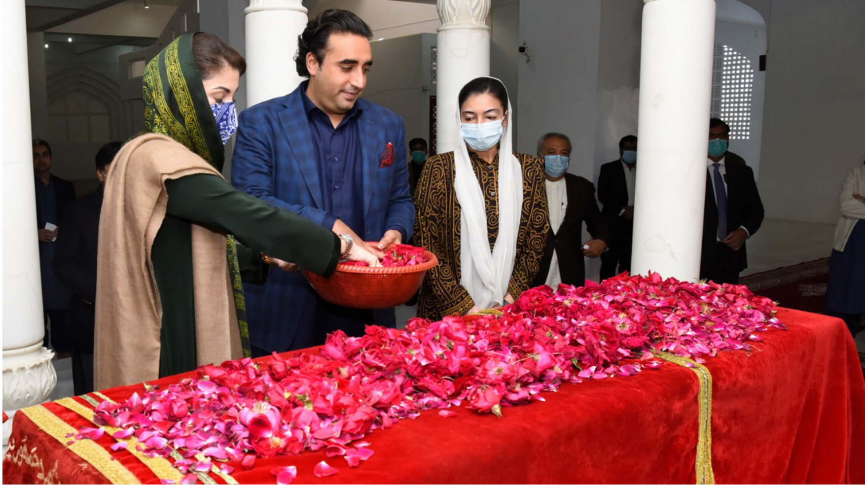
LARKANA: PML-N leader Maryam Nawaz along with PPP Chairman Bilawal Bhutto Zardari and Asefa Bhutto Zardari laying petals on the grave of Shaheed Benazir Bhutto.