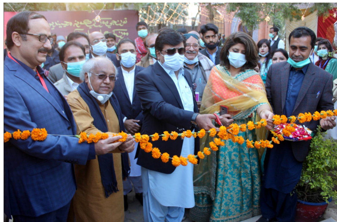
HYDERABAD: Minister for Culture and Tourism Syed Sardar Shah and others are inaugurating the 6th Ayaz Mela at Khanabadosh.

arranging the briefing on WAPDA projects in GB, the Chief Minister said that the region possesses enormous water and hydropower potential. He said that construction of projects including Diamer Basha Dam would go a long way in transforming the socio-economic landscape of the country, Gilgit-Baltistan in particular. He appreciated WAPDA for implementing resettlement and social action plans for Diamer Basha Dam Project in accordance with the international safeguards.