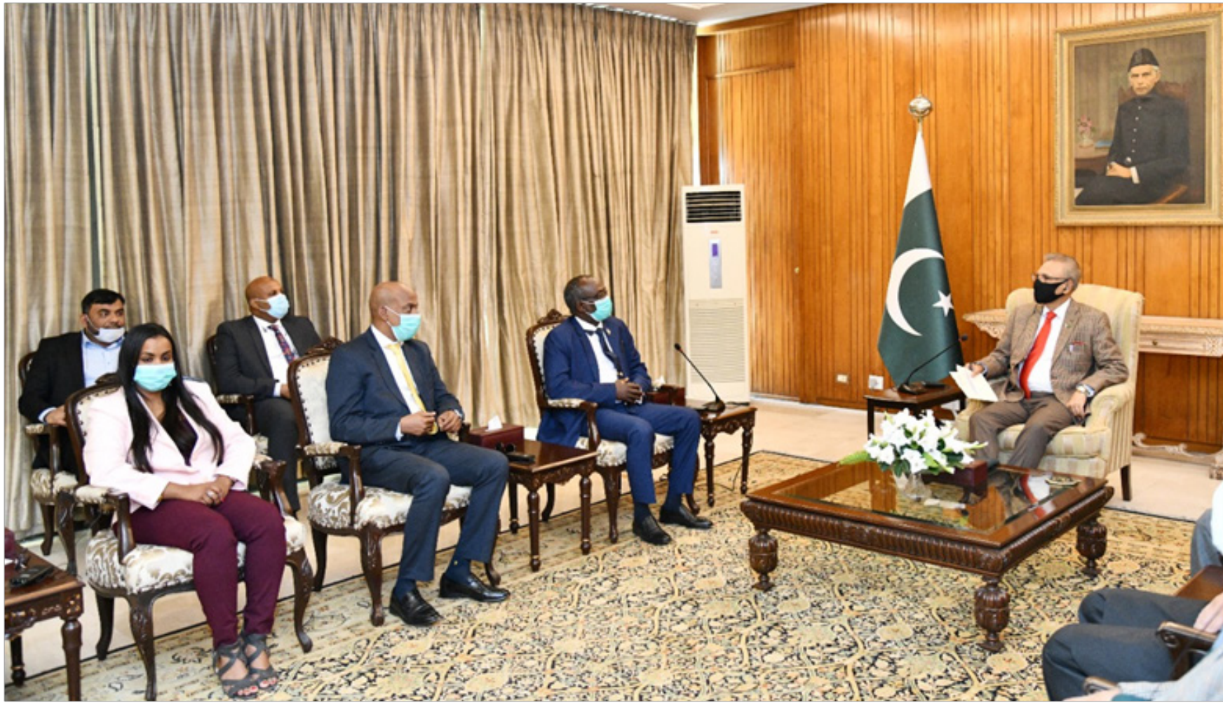
ISLAMABAD: A Parliamentary delegation of Djibouti, led by the President of Djibouti National Parliament, Mohamed Ali Houmed, meeting President Dr Arif Alvi, at Aiwan-e-Sadr. (Detailed news on page 2)

MOSCOW: The Russian Investigation Committee on Wednesday opened a criminal case against Russian opposition politician Alexey Navalny over alleged embezzlement of donations. In a statement, the committee said investigators have collected enough evidence to initiate an investigation on large-scale fraud. The committee said Navalny and his supporters gathered more than 588 million rubles (about $8 million) for non-profit organizations and then allegedly stole 356 million rubles ($4.8 million) of the amount and spent it for personal purposes. "He [Navalny] acquired property, material values, and paid for his vacation abroad [with this money], among other things. The funds collected from citizens for the needs of the non-profit organizations were stolen," it said. Navalny has been at odds with the country's authorities for many years. He accuses Russian officials of taking advantage of their position, using undue influence, and spending budget money for their own needs. He also claims the Russian Federal Security Service was behind his alleged poisoning this year.