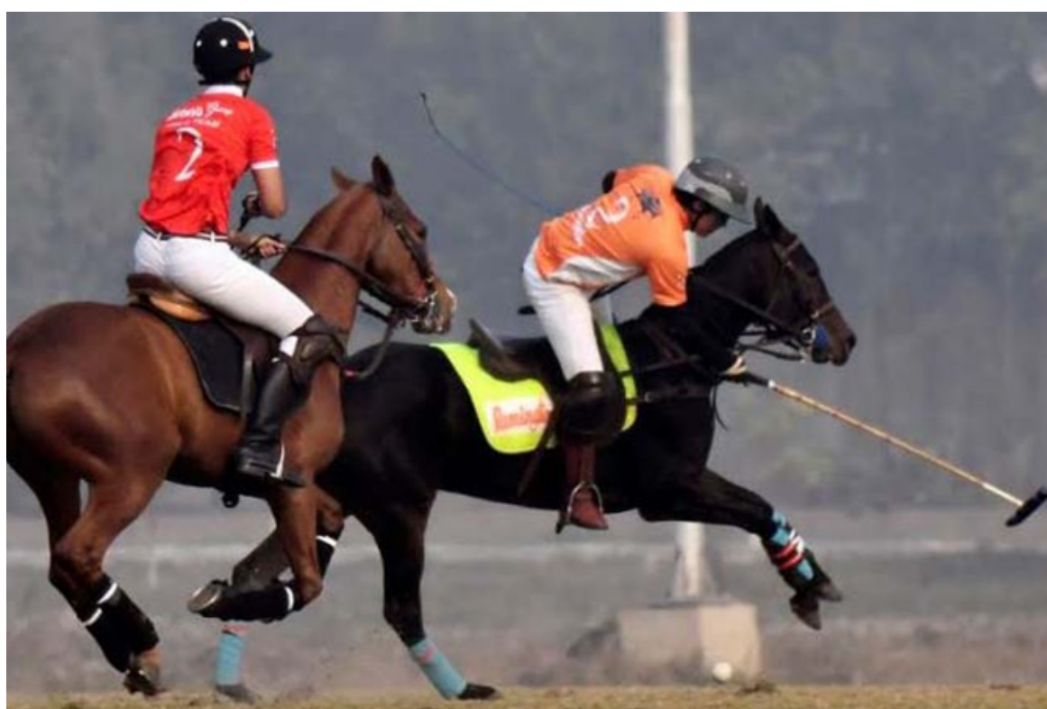
LAHORE: Players in action during a polo match on Wednesday. — DNA/ Photo by Shahbaz Sindhu

ANKARA: The Karabakh issue became a historical one, and Azerbaijan restored justice, Turkish Foreign Minister Mevlut Cavusoglu said on Dec.30. "We supported Azerbaijan not only because we are friendly countries, but also because Azerbaijan is a fair side. Turkey will continue to support Azerbaijan," Cavusoglu noted. "Yesterday we also discussed the issue with Russian Foreign Minister Sergey Lavrov. — DNA