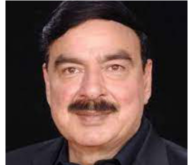
Assistant to PM Imran Khan on Accountability Shahzad Akbar had said that it is up to the British gov-

DNA ISLAMABAD: In a significant development, the federal government has decided to cancel former premier Nawaz Sharif's passport in a month-and-a-half. This was announced by Interior Minister Sheikh Rasheed Ahmed on Wednesday while talking to reporters in Islamabad. "We have decided to cancel Nawaz Sharif's passport on February 16." The government has already approached UK authorities to extradite Nawaz Sharif. Special