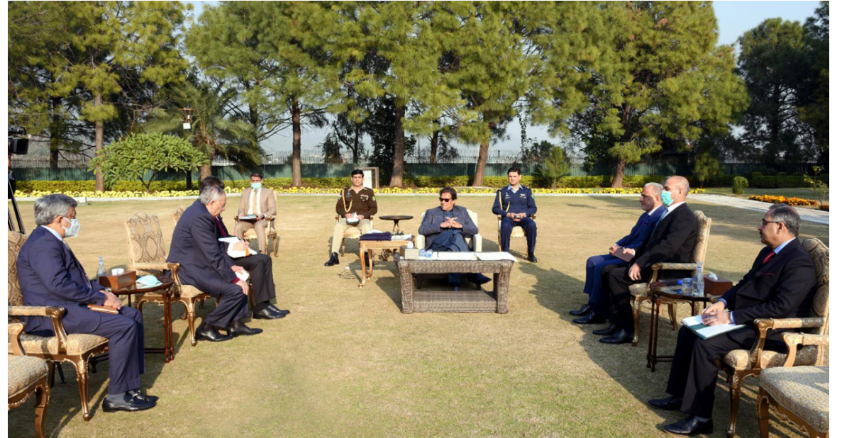
ISLAMABAD: Nisar Ahmed Faizi Ghoryani Minister for Industry and Commerce of Afghanistan in a meeting with Prime Minister Imran Khan.