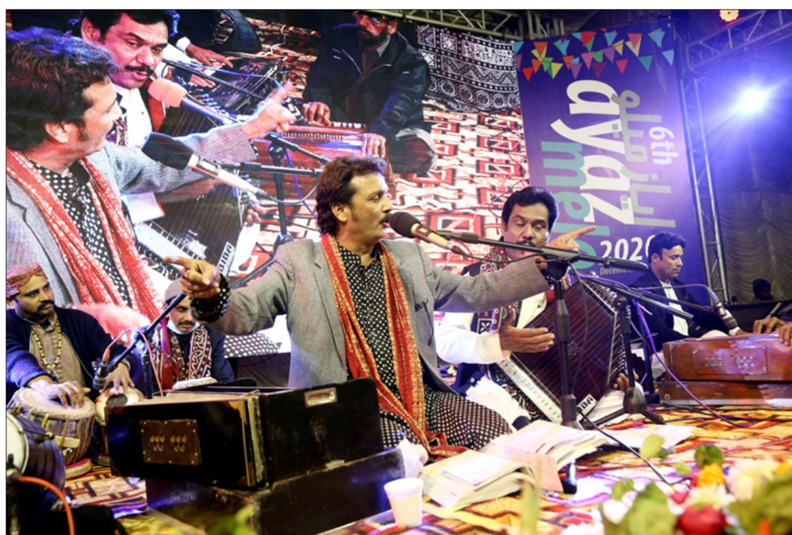
HYDERABAD: Folk artist performing on the stage on the last day of 6th Ayaz Mela at Khanabadosh Sindh Museum.