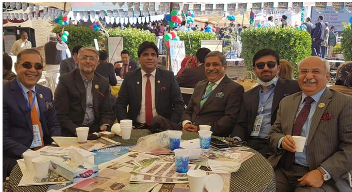
KARACHI: Member of Pakistani business community on the occasion of FPCCI elections.

near Maasheq palace, where the cabinet was taken after the airport attack. Heavy gunfire from armoured vehicles followed, with plumes of white and black smoke rising from the scene. Other video showed damage to the terminal's concrete walls and smashed glass. A local security source said three mortar shells landed on the airport's hall. Images shared on social media from the scene showed rubble and broken glass strewn about near the airport building and at least two lifeless bodies, one of them charred, lying on the ground. In another image, a man was trying to help another man whose clothes were torn to get up from the ground.