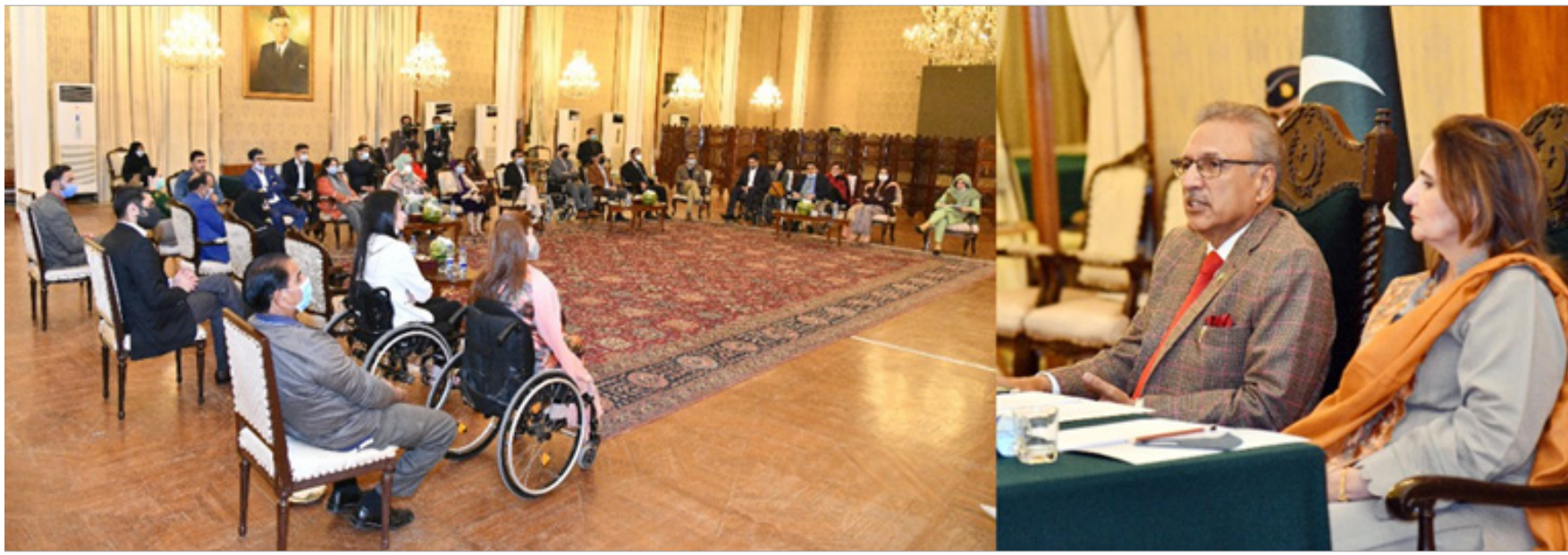
ISLAMABAD: President Dr Arif Alvi speaking to the Persons with Disabilities (PWDs), at Aiwan-e-Sadr.