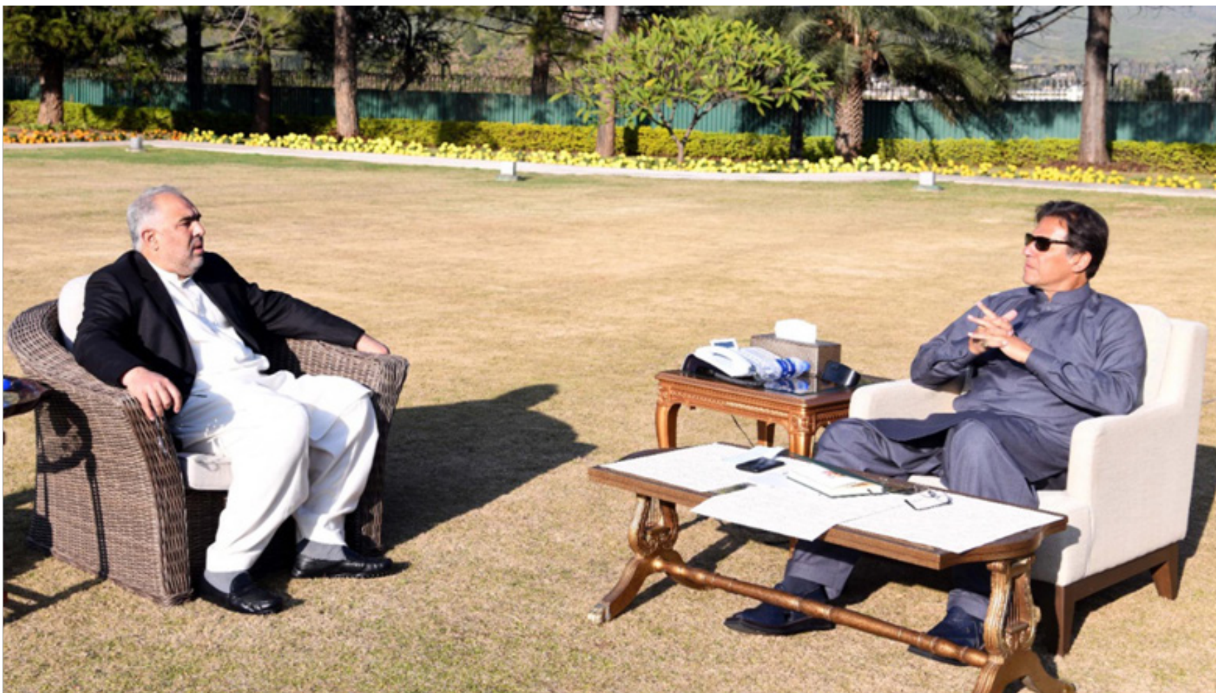
ISLAMABAD: Speaker national assembly, Asad Qaiser calls on Prime Minister Imran Khan in Islamabad.

LAHORE: Governor Punjab Chaudhry Sarwar on Wednesday said that next Chairman Senate will also be from Pakistan Tehreek-e-Insaf (PTI) and opposition is trying to find a safe passage after repeated failures. Governor Punjab, in meetings with party delegations, said that opposition will not resign from assemblies by January 31 and announcement regarding long march will also be delayed. He also said that Prime Minister's politics are of principles and all allies of the government, including PML-Q, stand with PTI. Chaudhry Sarwar, while stressing on unity for tackling issues related to security issues, said that enemies of the country are trying to destabilize Pakistan.