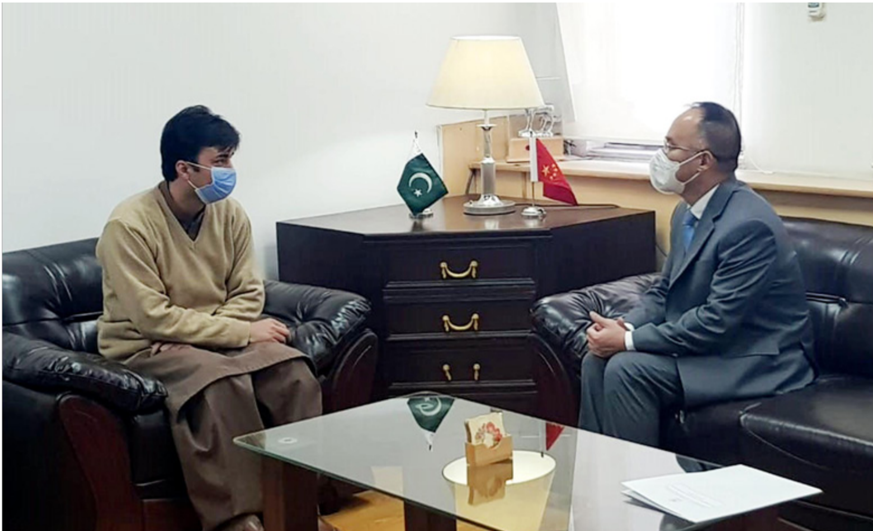
ISLAMABAD: Ambassador of Republic of China to Pakistan, Nong Rong called on federal minister for communications, Murad Saeed in Islamabad.