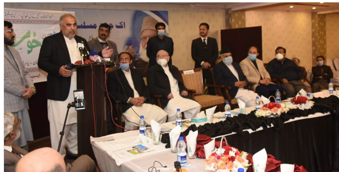
ISLAMABAD: Speaker national assembly, Asad Qaiser addressing the participants of Qazi Hussain Ahmad memorial function on his death anniversary.