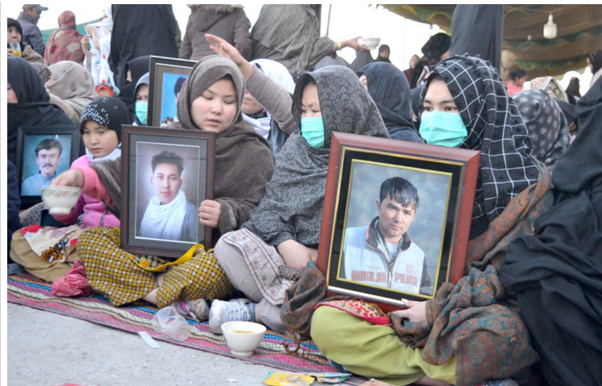
QUETTA: Relatives of the slain colliers holding sit-in along with dead bodies in consecutive four days after dying at Western Bypass.