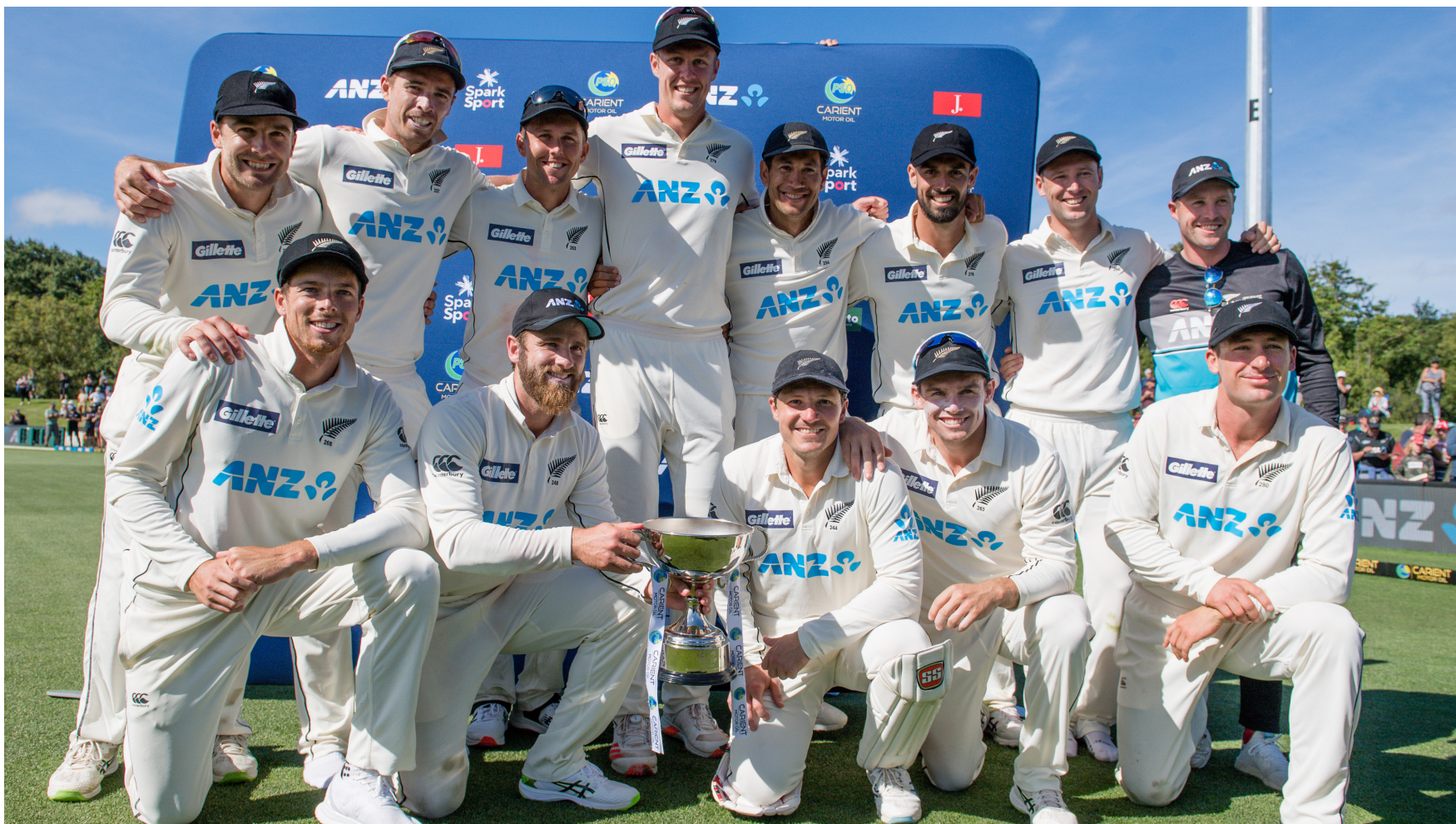
CHRISTCHURCH: Kiwis players posing with trophy after sweeping Test series against Pakistan.