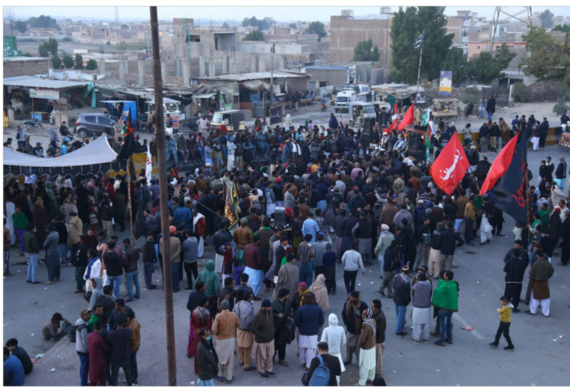
HYDERABAD: A large number of peoples take part in the protest in favor of Mach victims at Hyderabad bypass.