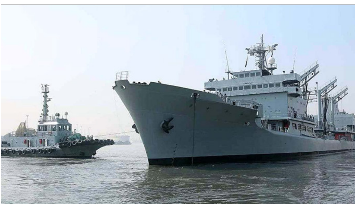
KARACHI: Pakistan Navy Ship NASR sailed from Karachi for overseas deployment to African Counties on Humanitarian Assistance and Disaster Relief (HADR) Mission. (Detail News on Page 8)

not be served by merely issuing statements, but by standing with them, he asserted and maintained that Pakistan Tehreek-e-Insaf (PTI) leadership had stood shoulder to shoulder with people during the past years. He said: "Nefarious designs of the PDM will be foiled again." Buzdar said the negative approach of the opposition parties had further lessened their credibility among the public. He said the opposition had tried to sabotage the national unity for their vested interests. The opposition had compromised on national interests, he added. Practically, the position was making hue and cry and doing nothing for people. People have been fed up with politicians having double standards and involved in negative politics, the CM said. He said the PTI leadership understands difficulties of people. The opposition's cheap politics of creating chaos would not work anymore, he added. Those who made tall claims have been exposed in front of people, he said. The opposition parties exhibited irresponsibility even in critical circumstances, he added. Time has proved that the government under the leadership of Prime Minister Imran Khan took timely decisions regarding COVID-19 pandemic control, he added. – APP