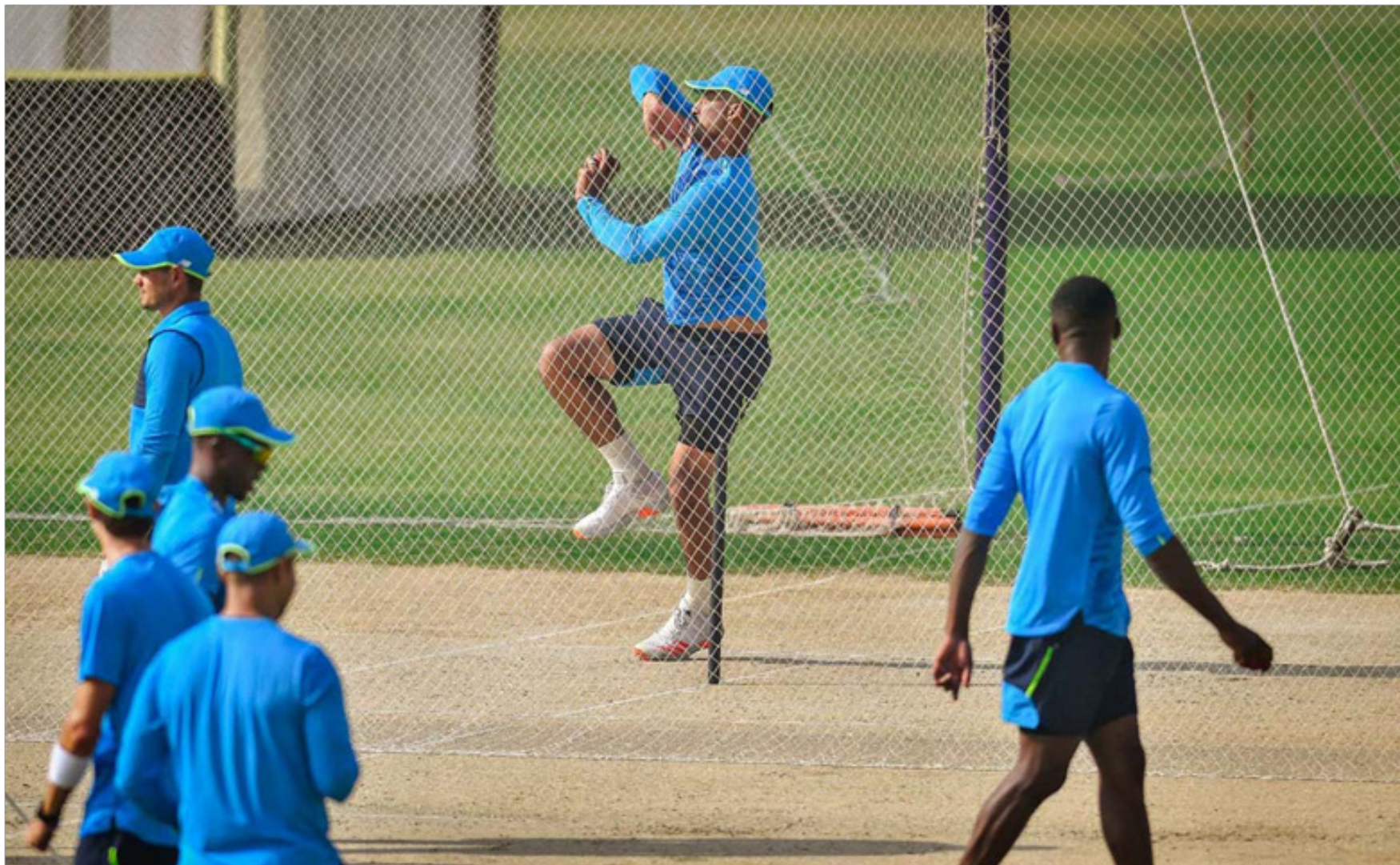
KARACHI: Players of South Africa cricket team busy in training and practice at Karachi Gymkhana.