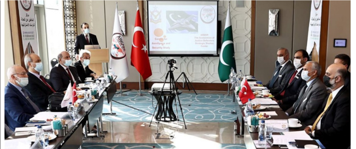
ISTANBUL: Air Chief Marshal Mujahid Anwar Khan, Chief of Air Staff in a briefing session with board of members of Association of Justice Defenders and Strategic Studies Center (ASSAM).

countries, but two hundred years after the invasion of the enemy in 1814, this feat came to President Trump, who provoked his armed supporters to attack the prestige of parliament on the most important and historic day in the American democratic tradition (January 6). It is reverential and germane day when the US Congress ratifies the President-elect by verifying the electoral votes obtained by the newly elected President. Interestingly, politicians in many developing countries, including Pakistan and India, Demonstrations of repression appear in public, but this new tradition has now become an additional chapter in US history, when pro-Trump hocks threatening, blocking and attacking elected members of parliament from the opposition party (democrats) including their own party (Republican) members who are antagonistic about their leader's approach, the actions of trumpians have embarrassed the American people. One of the extrinsic factor of President Trump's fall is that he continued to overlook the Corona virus, which kills 4,000 Americans every day. As a result, the United States has become the number one country to die from Corona. What