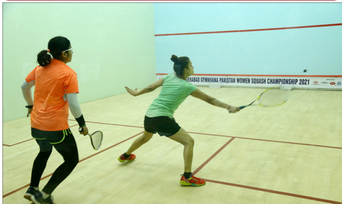
HYDERABAD: Squash Players are playing during the All Pakistan Women Squash Championship 2021 organized by the Hyderabad Gymkhana. 16 players from all over the Pakistan take part in this championship.

urge Iran to halt its activity and return to compliance with its JCPOA commitments without further delay if it is serious about preserving the deal," they said in reference to the formal name of the accord, the Joint Comprehensive Plan of Action. Their statement came after the International Atomic Energy Agency (IAEA) reported Iran had said it is advancing research on uranium metal production with the aim of feeding a research reactor in Tehran.