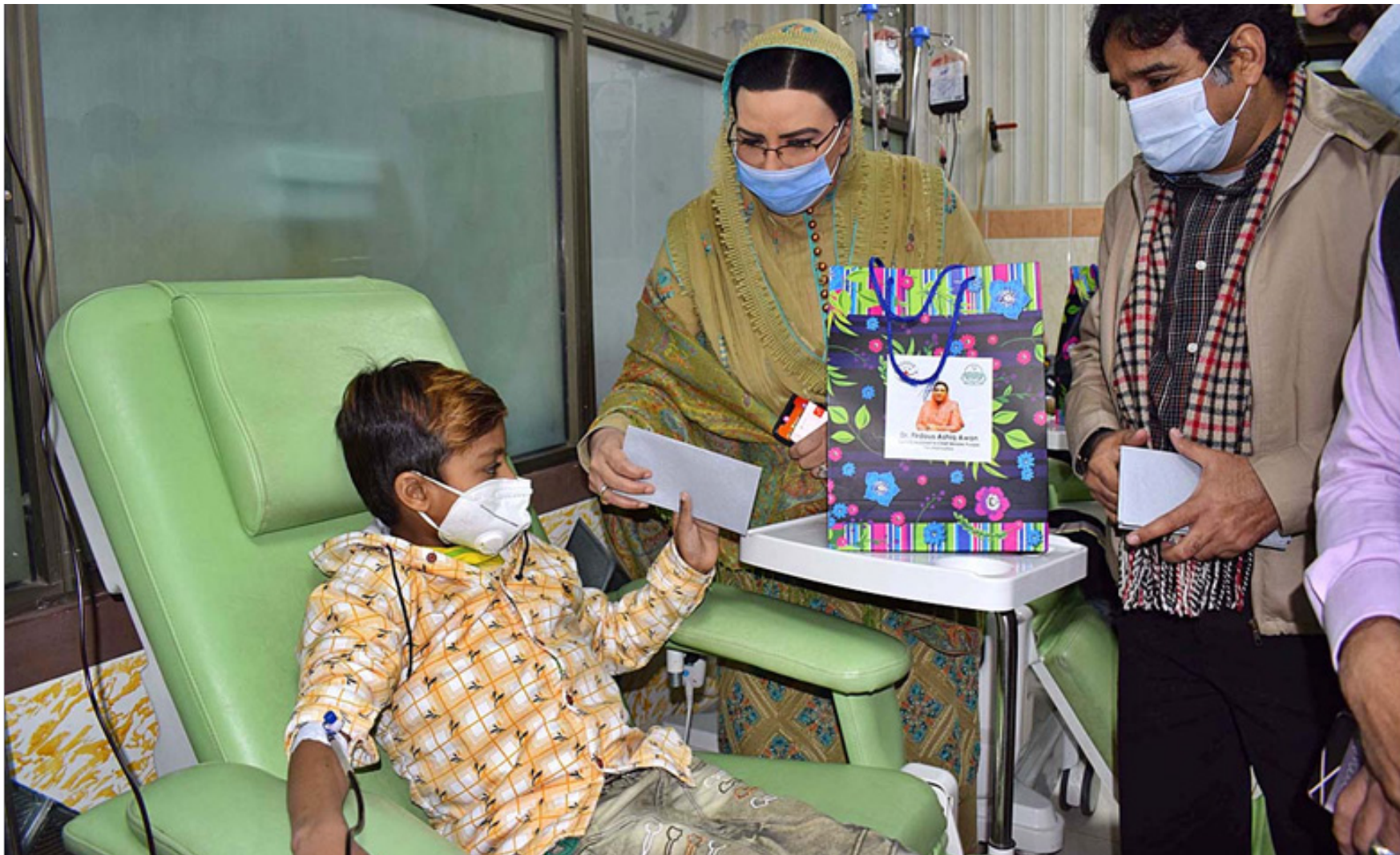
SIALKOT: Special assistant to chief minister Punjab Dr. Firdous Ashiq Awan distributing gifts among the Hemophilia - Thalassemia patients at Sundas Foundation.