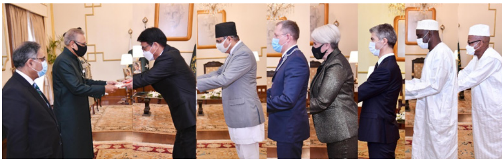
ISLAMABAD: The Residents Ambassadors-designates of Korea, Nepal, Belarus and Non-Residents Ambassadors-designates of Ireland, Kosovo, Mali and Sierra Leone presenting their credentials to President Dr Arif Alvi, at Aiwan-e-Sadr, on 19-01-2021.