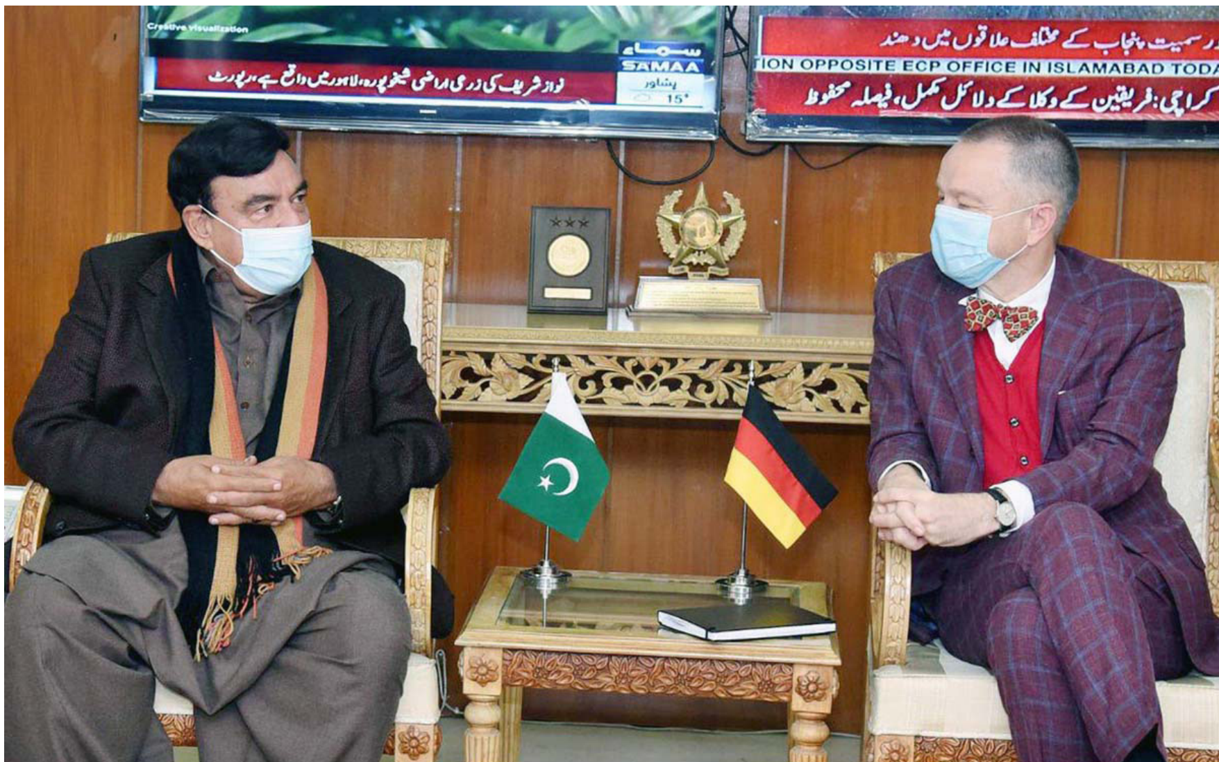
ISLAMABAD: German ambassador to Pakistan Bernhard Schlagheck called on Interior Minister Sheikh Rashid Ahmed. – DNA

JAKARTA: The death toll from a powerful earthquake that struck Indonesia's Sulawesi Island last week rose to 90 as bodies of six more people were found during search and rescue operations, the country's disaster agency said Tuesday. The National Disaster Management Agency reported that 79 people were killed in Mamuju Regency and 11 in Majene Regency. Meanwhile, search and rescue teams recovered 18 more people from the rubble. A magnitude 6.2 earthquake struck six kilometers (3.73 miles) northeast of Majene city on Friday, at a depth of 10 kilometers (6.2 miles). A disaster emergency response status was declared in West Sulawesi province for 14 days from Jan. 15 to 28. Meanwhile, President Joko Widodo visited Mamuju Regency on Tuesday to observe the conditions of evacuees and the evacuation process. He said the government buildings collapsed by the earthquake will be rebuilt so that public services could run back immediately. The government will also provide financial aid for damaged houses, the president stated.