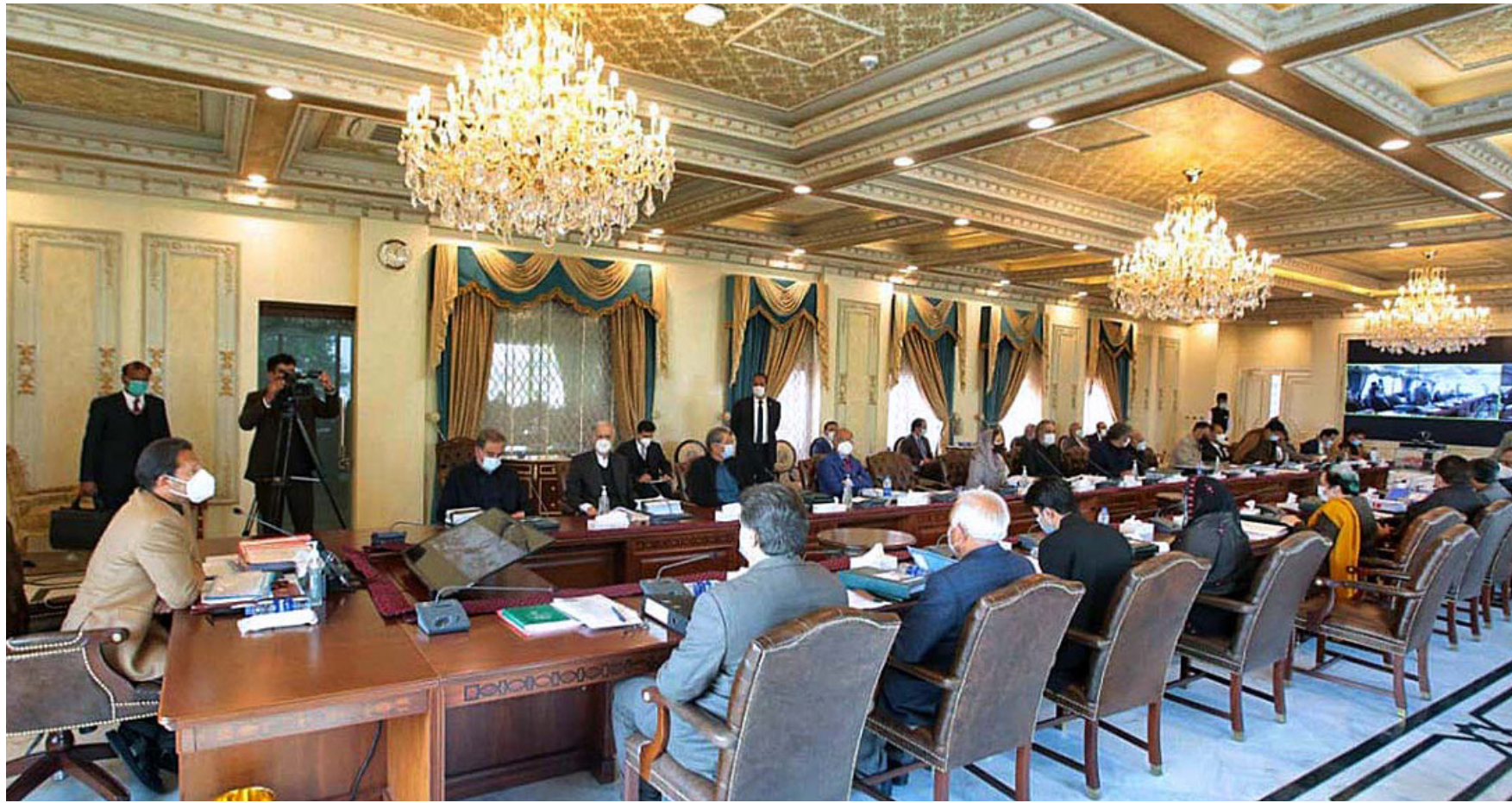
ISLAMABAD: January 19 – Prime Minister Imran Khan chairs meeting of the Federal Cabinet.