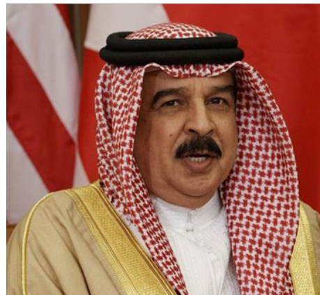
leadership through his support of the Vision for Peace and his decision to establish full diplomatic relations with the State of Israel," the official

MANAMA: US President Donald Trump bestowed a rare award on King Hamad of Bahrain on Tuesday, acknowledging the Gulf state's normalisation of ties with Israel on his last full day in office. Trump, who sees Arab recognition of Israel as a key overseas achievement of his presidency, already conferred the same award on King Mohammed VI of Morocco last week for his move to restore ties. Announcing his bestowal of the Legion of Merit, Degree Chief Commander, on King Hamad bin Isa Al Khalifa, Trump also paid tribute to Bahrain's hosting of a June 2019 conference on the economic dimensions of his controversial Middle East peace plan, which broke with decades of international consensus and was boycotted by the Palestinians. "King Hamad has shown extraordinary courage and