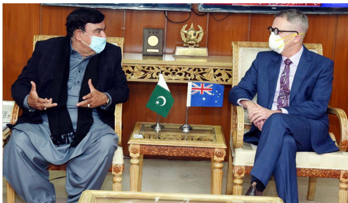
ISLAMABAD: Australian High Commissioner to Pakistan Geoffrey Shaw calling on minister for interior, Sheikh Rashid Ahmed.

One of our original productions, the acclaimed 'Daagh Ujala' (This Stained Dawn), toured the United States in 2015. Another project, of the group titled 'On Common Ground', toured the Oregon Shakespeare Festival and Artists Repertory Theater Portland in June/July 2017. 'Theater Wallay' was also involved in 'Theater for Social Change' projects and works to promote the use of creative expression as a tool for empowerment and critical dialogue. – APP