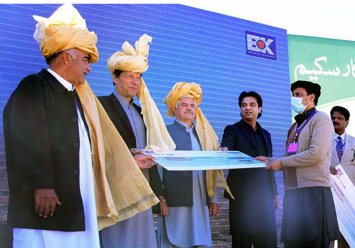
SOUTH WAZIRISTAN: Prime Minister Imran Khan distributes Kamyab Jawan youth entrepreneurship scheme cheques among the beneficiaries at Wana.

four issues, due to which the minutes of the second round were not signed". However to open a new chapter of transit trade and to facilitate transit trade between Afghanistan and Pakistan, both sides almost agreed on urgent solution of the remaining operational issues as soon as possible. The Afghan side pointed out that Pakistan has raised the customs valuation on Afghan exports to Pakistan especially on fresh fruits and dry fruits since last three years. Pakistan side stated that Afghanistan has also raised customs valuation on Pakistan kinnow, mango and vegetables exports. Both sides agreed to review and agree to a mechanism beneficial for exporters on both sides within one month including other issues too which also involves the issue of containers and Demurrages & Detention Charges.