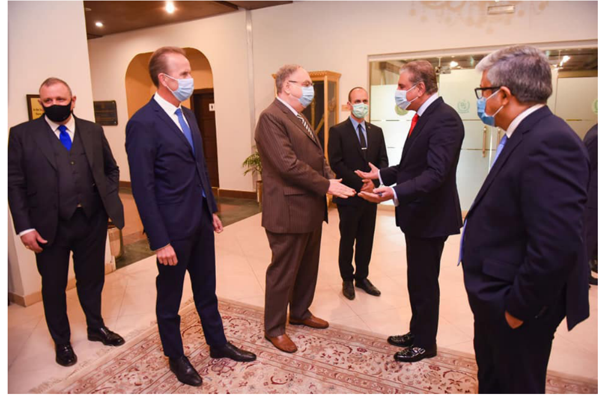
ISLAMABAD: Foreign Minister Shah Mahmood Qureshi interacting with Ambassadors of European Union countries at Ministry of Foreign Affairs.