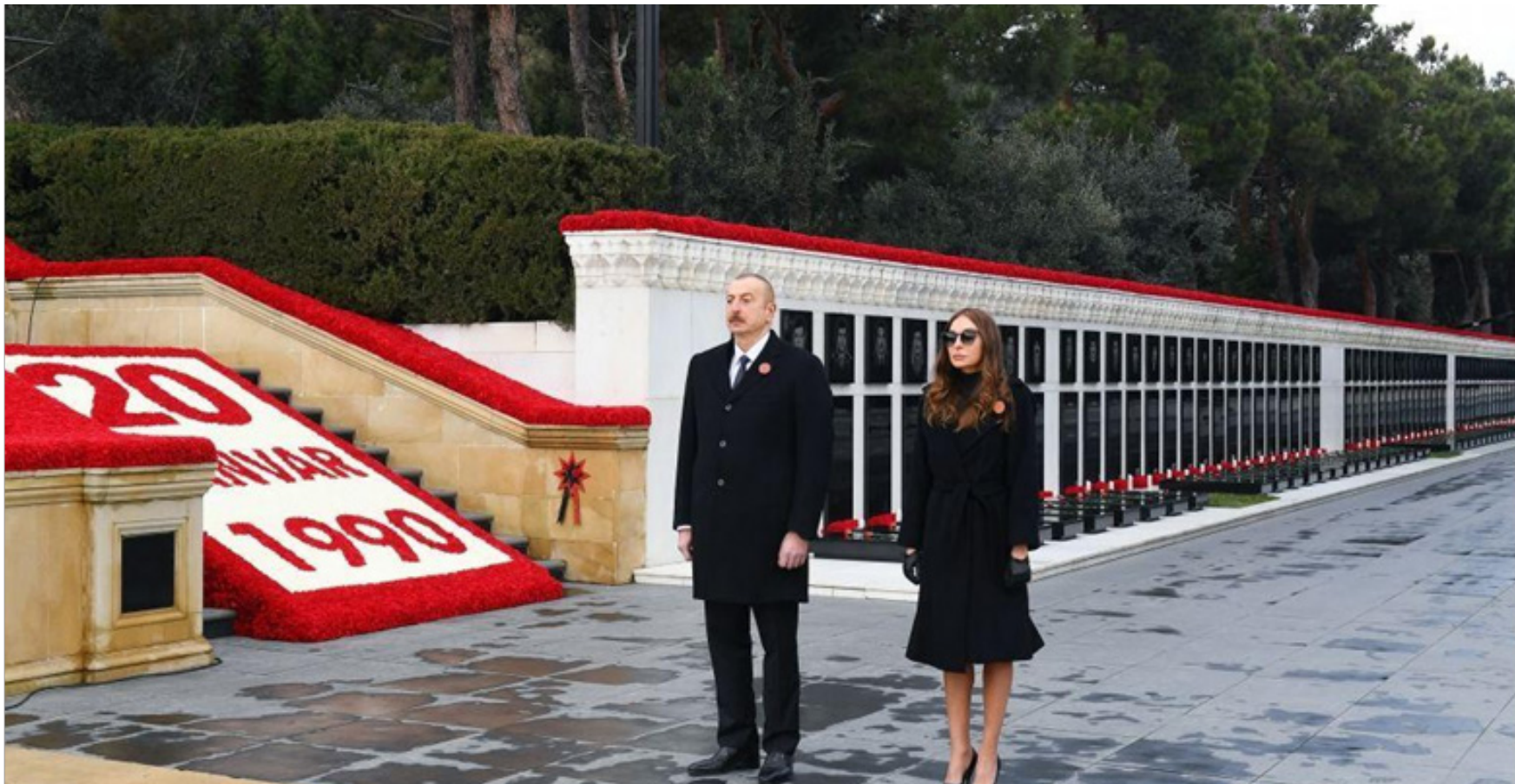
BAKU: President of the Republic of Azerbaijan Ilham Aliyev and first lady Mehriban Aliyeva visited the Alley of Martyrs on the 31st anniversary of the 20 January tragedy which was committed by the Soviet empire in Baku. President Ilham Aliyev and first lady Mehriban Aliyeva paid tribute to those who gave their lives for the country's freedom.

NEW DELHI: India's COVID-19 tally rose to 10,595,660 on Wednesday as 13,823 new cases were registered during the past 24 hours, said the latest data from the federal health ministry. According to the official data, the death toll mounted to 152,718 with 162 new deaths. There are still 197,201 active cases in the country, while 10,245,741 people have been discharged from hospitals after medical treatment. This is the first time in the past several months when the number of active cases in the country fell below the 200,000-mark. Meanwhile, the federal government has ramped up testing facilities across the country, as over 180 million tests have been conducted so far. As many as 188,566,947 tests were conducted till Tuesday, out of which 764,120 tests were conducted on Tuesday alone, said the latest data issued by the Indian Council of Medical Research (ICMR) on Wednesday. The national capital New Delhi, one of the most affected places in the country, has been witnessing comparatively a lesser number of cases over the past several months as 231 new cases and 10 deaths were registered in the national capital through Tuesday. - APP