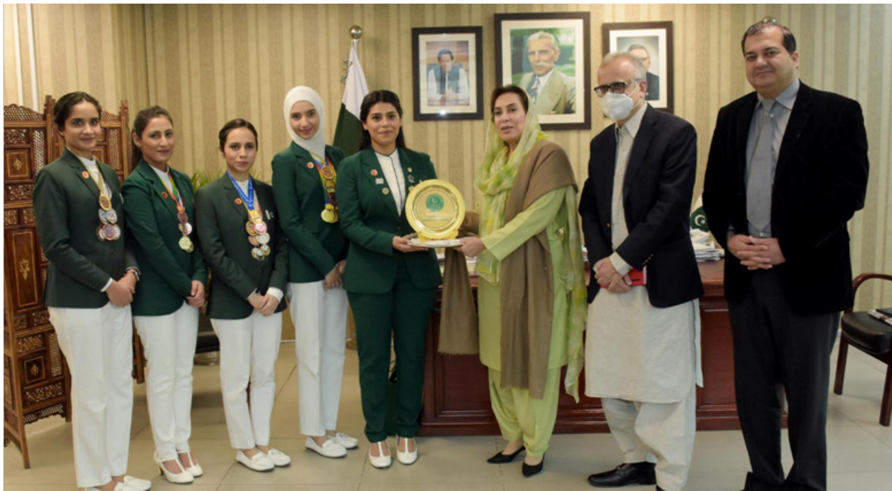
ISLAMABAD: Federal minister for inter-provincial coordination and president of Pakistan sports board, Dr. Fehmida Mirza awarded winners of 9th world memory championship with certificates and souvenirs.

The PPP chairman said: "The damage PTI government has done to the country is unprecedented. Pakistan has further weakened economically. Compared to the federal government, PPP gave reasonable rates for taxes. We did not consider traders and industrialists as criminals but gradually brought them under the tax net." Bilawal said that agriculture is a backbone of Sindh's economy and we hope that this project will boost agriculture in the province. "We are portrayed as enemies of industry and friends of the people but we know that industrialization plays an important role in the development of a country. That's why we offer special packages," he added.