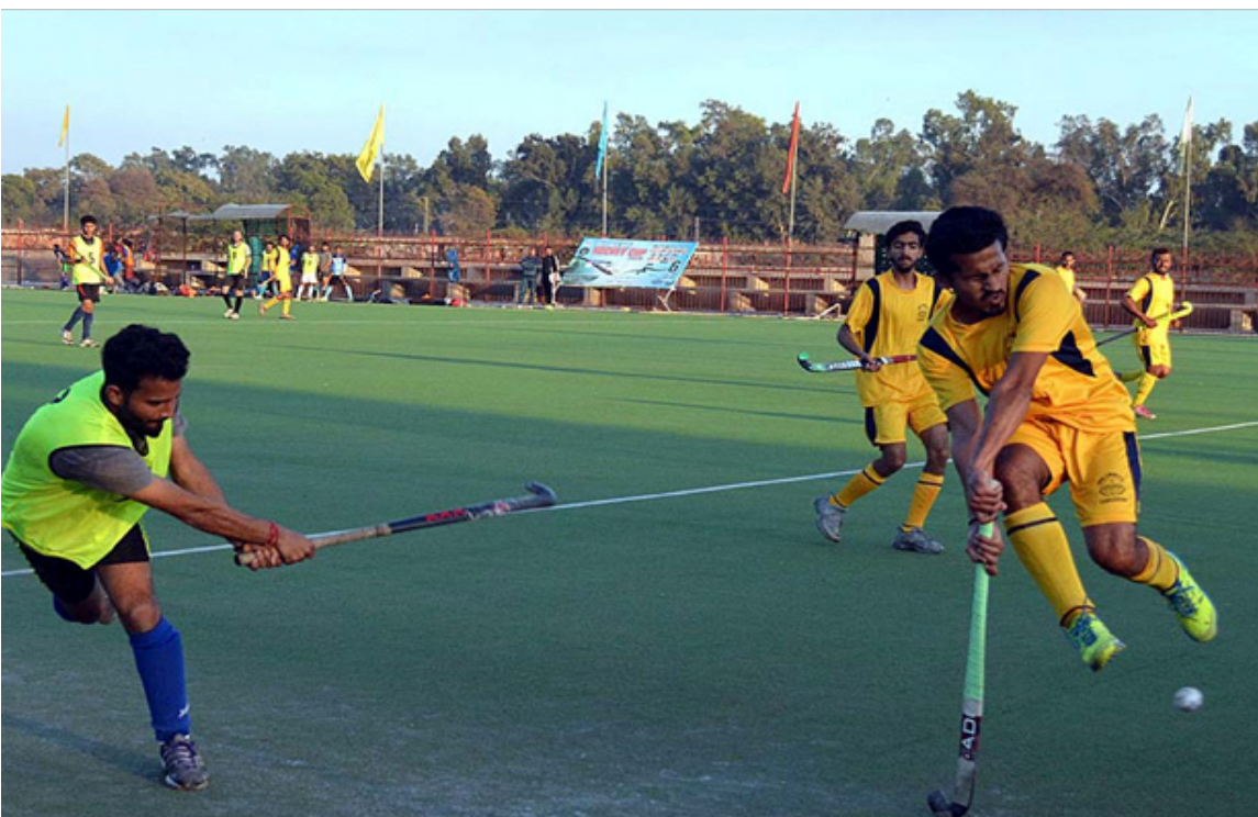
SARGODHA: A view of friendly hockey match playing between Pak Fazaia Hockey team and Sargodha 11 Hockey team at Astro turf Hockey Stadium.

third-tier Alcoyano, Zidane is again under pressure, and Real Madrid will try to reignite their La Liga title challenge away to Alaves. Zidane's side are playing catch-up to Atletico Madrid, despite having played a game more, after draws against struggling Elche and Osasuna, two of the league's bottom three, in recent weeks. Alaves beat Madrid 2-1 in the capital in late November but have won just once in eight matches since, their slide into a relegation scrap costing coach Pablo Machin his job last week with former Spain international Abelardo Fernandez returning to take charge.