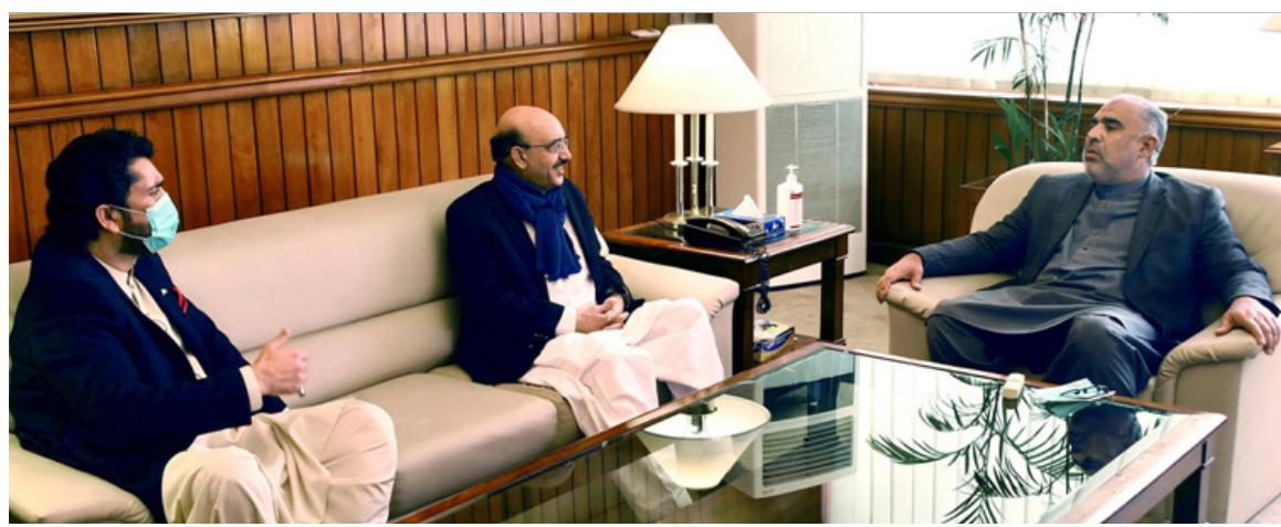
ISLAMABAD: Speaker National Assembly Asad Qaiser is a meeting with President of Azad Jammu and Kashmir Sardar Masood Khan and chairman parliamentary committee on Kashmir, Shehryar Khan Afridi at Parliament House.

He said that issues of police personnel would be resolved on priority and their morale would be boosted through encouragement over good performance. The IGP urged the police officials to stand with him for changing typical police environment and adopt decent attitude with those complainants visiting policing stations. He said that promotion system in the department would be improved and pending promotions would be made soon. The IGP directed Zonal SPs, SDPOs and SHO's to take steps for community policing and hold open kutcheries in their respective areas on regular basis.