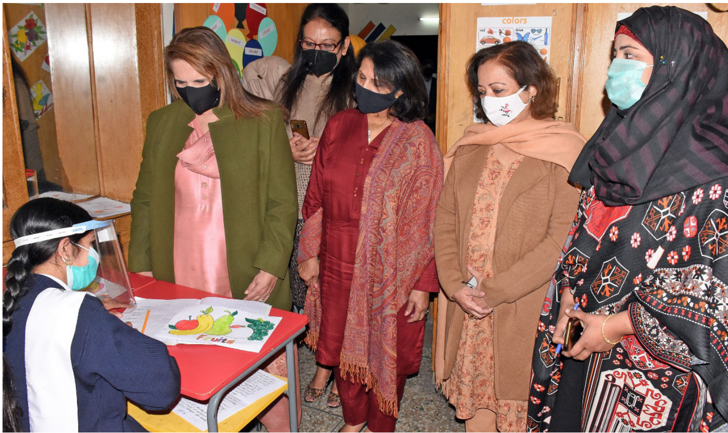
ISLAMABAD: First Lady Samina Alvi taking interacting with a student during her visit to the care for special persons Foundation. - DNA

ISLAMABAD: The price of 24 karat per tola gold decreased by Rs 600 on Friday and was sold at Rs 112,800 against its sale at Rs113,400 the previous day, Karachi Sarafa Association reported. The price of ten gram 24 karat gold also decreased by Rs514 and was traded at Rs 96,708 against its sale at Rs97,222 while ten gram 22 karat gold was sold at Rs88,649. The price of per tola and ten gram silver also witnessed no change and was sold at Rs1300 and Rs1114.54 respectively. The gold price in the international market witnessed decrease of US $ 25 and was sold at US $ 1845 against its sale at $1870, the association added. - APP