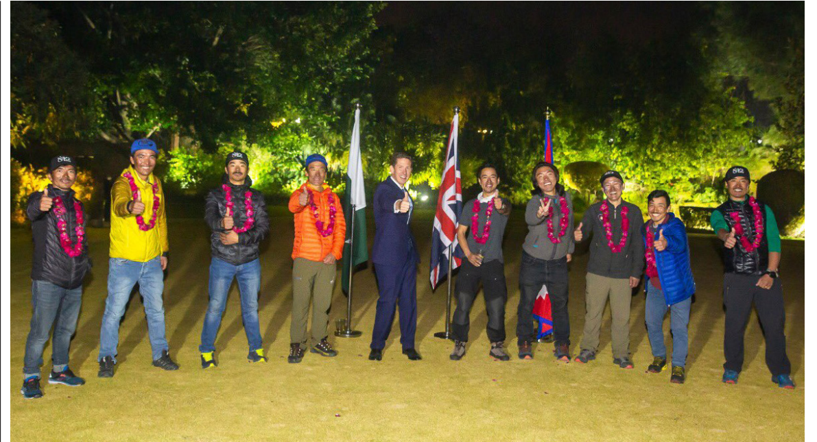
ISLAMABAD: British High Commissioner to Pakistan Dr. Christian Turner posing for photo with the Nepalese climbing team who made first winter ascent of K2.

LAHORE: Pakistan Muslim League-Nawaz (PML-N) Vice-President Maryam Nawaz has condemned the increase in electricity tariff by the government. In a tweet on Friday, Maryam Nawaz said nobody else knew better how to suck people's blood than 'incompetent' Prime Minister Imran Khan. She further said each and every moment spent under Imran Khan's government was a burden on the people.