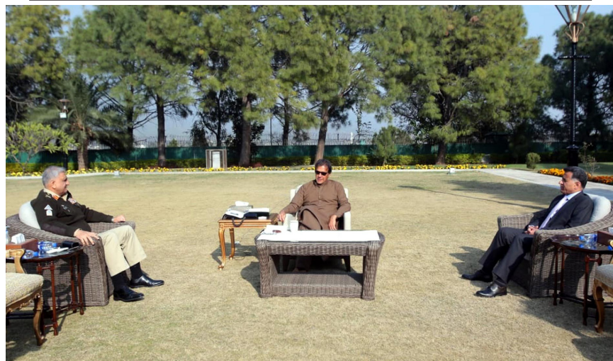
ISLAMABAD: Chief of Army Staff General Qamar Javed Bajwa and DG ISI, Lt. Gen. Faiz Hamid call on Prime Minister Imran Khan.