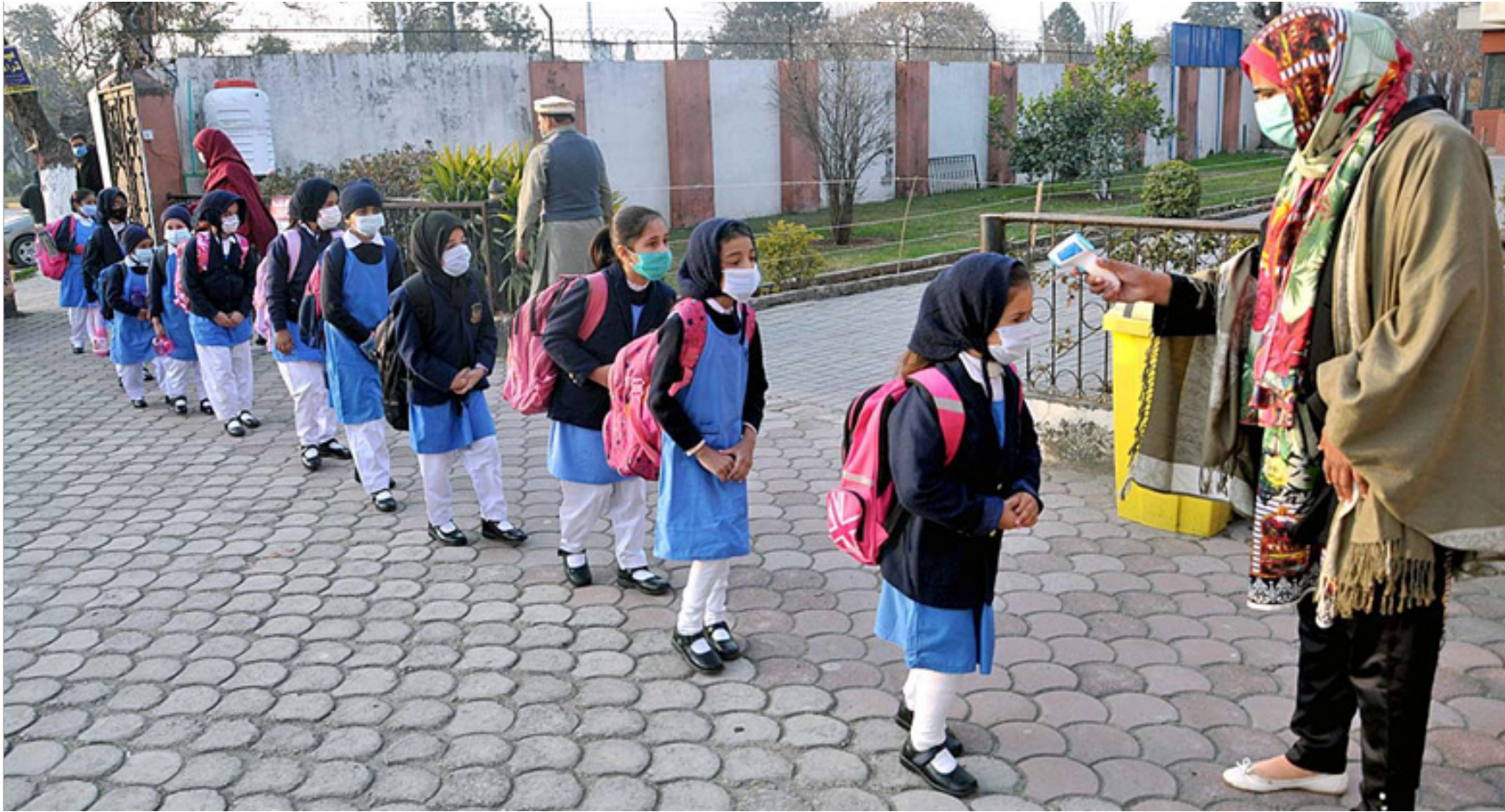
ISLAMABAD: Temperature of students being checked at school entrance as all educational activities resume amid strict implementation of COVID SOPs.