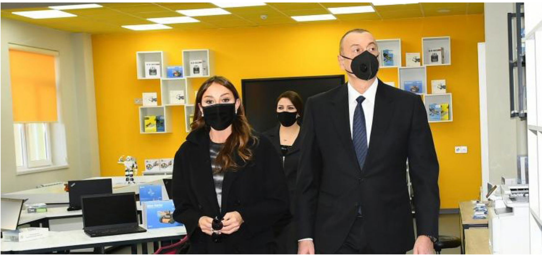
KHIRDALAN: President Ilham Aliyev and First Lady Mehriban Aliyeva viewed conditions created at school-lyceum No 3 in Khirdalan city.