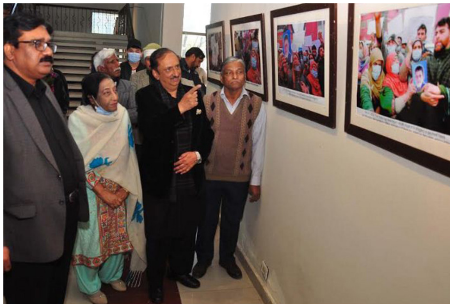
RAWALPINDI: Visitors taking interest in photographs displayed on the occasion of an exhibition organized in connection with Kashmir Solidarity Day.