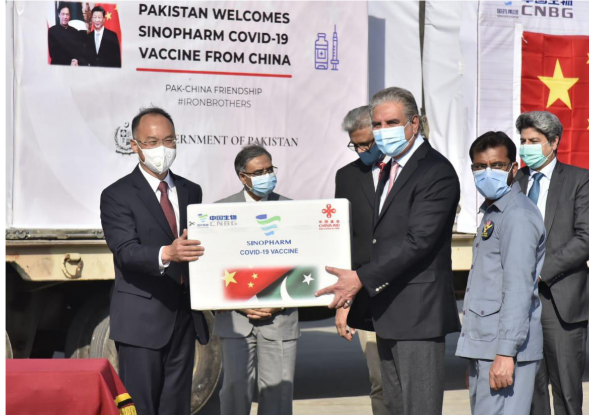
ISLAMABAD: Chinese Ambassador Nong Rong handing over the first batch of Covid-19 vaccines to Foreign Minister Shah Mahmood Qureshi.