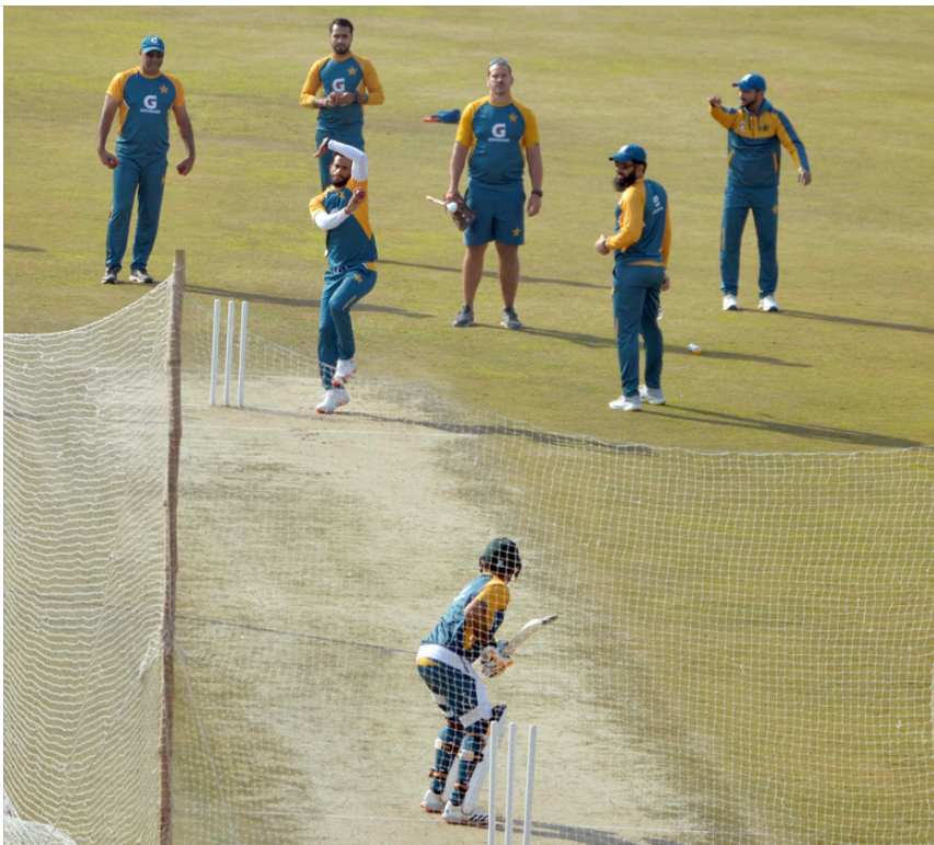
RAWALPINDI: Pakistan team during training session at the Pindi Cricket Stadium.

responsibility for the publication of this document and will take appropriate legal action against the newspaper El Mundo, for any damage that may be caused as a result of this publication. "FC Barcelona expresses its absolute support for Lionel Messi, especially in the face of any attempt to discredit his image, and to damage his relationship with the club where he has worked to become the best player in the world and in football history." According to the report, Messi earned 115 million euros ($140m) just for signing the contract in 2017 and among his potential bonuses is a 3,548,644-euro ($4.3m) reward for winning the Champions League and 2,365,766 euros ($2.9m) for winning Spain's La Liga, El Mundo claimed.