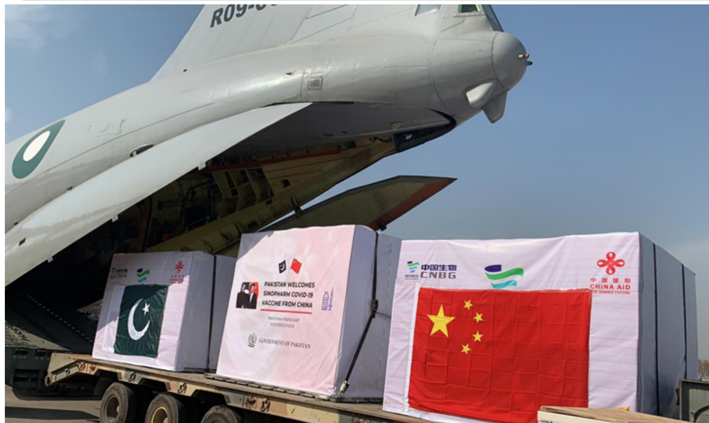
ISLAMABAD: First batch of Covid-19 vaccines being unloaded from special plane. The vaccines arrived from China early Monday morning. - DNA

ISLAMABAD: The Missing Persons Commission has disposed of 4,822 cases upto January 31, 2020, says the latest progress report released by Secretary (Co-ED) on cases of alleged enforced disappearances. A total number of 6,921 cases were received by the Missing Persons Commission upto December 2020. During January 2021, 23 more cases were received by the commission and total numbers of cases reached to 6,944. The Missing Persons Commission disposed of 24 cases in January 2021 and thus total disposal of Missing Persons reached to 4822 till January 31 and balance as on January 31, 2021 is 2,122. - APP