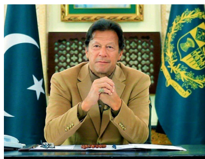
ANSAR MAHMOOD BHATTI

Pakistani citizens called the prime minister and asked questions related to different issues