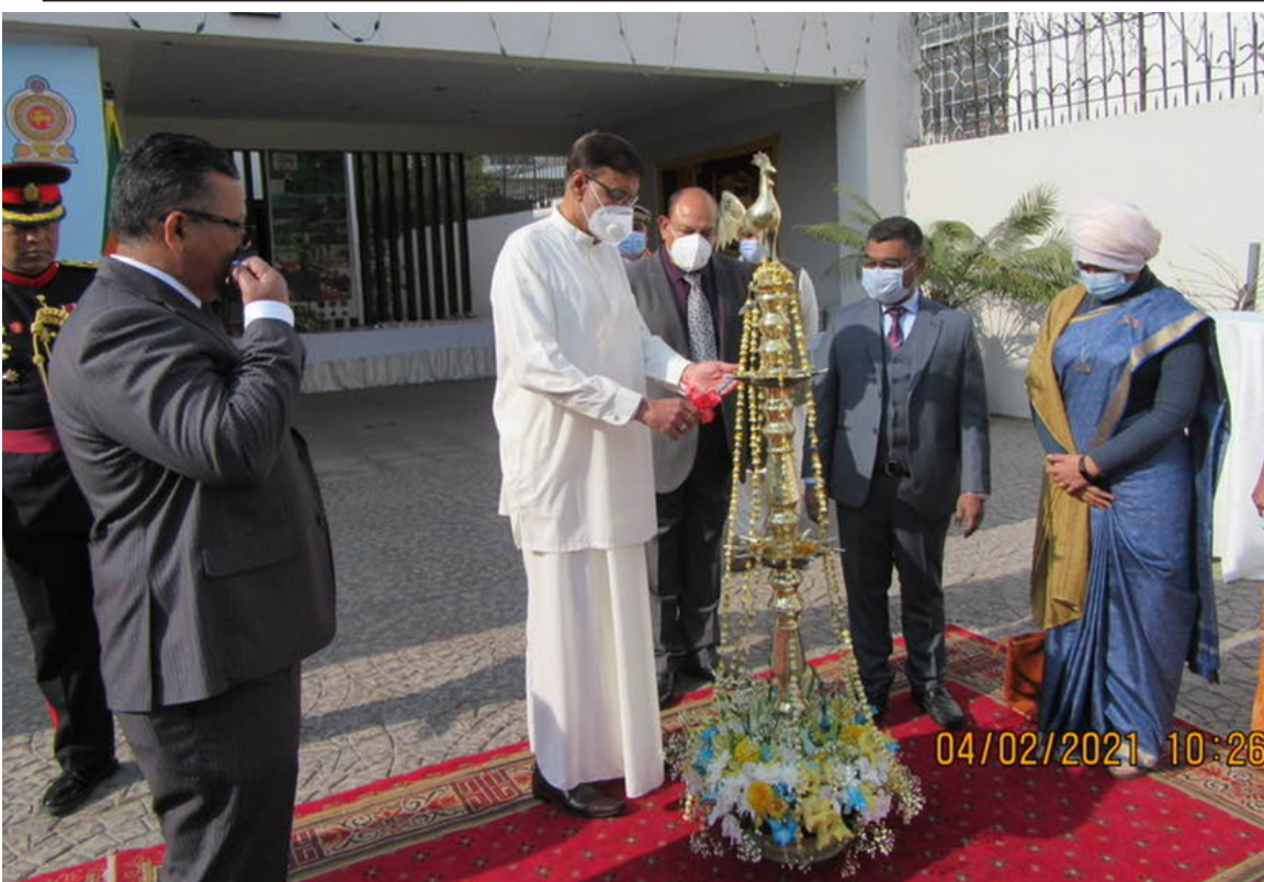
ISLAMABAD: High Commissioner of Sri Lanka Mohan Wijewickrama lighting traditional lamp to mark the 73RD Independence day of Sri Lanka.

implementation of these orphanages' standards, a comprehensive monitoring mechanism and observatory would also be developed." In our country, alternative care to orphans is largely provided by the government and the NGOs. These operating guidelines have been specifically chalked out to run orphanages and children homes, keeping in view the national and international standards of care. They would provide guidance and direction to orphanage management for quality service and control, catering to the minimum possible requirement of an orphanage from eligibility, accommodation, safety and security, infrastructure, diet, education, counselling, staff performance and facilities.