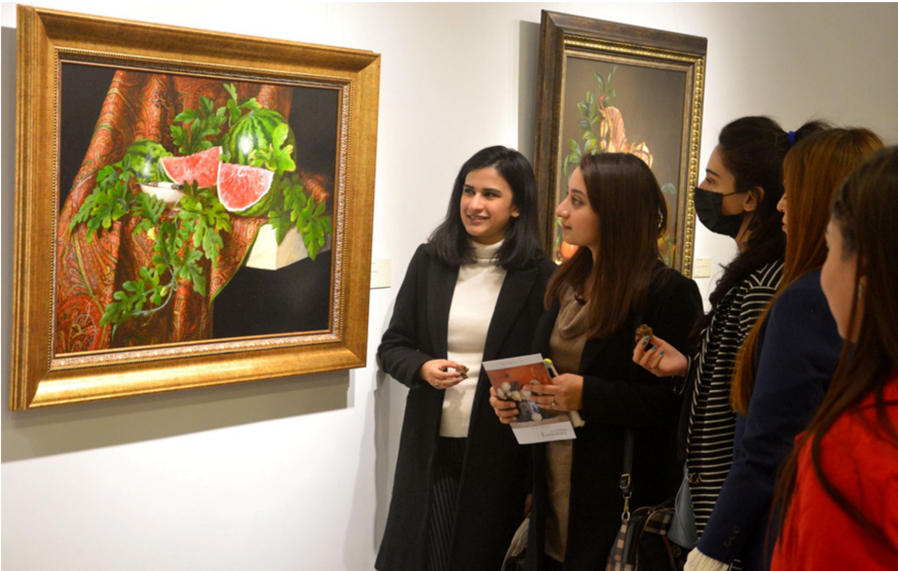
ISLAMABAD: Visitors taking interest in paintings during an exhibition at Tanzara Art Gallery, on Thursday.