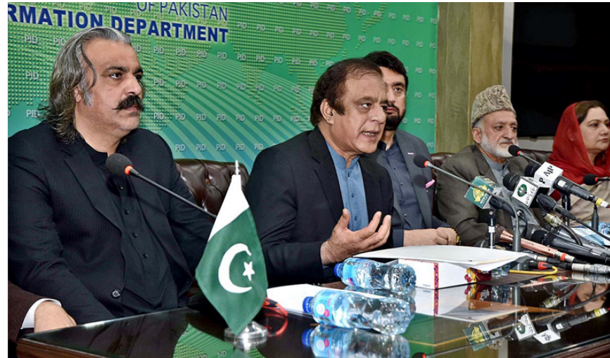
ISLAMABAD: Federal minister for information and broadcasting Senator Shibli Faraz, federal minister for Kashmir affairs and Gilgit-Baltistan Ali Amin Khan Gandapur, Chairman Kashmir committee Shehryar Afridi and All parties Hurriyat Conference leadership addressing a joint press conference regarding Kashmir Solidarity Day.

recognized the invaluable role of PBSA in promoting character building of students. FGEI welcomes the training of teachers and students in meeting the future challenges through attainments of interpersonal skills. By signing the MoU productive skills activities will bring a healthy change in FGEI (C/G) institutions.