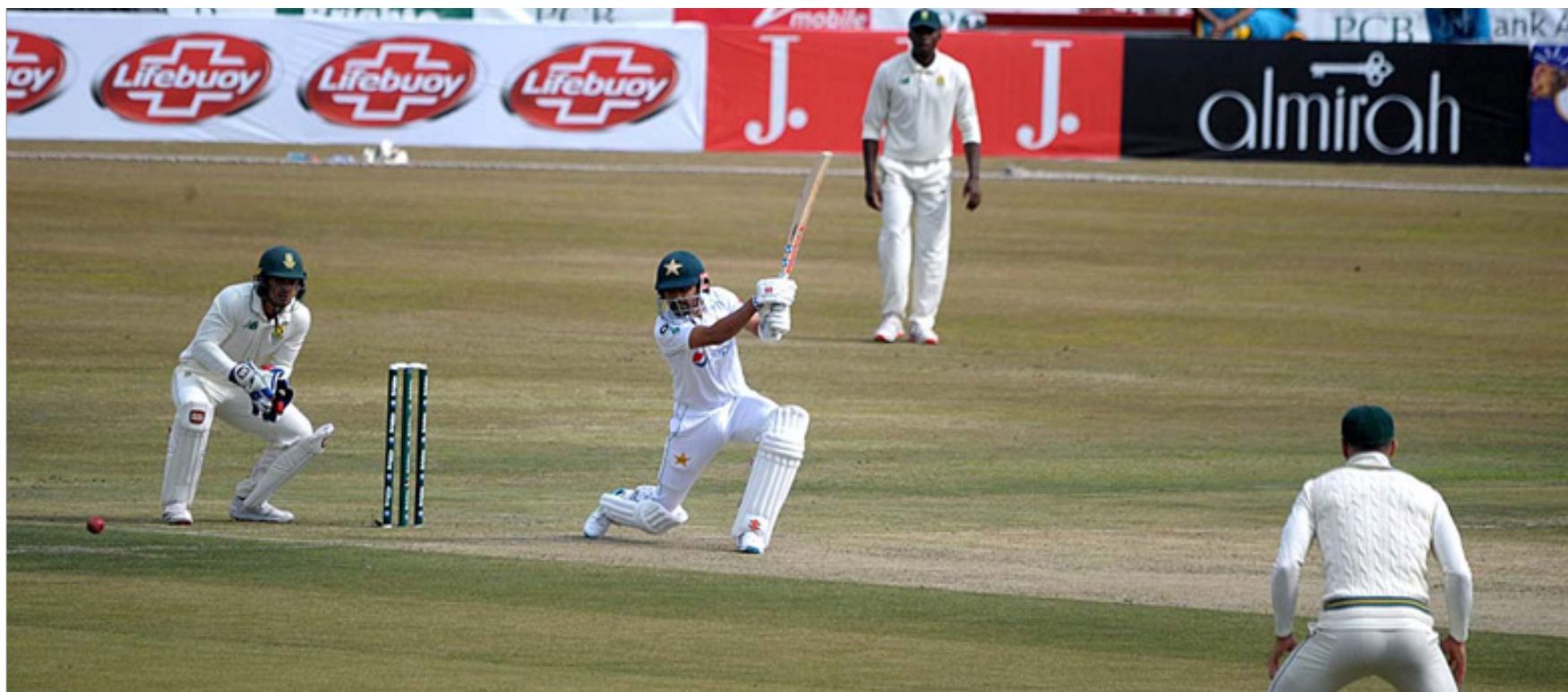
RAWALPINDI: A view of cricket match between Pakistan and South African teams during first day of 2nd Test cricket match played at Pindi Cricket Stadium. — DNA

BUCHAREST: The Orthodox Church was facing growing pressure on Thursday to change baptism rituals in Romania after a baby died following a ceremony, which involves immersing infants three times in holy water. The six-week-old suffered a cardiac arrest and was rushed to hospital on Monday but he died a few hours later, the autopsy revealing liquid in his lungs. Prosecutors have opened a manslaughter probe against the priest in the northeastern city of Suceava. An online petition calling for changes to the ritual had gathered more than 56,000 signatures by Thursday evening. "The death of a newborn baby because of this practice is a huge tragedy," said a message with the petition. "This risk must be ruled out for the joy of baptism to triumph." — APP