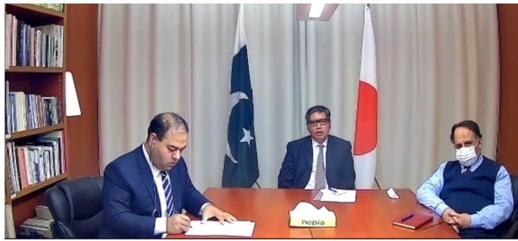
Association from Srinagar.