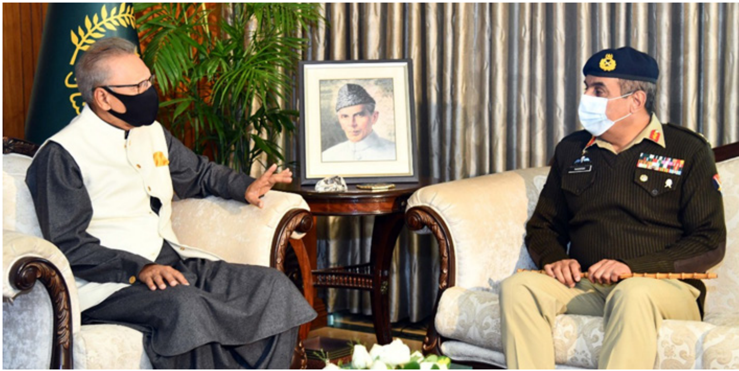
ISLAMABAD: Chairman Joint Chiefs of Staff Committee, General Nadeem Raza, called on President Dr Arif Alvi, at Aiwana-e-Sadr.

The NAB prosecutor presented the report about reference against PML-N stalwart before the court. The court later adjourned the hearing after extending judicial remand of Khawaja Asif According to the latest progress made in assets beyond income case against Khawaja Asif, four witnesses have recorded their statements to the anti-corruption watchdog.