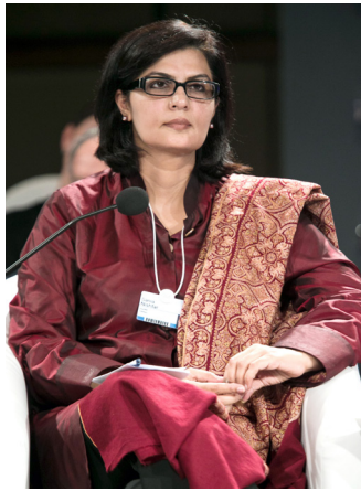
Today, the standards were formally approved, and it was decided that these standards will be notified for all orphanages in the federal area and