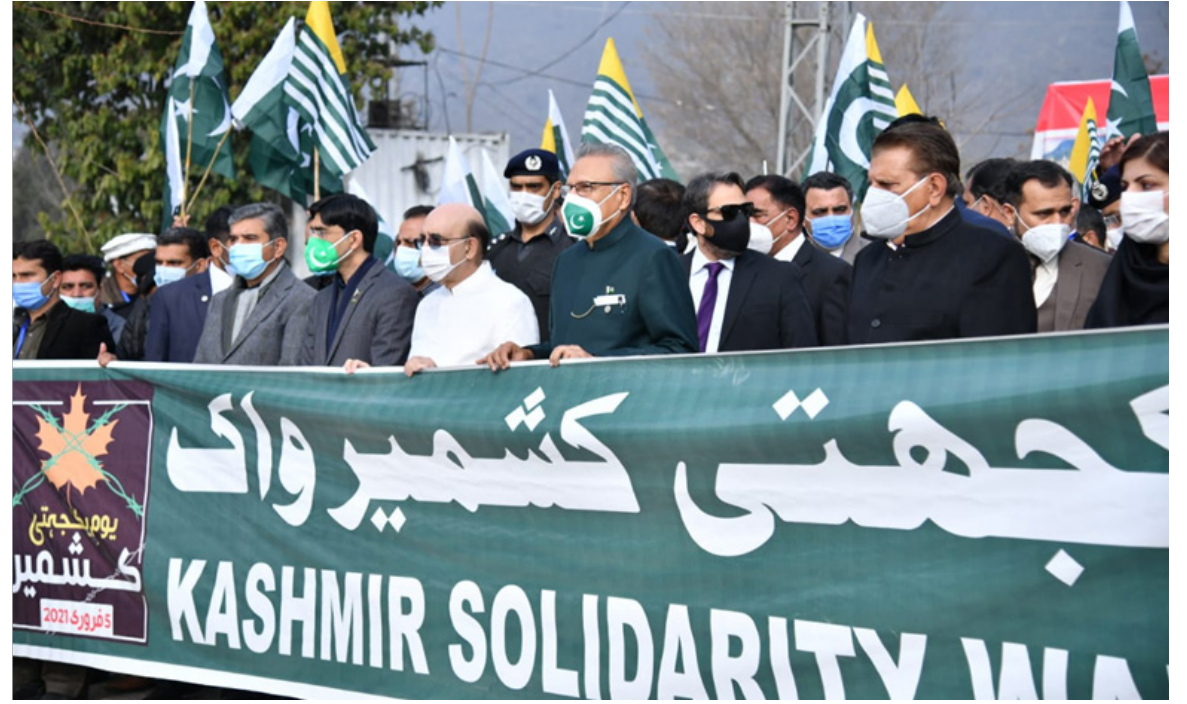
MUZAFFARABAD: President Dr. Arif Alvi leading the Kashmir Solidarity walk.

ISLAMABAD: A rally led by Foreign Minister Shah Mahmood Qureshi was taken out in Islamabad on Friday to express solidarity with the oppressed people of Indian Illegally Occupied Jammu and Kashmir (IIOJK). It began from the foreign office on the Constitution Avenue and culminated at D-Chowk. Chairman Senate Sadiq Sanjrani, Speaker National Assembly Asad Qaiser, the ministers, parliamentarians and people belonging to different segments of the society attended the rally. The participants raised slogans in support of the Kashmiri people. They were carrying the Kashmiri flags and banners highlighting the Indian brutalities on the Kashmiri people. Talking to the media persons on the occasion, Foreign Minister Shah Mahmood Qureshi said the Kashmiri people are not alone in their legitimate struggle for the right to self-determination. He said Pakistan stands shoulder to shoulder with them.