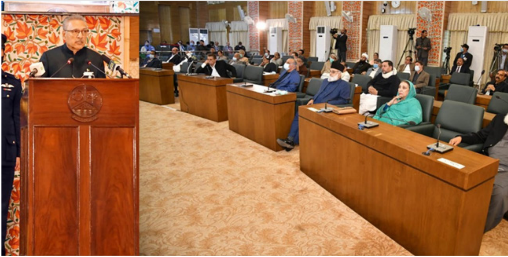
MUZAFARABAD: President Dr Arif Alvi addressing the Azad Jammu and Kashmir Legislative Assembly, at Muzafarabad.