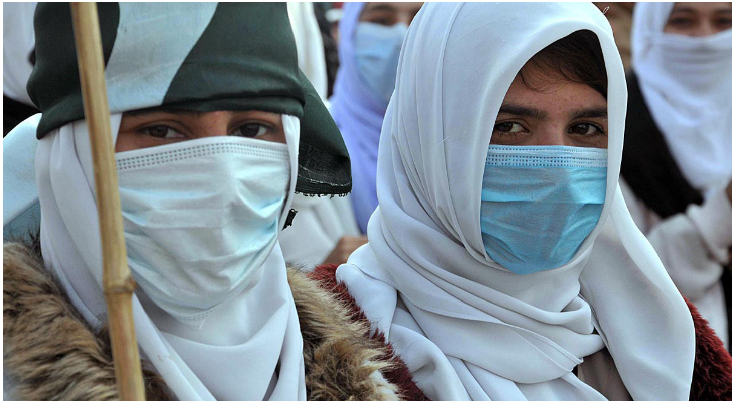
ISLAMABAD: People from different walks of life participating in a rally to mark the Kashmir Solidarity Day at Karachi Company. APP

kilometres long coastline and the potential offered by our exclusive economic zone of 240,000 square kilometres and continental shelf of 50,000 square kilometres, which is increasingly adding to the national economy. "In my assessment, the global geopolitical environment is undergoing an unprecedented transition, remaining highly volatile and is characterized by new alignments of interests and partnerships. Pakistan finds itself in the midst of a complex geopolitical and geo-economic competition prevailing in the region.