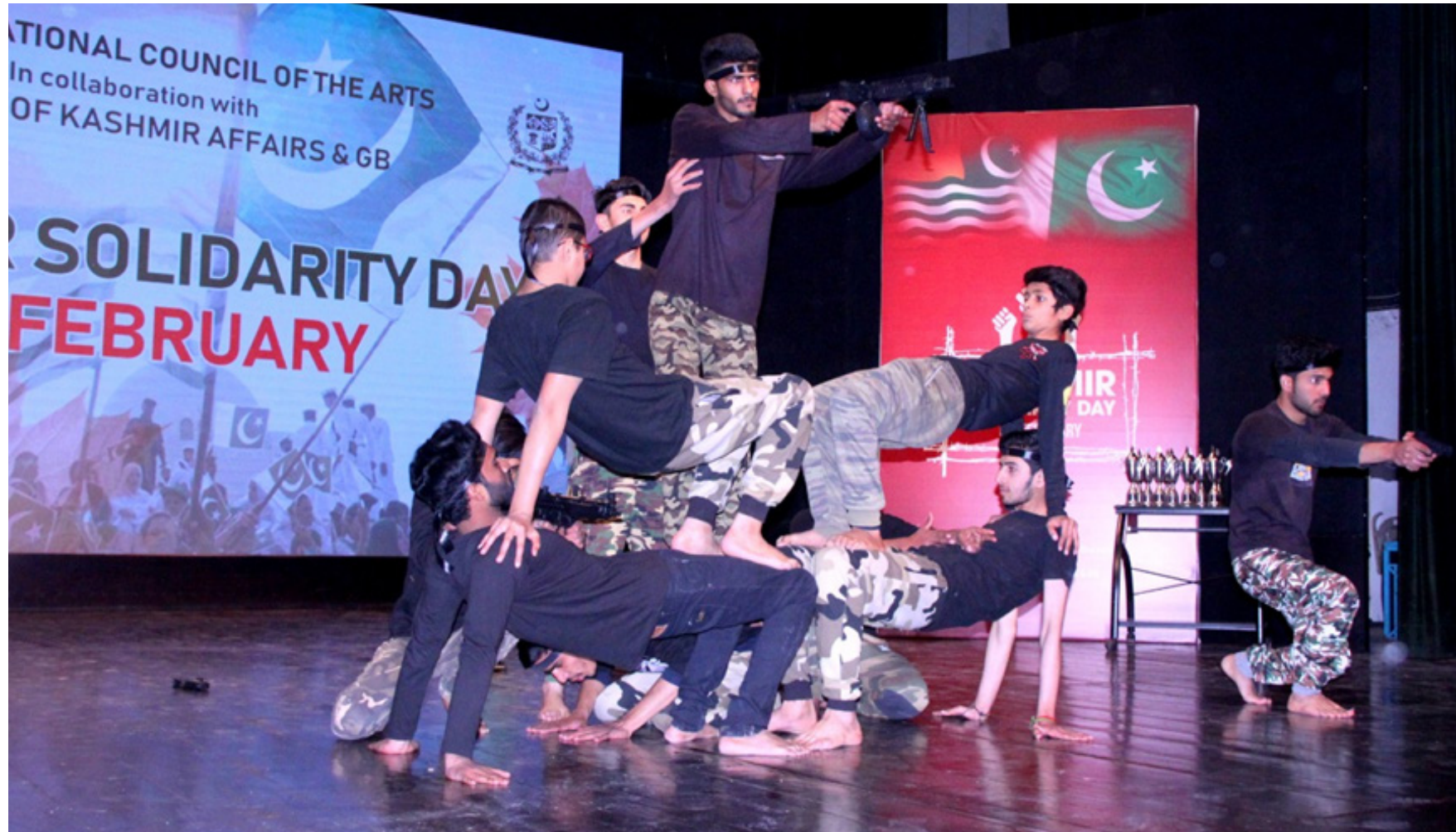
ISLAMABAD: Children taking part in a skit to expose brutalities of the Indian occupied forces in Kashmir, at PNCA.

ISLAMABAD: Indus River System Authority (IRSA) on Friday released 81,300 cusecs water from various rim stations with inflow of 33,800 cusecs. According to the data released by IRSA, water level in the Indus River at Tarbela Dam was 1461.10 feet, which was 69.10 feet higher than its dead level 1386 feet. Water inflow and outflow in the dam was recorded as 12,100 and 46,700 cusecs respectively. The water level in the Jhelum River at Mangla Dam was 1172.30 feet, which was 132.30 feet higher than its dead level of 1040 feet whereas the inflow and outflow of water was recorded as 7,100 and 20,000 cusecs respectively. The release of water at Kalabagh, Taunsa and Sukkur was recorded as 44,700, 44,500 and 6,600 cusecs respectively. Similarly, from the Kabul River a total of 7,500 cusecs of water was released at Nowshera and zero cusecs released from the Chenab River at Marala.