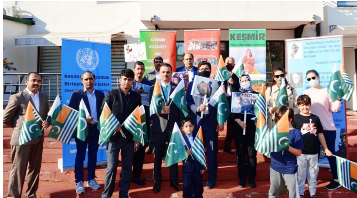
ISTANBUL: Consulate general of Pakistan Istanbul arranged a protest demonstration activity against the Indian atrocities in the Illegally Indian occupied Jammu and Kashmir to mark Kashmir Solidarity Day.