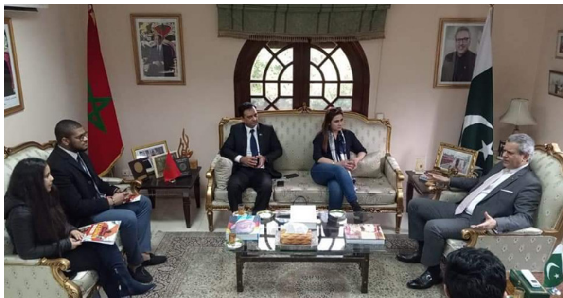
RABAT: Kashmir Solidarity Day event hosted at the Pakistani mission in Rabat. Members of the diplomatic corps, media, international organisations and NGOs were invited. Number limited due to Covid restrictions.