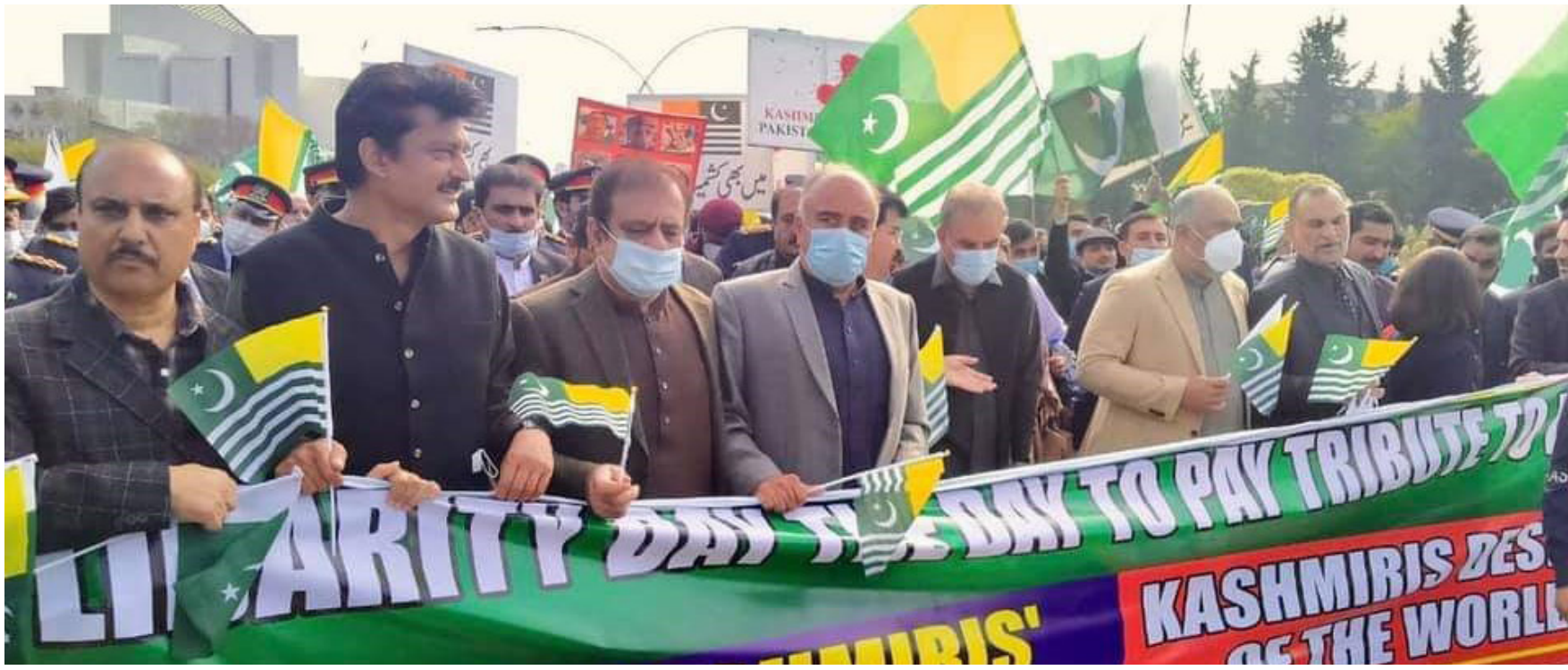
ISLAMABAD: Foreign Minister Makhdoom Shah Mahmood Qureshi, Federal Minister for Information and Broadcasting Senator Shibli Faraz, Chairman Senate Muhammad Sadiq Sanjrani, Speaker National Assembly Asad Qaiser and Federal Minister for Railway Muhammad Azam Khan Swati leading a walk and rally to mark the Kashmir Solidarity Day in support of Kashmiris right of self-determination.

Syed Murad Ali Shah said that the Indian government, in order to suppress people of IIOJK, has not only amended their constitution to deny the historical rights of people of the valley, but has turned the valley into a no-go-area where no person was allowed to enter to witness the plight of the people. "In the history the curfew imposed in Kashmir is the longest ever imposed anywhere in the world," he said. Syed Murad Ali Shah said that the conferences, walks and seminars to highlight the plight of people of Kashmir were good to further highlight the Kashmir issue. — APP