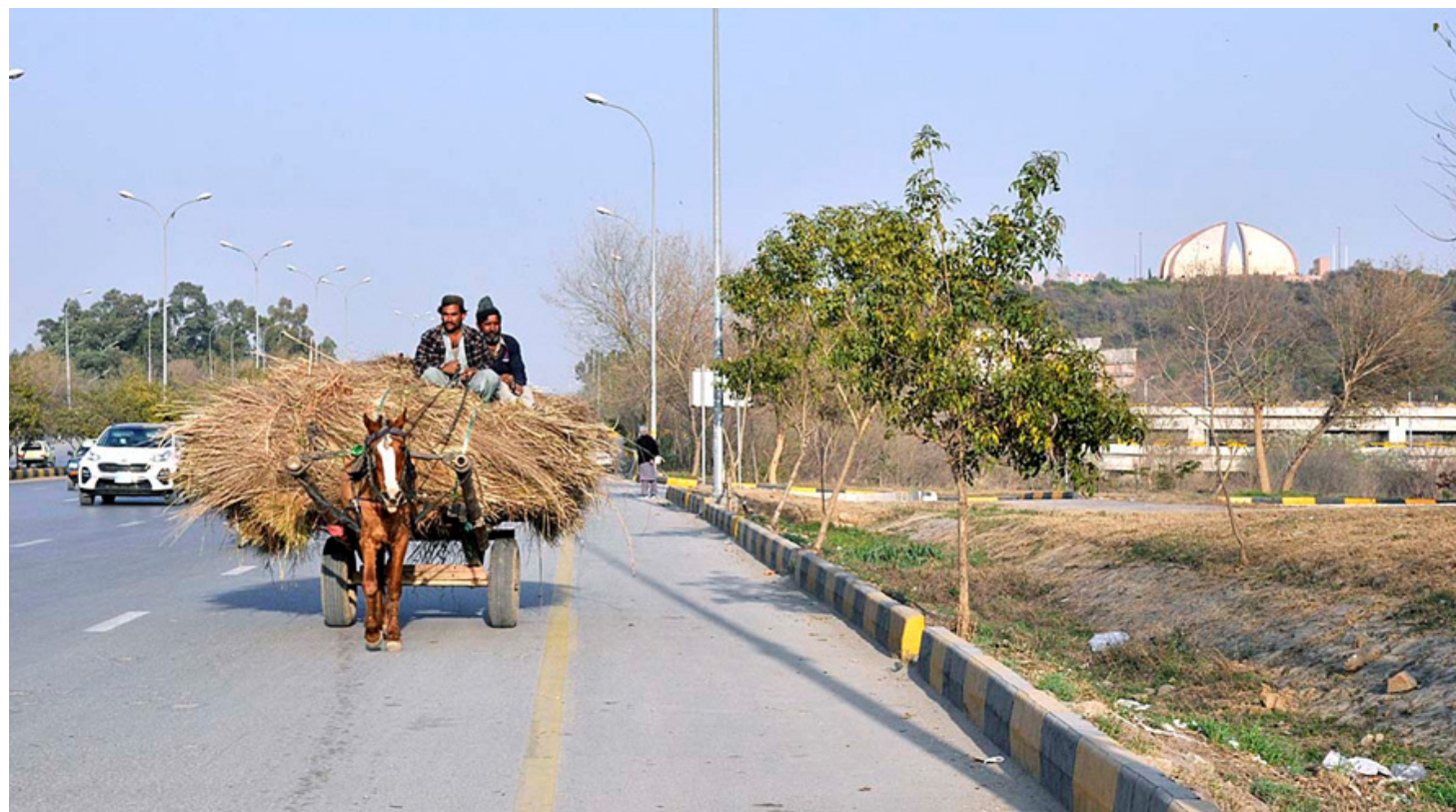
ISLAMABAD: Despite the ban a horse driven cart plying at Srinagar Highway and needs the attention of concerned authorities.

deforestation, over exploitation of natural resources and shrinking livelihood options. Life is also under stress because of rapid social changes and local political conflicts and natural disasters. Male migration from mountains to urban towns for education and employment is causing a severe shortfall of human resources which is increasing more workload on women. He said Chinese model of community development can be a role model for us where women empowerment and engagement is the focus. chairman Baltistan Association of Tour Operators (BATO) we have networks of travel and tourism organizations but they hardly join hands for collective promotions. Individualistic approach is against the collective good for the region and country but we are more interested in individual initiatives so have more vested benefits.