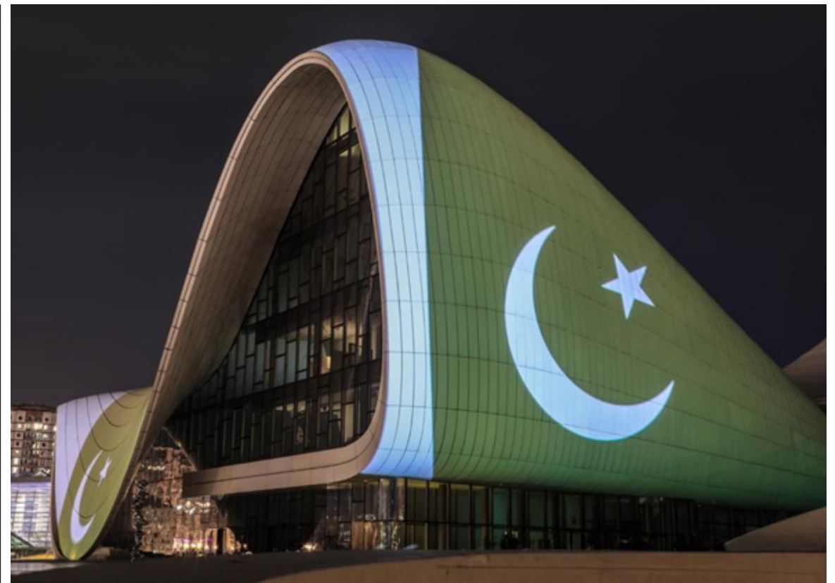
BAKU: Center in Baku was illuminated with Pakistani flag to show solidarity with the people of Kashmir.