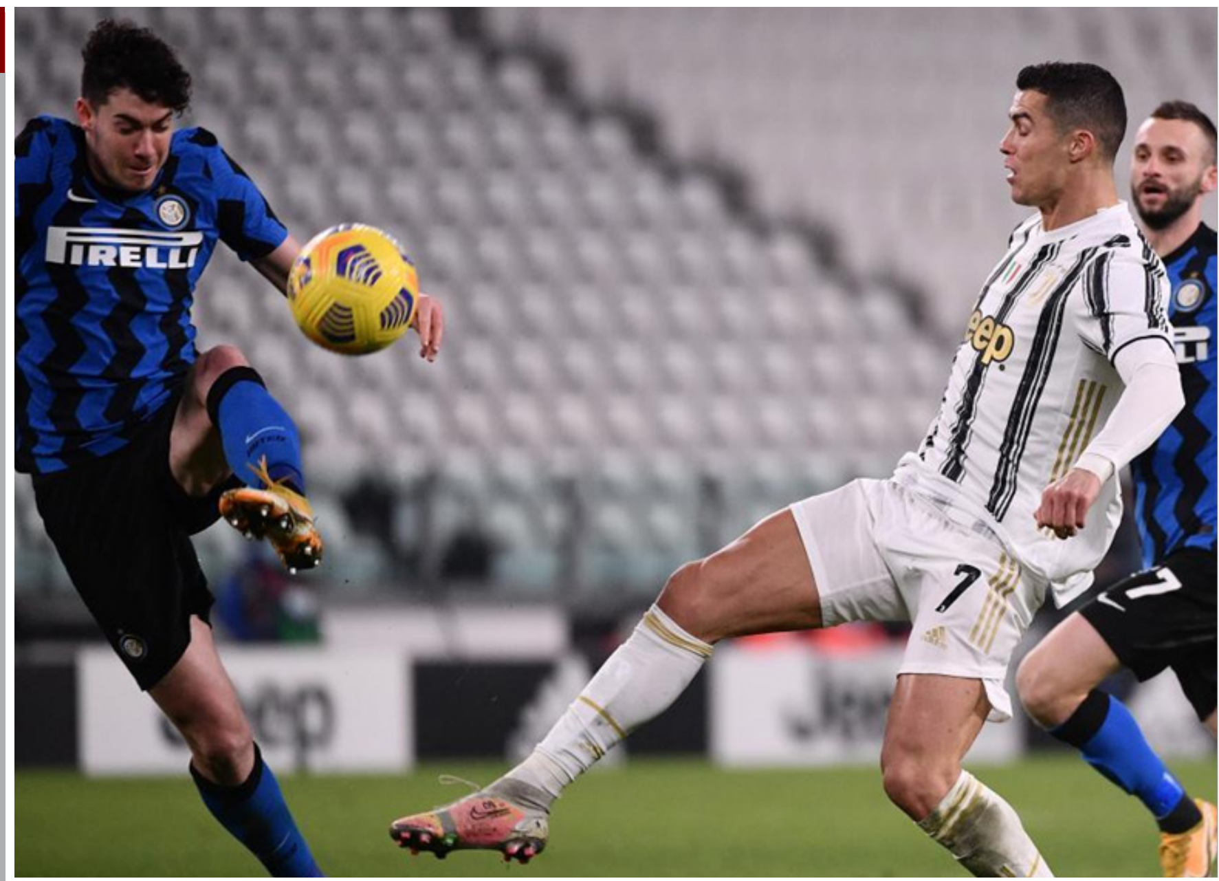
TURIN: FC Inter's Alessandro Bastoni (L) vies with FC Juventus' Cristiano Ronaldo during the Italy Cup semifinal second leg football match between FC Juventus and FC Inter.

CNIC and pin code. The FLHCW will be vaccinated upon his turn. In the next step, the vaccination staff will confirm vaccine entry in NIMS and confirmation SMS will be sent. Finally, the FLHCW will have to stay for 30 minutes for monitoring after vaccination at the Adult Vaccine Center (AVC). Moreover, in case of double shot vaccine the message will be sent after seven days