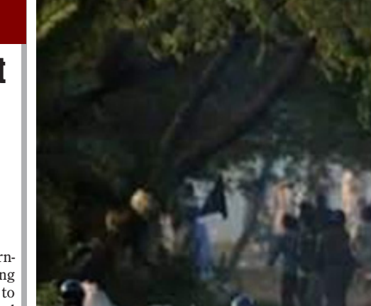
ISLAMABAD: Tear gas, smoke emerge as police push protesting government employees from entering into Red zone area of capital. – DNA

The contract was signed between Universal Service Fund (USF) and Telenor for high-speed mobile broadband projects in Upper Dir, Chitral and Lower Dir districts. The ceremony was witnessed by Federal Minister for IT and Telecom Syed Amin Ul Haque and SAPM Syed Zulfiqar Abbas Bukhari. The IT minister further said that the broadband project in Upper Dir, Chitral and Lower Dir districts would be completed at a cost of Rs1.3 billion, adding that the government also taking measures to resolve internet issues in North Waziristan. "IT ministry taking necessary measures to ensure availability of broadband services at all tourist spots across the country," he added. - APP