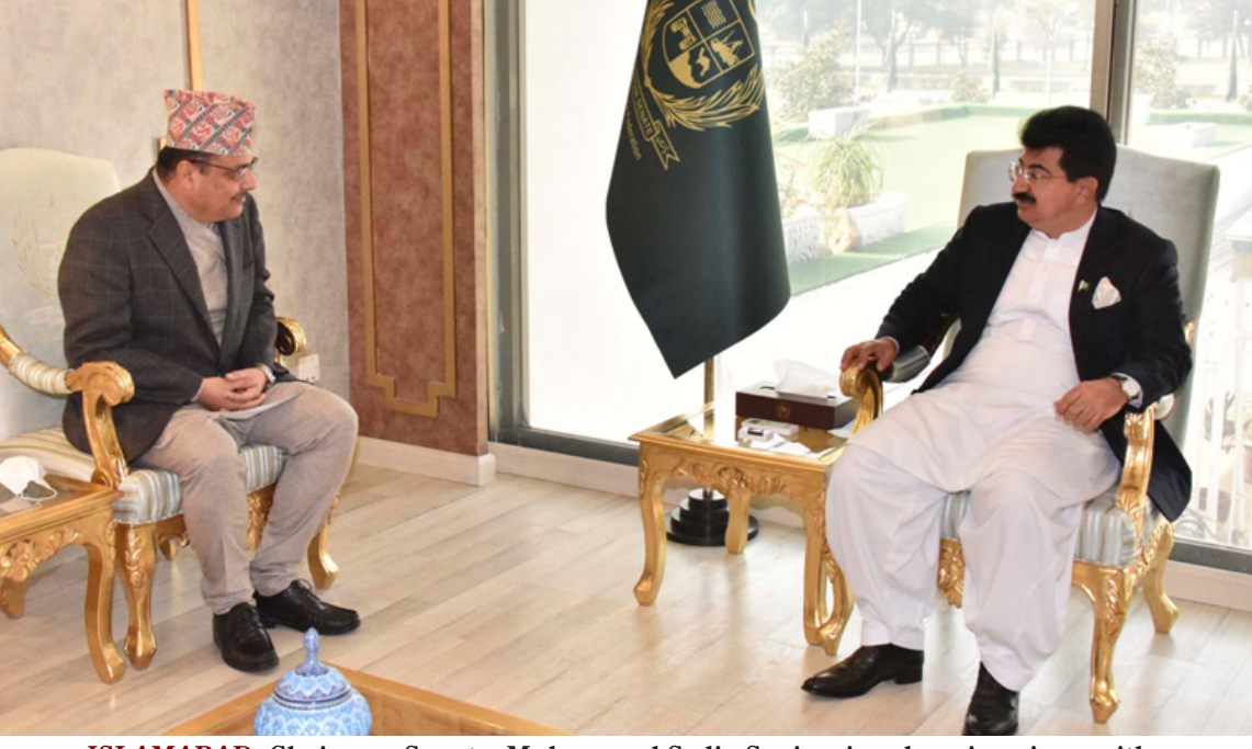
ISLAMABAD: Chairman Senate, Muhammad Sadiq Sanjrani exchanging views with Tapas Adhikari, ambassador of Nepal to Pakistan at parliament house.

The new measures build on those already in place, including a requirement for all overseas arrivals to provide proof of a negative coronavirus test no more than three days prior to departure. For contact tracing, all passengers are also required to provide contact information and travel history on arrival. Under the changes, passengers coming from so-called "red list" countries, where the virus continues to spread widely or where new potentially more transmissible variants have emerged, are also required to buy a "quarantine package" to cover both testing and hotel accommodation during the mandatory quarantine. The government has so far contracted at least 16 hotels with an initial 4,600 rooms. Other passengers coming from countries not included in the red list are allowed to self-isolate for 10 days. The 33 red list countries considered high risk include Portugal and the United Arab Emirates, as well as several countries in Africa and South America.