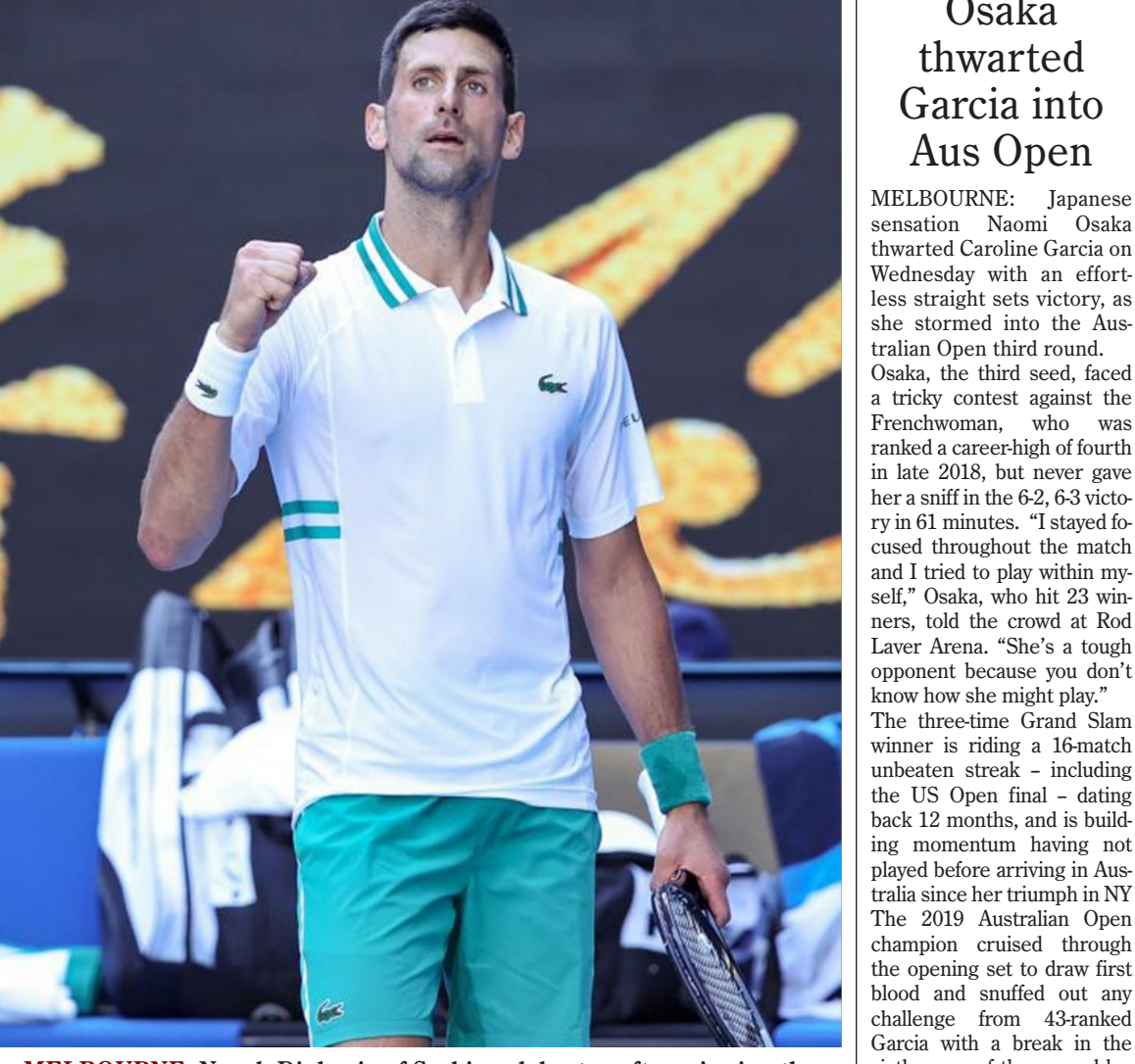
MELBOURNE: Novak Djokovic of Serbia celebrates after winning the men's singles second round match between Novak Djokovic of Serbia and Frances Tiafoe of the United States at the Australian Open.

politically charged environment possible' His comments were linked to an article referencing US Department of State comments that cast doubt over the transparency of China's cooperate with the WHO mission. Department of State spokesman Ned Price said the White House "clearly supports this investigation", but shared criticism that China concealed information. Asked if he thought China had fully cooperated with the WHO team, Price told reporters: "I think the jury's still out." Coronavirus has killed 2.3 million, infected close to 107 million people, and devastated the global economy. Questions over the handling of the initial outbreak in central China have sparked an intense diplomatic row between Washington and Beijing. In turn, China emphasised on Wednesday the Wuhan probe is just "one part" of an investigation into the origins of the coronavirus.