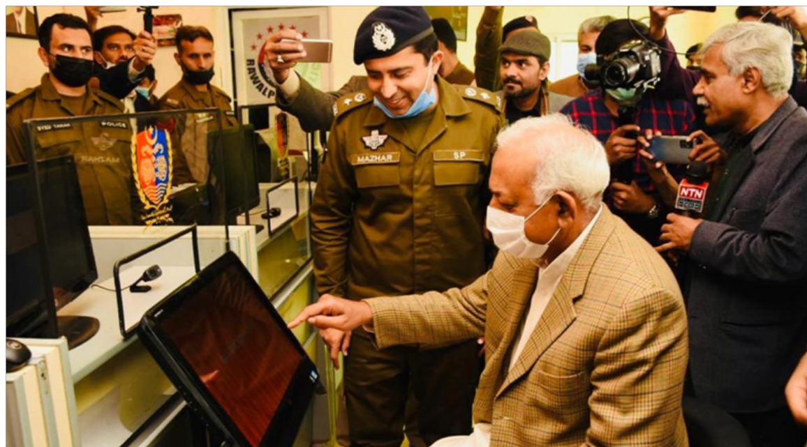
TAXILA: Federal Minister for Aviation Division Ghulam Sarwar Khan inaugurating the Facilitation Center at Taxila.

these events. The main aim of organizing spring festival is to provide entertainment to the citizens side by side telling them about the culture of different areas of the country. It has been decided to add Spring Festival in the calendar of CDA and the authority will organize this festival every year. The department of environment and others are finalizing the programs for the spring festival of this year. Teams of CDA are working day and night in this regard.