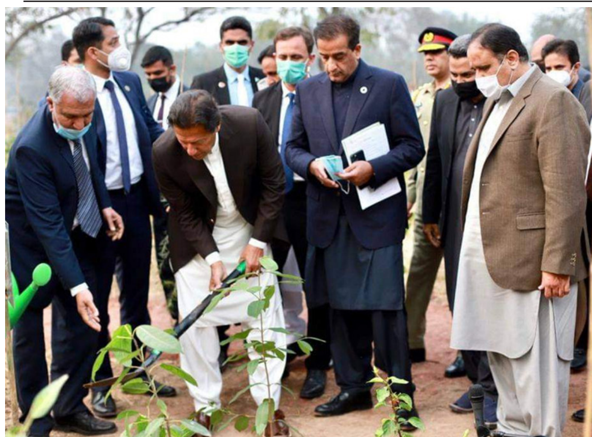
LAHORE: Prime Minister Imran Khan planting a sapling during the inauguration of Miyawaki Urban Forest at Gilani Park.