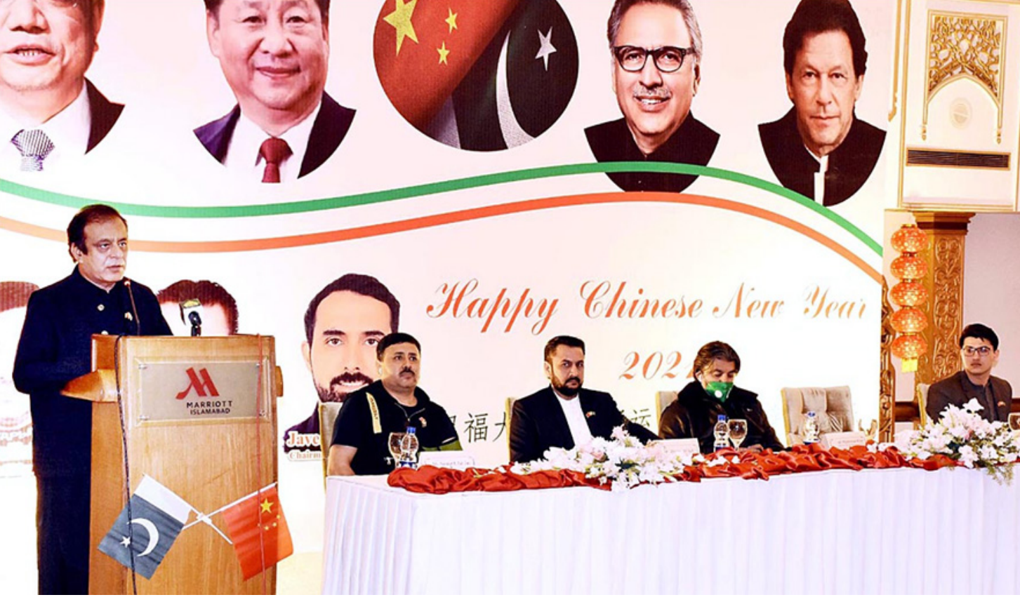
ISLAMABAD: Senator Shibli Faraz, Federal Minister for Information and Broadcasting addressing an event in connection with the celebration of Chinese New Year 2021. - APP

DNA ISLAMABAD: Pakistani Scholar, Zile Huma has made a history by developing world first 'Oxford Covid-19 Government Response Tracker' that would help measuring state response towards tackling the pandemic. The British high Commission in a Twitter message acknowledged her efforts to develop world first Oxford Covid-19 'Governor Response Tracker'. The tracker systematically collect the information on several different common Policy response that government have taken to respond to the Pandemic on 18 indicators such as school closures and travel restrictions. It now has data from more than 180 countries. According to statement "Fantastic to see her contribution to develop the first Oxford # Covid-19 Government Response Tracker that helps to compare policy response around the world volunteer". - APP