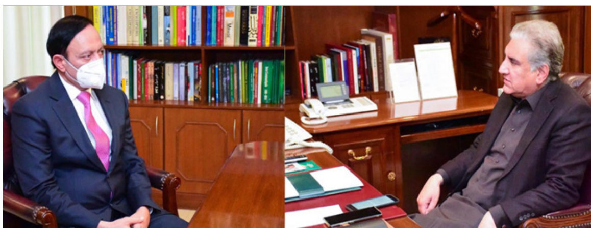
ISLAMABAD: Ambassador-designate of Pakistan to Libya, Maj. General (r) Rashad Javeed, called on foreign minister Makhdoom Shah Mahmood Qureshi at ministry of foreign affairs.

region is also expected to increase further. The Authority realized that the electricity consumers of Gwadar and Makran region should have an easily accessible judicial forum to file their complaints for redressal. Therefore, the Authority decided to establish its regional office at Gwadar to facilitate the electricity consumers of Gwadar and Makran region. The inauguration ceremony of NEPRA Regional Office, Gwadar was held today i.e. February 12, 2021 which was attended by NEPRA Authority, top officials of various Government Departments, QESCO and representatives of business and local communities.