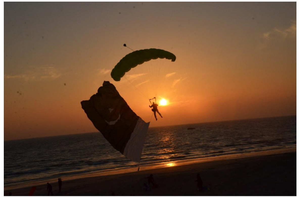
KARACHI: A paratrooper demonstrating his skills during multi-national AMAN-2021 Navy exercises.

Pakistan condemns killing of Turkish people