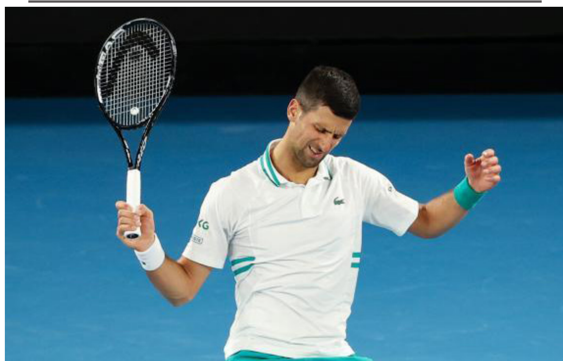
MELBOURNE: Novak Djokovic reacts during the men's singles 4th round match between Novak Djokovic of Serbia and Milos Raonic of Canada at the Australian Open 2021 tennis tournament.

New Zealand's greatest vulnerability has been at the border.