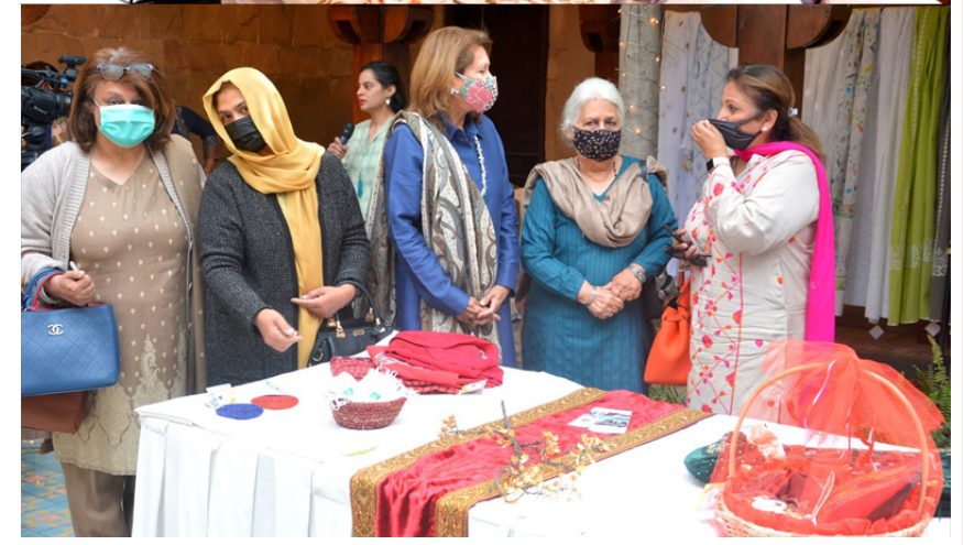
to promoting cultural and traditional heritage of Pakistan. (Full Coverage of the event in the March issue of CENTRELINE magazine)