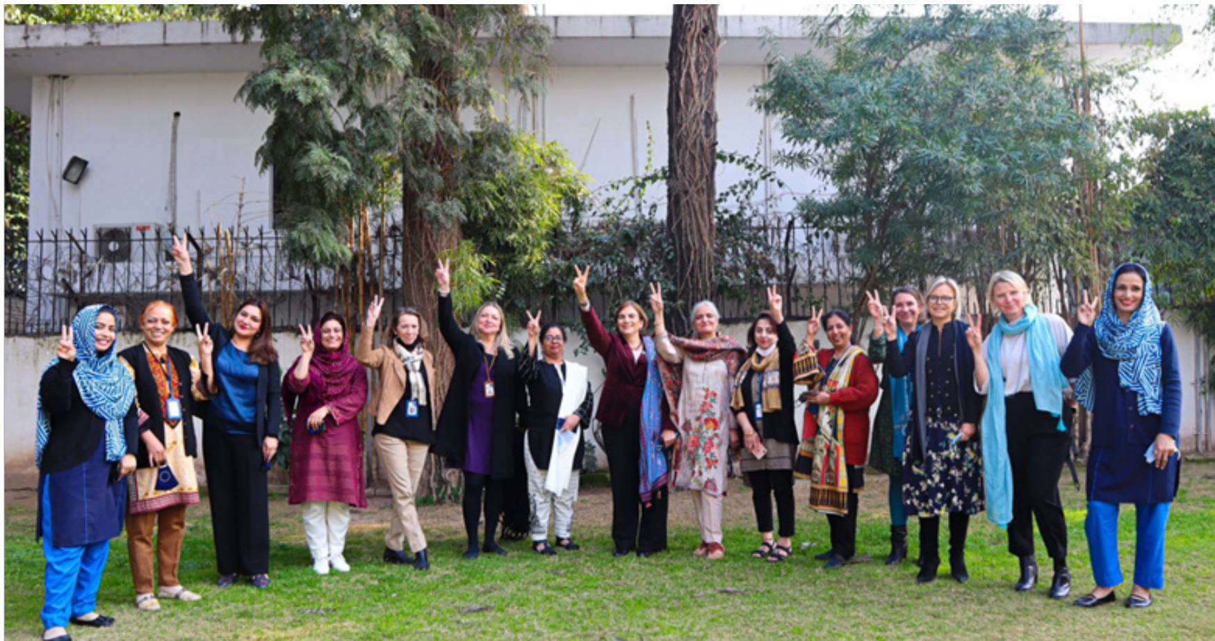
ISLAMABAD: Ambassador of European Union Androulla Kaminara making victory sign on the occasion of Women Day.