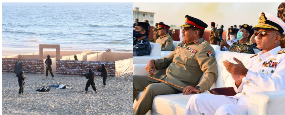
KARACHI: Chairman Joint Chiefs of Staff Committee along with Chief of the Naval Staff witnessing Maritime Counter Terrorism Demo held at PNS QASIM Manora in tandem with Multinational Maritime Exercise AMAN-21.

lated incident, two buses collided head on near Wahindo leaving 18 passengers injured. Moreover, a Coaster overturned in Narowal leaving eight people including women and children injured. It is to be mentioned here that the winter brings with it foggy mornings and poor visibility on roads in Punjab, Sindh and other parts of the country resulting in traffic accidents and disruption in flight and train schedules.