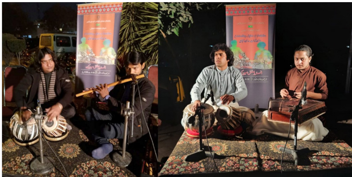
ISLAMABAD: The Capital Development Authority (CDA) has arranged various music sessions for the people of Islamabad. Musicians will perform in various markets in Islamabad on Friday, Saturday and Sunday from 6 pm to 8 pm. The music arrangements have been made in connection with the Jashn e Baharan festival.

placed in Jinnah Supermarket and Santoor in Kohsar Market. The authority will also hold a large-scale flower show in March to further enhance the colors of the Spring Festival, while instrumental music, theater, poetry and other events will be organized on the occasion, for which local, national and international artists and poets will be invited. CDA administration says that the purpose of holding such events is to highlight the culture and traditions of the citizens by providing affordable, quality and positive recreational facilities to the citizens.