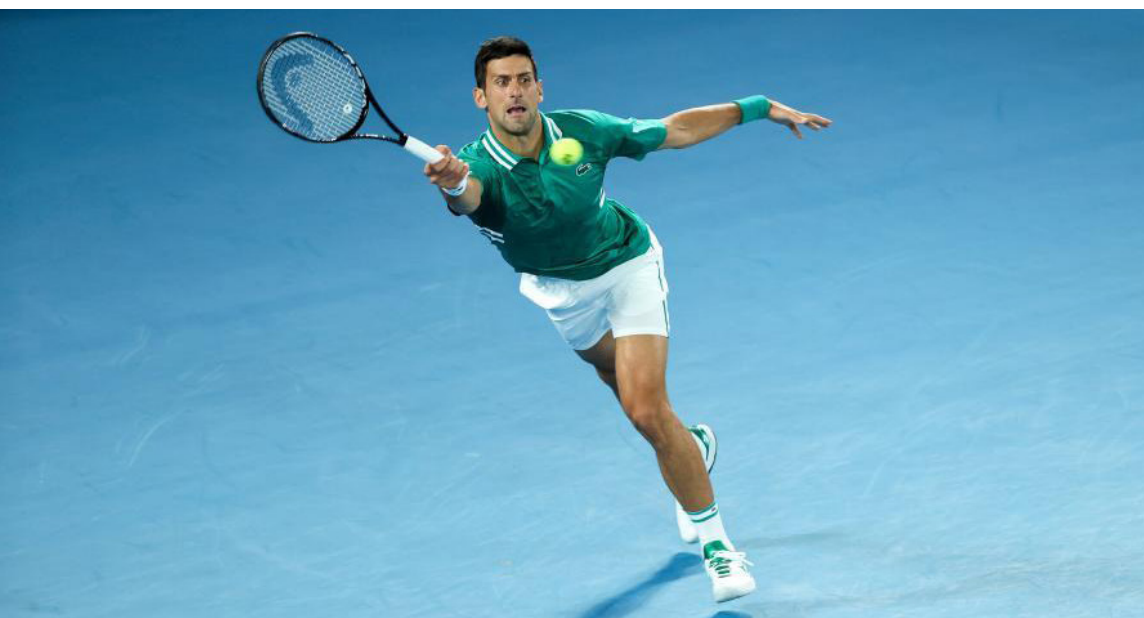
MELBOURNE: Novak Djokovic hits a return during the men's singles quarterfinal match between Novak Djokovic of Serbia and Alexander Zverev of Germany at the Australian Open in Melbourne Park, Melbourne.

In its more than 30-year terror campaign against Turkey, the PKK - listed as a terrorist organization by Turkey, the US, and EU - has been responsible for the deaths of 40,000 people, including women, children, and infants.