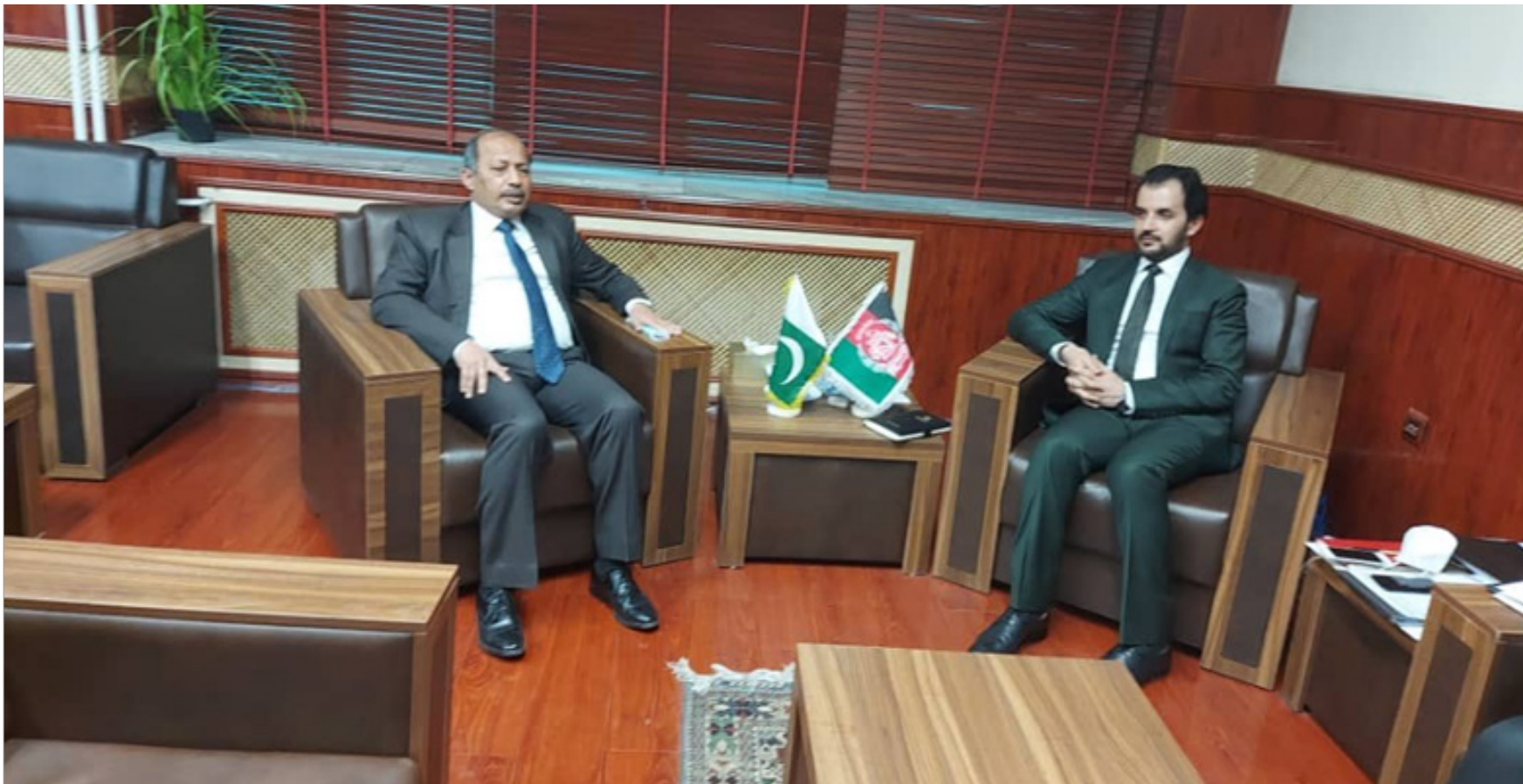
KABUL: Pakistani ambassador to Afghanistan, Mansoor Ahmad Khan called on Afghan minister of Public Health Dr. Waheed Majrooh and discussed for further strengthening cooperation between the two countries in the health sector. – DNA

"Against this background, the authorities have formulated a package of measures that strikes an appropriate balance between supporting the economy, ensuring debt sustainability, and advancing structural reforms," according to the statement. It noted that the country's fiscal strategy "remains anchored by the sustainable primary deficit of FY2021 budget and allows for higher-than-expected COVID-related and social spending to minimise the short-term impact on growth and the most vulnerable".