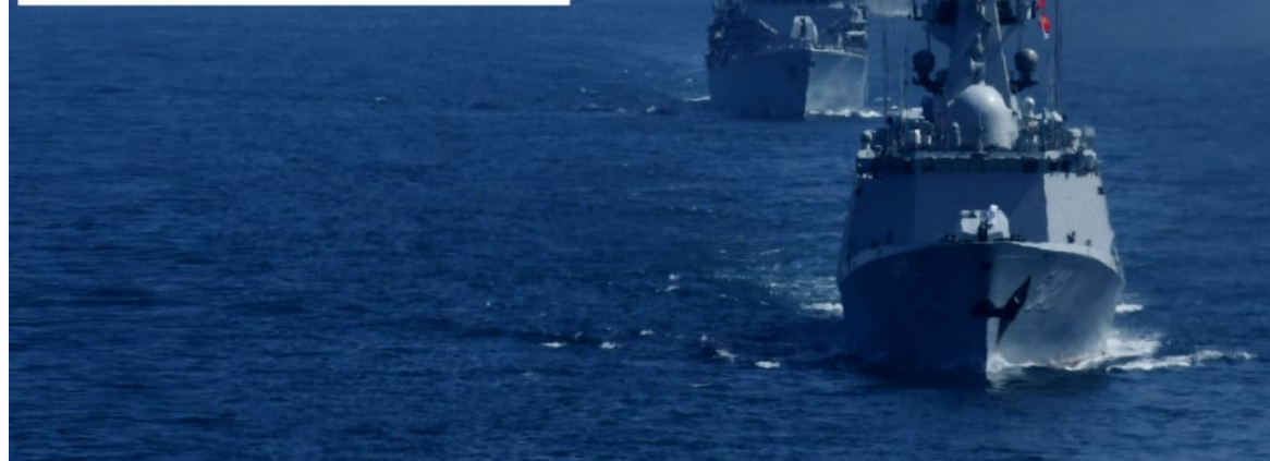
KARACHI: President Dr. Arif Alvi, CM Sindh, CJSC and Services Chiefs witnessing International Fleet Review on final day of Multinational Maritime Exercise AMAN-21.