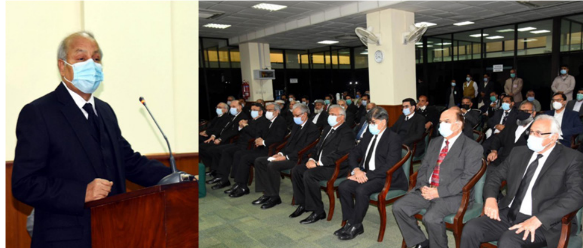
ISLAMABAD: Chief Justice of Pakistan, Justice Gulzar Ahmed addressing inauguration ceremony of case registration desk at Supreme court Islamabad. – DNA

HARIPUR: Federal Minister for Power Omer Ayub Khan on Tuesday said fruits of prudent policies of the incumbent government started producing their impacts as economic indicators moving towards positive sign. Addressing a public gathering here after the inauguration of Choi Mora Ghazan Sui Gas provision project worth Rs. 65.8 million, he said the government has introduced public friendly policies like Sehat Insaf Card which ensures the provision of treatment facilities to every citizen of Khayber Pakhtunkhwa. The minister said they initiated developmental projects including provision of Sui gas, electricity, water supply schemes, construction of schools, hospitals, basic health units, roads for upbrining living standards of people. Speaking on the occasion member provincial assembly Arshad Ayub said these areas remained ignored in past but focus of this government was to facilitate masses at their doorstep. – APP