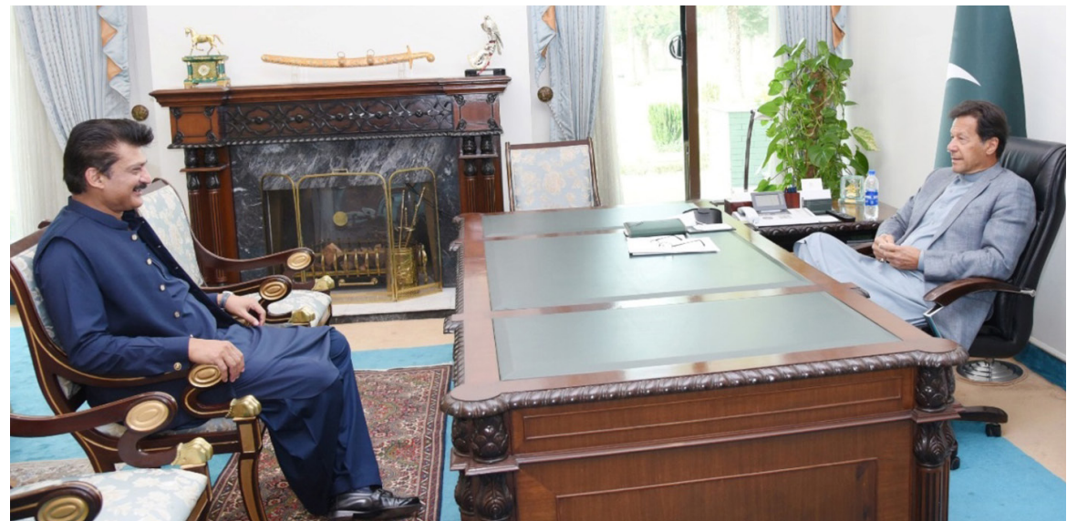
ISLAMABAD: Leader of the House in Senate, Senator Dr. Shahzad Waseem called on Prime Minister Imran Khan.

Ministry of Foreign Affairs of Pakistan has literally left the diplomats in the lurch. In such situation the Dean of the Diplomatic Corps should have taken the lead by raising the issue with the Ministry of Foreign Affairs but unfortunately the Dean of Diplomatic Corps is yet to act on this particular issue. The primary responsibility nevertheless rests with the Pakistan and government and Ministry of Foreign Affairs to address this issue as soon as possible because it involves reputation and image of the country. It may be mentioned here that Pakistani missions abroad have been facilitated by the respective governments in provision and administration of vaccine. Diplomats based in Pakistan expect similar arrangements here as well.