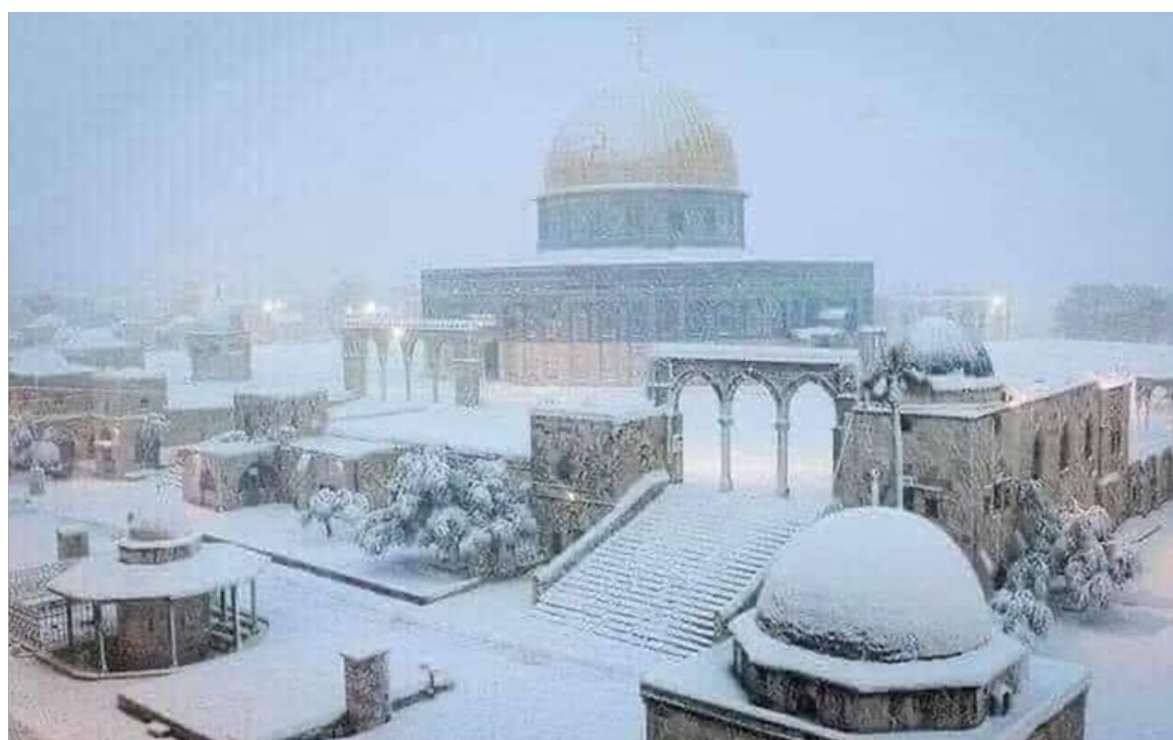
JERUSALEM: This morning, the Al-Aqsa Mosque and the Dome of the Rock is covered in a layer of snow in the Holy of Holies, Al-Quds Palestine.