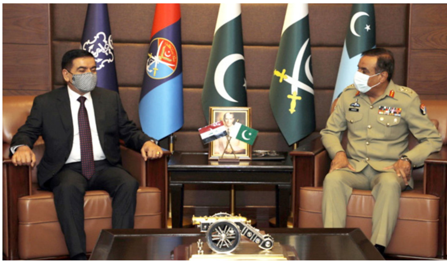
RAWALPINDI: Juma Enad Sadoon Khattab Al Jibori, Defence Minister of Iraq calls on General Nadeem Raza, Chairman Joint Chiefs of Staff Committee.

ISLAMABAD: Pakistan's Maritime Security Agency has arrested 17 Indian fishermen and impounded their three boats for violating the territorial waters of Pakistan. The Maritime Security Agency's ship spotted the Indian boats in the eastern maritime zone during the routine patrol. According to a spokesman of the Maritime Security Agency, the Indian fishermen were arrested for crossing the sea frontiers of Pakistan. "There penetration deep into Pakistani waters is a matter of concern for us," he added. He said the Indian fishermen have been handed over to the police for further legal action.