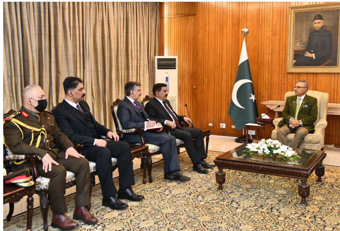
ISLAMABAD: A delegation of Iraqi Defence officials led by Defence Minister of Iraq, Jumma Enad Saadoon Al-Jibori called on President Dr Arif Alvi.