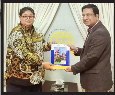
ISLAMABAD: Diplomatic Staff from the Embassy of Indonesia met with the Management of CGSS. It was decided that the Embassy of Indonesia will facilitate in connecting different institutions and think tanks of Indonesia. The concept of Regional Integration Center, Punjab University, Lahore was also introduced during the meeting. The diplomatic staff showed keen interest in various initiatives by Regional Integration Center & vowed to show full support and contribution from Indonesia as well.

ISLAMABAD: Utility Stores Corporation of Pakistan (USC) is not selling any substandard product at its all outlets. This was stated by a source in Utility Stores, while responding to queries raised by Public Accounts Committee over the sale of edible ghee and cooking oil. The source further states that, Utility Stores have pre-qualified firms/vendors, who provide all enlisted products certified by Pakistan Standards and Quality Control Authority (PSQCA) at its shelves. Also, USC follows a rigorous registration process for the products' registration. That's why, the available products at USC are of high quality as per food standards. The source maintained that, USC, since its inception is providing high quality subsidized products to masses. That is why, people of Pakistan has an undaunted trust over the products of USC.