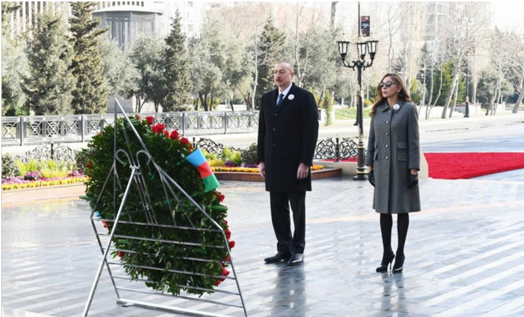
BAKU: Azerbaijan President Ilham Aliyev and First Lady Mehriban Aliyeva visited the Khojaly genocide memorial in Baku's Khatayi district to commemorate the victims of the genocide.

According to the report, "non-essential travel needs to be restricted". "We welcome the adoption of the two Council recommendations on travel within, and into, the EU, according to which restrictions can be introduced in accordance with the principles of proportionality and non-discrimination and taking into account the specific situation of cross-border communities," the European Council said. The EU pledged to speed up the issuance of permits for production and distribution of vaccines. "We need to urgently accelerate the authorization, production and distribution of vaccines, as well as vaccination," the statement said. The Council also supports "the additional efforts by the Commission to work with industry and Member States to increase the capacity of current vaccine production as well as to adjust vaccines to the new variants as necessary."