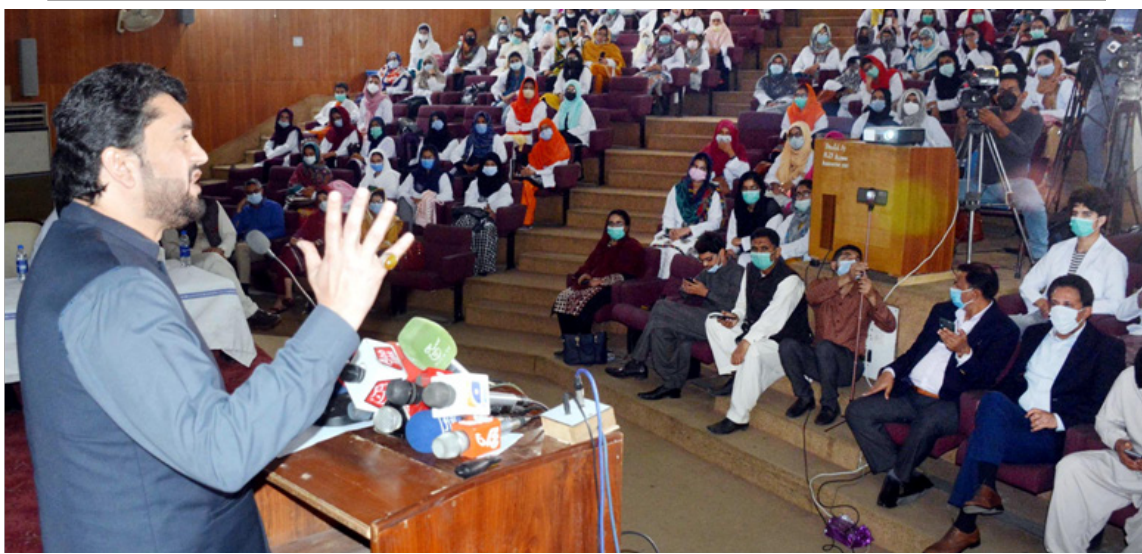
MULTAN: Chairman parliamentary committee on Kashmir, Shehryar Khan Afridi addressing a seminar arranged by Nishtar Medical College & University.