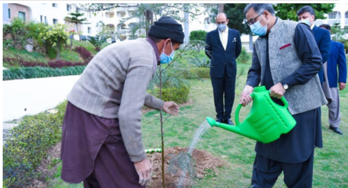
ISLAMABAD, Feb 26 (APP): Foreign Secretary Sohail Mahmood planting a sapling at the premises of Ministry of Foreign Affairs as part of the Spring Tree Plantation Campaign 2021.