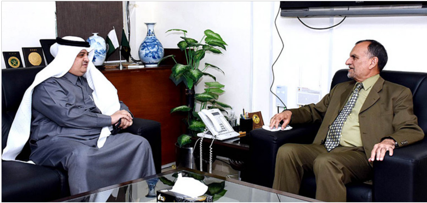
ISLAMABAD: Nawaf Saeed Al Maliki Ambassador of Saudi Arabia met with His Excellency the Minister of Federal Railways, Senator Azam Khan Swati. During the meeting, cordial conversations were exchanged and issues of common interest between the two brotherly countries were discussed. - DNA

It further said that the political parties, candidates, voters and election agents will not indulge in any kind of corrupt or illegal practices as defined in chapter-X of the Elections Act 2017. The Election Commission said that all members will be banned from carrying mobile phones in the polling booth. Ballot papers cannot be photographed. The president and governors will not run campaign for the Senate election. Casting vote in exchange for gifts or to intimidate for votes will be prohibited. The successful candidate will submit the details of election expenses to the Returning Officer within five days.