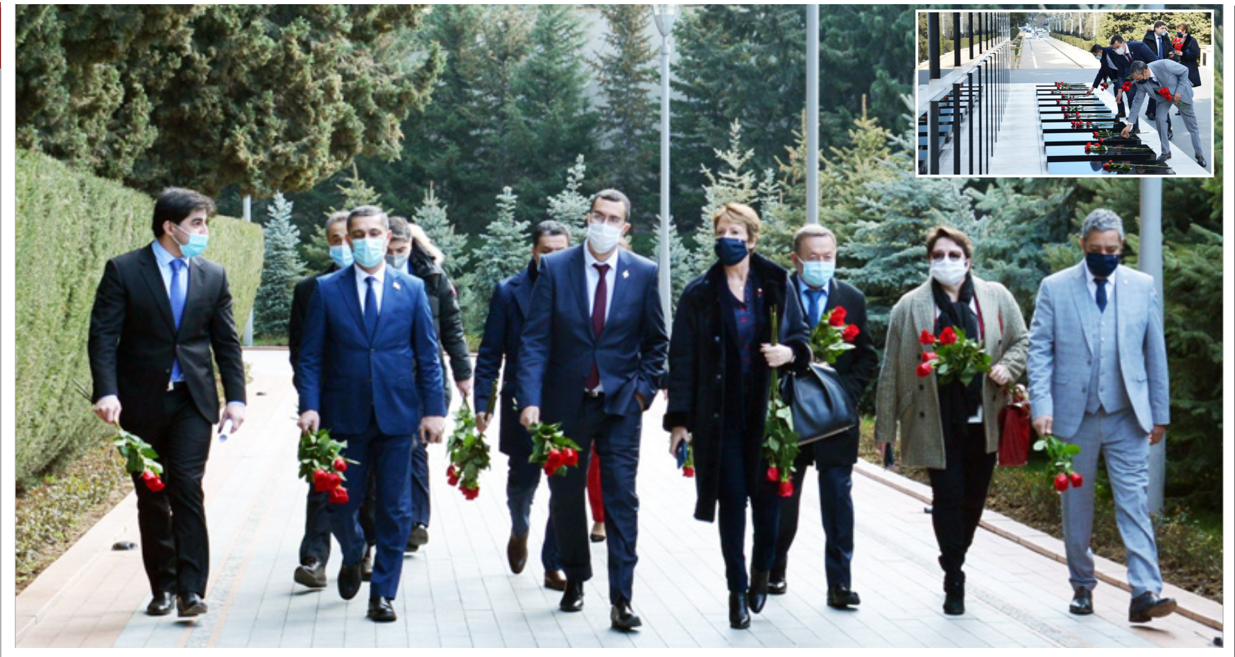
BAKU: Delegation of French National Assembly is on visit in Azerbaijan. Members of the delegation visited Alley of Martyrs and also visited the grave of national leader Heydar Alivey, laid flowers in front of the monument. - DNA

liberated territories. According to him, in total, there are nearly 17,543 kilometres of roads and 1,316 bridges on the agency's balance. "Of the total number of highways, the share of countrywide-importance roads is 4,385 kilometres, and of local importance - about 13,158 kilometres," added the source. Kalbajar was among seven Azerbaijani regions that got occupied by the Armenian armed forces during the first Karabakh war.