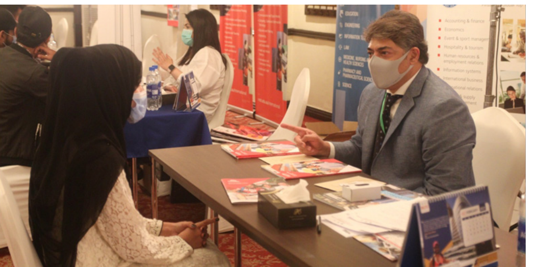
facilitates the enrolment of International students at these Universities / Institutions. Since 2002, AEO Pa-

LAHORE: With world gradually moving back to normal, the day when international borders of top study destinations of the world will open for foreign students, is coming closer. It is time that the students gear up and start preparing themselves to realize their dreams to study at top ranked international universities. With over 5000 alumni and 200,000+ IELTS registrations, AEO Pakistan over the past two decades has established itself as Australian & Global Education Specialists, the most trusted IELTS Official Test Centre and now the official OET Test Centre in Pakistan. AEO Pakistan operates as the official Liaison office for over 40 leading Australian Universities/Institutions and