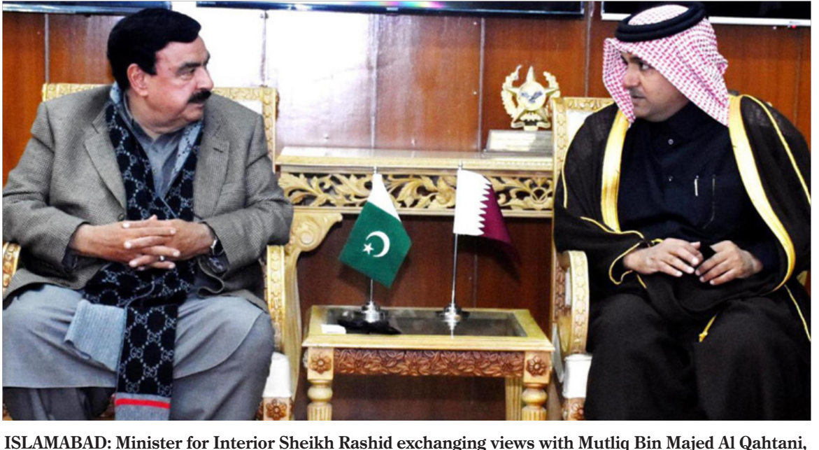
Special Envoy of Qatar on Combating Terrorism and Mediation in Conflict Resolution. - DNA

Similarly, Sri Lanka is an important market for textile products, machinery, and pharmaceuticals along with other products that Pakistan records significant exports. He said therefore there exists a huge trade potential between both countries if the FTA is utilised properly he remarked.