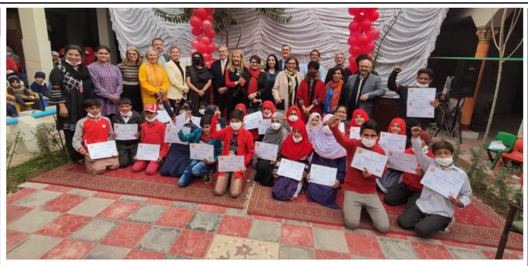
ISLAMABAD: EU ambassador to Pakistan Androulla Kaminara interacted with students & presented prizes for activities at conclusion of KKAWF drug awareness week at Mashal Model School Islamabad.

As per the break-up, the company detected 3,086 MMCF gas theft of Rs 2,296 million in 2018-19, around 2,028 MMCF gas of Rs 1,930 million in 2019-20 and 404 MMCF of Rs 472 million in 2020-21 (as of September). Similarly, the SSGC noted that the gas volume of 913.84 MMCF amounting to Rs 930.63 million had been stolen from its network during a three-year period. The company faced the theft of 179.83 MMCF gas worth Rs 217.65 million in 2019-20, around 289.53 MMCF of Rs 303.77 million in 2018-19 and 444.48 MMCF of Rs409.21 million in 2017-18. - APP