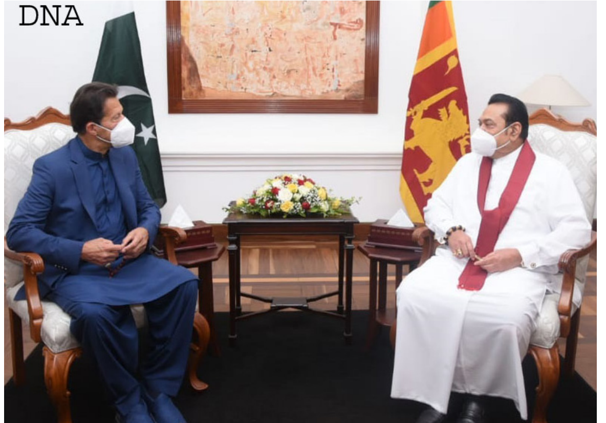
COLOMBO: PM Imran Khan in a meeting with Sri Lankan Prime Minister Mahinda.

ISLAMABAD: The national tally on Tuesday of total active COVID-19 cases recorded 24,483 with 1,050 more people tested positive for the deadly virus and 752 people recovered from the disease during the last 24 hours. Forty one corona patients have died during past 24 hours, 38 of them were under treatment in hospital and three in their respective quarantines and homes on Monday, according to the latest update issued by the National command and Operation Centre (NCO).