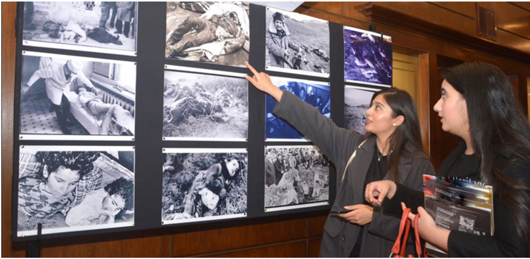
ISLAMABAD: Visitors taking interest in pictures on the occasion of a seminar arranged by the Azerbaijan embassy to highlight the Khojaly massacre.

ISLAMABAD: The Ministry of National Health Services has expressed dissatisfaction over the pace of vaccination of frontline health workers against the coronavirus in Islamabad. In a letter to the capital's public and private hospitals as well as labs, the ministry pointed out that the vaccination pace is slow as less than half of the total registered health workers have been inoculated against the virus as yet. It lamented that the vaccination pace didn't pick up despite its directives in this regard. A total of 8,000 health workers got themselves registered for Covid-19 vaccination in the first phase but a mere 3,200 have been administered jabs, even though vaccination counters remain operational throughout the week in Islamabad. The ministry stressed that the vaccination of health workers is the need of the hour, advising medics and paramedical staff working at health facilities of the capital to get jabs on a priority basis. It said the second phase that will see citizens aged 65 and above getting the vaccine will start next month.