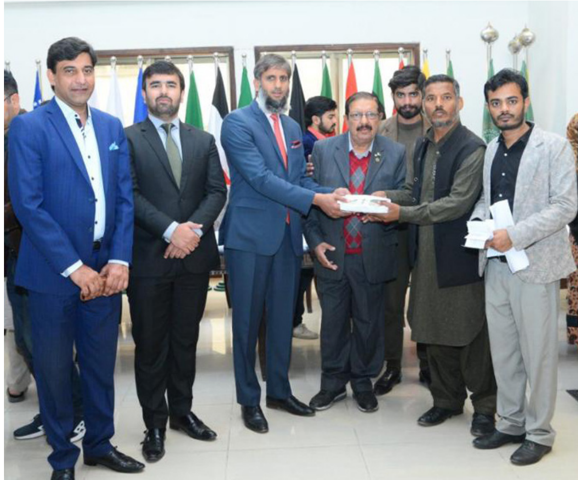
RAWALPINDI: Distribution of spectacles to the remaining patients of eye camp was observed today at RCCI. 200 spectacles were delivered.