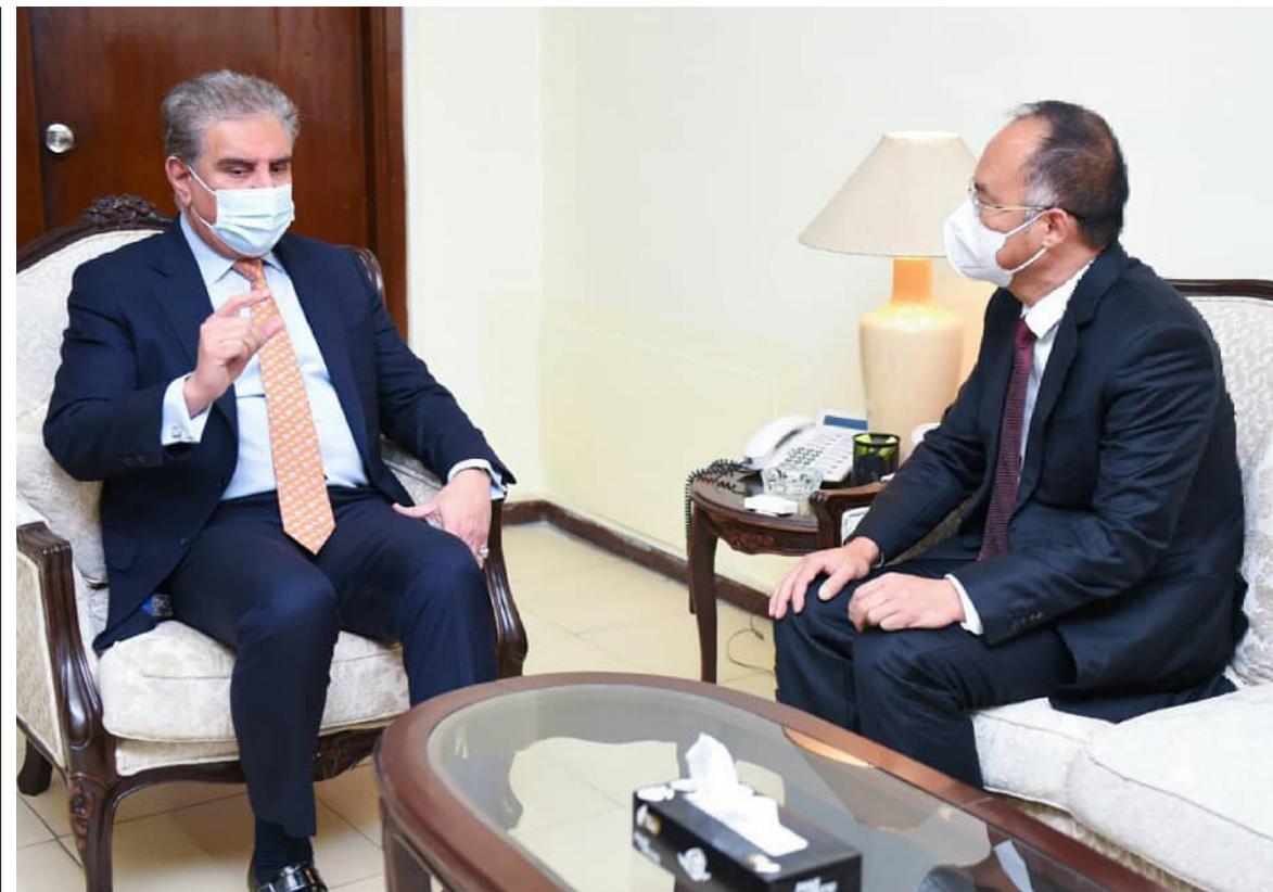
ISLAMABAD: Ambassador of China, Nong Rong in a meeting with Foreign Minister Shah Mehmood Qureshi. - DNA