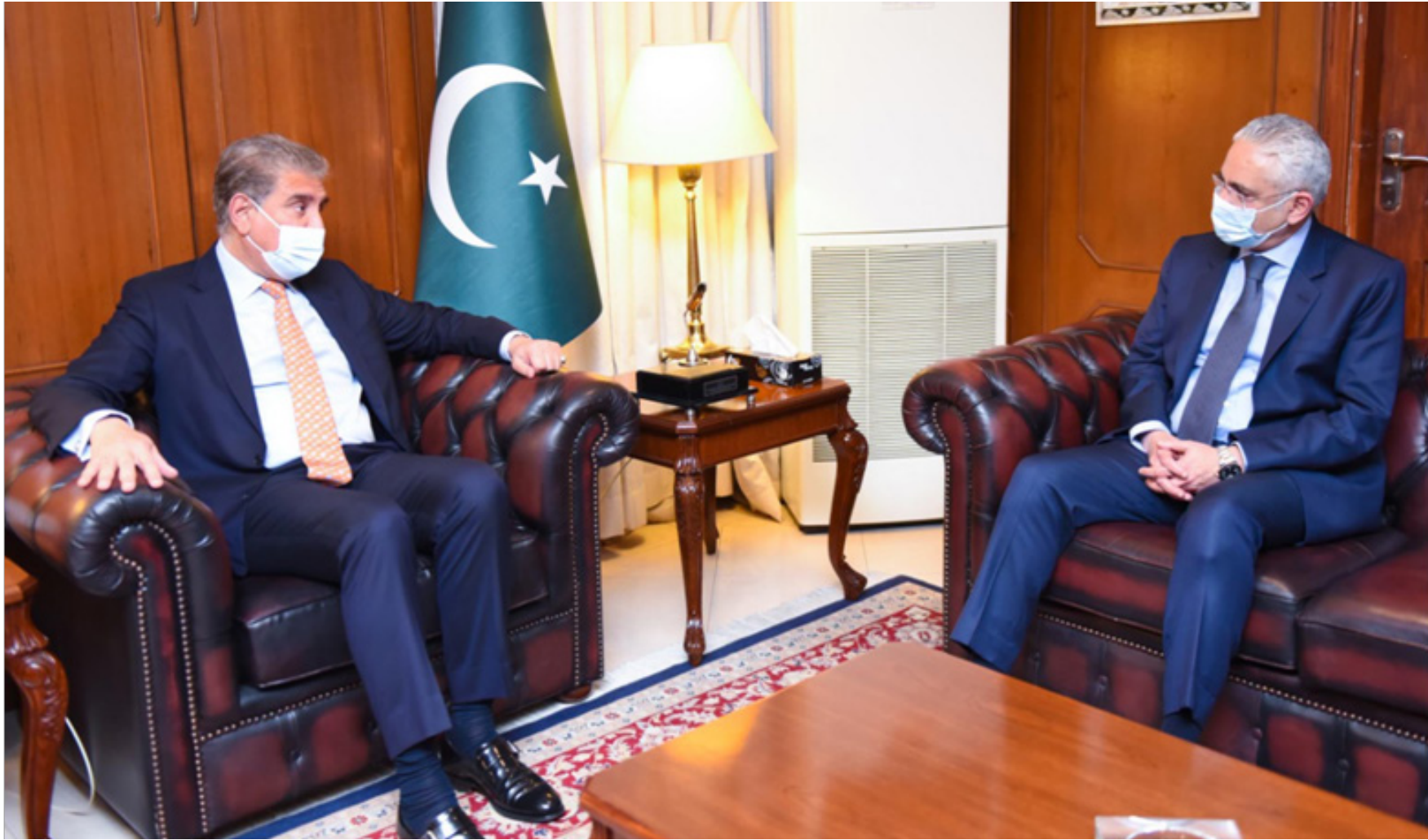
ISLAMABAD: Tarek Dahroug, ambassador of Egypt to Pakistan calls on foreign minister, Makhdoom Shah Mahmood Quraishi at ministry of foreign affairs.