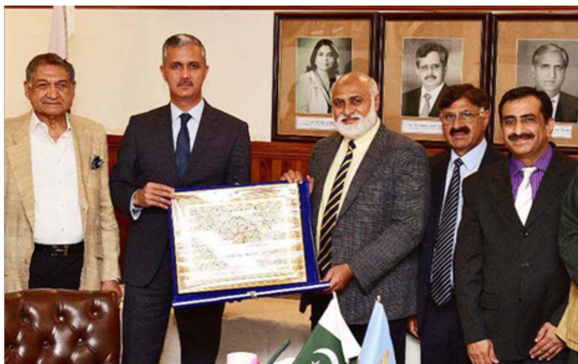
LAHORE: Vice Chancellor Punjab University presenting souvenir to ambassador of Tajikistan.

italising on opportunities brought by CPEC, to alleviate poverty from its central and peripheral areas. The KP is emerging as a strong base for a potential Chinese poverty alleviation programme, as hinted by the International Poverty Reduction Centre in China (IPRCC) and Chinese Ambassador to Pakistan Nong Rong. The KP government is not only developing two major Special Economic Zones (SEZs) under CPEC framework, but also taking measures to rehabilitate the existing industrial estates devastated due to decades of neglect.