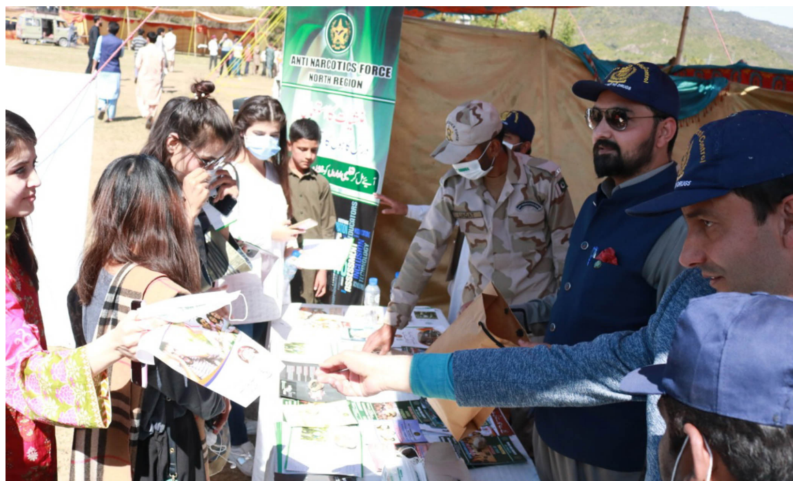
ISLAMABAD: Ministry of Narcotics Control, under its Drug Demand Reduction campaign conducted a Drugs Awareness programme in Quaid-e-Azam University.

and environmental dimensions of development. The SDGs' agenda for human dignity, and to leave no one behind", is certainly in line with the principles and objectives of development from the Islamic perspective.