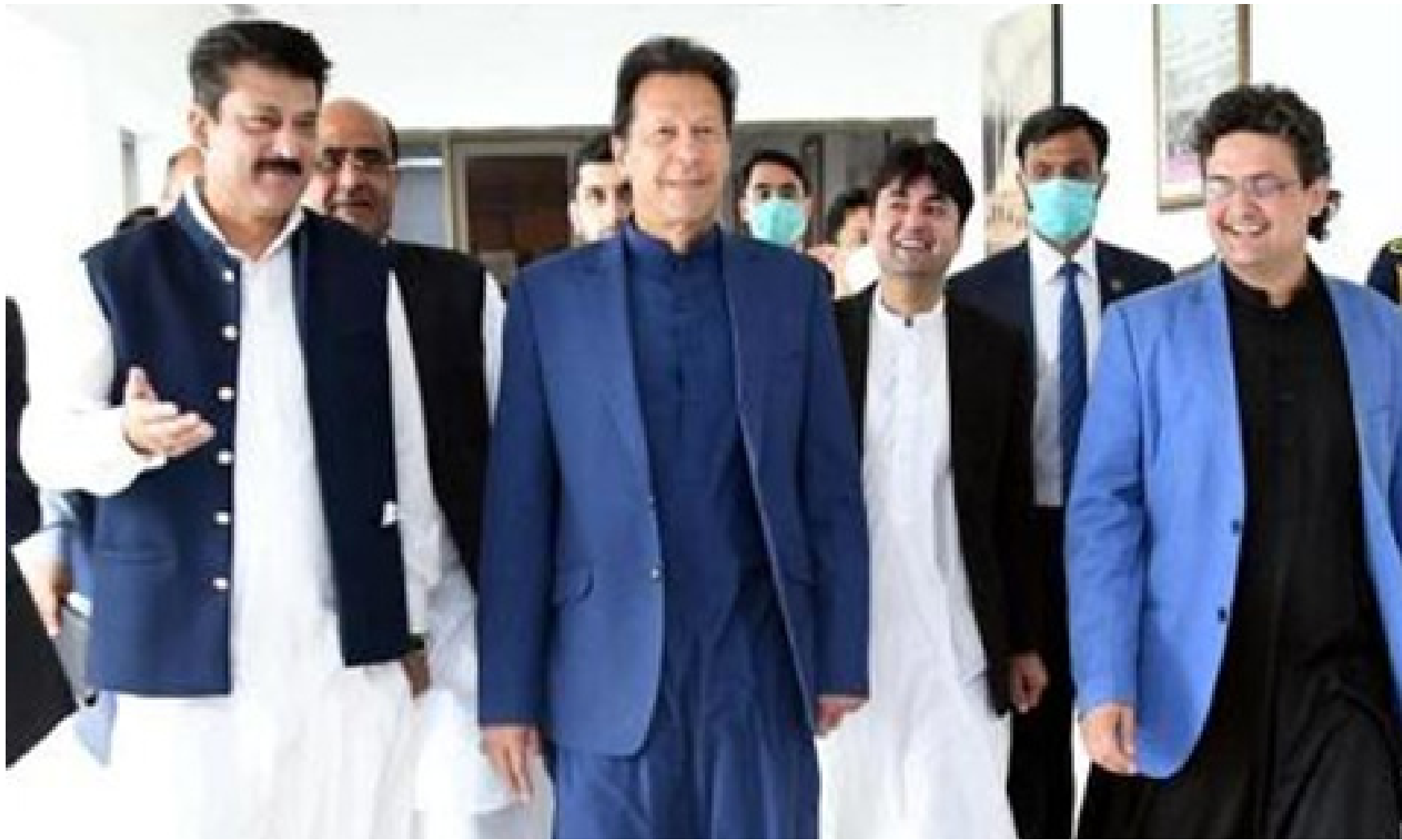
ISLAMABAD: Islamabad Senator Shahzad Waseem with Prime Minister Imran Khan at the Parliament House soon after casting of his vote for senate election.