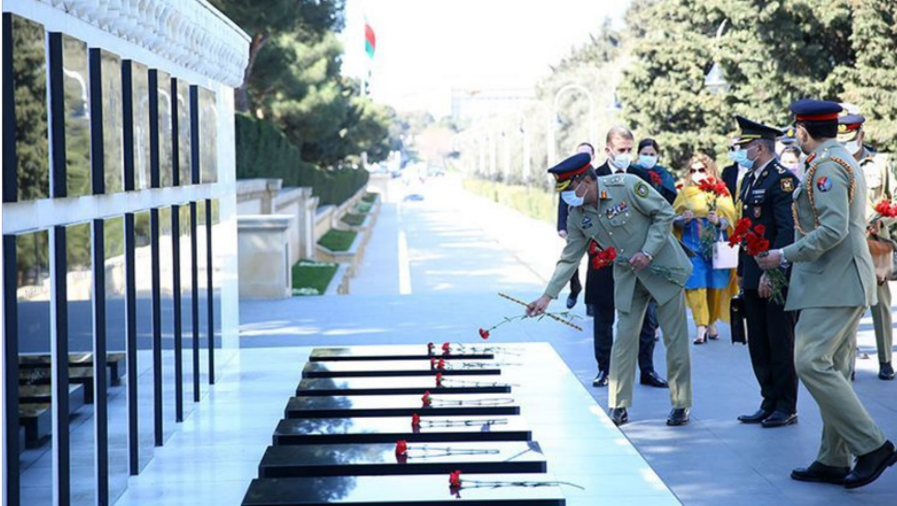
BAKU: General Nadeem Raza, Chairman joint chiefs of staff committee (CJSC) visited the Alley of Shehids (Martyrs), where they laid wreaths and flowers at the graves of the heroic sons of the Azerbaijan.

"They [sanctions] are nothing but interference in the internal affairs of Russia. In general, we can only express our regret that our opponents, in this case, resort to such methods, which have an absolutely destructive impact on bilateral relations. "We consider any such restrictions absolutely unacceptable, because they significantly harm the relations that are already in a deplorable state, in this case, relations with the United States of America and relations with the European Union," he said. Peskov also pointed out that sanctions against law enforcement chiefs simply repeat the existing Russian legislation, prohibiting them from having accounts and property abroad.