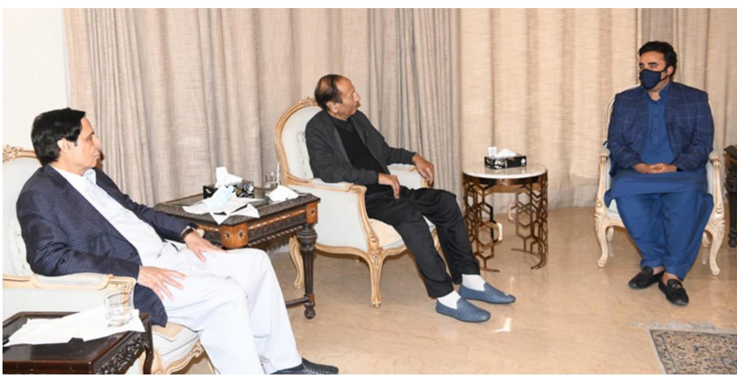
LAHORE: Chairman PPP Bilawal Bhutto Zardari calls on President, PML-Q, former PM Chaudhry Shujaat Hussain and speaker Punjab assembly, Chaudhry Pervaiz.

Following the decision agreed at Copenhagen in 1911, International Women's Day was honoured the first time in Austria, Denmark, Germany and Switzerland on March 19 in which more than one million women and men attended allies campaigning for women's rights to work and vote.