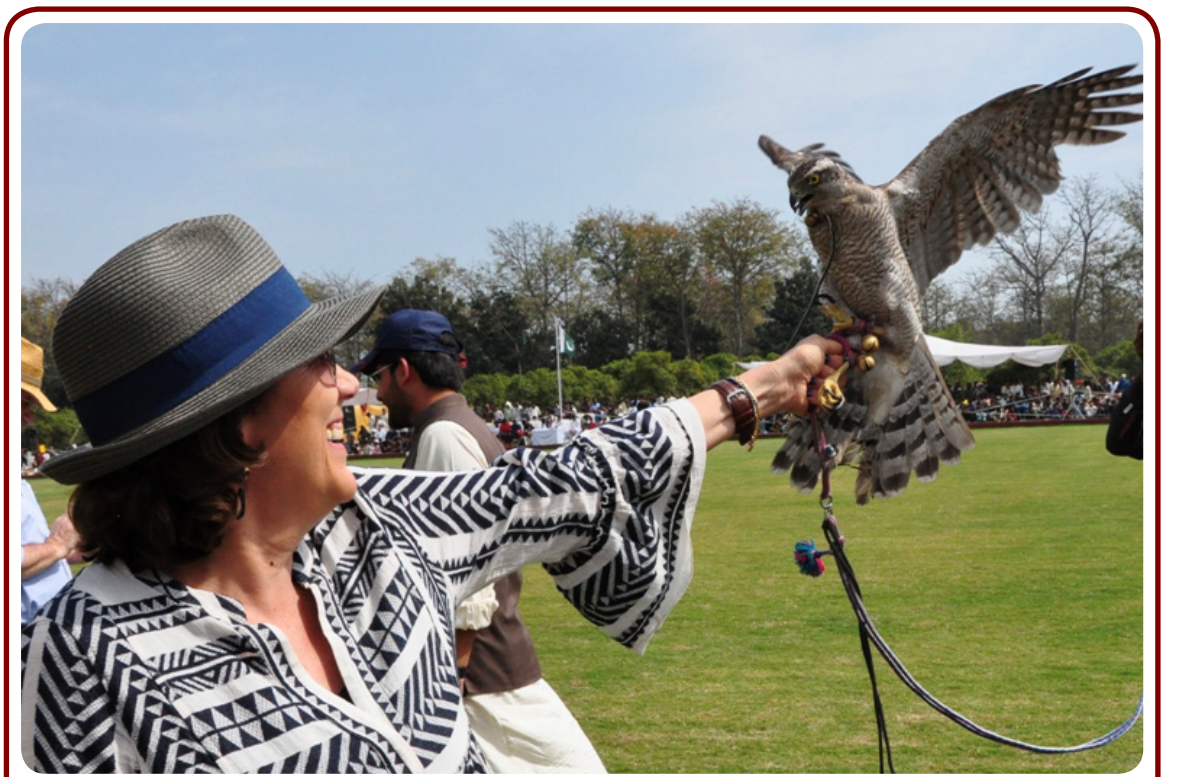
ISLAMABAD: Ambassador of European Union holding a Falcon during a function in the Capital. She finds these Falcons amazing.