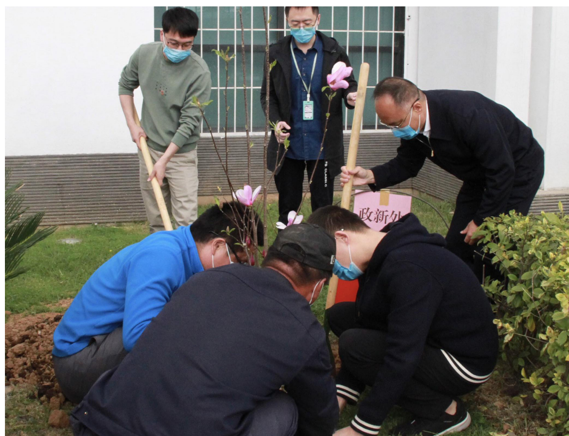
ISLAMABAD: Chinese diplomats planting a tree at the Embassy premises as part of Pakistan gov't drive to plant 10 bn trees. The tree shows strong bonds of Pakistan-China friendship.