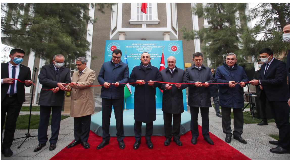
SAMARKAND: Turkish foreign minister Mevlüt Çavuşoğlu along with his Uzbek counterpart inaugurating Turkish consulate at Samarkand. - DNA

On Sunday, official data showed that electronics exports rose 54.1 percent, while textiles including masks rose 50.2 percent. -APP