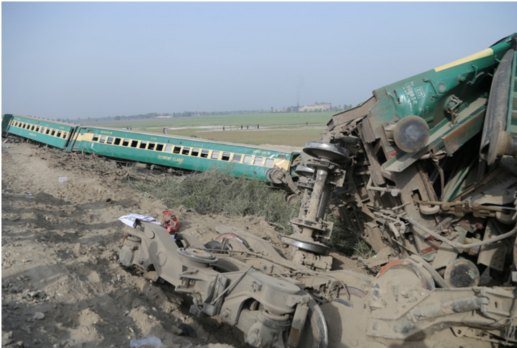
HYDERABAD: A view of Karachi Express that derailed near Panu Aqil. A woman was killed in this accident.

ISLAMABAD: Special Assistant to Prime Minister on Accountability Barrister Shahzad Akbar on Sunday said that the nation has given mandate to Pakistan Tehreek e Insaaf (PTI) government for eliminating corruption from the society. The ruling party was carrying out accountability process against the corrupt elements without any discrimination, he said in an interview with PTV. He said the people would never come out from their houses for all those politicians who found involved in looting national money. Commenting on recent Senate elections, Barrister Shahzad Akbar said the government has made efforts for holding Senate elections in a transparent manner. In a reply to a question about upset in results of Senate elections, he said leaders of Pakistan Peoples Party had used unfair mechanism to win seat for Yusuf Raza Gilani. Appreciating the leadership of ruling party, he said Prime Minister Imran Khan believed in moral values rather in politics of powers. He made it clear that PTI government would continue struggle to root out corruption from the society.