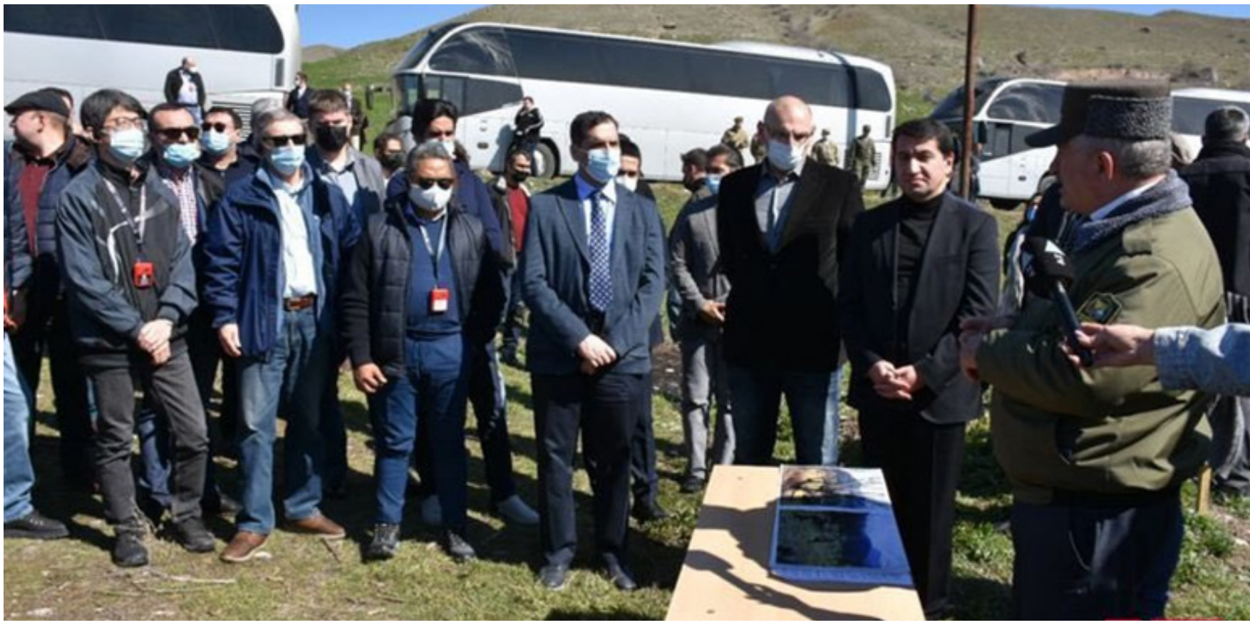
BAKU: Foreign diplomats being briefed about Armenian aggression during their visit to recently liberated territories.

Following Joe Biden's US presidential election victory in November, the US, the European parties to the deal - France, Germany and Britain - and Tehran have been trying to salvage the accord.