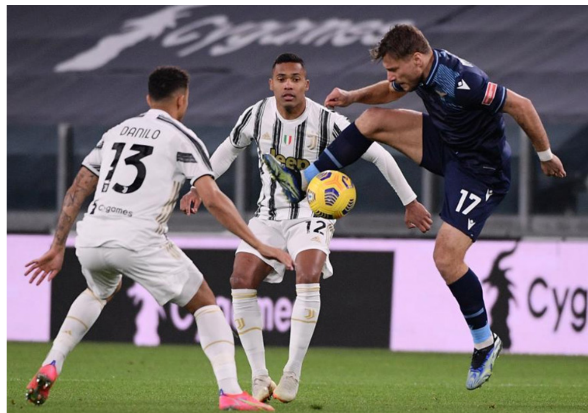
TURIN: Danilo and Alex Sandro of Juventus vie with Ciro Immobile of Lazio during a serie A football match between FC Juventus and Lazio in Turin.

Djokovic made his top 100 debut in July 2005, just weeks after Nadal had won his first Roland Garros. He was top 50 in June 2006, top 20 for the first time in October 2006 and top 10 by March 2007. He first became world number one at the age of 24 on July 4, 2011, the day after winning Wimbledon for the first time, beating Nadal in the final.