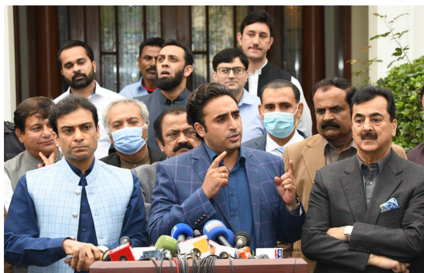
LAHORE: Chairman Pakistan Peoples party (PPP) Bilawal Bhutto Zardari, Opposition leader Punjab Hamza Shahbaz addressing a press conference along with other leaders.