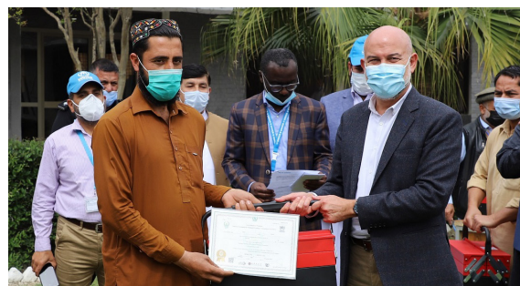
Ambassador of Spain handing over a technical and vocational training certificate to an Afghan refugee at a NAVTTC institute.