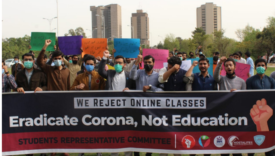
ISLAMABAD: Students of different institutions are protesting against online classes and closure of educational institutions in front of national press club Islamabad.

for Science & Technology Mr. Fawad Chaudhry which could be utilized for the collective benefits of the country and community. He also requested office bearers of the local chapter of the IEEE to give its suggestions in writing so that proper steps could be taken to ensure speedy implementation on the same.