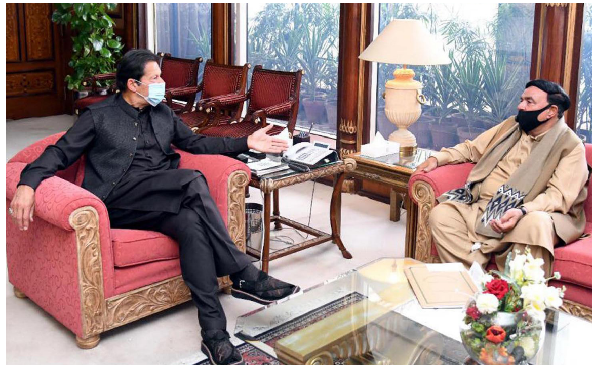
ISLAMABAD: Interior Minister Shaikh Rashid Ahmed briefing Prime Minister Imran Khan on his recent visit to Qatar.