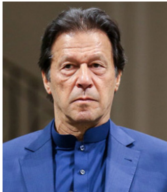
Imran Khan said big sector of economy including tobacco, cement and sugar were witnessing

He said FBR had been making efforts for last 15 years to implement the Track & Trace (T&T) System, however regretted that the move was "sabotaged" every time. Prime Minister Imran Khan addresses the meeting of federal cabinet on March 16.