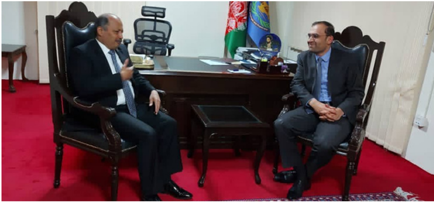
KABUL: Pakistan ambassador to Afghanistan calls on Noor Rahman Akhlaqi, Afghan minister of refugee return (MORR). Minister appreciated Pakistan for hosting millions of Afghan refugees. Both discussed need for close engagement on plans for dignified return and reintegration of refugees in Afghanistan. - DNA

technical cooperation. Muhammad Hammad Azhar received an invitation from Petr Parkhomchik, the Minister of Industry of Belarus, to visit Belarus in order to get acquainted with leading Belarusian industrial companies and to discuss issues of strengthening industrial cooperation between the countries on the topics of mutual interest.