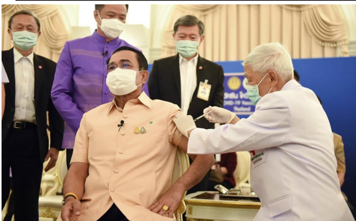
BANGKOK: Thailand's Prime Minister has received a shot of the COVID-19 vaccine manufactured by AstraZeneca. - DNA

istering China's Sinovac vaccine, with millions more imported doses expected in the coming months. But it was expected to add the Oxford/AstraZeneca injection to its vaccine options on Friday, before health authorities abruptly suspended it as a precaution. By Monday, it had cleared its use after the World Health Organization, the European Medicines Agency and many countries, including Britain and Canada, declared it safe for use. "Today, we will start injections on another vaccine. I think it will create confidence for people to get the vaccine," Thai premier Prayut Chan-O-Cha said.