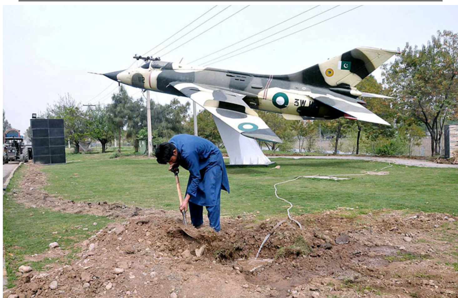
ISLAMABAD: CDA worker busy in routine work at roadside greenbelt along 9th Avenue. — APP

He informed that the squad conducted operations to check over speeding through speed cameras on main roads particularly old Airport Road, New Airport Road and in other sectors including Taxila, Kalar Syedan and Meharabad. The CTO said that CTP had formed a special camera squad to check over speeding on various roads and the step had helped controlling fatal road accidents considerably in the district. — APP