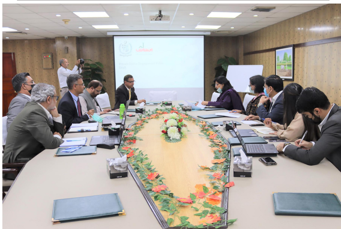
ISLAMABAD: Dr. Sania Nishtar chairs final meeting on the Ehsaas Private Sector Engagement Policy at Poverty Alleviation and Social Safety Division.