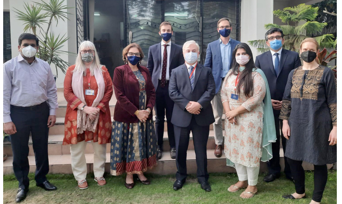
ISLAMABAD: Ambassador of European Union Androulla Kaminara and others posing for picture after signing ceremony.