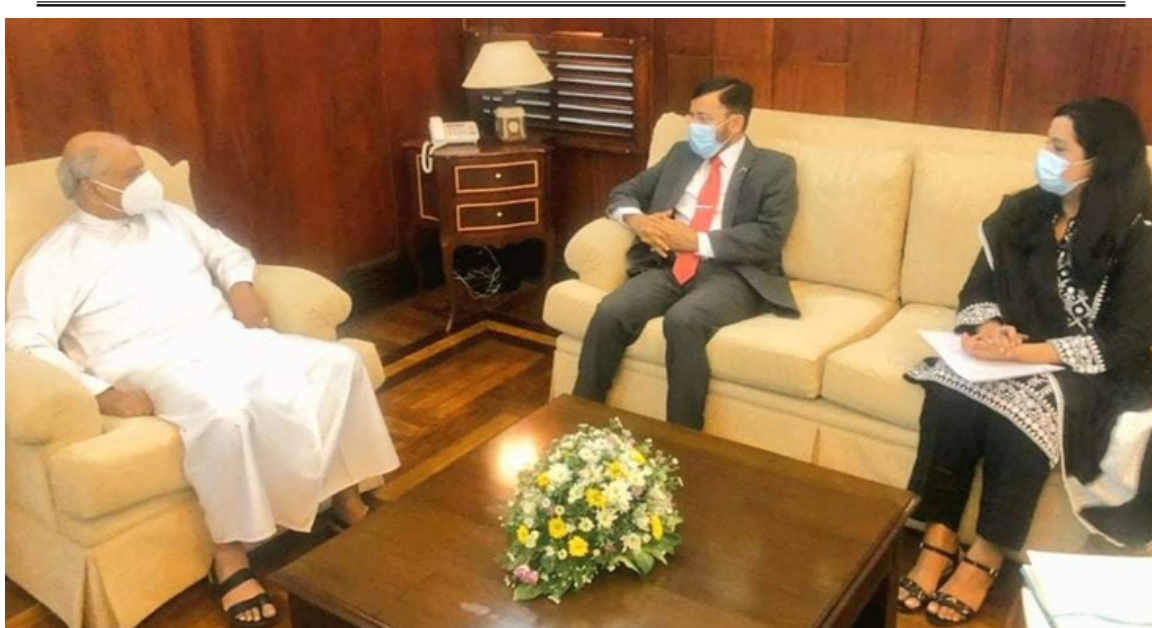
COLOMBO: Pakistan high commissioner to Sri Lanka Maj. Gen. Retd Muhammad Saad Khattak called on Sri Lankan Foreign minister Dinesh Gunawardena as follow up to recent successful visit of Prime Minister Imran Khan. Both sides had fruitful interaction, discussed key issues of mutual interest & showed a keen desire to effectively pursue agreements reached upon during the visit. High Commissioner presented a letter of thanks to Foreign Minister on cooperation extended to Pakistan-Sri Lanka during the visit.

Briefing the Secretary Industries on the setting up of Combined Effluent Treatment Plant (CETP) in SITE area, Abdul Hadi said that land is available in SITE for the said CETP. 1/3rd funds shall be provided by the Federal Government while 2/3rd funds will be arranged by Sindh government. The Federal Government has already issued the 1st installment out of the approved fund but despite the lapse of 14 months, there is no development on PCI of the CETP.