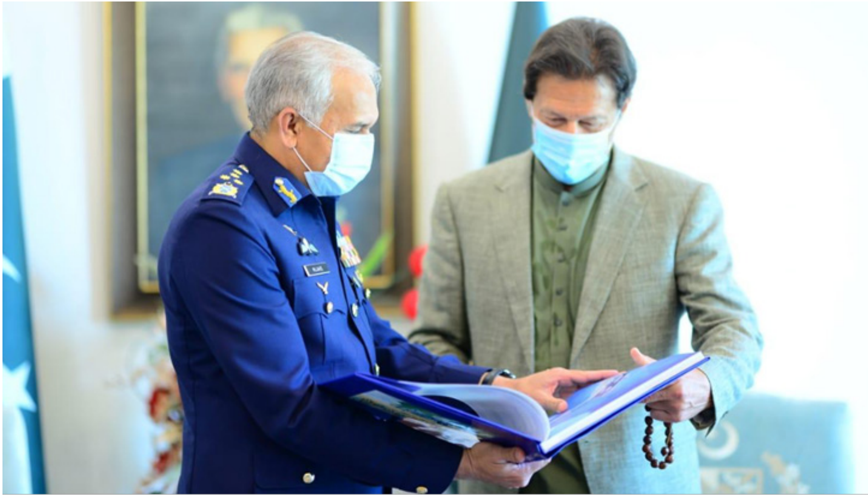
ISLAMABAD: Air Chief Marshal Mujahid Anwar Khan, paid farewell call on Prime Minister Imran Khan. The Prime Minister appreciated meritorious services of the outgoing Air Chief rendered in the service of the nation and wished him well. — DNA

The Deputy Commissioner apprised the health ranking details and said that Government General Hospital Samanabad came second in the province in terms of performance while Faisalabad came sixth in the BHU, seventh in the rural health center and 10th in the supervisory visit.