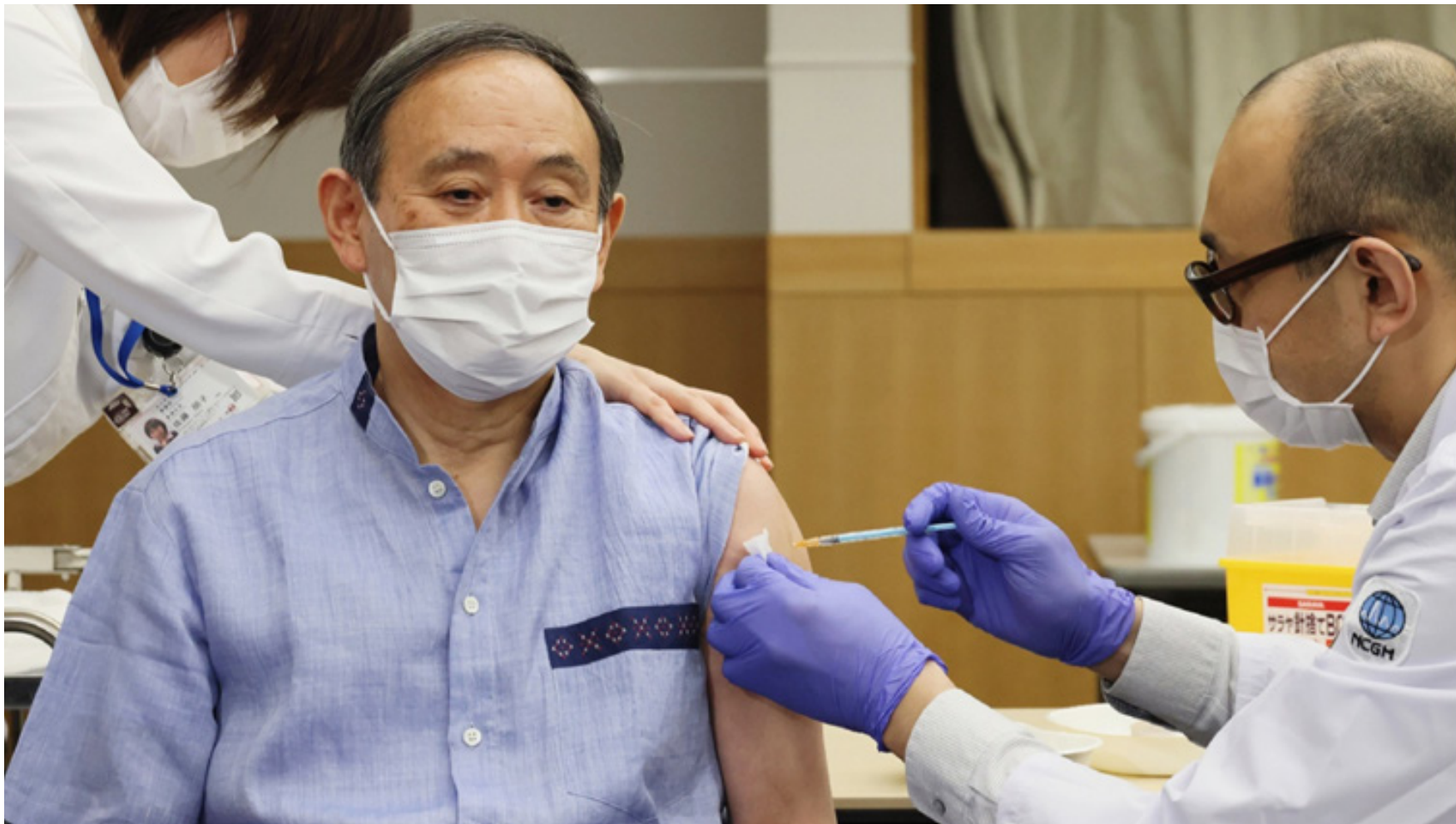
TOKYO: Japanese Prime Minister Yoshihide Suga received the first dose of Pfizer vaccine at a hospital in Tokyo, in a bid to reassure about the safety of the jab against COVID-19.

development partnerships with the world. The Prime Minister congratulated the National Security Division for crystallizing this framework. The Prime Minister lauded the efforts of the Army, intelligence and civilian law enforcement agencies for playing a monumental role in the fight against terrorism. He said that to ensure a truly secure country we must make the common citizens of Pakistan secure. "National Security today includes many aspects that have been ignored in previous decades, including climate security, food security and economic prosperity," he added. Prime Minister Imran Khan said that the dollar inflow must be consistently greater than dollar outflow in order to expand our national resource pie and use these resources for human welfare and robust defense.