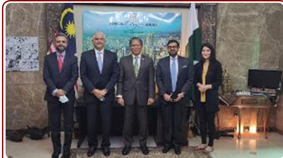
ISLAMABAD: Officials of Habib Metropolitan Bank posing for a picture with Malaysian High Commissioner Ikrum Mohammad Ibrahim.

joined this event virtually from Egypt, UAE, Mauritius, Turkey, Azerbaijan, Cameroon, Niger, Iraq, Bangladesh, UK, China, Kyrgyzstan, Hong Kong and Saudi Arabia. The workshop was consisted upon four technical thematic sessions. The themes of the sessions were functional materials for disease sensing and treatment, functional Nano-particles for biomedical applications, nanotechnology for diagnostics and clinical applications, and Nano-antimicrobials.