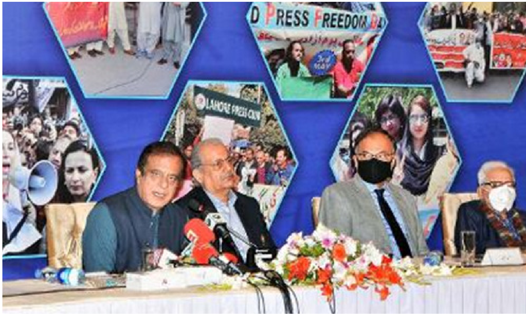
ISLAMABAD: Senator Shibli Faraz addressing to National seminar on Freedom of the Press &amp; Resolution of Media Crisis arranged by PFUJ.

He said that number of suspected patients in the district raised to 26,911 while screening of as many as 30,163 persons is carried out across the district in which 25,324 were tested negative. Responding a question, he said that result of as many as 224 suspected patients are awaited. — APP