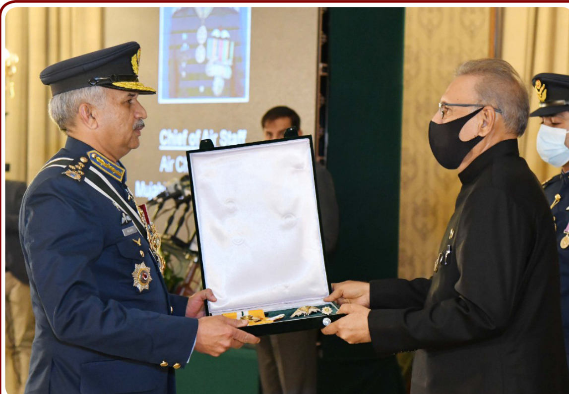
ISLAMABAD: President Dr Arif Alvi, conferring the Award of Nishan-e-Imtiaz (Civil) upon Air Chief Marshal, Mujahid Anwar Khan, Chief of Air Staff, in a special Investiture Ceremony, at Aiwan-e-Sadr.

er squadron. He held the operational appointments as Base Commander PAF Shahbaz, Base Commander PAF Mushaf, Air Officer Commanding, Central Regional Air Command, Deputy Chief of Air Staff (Support) and Deputy Chief of Air Staff (Operations) at Air Headquarters. He is a graduate of Combat Commanders School, Command and Staff College, Jordan and National Defence University, Islamabad. He did his Master's degree in War Studies and Defence Management. He was decorated with "The Legion of Merit Medal" by the Government of Republic of Turkey. He was promoted to the rank of Air Chief Marshal and appointed as Chief of the Air Staff, Pakistan Air Force on March 19, 2018.