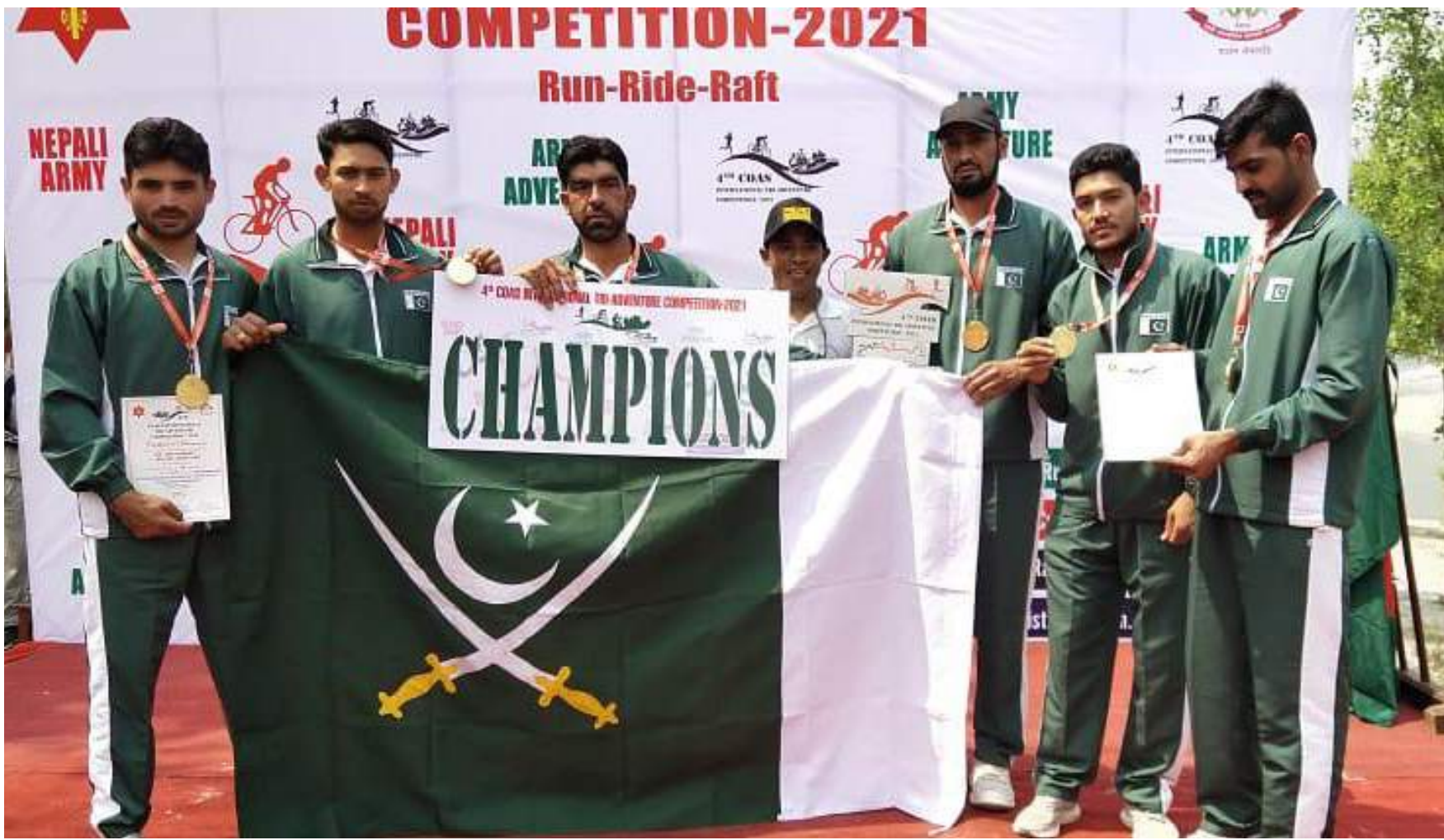
KATMANDU: Pak Army team won gold medal in international Adventure Competition held at Nepal from 18 to 21 March. The competition was aimed at testing physical endurance and mental agility of participants and included cross country running, cycling and rafting. Pakistan Army participated in the event for first time. A total of 20 teams participated in the event.

Umar, however, hinted at "targeted interventions", saying that the government tries to take steps that would not affect people's livelihoods. The minister said the NCOC had identified coronavirus hotspot areas to provincial governments. He said the implementation of these smart lockdowns were not satisfactory.