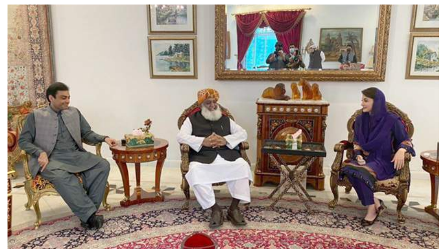
LAHORE: PDM chief Maulana Fazlur Rehman met with PML N Vice President Maryam Nawaz and PML N leader Hamza Shahbaz at Jati Umra, on Sunday. They discussed future course of action.

LAHORE: Leaders of all the opposition parties in the Pakistan Democratic Movement will accompany PML-N's Maryam Nawaz to her hearing at the National Accountability Bureau on March 26, JUI-F Chief Maulana Fazlur Rehman said. Maulana Fazlur Rehman made the announcement while talking to media persons after meeting Maryam Nawaz in Jati Umra. He said that there was no rift in the opposition alliance, contacts were maintained and they would move forward together. He said that we will wait for the decision of the PPP regarding the resignations. He hoped that PPP would respect the wishes of the remaining nine parties of the PDM. On the issue of growing differences in the PDM, the leader of the opposition alliance, Maulana Fazlur Rehman,