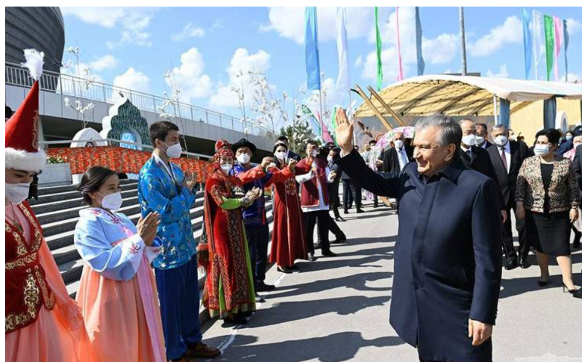
TASHKENT: President of Uzbekistan, Shavkat Mirziyoyev waving to people on the occasion of Nowruz festival.

uals can be considered as one of the best factors for communication between nations and establishing friendly relations between countries. Undoubtedly, the victory and peace of every nation and peace of the world, and the freedom, happiness and prosperity of the peoples of the world have and have motives that we can seek those motives in the customs, rituals and legends left by nations of our region.