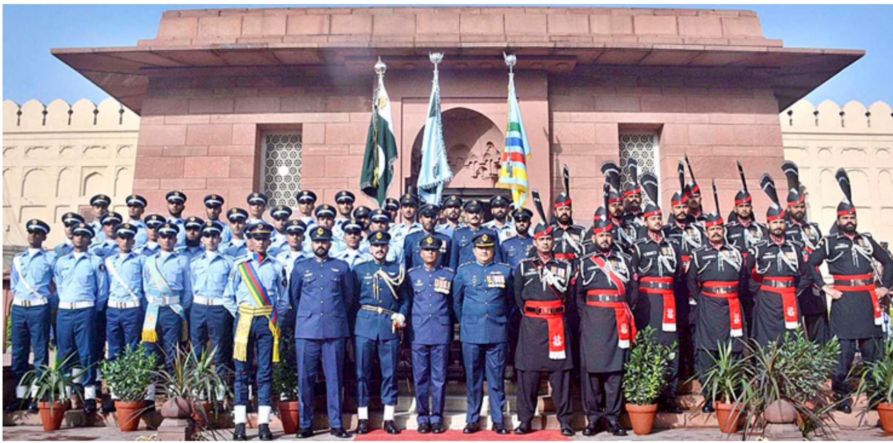
LAHORE: Representatives of Pakistan Air Force and Rangers posing in a group photograph on the occasion of Pakistan Day at Mazar-e-Iqbal.