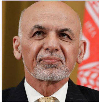
early presidential elections if the Taliban agree on a ceasefire," one senior government official said on condition of anonymity. Another Afghan government of-

insurgents to share power. But diplomats and foreign officials have said it will be difficult to move forward with the US plans without Ghani's support. During a visit to the region, which included stops in Doha and Islamabad, Khalilzad pushed for a conference to be hosted by Turkey with involvement from the United Nations next month. The Afghan officials said that as part of Ghani's counter-proposal, his government would ask the UN to closely observe the new election to ensure it is accepted by all sides. A presidential palace spokesman declined to comment.