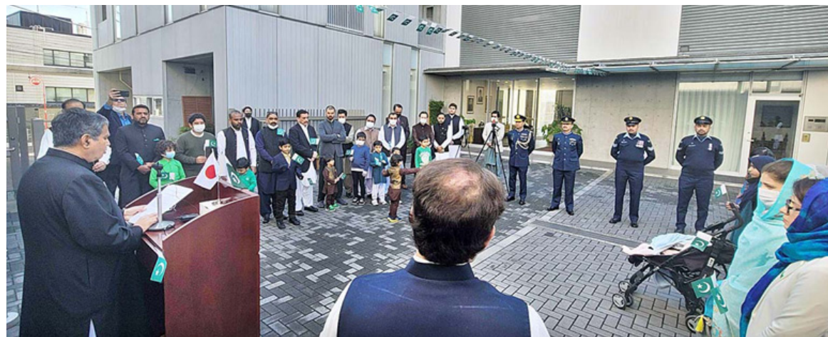
TOKYO: Pakistan ambassador to Japan Intiaz Ahmad addressing after hoisting national flag on the occasion of National Day of Pakistan at the embassy of Pakistan. – DNA

To mark the occasion, one of Ankara's landmarks, "Atakule," lit up in solidarity messages of Pakistan-Turkey relations on the nights of March 22 and 23. Besides, all the three bridges in Istanbul on the Bosphorus linking Asia with Europe would be illuminated in Pakistan flag colors on Tuesday evening.