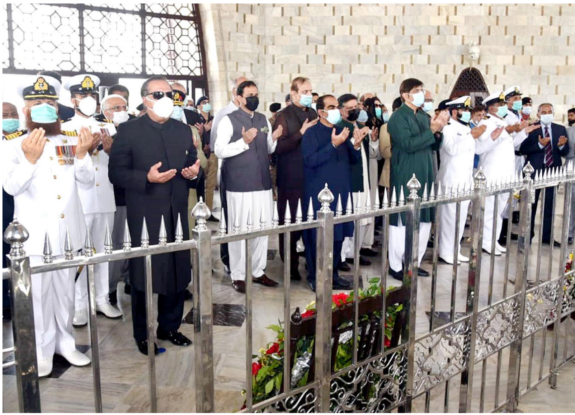
KARACHI: Governor Sindh Imran Ismail and Sindh Chief Minister Syed Murad Ali Shah offering Fateha after laying floral wreath at Mazar-e-Quaid on the occasion of Pakistan Day. - DNA

officer of UNESCO Representative Office in China. On March 2, Pakistani Foreign Minister Shah Mahmood Qureshi and Chinese Foreign Minister Wang Yi launched 70 years of celebrations via a simultaneous virtual ceremony Islamabad and Beijing. The two countries also issued a logo to celebrate the occasion. This event officially started a series of commemorative activities throughout the year. The diplomatic relations between the two countries were established on 21 May 1951.