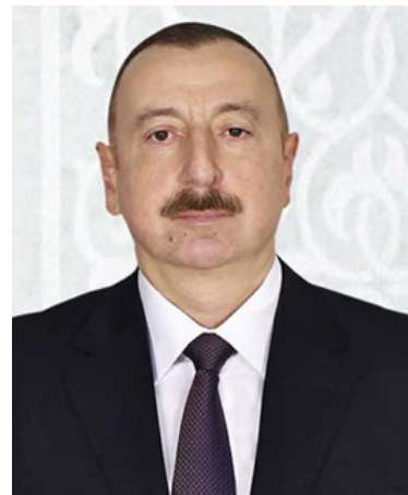
roots. The present high level of our strategic partnership relations, resting on

The ties between the Republic of Azerbaijan and the Islamic Republic of Pakistan stem from the will of our brotherly peoples bound with common historical, religious and cultural