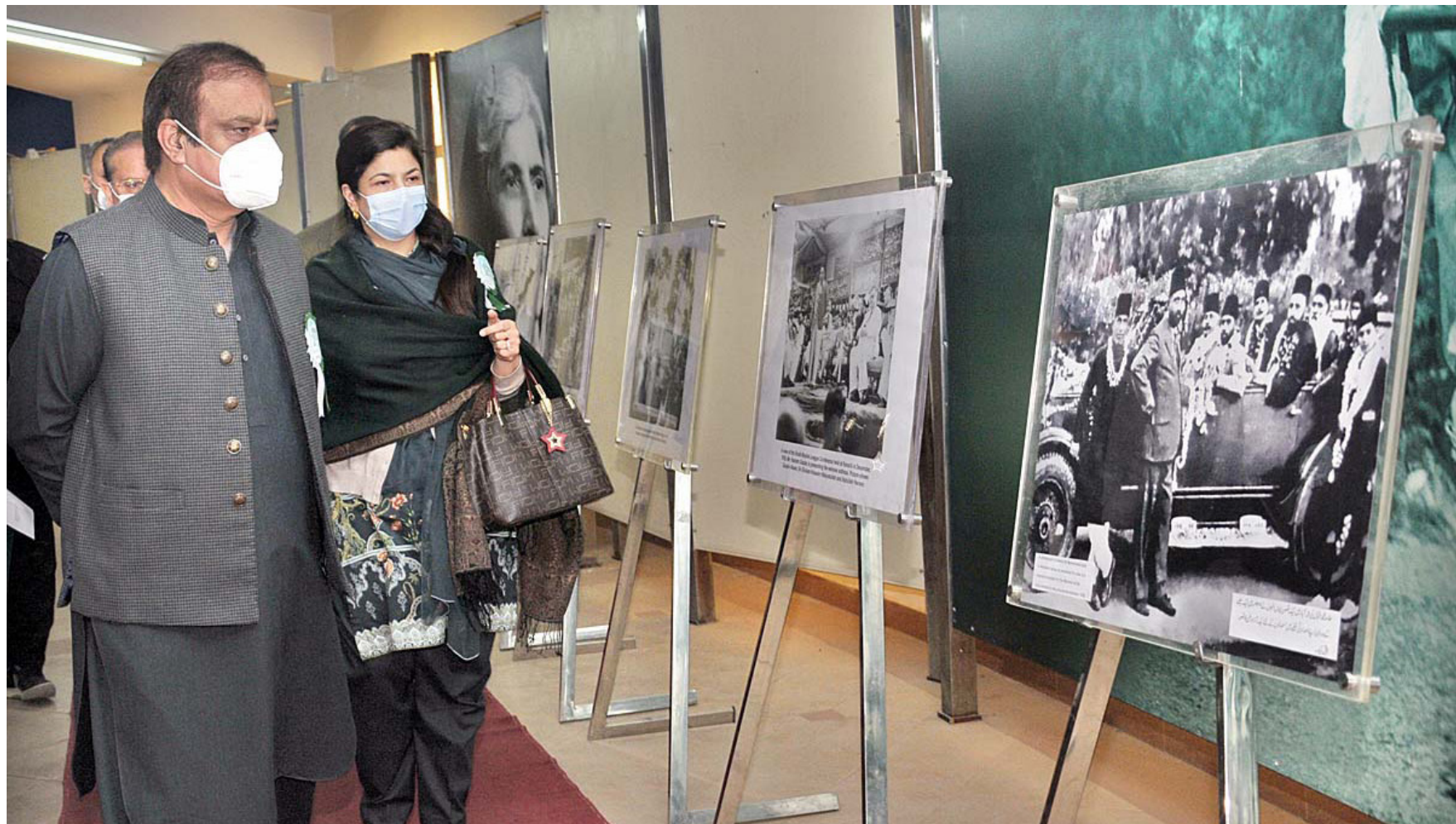
ISLAMABAD: Federal Minister for Information and Broadcasting Senator Shibli Faraz viewing historic photographs during Photographic & Painting Exhibition on the occasion of Pakistan Day arranged by DEMP at Fatima Jinnah Park, F-9.

Police registered separate cases against all the accused, he added. He said, police would continue their operation against the rules violators and the illegal petrol and LPG agencies would be sealed.