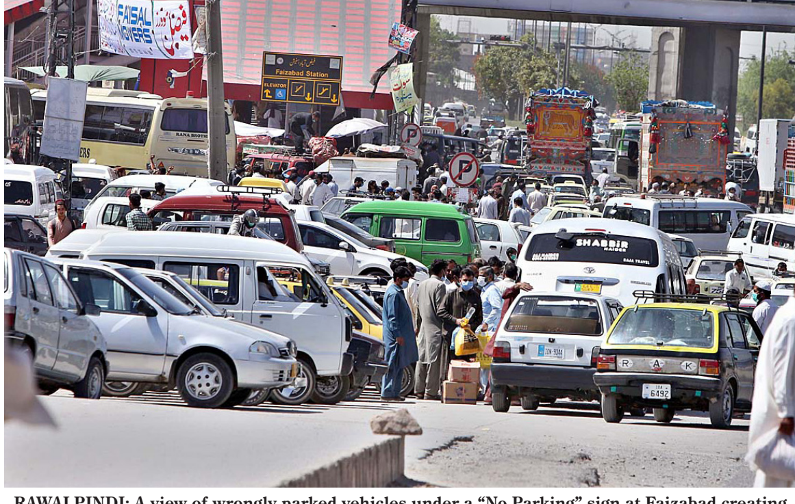
RAWALPINDI: A view of wrongly parked vehicles under a "No Parking" sign at Faizabad creating problems in the flow of traffic and needs the attention of the concerned authorities.