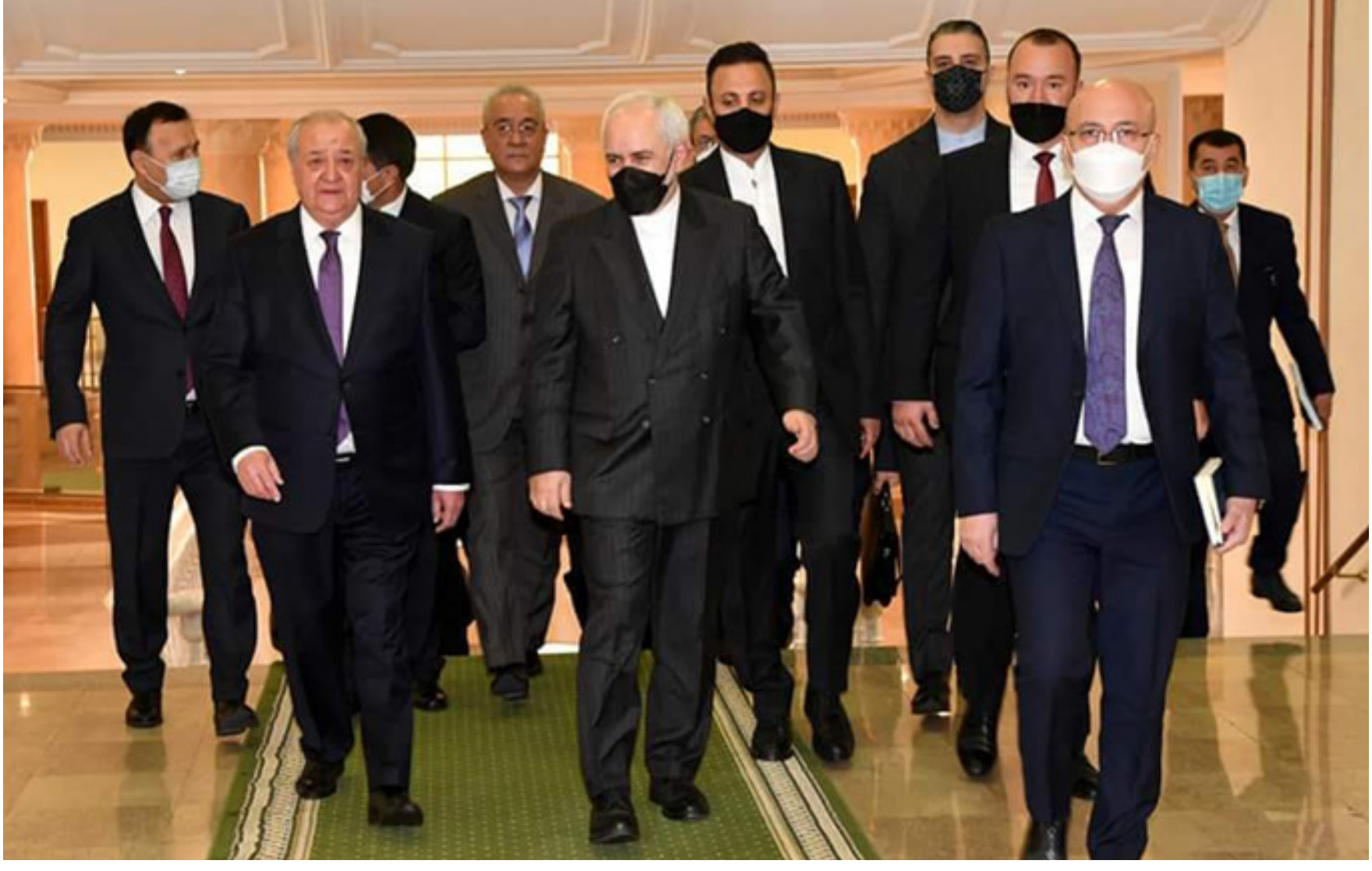
TASHKENT: A delegation led by the Minister of Foreign Affairs of the Islamic Republic of Iran Mohammad Javad Zarif visited MFA of Uzbekistan. During the talks, the sides discussed the current state of relations between the two countries in political, trade, economic, investment and other spheres, as well as future plans.

From Page 01 real democracy and we welcome it at every forum. The Leader of the House expressed hope that opposition in the House will play a positive role in making the parliament more functional. Earlier speaking in the House, opposition leader in the House Yusuf Raza Gilani expressed the resolve to work in tandem with all political parties for providing relief to the people.