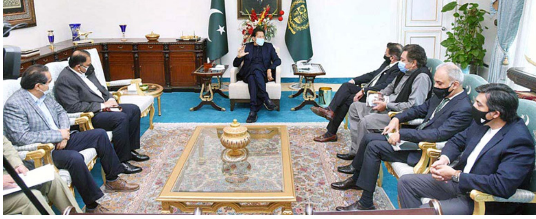
ISLAMABAD: Prime Minister Imran Khan chairs meeting regarding promotion of IT Sector in the country.

very poor. He also found out that these officials had been abusing their powers. Therefore, the CPO suspended these employees. -APP