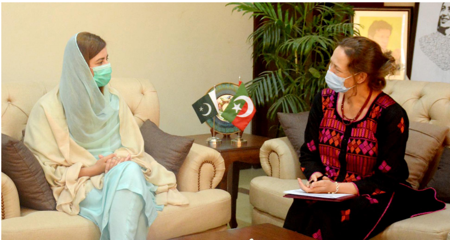
ISLAMABAD: Ambassador of Denmark to Pakistan, Lis Rosenholm calls on Minister of State for Climate Change, Zartaj Gul. – DNA

KARACHI: Chairman Pakistan Peoples Party Bilawal Bhutto Zardari has asked Balochistan government to accept all the genuine demands of its employees without any delay and expressed sympathy and solidarity with the provincial government employees who are on the streets under a mass protest nowadays. In a press statement issued here, the PPP Chairman said that people of Pakistan are reeling under unbearable inflation generated by the selected regime of Imran Khan and it has become very difficult to survive for the poor employees like the downtrodden people. Bilawal Bhutto Zardari extended support to all the genuine demands of the employees of Balochistan govt.