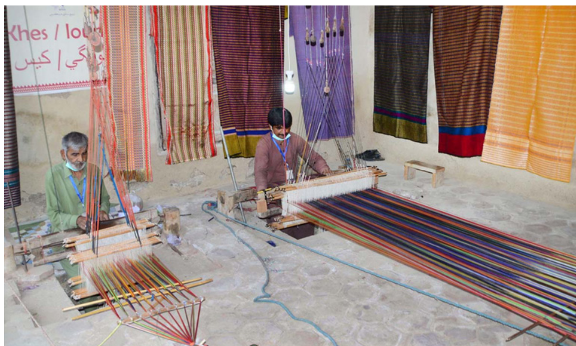
HYDERABAD: Artisan busy in preparing traditional cloth at his workplace.

between the people of Indonesia and Pakistan in various aspects, including trade, investment, tourism, education, as well as arts and culture. It is hoped that in the future these programs will initiate other supporting activities, through establishing collaboration and cooperation with the media and other stakeholders from the two countries.