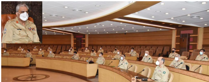
RAWALPINDI: Chief Of Army Staff General Qamar Bajwa chairing the Corps Commanders Conference (CCC) at GHQ.