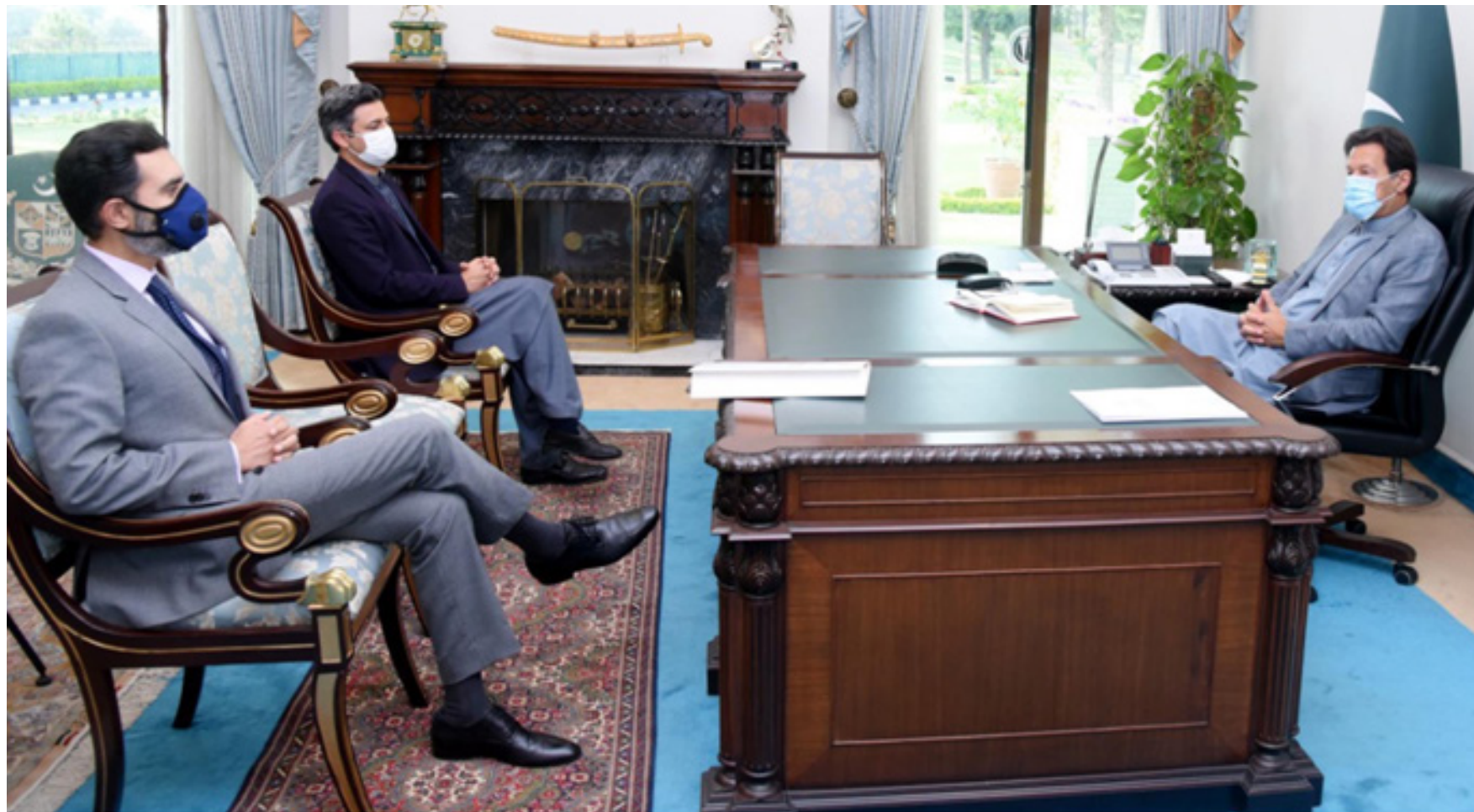
ISLAMABAD: Federal Minister for Finance Hammad Azhar and Governor State Bank Reza Baqir called on Prime Minister Imran Khan.

FAISALABAD: Five more patients died of COVID-19 in the district, while 204 persons tested positive during the last 24 hours. A spokesperson for the Health department said on Thursday the death toll due to COVID-19 rose to 668 in the district. He said that 1,150 tests for coronavirus were conducted in public and private sectors labs during the same period. He said that so far 10,215 patients had recovered from the disease while total active cases in Faisalabad reached 3,392. He said that 220 beds were allocated at the Allied Hospital and 106 at the DHQ Hospital for COVID-19 patients. At present, 212 patients, including 138 confirmed ones, were under treatment at the Allied Hospital while 99, including 47 confirmed, were admitted to DHQ Hospital.