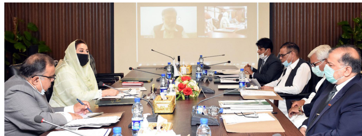
ISLAMABAD: Federal Minister for Inter Provincial Coordination, Dr. Fehmida Mirza chaired a meeting on issues relating to veterinary education with VCs of public sector universities.

directorates concerned of the Capital Development Authority on receipt of numerous complaints, a senior official told media on Thursday. She said all the departments concerned were told to step up efforts to bar illegal housing schemes' offices from plot bookings, marketing and advertisement through brochures, publication material as well as through billboards, hoardings and panfles.