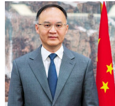
committed to promoting Pakistan-China friendly cooperation, pushing forward CPEC, and making every effort