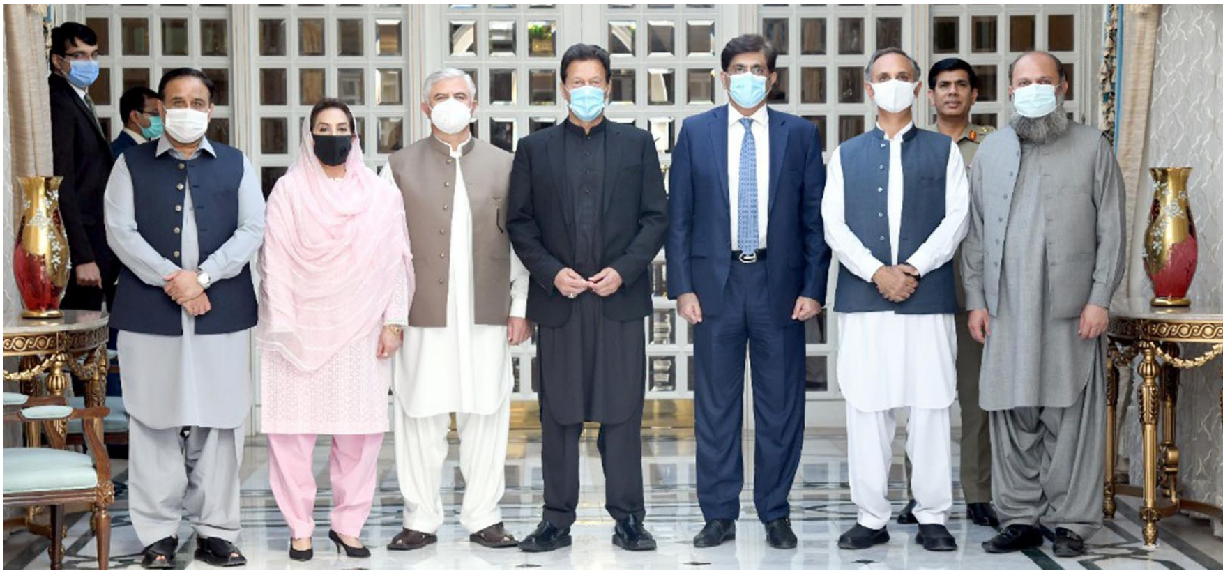
ISLAMABAD: Prime Minister Imran Khan in a group photo with Chief Minister Punjab Sardar Usman Buzdar, Federal Minister for Inter Provincial Coordination Fehmida Mirza, Chief Minister Khyber Pakhtunkhwa Mahmood Khan, Chief Minister Sindh Murad Ali Shah, Federal Minister for Energy Omar Ayub and Chief Minister Balochistan Jam Kamal.

PYONGYANG: Kim Jong Un says North Korea is facing its "worst-ever situation" and called on "grassroots" members of the ruling Workers' Party to be more proactive and responsible in carrying out the country's new five-year economic plan. The comments, reported by state media on Wednesday, came as experts warn Kim is facing perhaps his toughest moment as he approaches a decade in rule, with North Korea's coronavirus lockdown unleashing further shock on its sanctions-battered economy. North Korea's official Korean Central News Agency said Kim made the comments during an opening speech at a meeting of the Workers' Party's cell secretaries on Tuesday. "Improving the people's living standards ... even in the worst-ever situation in which we have to overcome unprecedentedly numerous challenges depends on the role played by the cells, the grassroots organisations of the party," Kim was quoted as saying. He urged members to carry out the decisions made at a party congress in January, where he announced a new five-year plan and showed unusual candour by acknowledging that his plans to improve the economy were not succeeding.