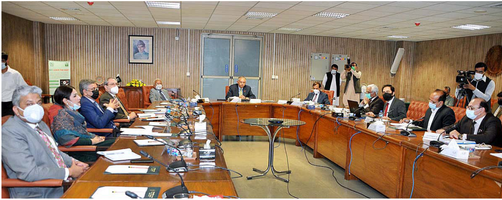
ISLAMABAD: Fifth Steering Committee meeting on Pakistan Regulatory Modernization Initiative (PRIM) chaired by Abdul Razak Dawood, Advisor to PM on Commerce & Investment, Ishrat Hussain, Advisor to PM for Institutional Reforms & Austerity and Atif R. Bokhari, MOS/Chairman Board of Investment held at BOI.