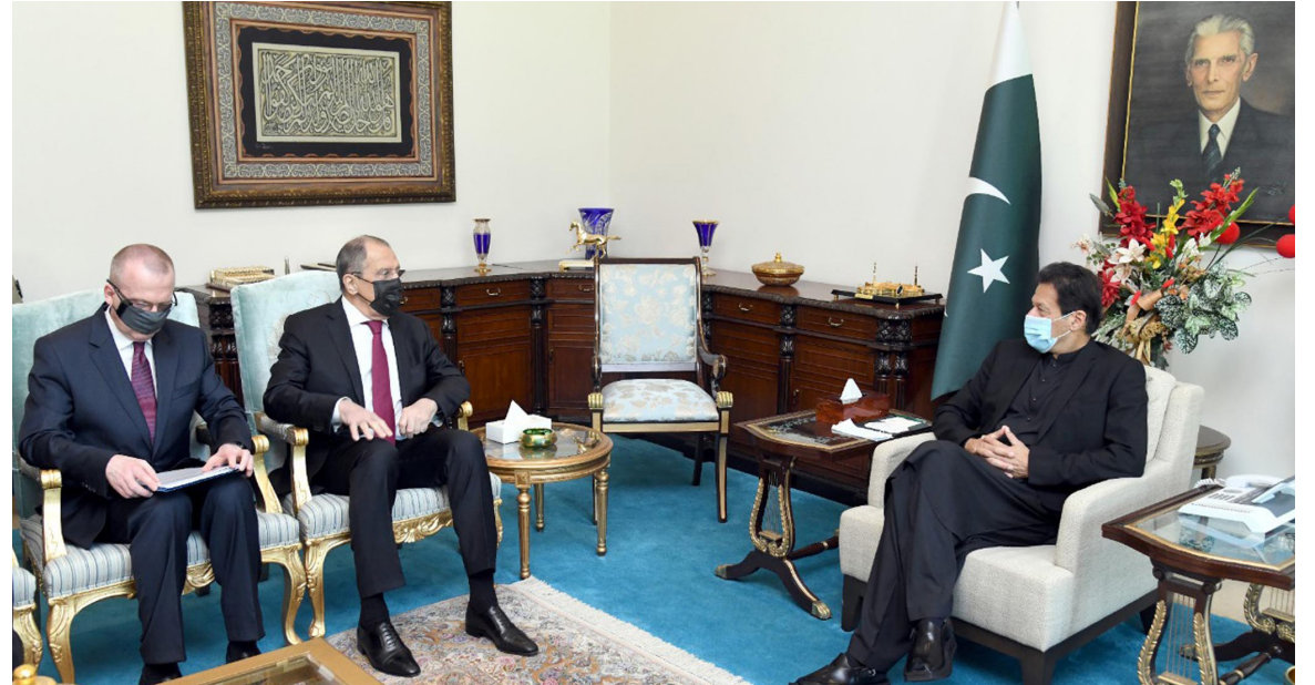
ISLAMABAD: Prime Minister Imran Khan in a meeting with a Russian delegation led by Foreign Minister Sergey Lavrov.