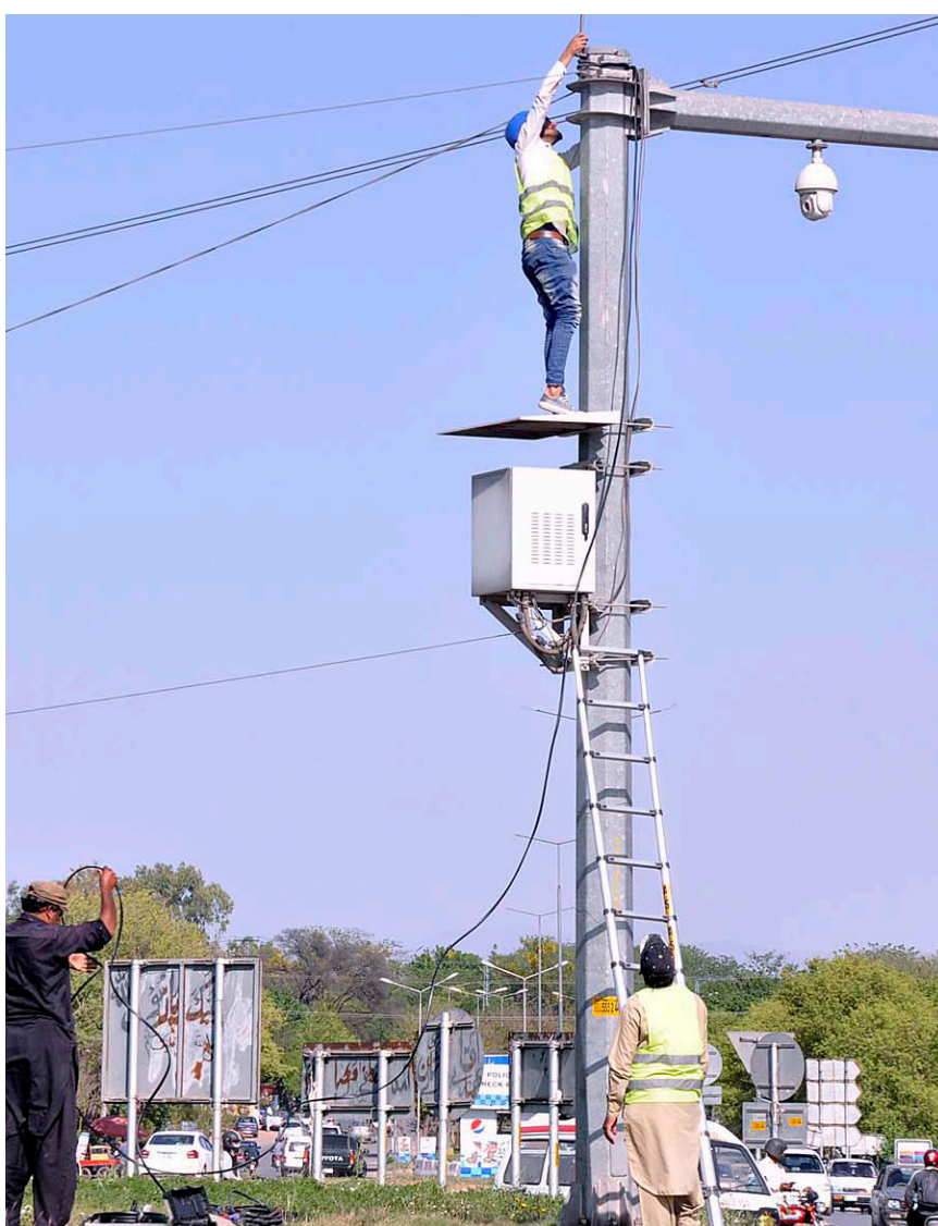
ISLAMABAD: Workers busy in repairing CCTV cameras installed during the maintenance work in Islamabad. — DNA

Briefing the media after the Tahafuz stocktake, Dr. Sania shared, "Ehsaas Tahafuz is Pakistan's first shock-oriented precision safety net. The programme is centered on protecting the deserving patients from catastrophic health expenditures. Enhancements are being planned to expand its scale and scope later this year based on lessons of the pilot." She then continued, "The programme is yielding great results and is being upscaled. This innovative "fund based" approach to health financing is complementing health insurance, to achieve universal health coverage (UHC) in Pakistan, a policy priority of our government to build back better, in a post COVID-19 context." — DNA