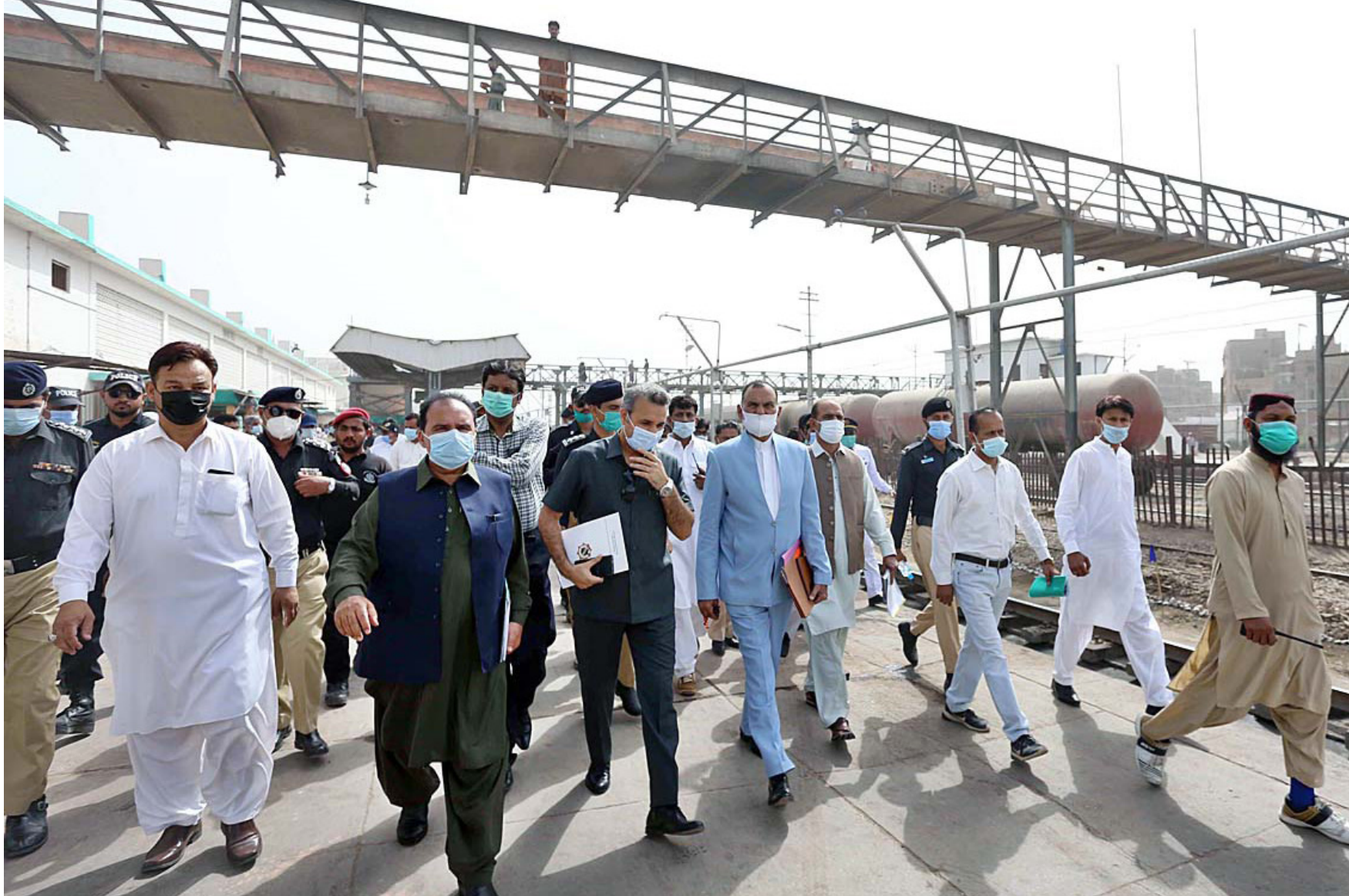
HYDERABAD: Federal Minister for Railways Muhammad Azam Khan Swati visit at Hyderabad Railway Station.