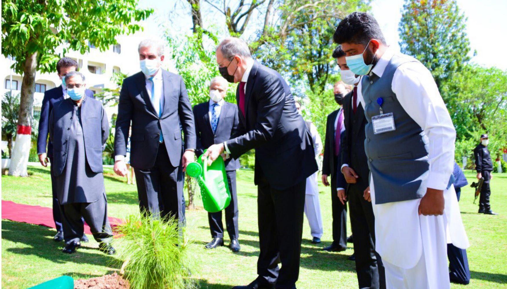
ISLAMABAD: Foreign Minister of Russia, Sergey Lavrov was warmly welcomed by Foreign Minister Shah Mehmood Qureshi at the Foreign Office today. Later, Russian FM also planted a Pine tree at the Foreign Office Lawn.