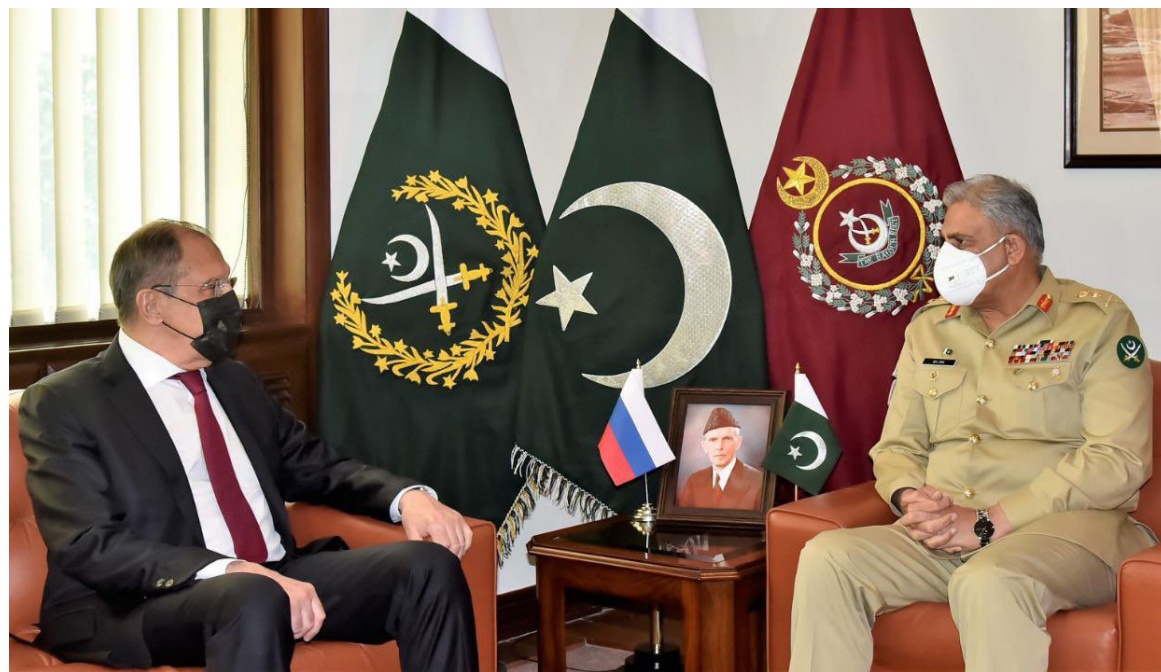
RAWALPINDI: Sergey Lavrov, Foreign Minister of Russia called on General Qamar Javed Bajwa, Chief of Army Staff at GHQ.