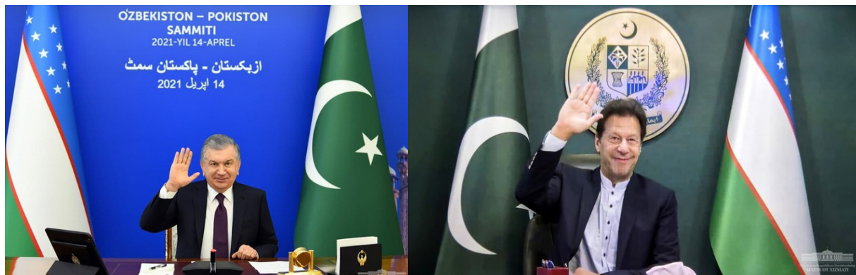
TASHKENT / ISLAMABAD: Uzbek President Shavkat Mirziyoyev and Prime Minister Imran Khan wave each other during online summit.

ISLAMABAD: The first Virtual Summit between Prime Minister Imran Khan and Uzbekistan President Shavkat Mirziyoyev was held on Wednesday. During the wide-ranging talks, views were exchanged on bilateral, regional and international issues. The two sides highlighted the depth of Pakistan-Uzbekistan relations rooted in common faith, shared history and cultural affinities. They also reiterated their determination to maintain momentum of high-level exchanges and further enhance the upward trajectory of the relationship. The two leaders reviewed the entire spectrum of bilateral relations – with particular focus on political, trade, security and defence, educational and cultural domains. They also agreed to encourage more people-to-people contacts including through spiritual (ziyarat) tourism. Prime Minister Imran Khan underlined