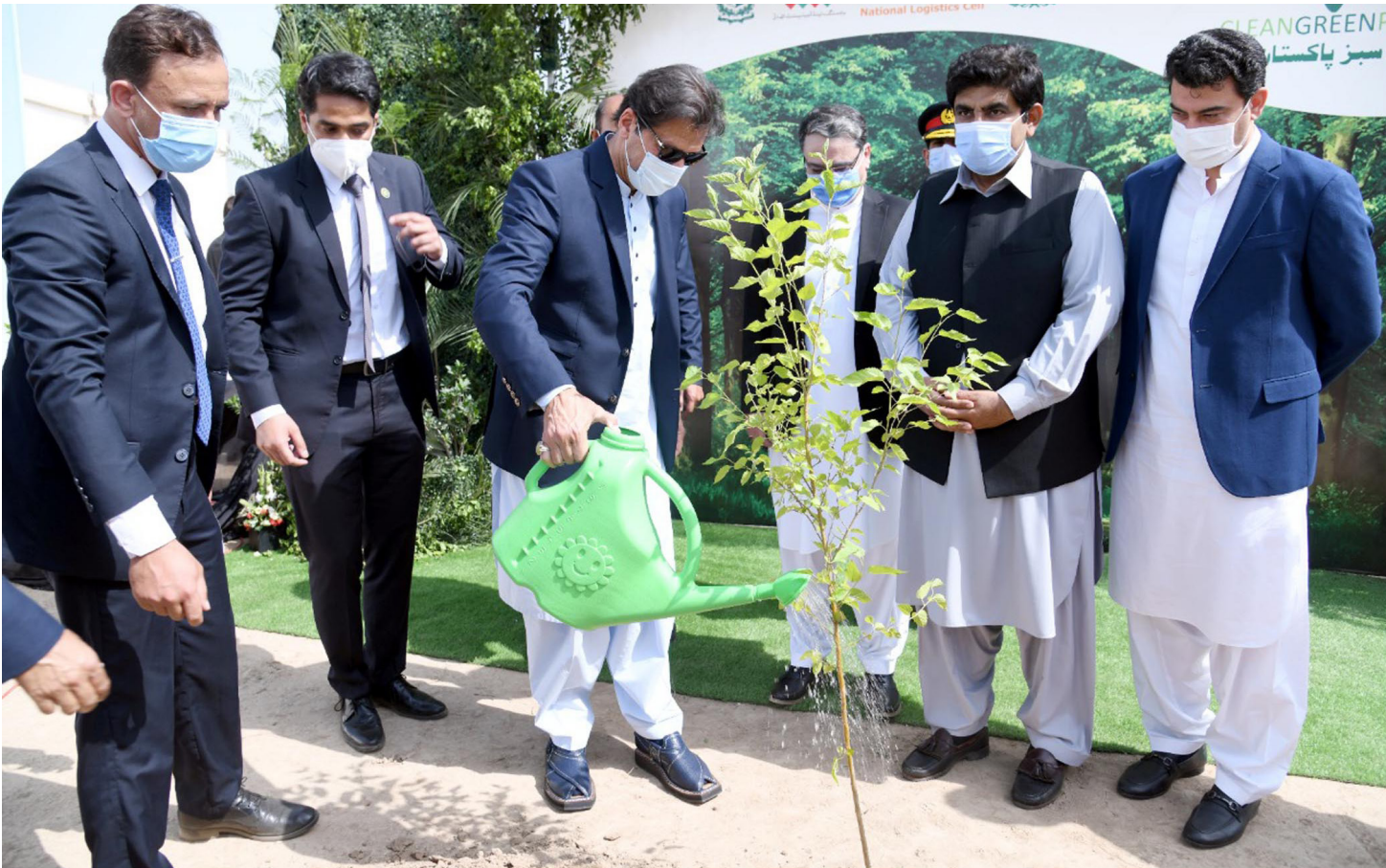
SARGODHA: Prime Minister Imran Khan Plants tree at the Ground Breaking Ceremony of Naya Pakistan Housing Scheme in Sargodha.