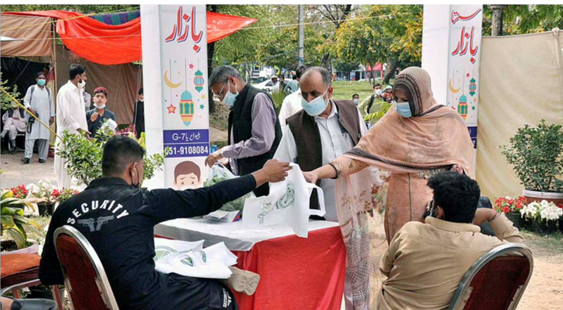
ISLAMABAD: Officials giving free bas to customers at sasta Ramzan Bazaar.

He urged the youth to become ambassadors of Kashmiris and share the atrocities being committed against the Kashmiris by the Illegally Occupied regime of India. The chairman underlined the need for extensive projection of the living conditions of half widows in IIOJ&K and massive use of pallet guns, which were barred to be used on animals, against Kashmiris. He said mysterious silence of the world was a big question mark for the humanity and the prosperous world should not compromise humanity for commercial and market interest.