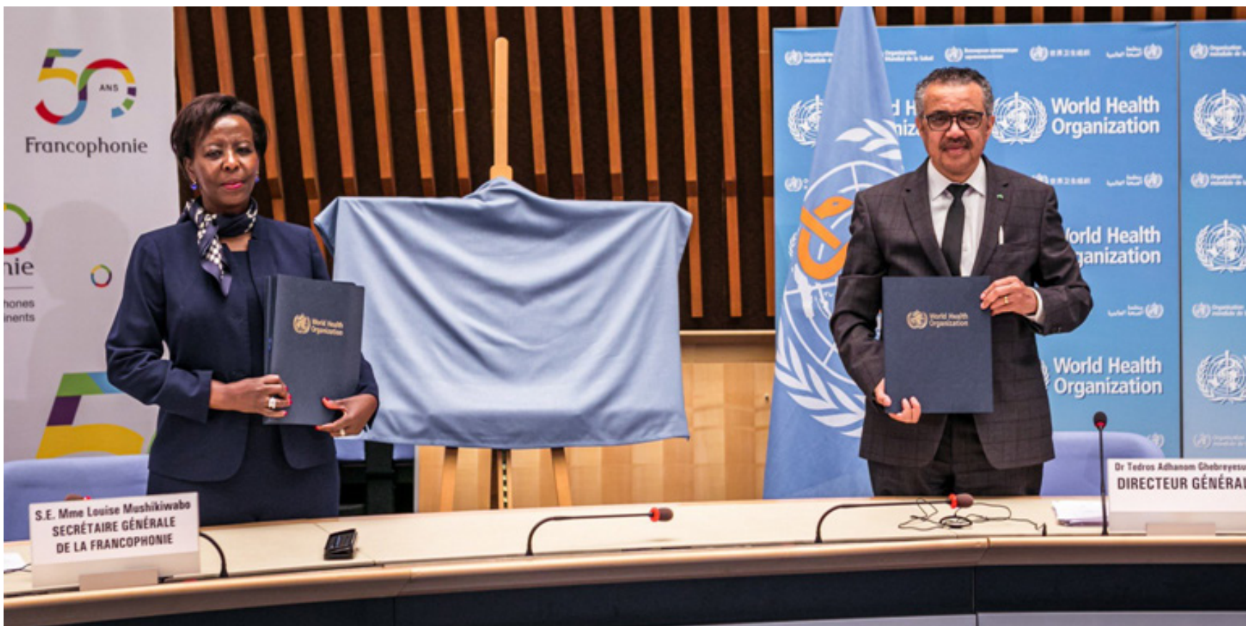
NEW YORK: Director General WHO, Tedros Adhanom Ghebreyesus and Louise Mushikiwabo, secretary general Organisation internationale de la Francophonie (OIF) posing for a photo after signing MoU between WHO and OIF.