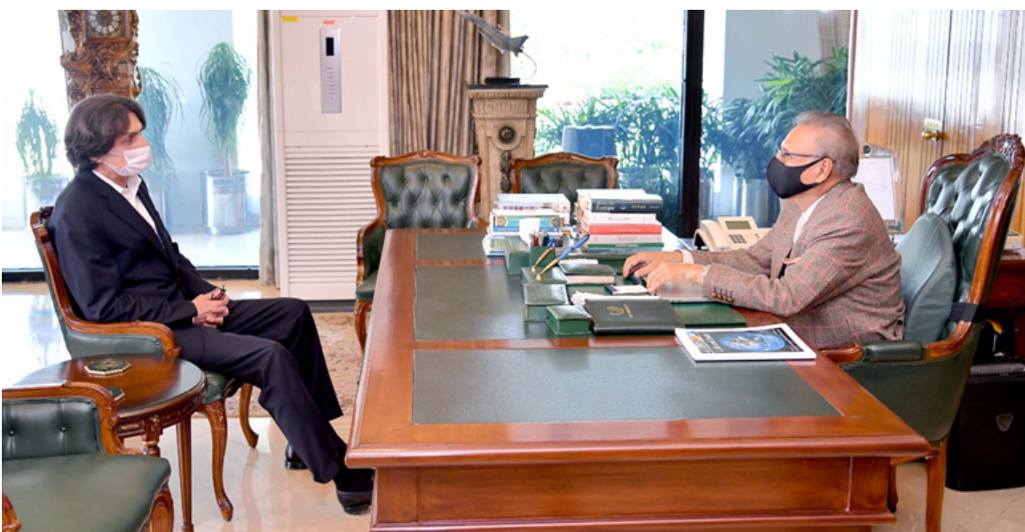
ISLAMABAD: SAPM on Information and Broadcasting, Raoof Hasan, called on President Dr Arif Alvi, at Aiwan-e-Sadr.

for the 35th day in a row, the active cases increased to 13,65,704, comprising 9.84 per cent of the total infections. The active caseload was at its lowest at 1,35,926 on February 12 and it was at its highest at 10,17,754 on September 18, 2020. The number of people who have recuperated from the disease surged to 1,23,36,036, while the case fatality rate has further dropped to 1.24 per cent, the data stated. Meanwhile, national Covid-19 recovery rate has dropped for the third day in a row to 88.92%.