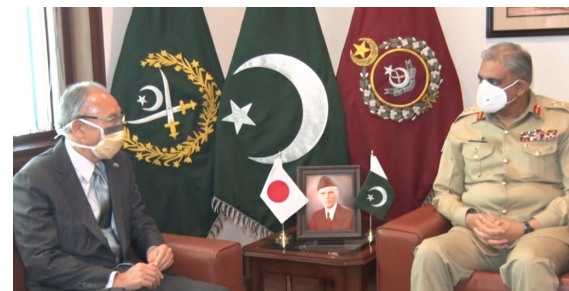
ISLAMABAD: Ambassador of Japan Kuninori Matsuda in a meeting with Chief of Army Staff General Qamar Javed Bajwa.

ISLAMABAD: Kuninori Matsuda, Japan Ambassador to Pakistan Called on General Qamar Javed Bajwa, Chief of Army Staff (COAS) at GHQ, today. During the meeting matters of mutual interest, regional security situation and measures to enhance bilateral