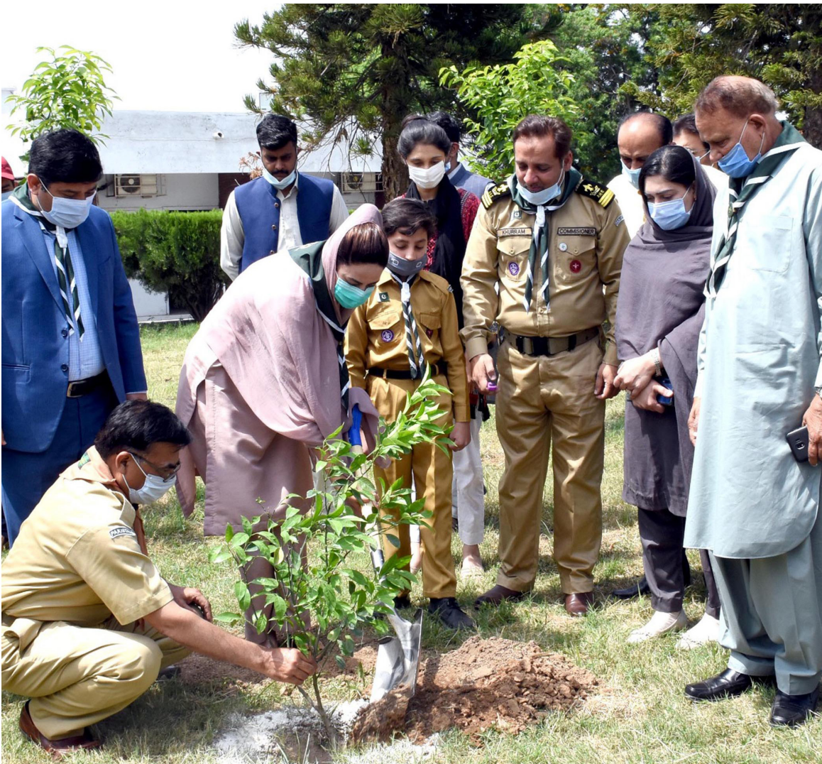
ISLAMABAD: Minister of State for Climate Change Zartaj Gul Wazir plants a sapling at the Pakistan Boy Scouts Club Association HQ near Islamabad Club.