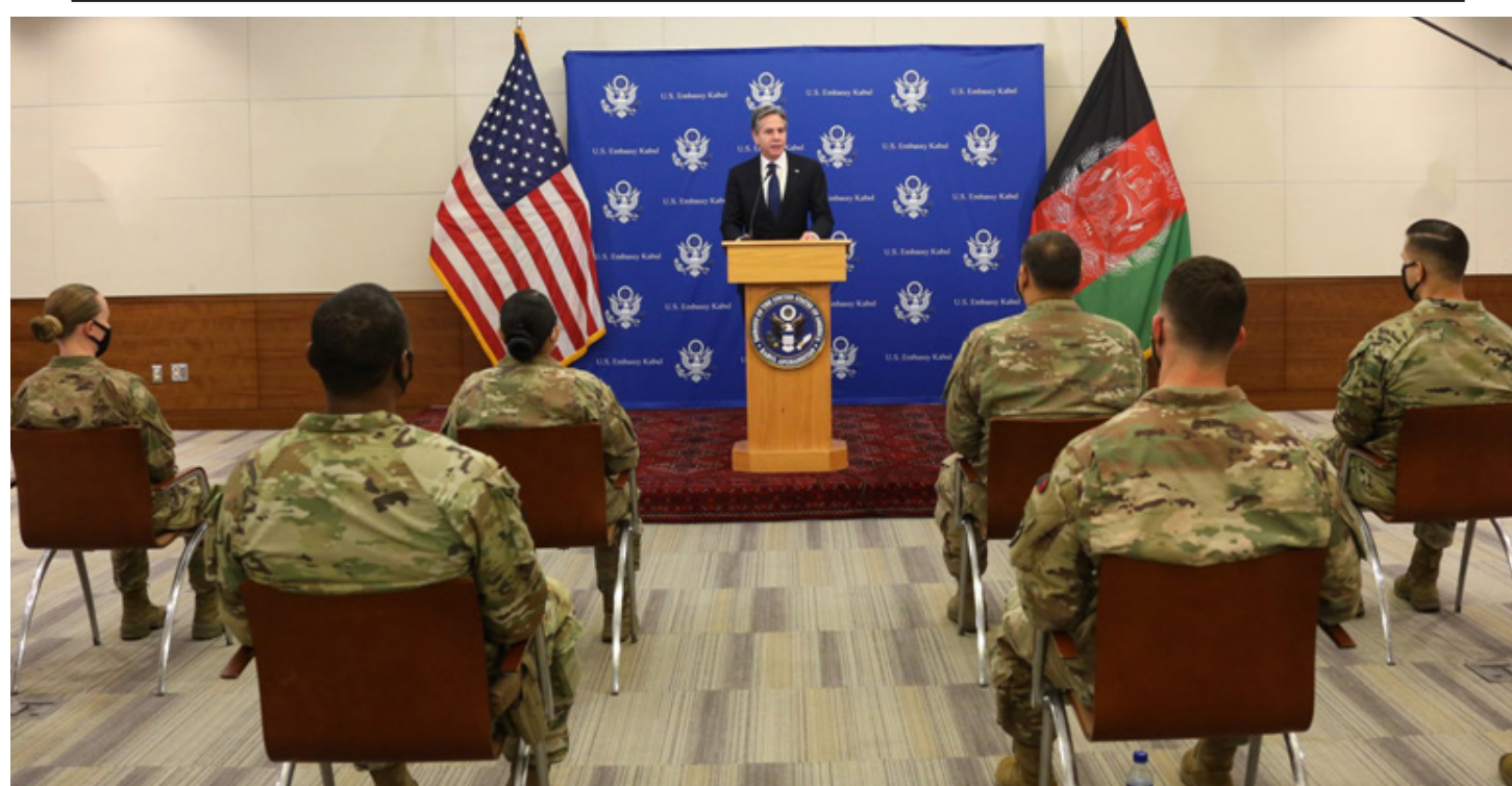
KABUL: Secretary of State Antony Blinken met with U.S. troops during his trip to Kabul.

HAVANA: Raul Castro, who is retiring from high public office, for most of his life toiled in the shadow of his older brother, Fidel Castro. Yet he also played a key role in Cuba's 1959 leftist revolution and the preservation of Cuban socialism. While Fidel was the charismatic leader who rallied Cubans to defend the revolution and defy the United States, Raul, 89, built the military into a formidable fighting force that saw off enemies including a U.S.-backed invasion at the Bay of Pigs. Later, after the fall of former benefactor the Soviet Union sent Cuba into an economic tailspin and left it politically isolated, he launched market-style reforms to its centralized economy and sought to normalize relations with Western powers. But he leaves office amid an economic crisis that has caused shortages of even basic goods and is threatening the universal access to quality healthcare and education hailed by supporters of Cuban socialism as among the most important achievements of the revolution.