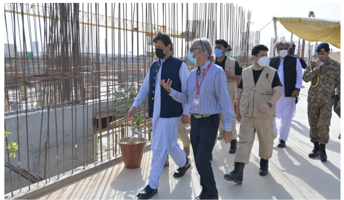
KARACHI: Prime Minister Imran Khan visits under construction Shaukat Khanum Memorial Cancer Hospital.

Board exams," he tweeted. As the minister had announced earlier, exams for classes 9-12 will take place according to the new dates announced by boards. He said this will not begin before the fourth week of May. Mahmood said Cambridge had announced it will not give teacher assessment grades this year hence those not appearing for the exams this semester can do so in October and November. "Meeting was also informed that Cambridge has decided not to give teacher assessed grades this year therefore those not taking exams will take them in the next cycle Oct/Nov. Cambridge also assured that all SOPs will be strictly followed," he tweeted.