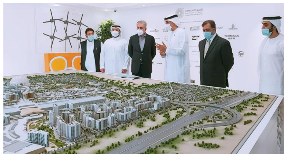
DUBAI: Pakistan Foreign Minister Shah Mehmood Quraishi visits Expo2020 in Dubai today. While visiting Pakistan Pavilion at the Expo, FM appreciated the role of Pakistani community in United Arab Emirates.

At the meeting, innovative and developmental strategies and the new vision of the TRNC under the country's political, economic, social, and cultural transformation were discussed. Northern Cyprus will go to Geneva with a new vision, including cooperation based on sovereignty equality of the two states, and this is a significant step, said Tatar regarding the informal, Cyprus-themed conference. The conference is held under the leadership of the UN with the participation of the guarantor countries on April 17-19 in Geneva, Switzerland. "With Turkey's growing power in the region and its support for the TRNC.