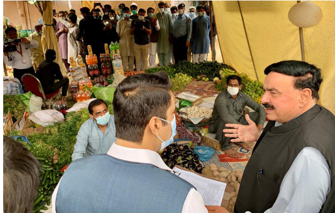
ISLAMABAD: Federal Minister for Interior, Sheikh Rashid Ahmed visiting Ramzan Bazaar and talking to a vendor about the current rates of goods.

ISLAMABAD: A renowned psychiatrist in Islamabad has been exposed after he was caught on camera allegedly sexually exploiting his female patient during the treatment, media reported on Saturday. The Islamabad psychiatrist was exposed by a team of media news programme, Sare-Aam, that carried out a sting operation in which a woman was sent to the doctor as a patient suffering from mental issues. The woman secretly filmed the entire conversation with the health professional, showing how he was asking for a sexual favour from the planted patient. The Sare-Aam host later approached the doctor with the video evidence, however, instead of admitting his guilt, the doctor started giving lame excuses to defend his visible sexual offers to the patient. After seeing the patient accompanying the media team, the doctor claimed that she had visited him four times and was leveling baseless allegations against him to tarnish his image. "I have neither made any sexual offers to her nor committed any sexual act with her," the psychiatrist said despite his conversation during the video in which he could be heard making sexual offers while terming them a bid to lower the stress level.