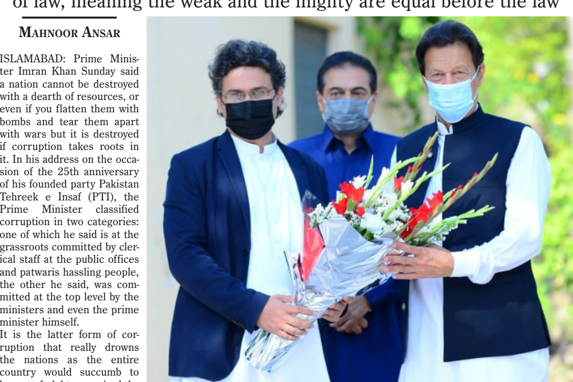
ISLAMABAD: Senator Faisal Javed presenting bouquet to Prime Minister Imran Khan on the occasion of Foundation Day of the PTI.

Imran Khan says we named our party after justice. When there is justice, there cannot be any instance of corruption. Justice means the supremacy of law, meaning the weak and the mighty are equal before the law