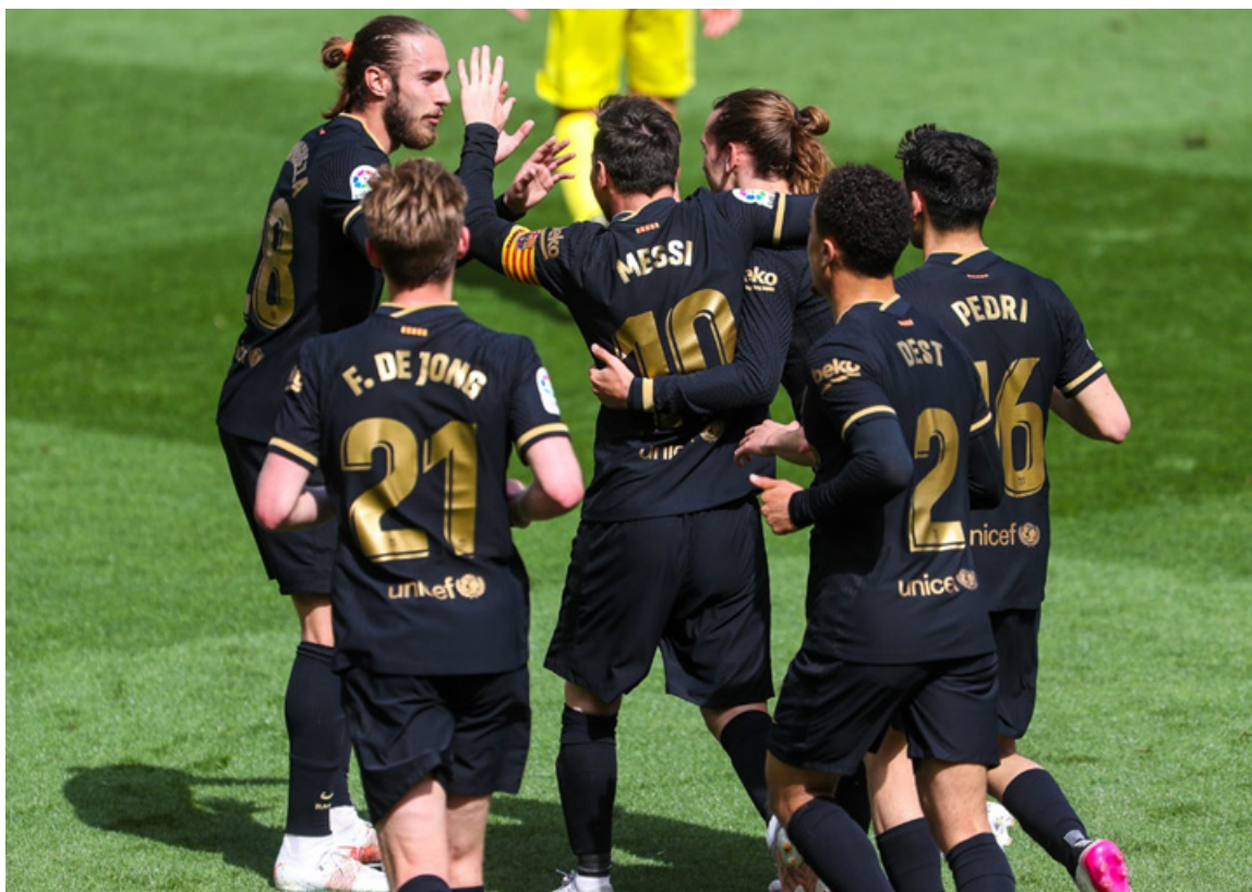
VILLARREAL: Barcelona's Player Antoine Griezmann celebrating with teammates after scoring goal against Villarreal in a La Liga match.