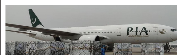
ISLAMABAD: One million doses of corona vaccine from China being unloaded.