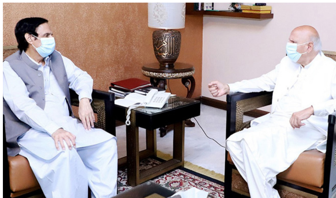
LAHORE: Speaker Punjab Assembly Chaudhary Pervaiz Elahi called on Punjab Governor Chaudhary Muhammad Sarwar at his residence. - DNA

ISLAMABAD: The exports of cement from the country witnessed decrease of 0.01 percent during the nine months of financial year 2020-21, against the exports of the corresponding period of last year. The cement exports from the country were recorded at $210.042 million during July-March (2020-21) against the exports of $210.073 million during July-March (2019-20), according to the Pakistan Bureau of Statistics (PBS). In terms of quantity, the exports of cement however increased by 11.70 percent by going up from 5,592,788 metric tons to 6,247,086 metric tons, according to the data. Meanwhile, on year-to-year basis, the exports of cement also increased by 66.25 percent during the month of March 2021 as compared to the same month of last year. The exports of cement from the country during March 2021 were recorded at $26.847 million against the exports of $16.149 million in March 2020.