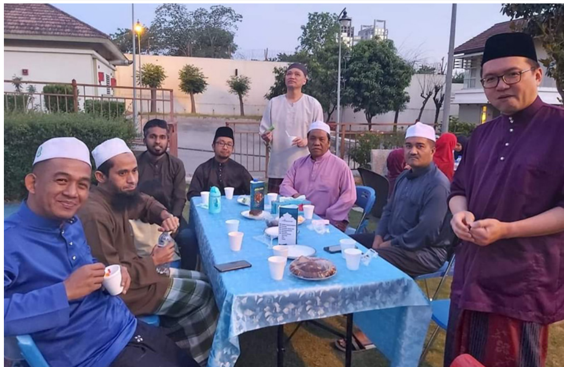
ISLAMABAD: Staff of the Malaysian High Commission posing for a picture after Iftar.