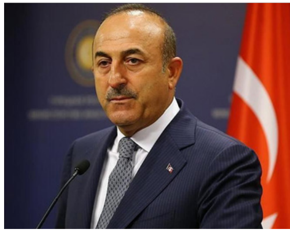
third parties and turned into tools of interference, has helped no one. "We cannot allow the centuries-old culture of coexistence of Turks and Armenians to be

Shortly before Biden's statement, Turkish President Recep Tayyip Erdogan said the debate over the Armenian claims, which have been politicised by