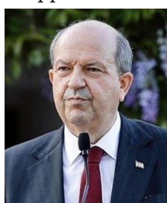
now the only way forward and one which has the full backing of the Turkish government. "It is the facts on the ground," he added. "What we have at the moment is peaceful coexistence with two neighbouring states. "Different people, different language, different history, different culture. Therefore it was our true right to establish our own state which we did [in 1983]. "Since 1974 we have been separated. The young generation don't know one another. They have different language, culture and experiences. There have been so many bitter experiences that there is no hope for a federal relationship in

up or change its mind. It will continue probably increasingly to support the Turkish Cypriots." He said that a two-state plan is