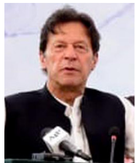
The prime minister said they had also decided that South Punjab would get its due job quota according to its size and population. All the issues of the area would be resolved in the secretariat. He said "South Punjab secretariat is a historical event, a new beginning for South Punjab province and a transition." The ceremony was attended by Foreign Minister

MULTAN: Prime Minister Imran Khan Monday said that establishment of South Punjab secretariat was a step towards new beginning as now, the allocated development funds would be spent on the prosperity of the people of this neglected region. Addressing a groundbreaking ceremony of South Punjab Secretariat, the prime minister said that according to statistics, the area consisted of 33 per cent population of Punjab province, but in the past, it got only 17 per cent of the total budget allocation. Due to re-allocation of these uplift funds, about Rs260 billion losses incurred on these areas by the policies of the previous rulers of the province, he added.