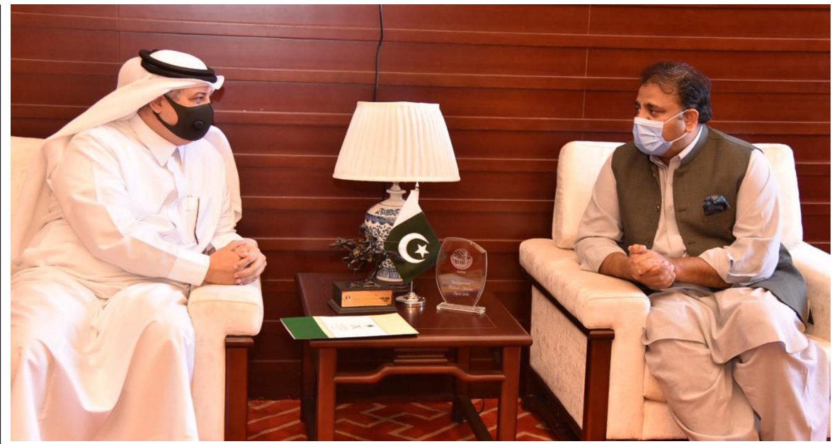
ISLAMABAD: Ambassador of Saudi Arabia, Nawaf Bin Saeed Al Maliki calls on Federal Minister for Information and Broadcasting, Fawad Chaudhry.