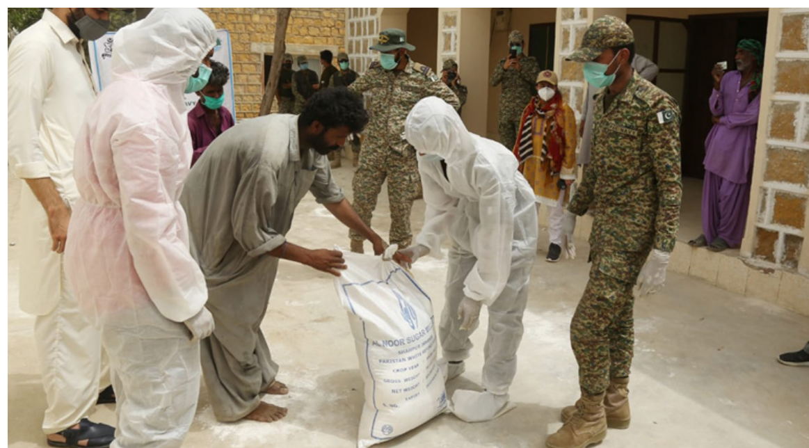
THATTA: Ration bags are being distributed among deserving families of Keti Bandar by Pakistan Navy and Sahil Welfare Association.