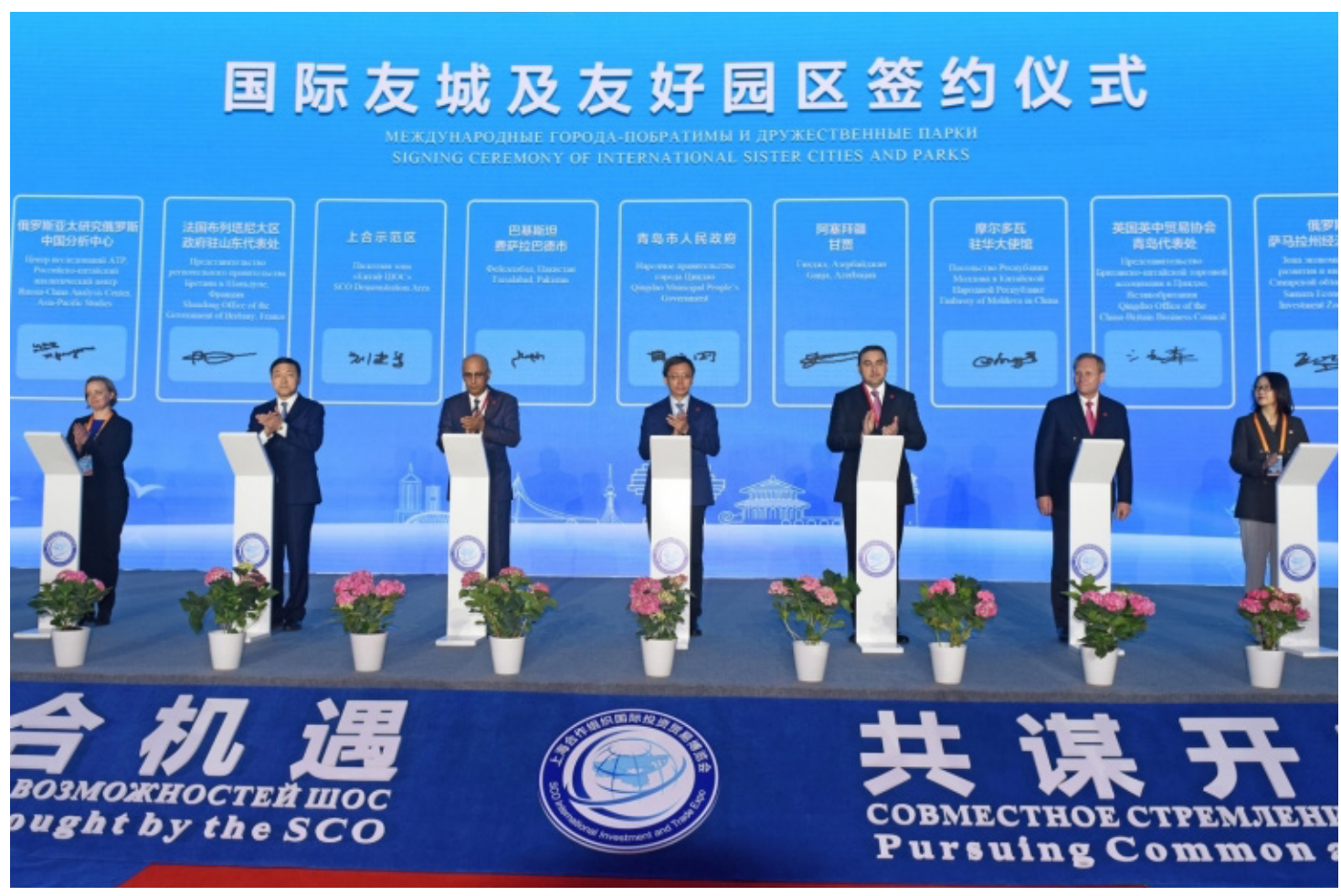
JIAOZHOU: 2021 SCO International Investment and Trade Expo opens in. Pakistan ambassador to China Moin ul Haque also attends the opening ceremony.

In the interview, Zarif repeatedly uses "the field" in reference to military operations and politics driven by the outward-looking Quds Force of the IRGC, and its then-leader Major-General Ghassem Soleimani. -Foreign Desk