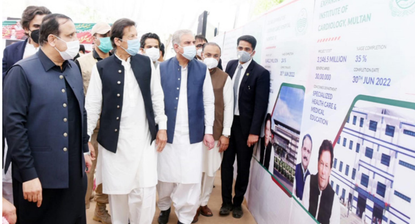
MULTAN: Prime Minister Imran Khan receives briefing about development projects in Multan.