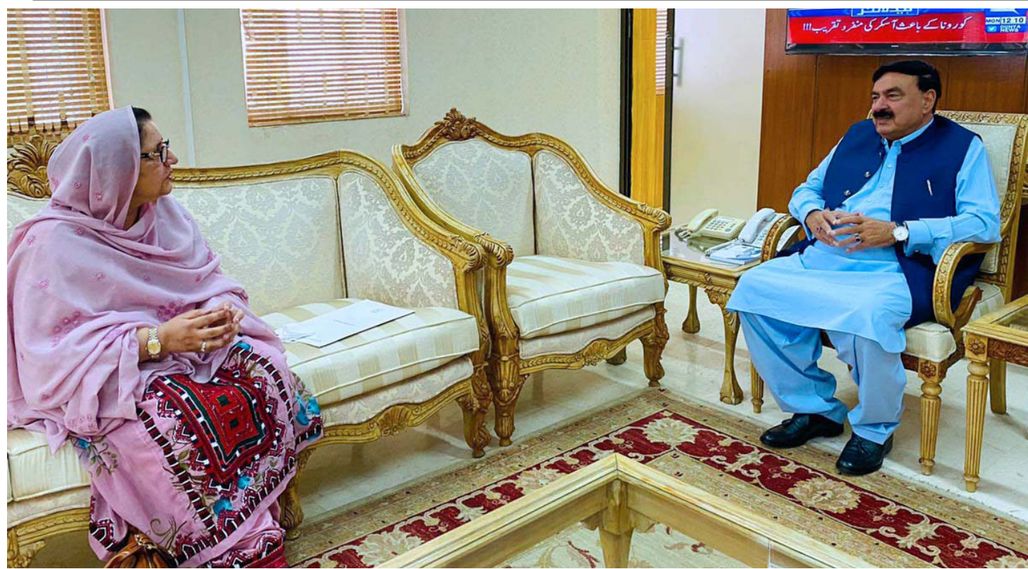
ISLAMABAD: Minister for Defense Production, Ms. Zubaida Jalal calling on Minister for Interior Rashid Ahmed.