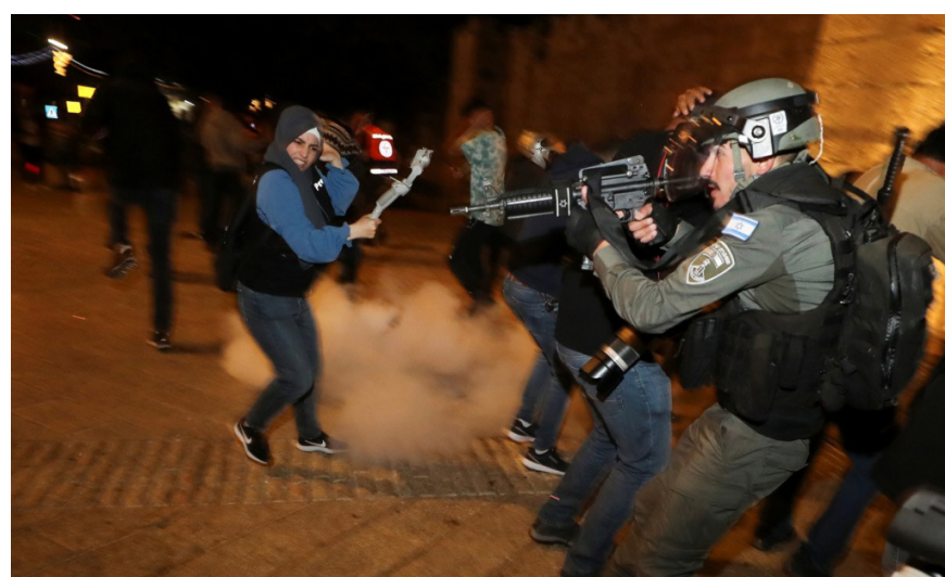
JERUSALEM: Israeli police unleash violence against the innocent Palestinian people.

National Council (PNC) had said that the battle of Jerusalem, which was sparked by the heroes of this Holy City, came in response to the daily racist crimes committed by the occupation and its terrorist groups of settlers against the citizens of Jerusalem, and these crimes have escalated, especially since the beginning of the blessed month of Ramadan. In a press statement, PNC indicated that the Israeli occupation authorities have transformed the city of Jerusalem, the capital of our eternal state, as well as the neighborhoods of Jerusalem into military barracks, chased their sons, erected iron barriers in squares and yards, and attacked worshippers and prevented them from reaching the blessed Al-Aqsa Mosque. PNC had called for the unification of all Palestinian energy and capabilities, and to reject and abandon all that leads to weakening the front of confrontation and facing the Israeli occupation and its crimes, and to engage in this honorable national battle that the people of Jerusalem are waging with courage and valor on behalf of the Arab and Islamic nations.