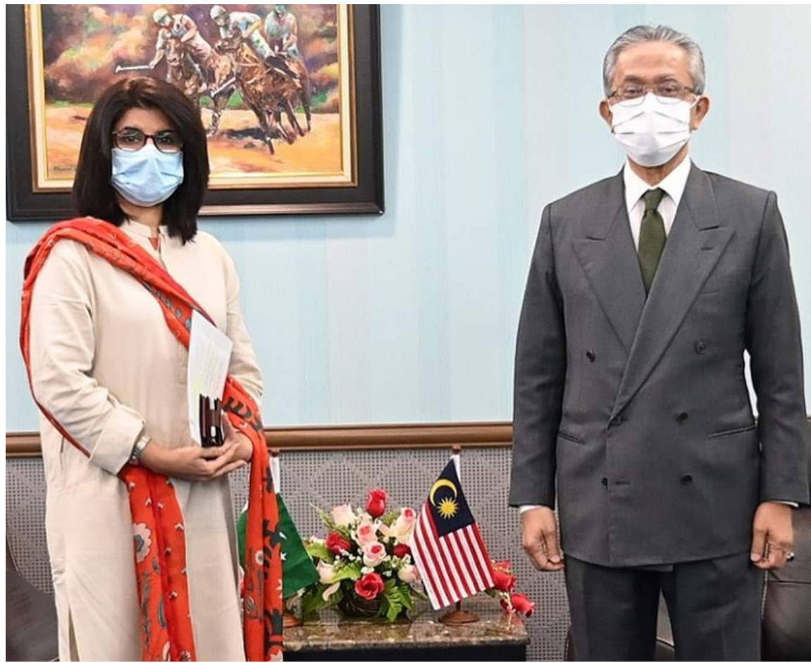
KUALA LUMPUR: Pakistani High Commissioner to Malaysia Anma Baloch called on Dato Kamarudin Jaffar Deputy Foreign Minister of Malaysia to discuss enhancement of bilateral cooperation in diverse areas to actualize the Strategic Level Partnership between the two fraternal countries. - DAN