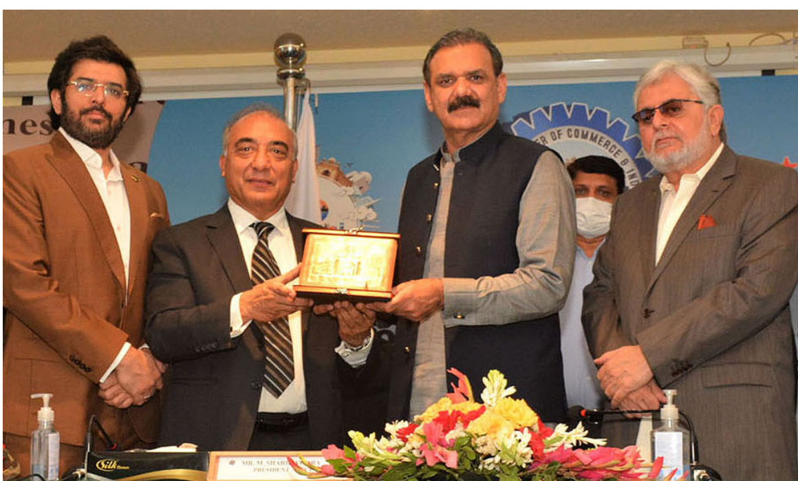
KARACHI: Chairman CPECA Asim Saleem Bajwa being presented a souvenir during his visit to Karachi Chamber of Commerce and Industry.

power on earth could make Pakistan to abandon this project. He said the prime minister had a very clear vision to realize this venture. He said Pakistan had started work on several projects in power generation, fiber optics and infrastructure sectors with the cooperation of China. We have been trying to enhance our bilateral relations with China since 1952, Bajwa said. He informed that work on a road project from Sukkur to Hyderabad would be started soon after which travel distance between Peshawar and Karachi would be reduced. He said new roads and routes from Gwadar would be completed in a time period of 2 and 3 years.