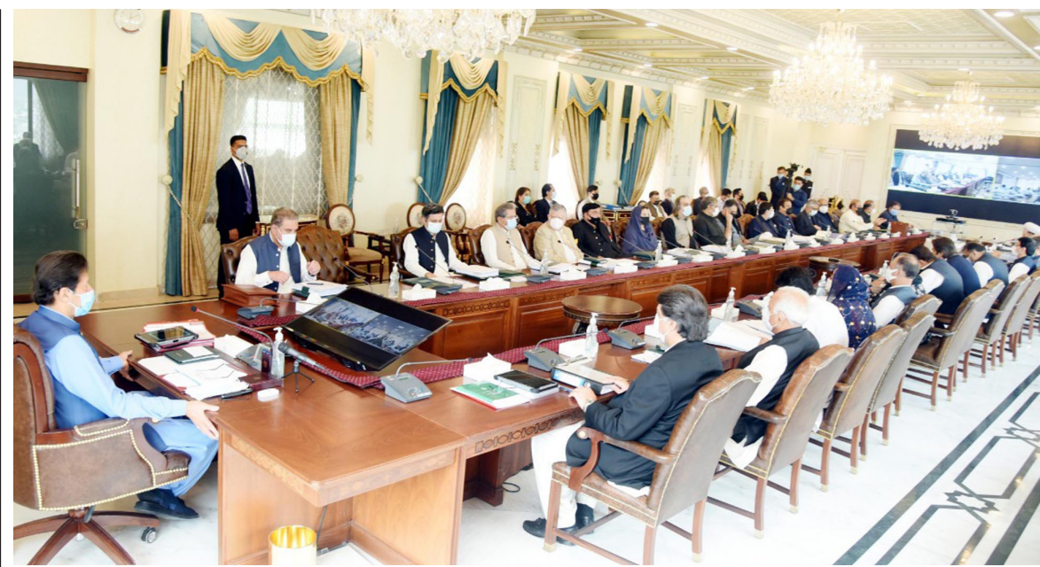
ISLAMABAD: Prime Minister Imran Khan chairs meeting of federal cabinet in Islamabad.