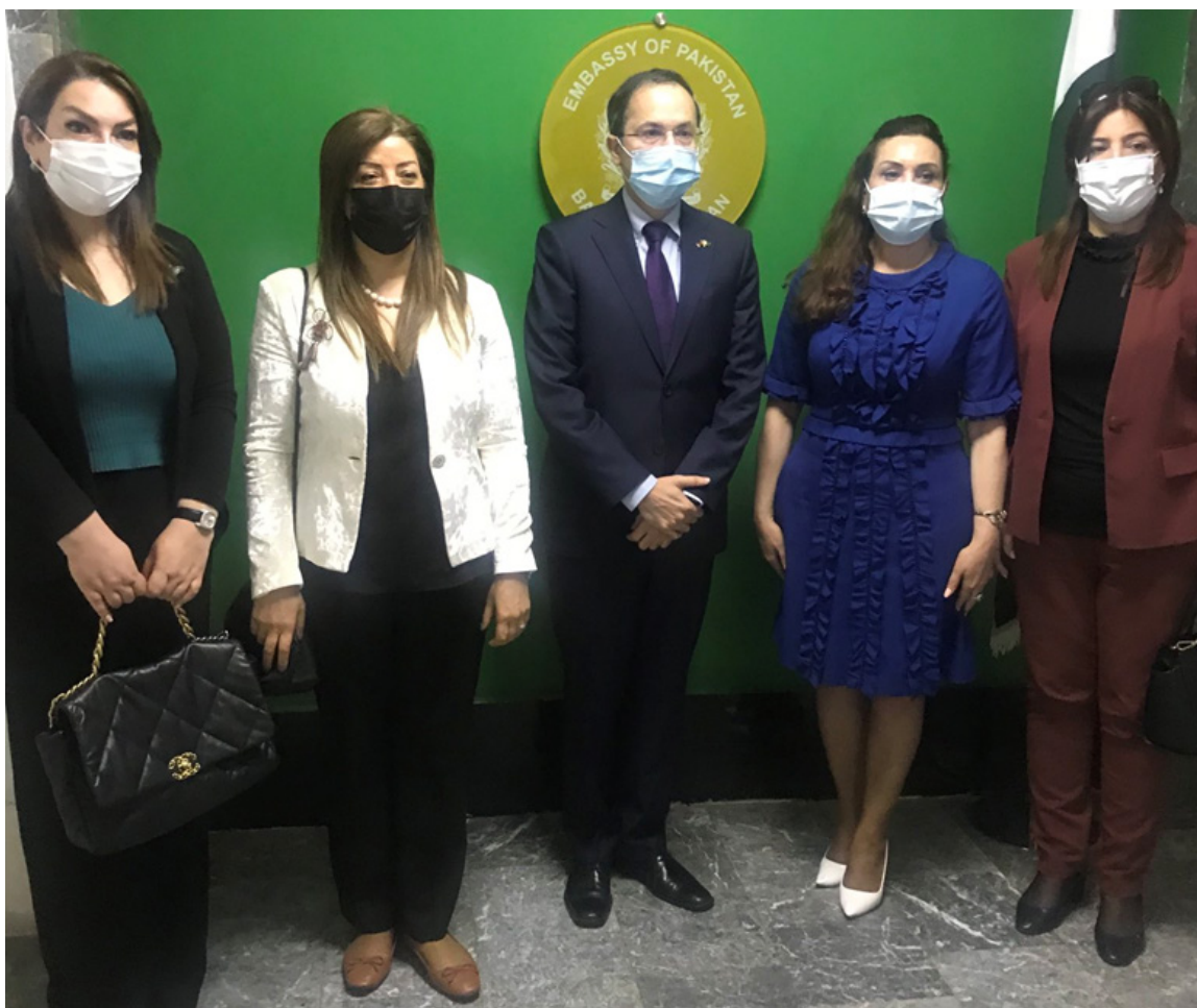
BAKU: Pakistan ambassador to Azerbaijan Bilal Hayee received delegation of Azerbaijani women entrepreneurs. Ambassador exchanged views for establishing cooperation with Pakistani women entrepreneurs through B2B meetings and visits to respective countries. — DNA

The prince himself was already airborne as the heist unfolded, headed for Ibiza in Spain, Le Parisien daily reported. The stolen lot included 250,000 euros ($300,000 at current rates) in cash, another $300,000 in cash, luxury watches and Saudi diplomatic documents. Investigators suspected the assailants had inside help since they appeared to know exactly which car to target in the robbery. The cars were later found torched in a small town northeast of Paris. — APP