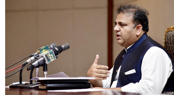
Information Minister Chaudhry Fawad Hussain speaking at a podium during a briefing in Islamabad Tuesday.

ISLAMABAD: Minister for Information and Broadcasting Chaudhry Fawad Hussain said that the Federal Cabinet has approved two ordinances as part of electoral reforms to ensure transparency in elections. He was briefing media about the decisions taken in the Federal Cabinet meeting, chaired by Prime Minister Imran Khan in Islamabad Tuesday. The Minister said one ordinance will enable the