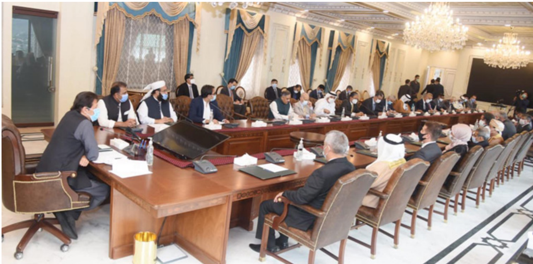
ISLAMABAD: Prime Minister Imran Khan met with the Ambassadors of OIC countries on May 03, 2021 and discussed with them issues related to Islamophobia. He briefed the ambassadors about Pakistan govt efforts regarding highlighting the issue at the global level.

UK International Trade Secretary Liz Truss said India and Britain would start negotiations on an agreement "in the autumn", following the announcement of a preliminary "Enhanced Trade Partnership" deal. "We want to get these negotiations completed as soon as possible," she told Sky News during a round of broadcast interviews touting the partnership package worth £1 billion ($1.4 billion, 1.2 billion euros). "Of course, FTAs (Free Trade Agreements) take longer, this is the immediate gains that we can get for both countries, driving jobs here in Britain and in India," Truss added.