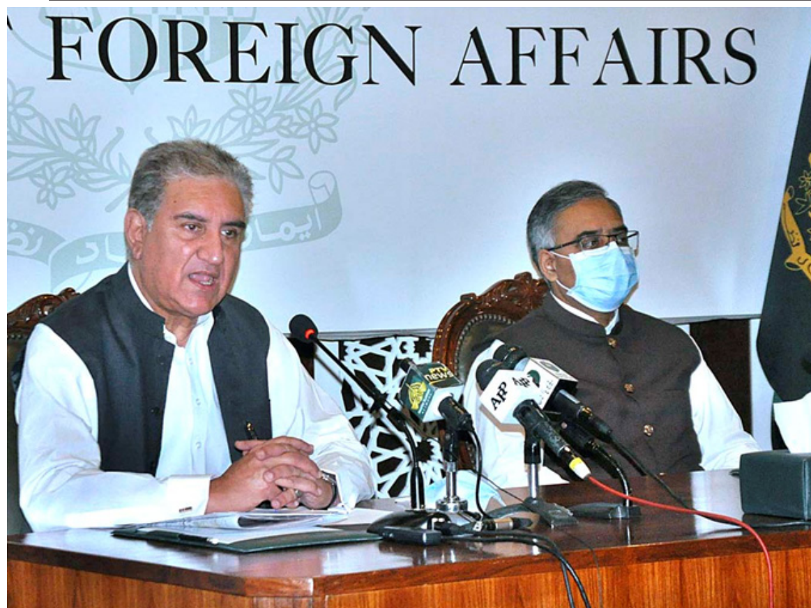
ISLAMABAD: Foreign Minister Makhdoom Shah Mahmood Qureshi addressing a media briefing at Foreign Office.

QUETTA: Pakistan Navy has started distribution of rations in rural and urban areas of Panni Tehsil of Gwadar District on the coast of Balochistan. According to official sources, On the special direction of Commander West Pakistan Navy under the supervision of Lieutenant Commander Furqan Shaukat ration bags were distributed among hundreds of deserving families in rural areas on the second day as well. The ration bag contained flour, rice, lentils, spices, salt, leaves, dates, spirits, etc. So far, thousands of families have benefited from the Pakistan Navy's charitable work. It is to be noted that in Gwadar City yesterday, under the supervision of Commanding Officer third PPF Protection Battalion Capt Abid Hussain, people of different areas of the city were provided by Pakistan Navy with the help of Mir Arshad Kalmati and other social personalities.