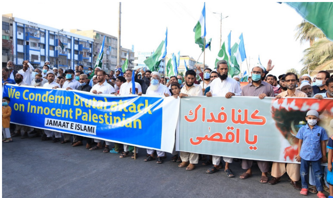
KARACHI: Large number of protestors gathered on the call of Jamaat e Islami to protest against the Israeli fascism against innocent Palestinians. Protectors asked Muslim leaders to come forward & play their part for the Palestine. — DNA

and others public places and strictly follow anti coronavirus SOPs during eid holidays. The Chief Minister underlined the need of proactive role of all segments of the society to counter the fatal infection. The Chief Minister is personally supervising the situation regarding implementation of SOPs and directed all Ministers, advisers, special assistants and MPAs to strictly follow SOPs during eid holidays. The Chief Minister has paid a surprise visit to University Road, Cantonment, City, GT Road in Peshawar the other day and expressed anguish over poor sanitation at Pabbi bazar in Nowshera. — APP