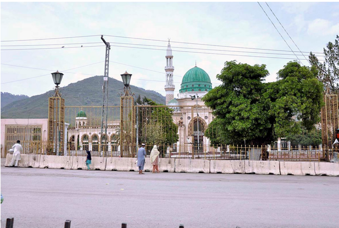
ISLAMABAD: May 11 – A view of Bari Imam Shrine closed for precaution against the spread of the coronavirus.

Geo Political Environment in CPSC's book stresses that by consolidating their time-tested bonds, Pakistan and China can strive together to build shared future for mankind. CPSC has been tasked with carrying out dedicated research and analysis of China's policies, and their impact on Pakistan and the region. It is also engaged in national and international outreach to promote better understanding of Pak-China relations, develop linkages with think-tanks in China and advance people to people contacts, the report added.