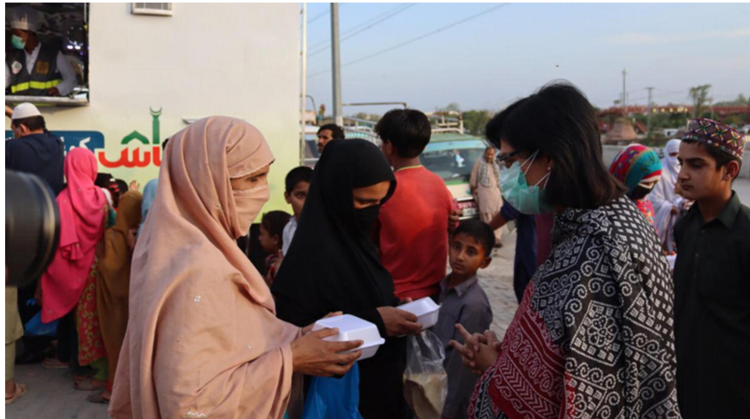
ISLAMABAD: Dr. Sania Nishtar, SAPM on poverty alleviation reviews Iftar distribution operations.

Rain-wind-thunderstorm was expected at isolated places in Pothohar region, upper Punjab, Khyber Pakhtunkhwa, Upper Sindh, Kashmir and Gilgit Baltistan, the Pakistan Meteorological Department said. Maximum temperatures (in °C) recorded on Tuesday were: Sibbi, Shaheed Benazirabad, Dadu and Mohenjo-Daro 44, and Rahim Yar Khan, Bahawalnagar, Padidan and Jacobabad 43. — APP