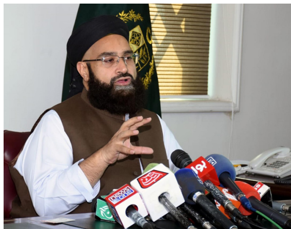
discussed taking practical steps for resolving the issues of Islamophobia, blasphemy on a permanent basis. Pakistan was expanding co-

Saudi Crown Prince Muhammad bin Salman has accepted the invitation to visit Pakistan. The most important leaders of the Arab Islamic world would visit Pakistan during the year 2021. He said the establishment of Pak Saudi Supreme Co-ordination Council, agreements in various fields would strengthen religious, trade, economic and social ties. The Prime Minister during his meetings with the leadership of Saudi Arabia, Organization of Islamic Cooperation, Rabita-e-Alam-e-Islami and Imams of the Holy Mosques