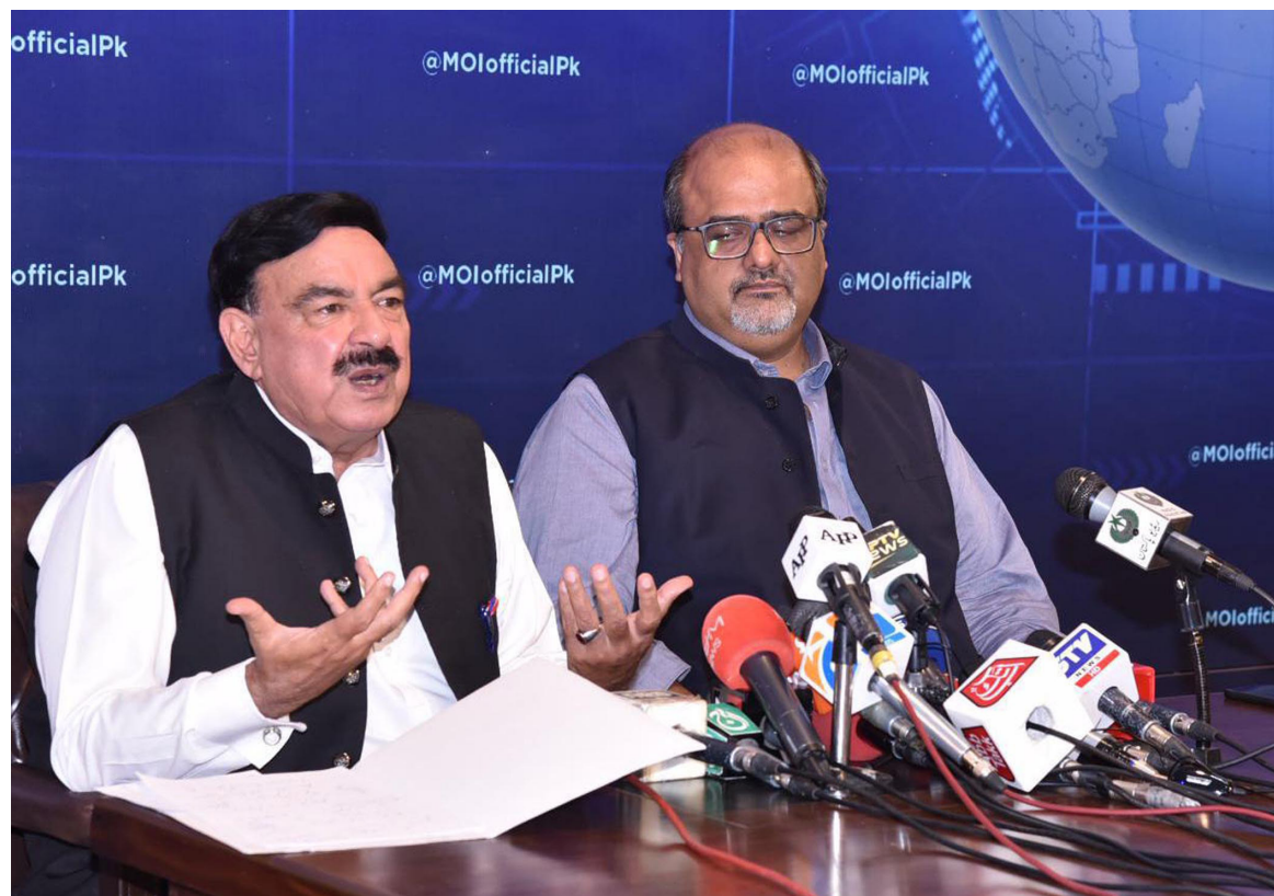
ISLAMABAD: Minister for Interior, Sheikh Rashid Ahmed and Adviser to Prime Minister on Accountability, Barrister Shahzad Akbar addressing a Press Conference after attending meeting of the sub-committee of the Cabinet on ECL.