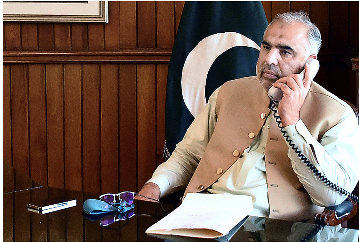
ISLAMABAD: Speaker National Assembly Asad Qaiser in a telephonic call with Speaker of the Islamic Consultative Assembly of Iran Mohammad Bagher Ghalibaf.

ing and any other hazardous activity being done in the forest area. "It is a very unique facility they had to cherish in leisure time and enjoy natural peace and tranquility along with maintaining physical health," he added. To a query, he said around 40 to 50 volunteers on average were visiting trails of Margalla Hills National Park to lift waste during the nine-day long drive. He added that the cleanup was carried out on Trail 2, Trail 3, Trail 4, Trail 5 and Trail 6 where the first two of the above mentioned had maximum littered waste due to its close proximity to Daman-e-Koh view point and restaurants.