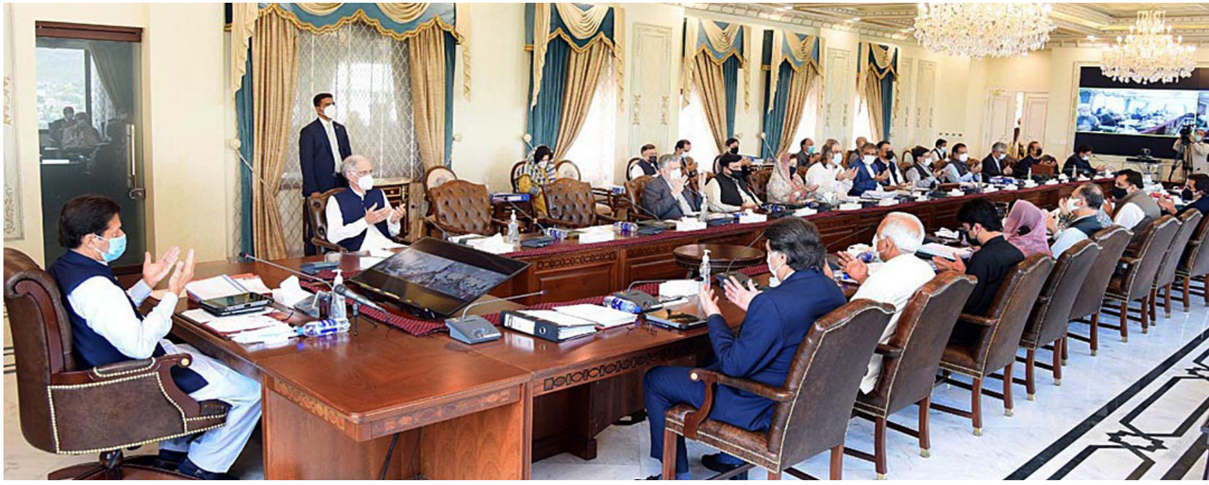
ISLAMABAD: Prime Minister Imran Khan and Cabinet members offering Fataha for martyrs of Palestine during Federal Cabinet meeting.

The canal land each has been acquired for graveyards at Karakal and Bumburate, four kanal for graveyard at Broom Bumburate, four kanal for dancing place at Batrik Bumburate, 1.5 kanal for graveyard at BehalBirir, 0.306 Kanal for dancing place at BehalBirir, 0.335 kanal and two kanal for Kalash Festivals at Balangur and ButhetRumboor respectively, 1.5 kanal for graveyard at Batrik Bumburate, 0.28 kanal at Kalashagram, Rumboor, and 0.16 kanal for Batrik, Bumburate. - APP