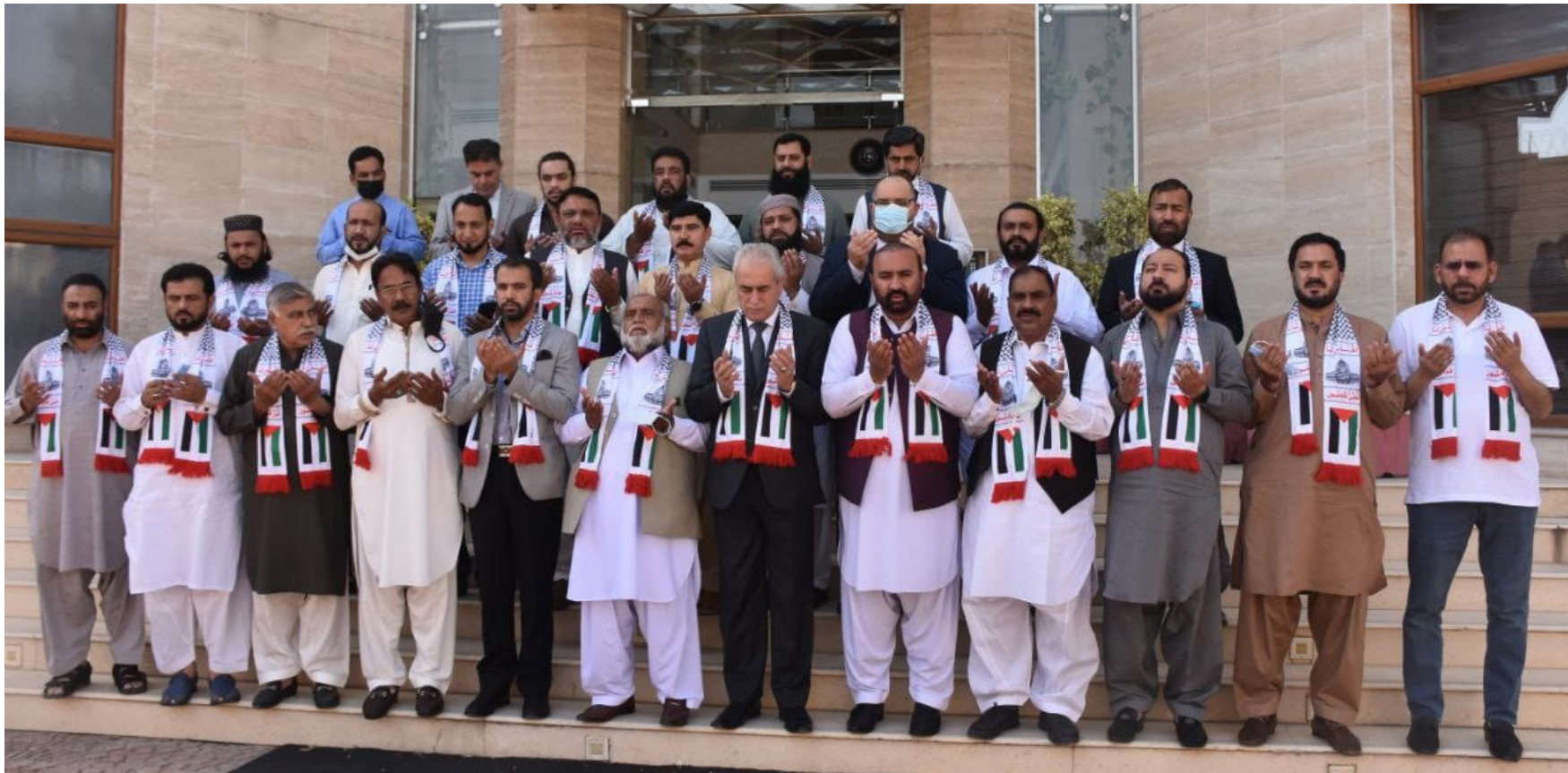
ISLAMABAD: Members of civil society showing solidarity with Palestine during their visit to Palestine embassy.

ISLAMABAD: Federal Board of Revenue (FBR) has launched the software of electronic hearing of tax audit and assessment cases to facilitate the taxpayers. This has been done by enabling and functionalizing the e-Hearings module in the Iris. The module enables online hearing both from the dedicated hearing rooms established in the field formations and from the places of the taxpayers. Such e-Hearings would be recorded and archived for further legal and administrative utilization. In the first phase, the module has been launched and tested in LTO Islamabad, RTO Rawalpindi, RTO Faisalabad and RTO Peshawar wherein online e-Hearings through the dedicated e-Hearing Rooms and from the places of the taxpayers, have been enabled.