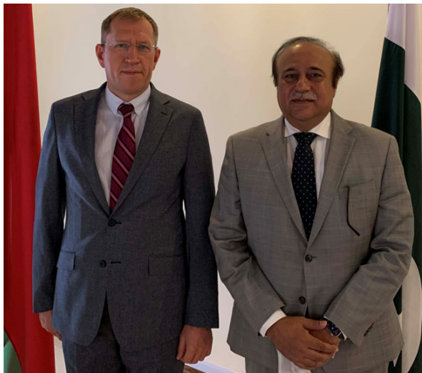
Asad Qaiser talking to Ambassador of the Republic of Belarus Andrei Metelista, who called on him in Islam-

The Sides agreed to maintain working contacts to use the resources of parliamentarians in strengthening bilateral cooperation in various areas. Last month Speaker National Assembly