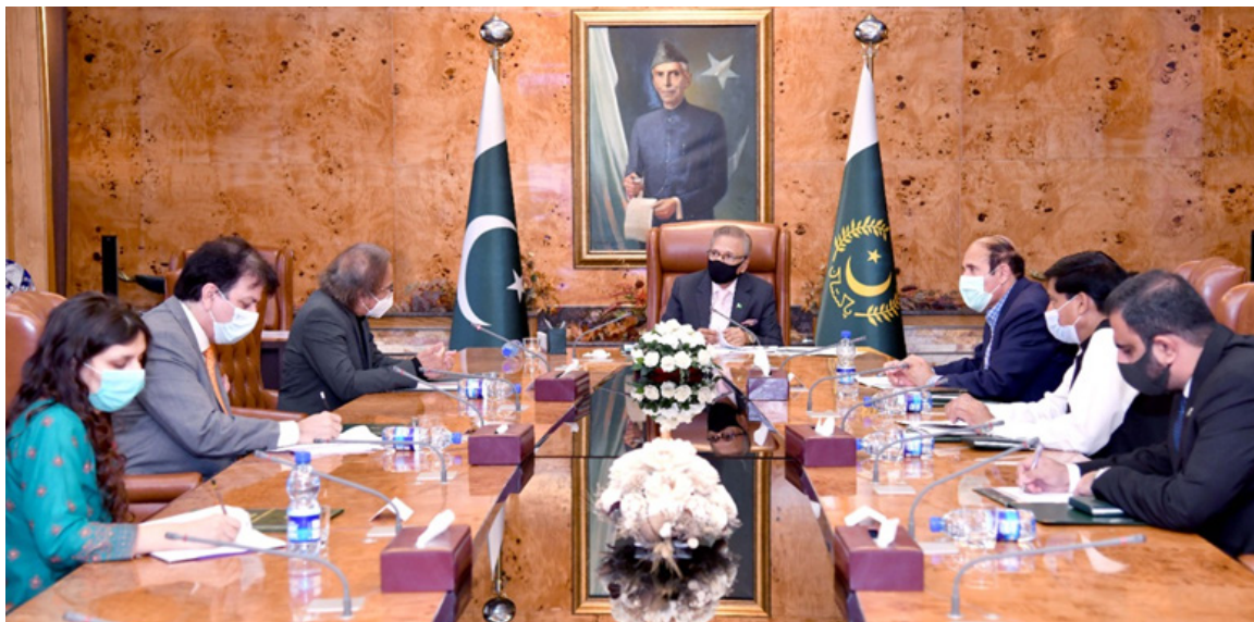
ISLAMABAD: President Dr Arif Alvi being briefed about the National College of Arts, Lahore, at Aiwan-e-Sadr.

He said that establishment of an assembly plant of Belarus Tractor in Pakistan was in process and would start its operations.