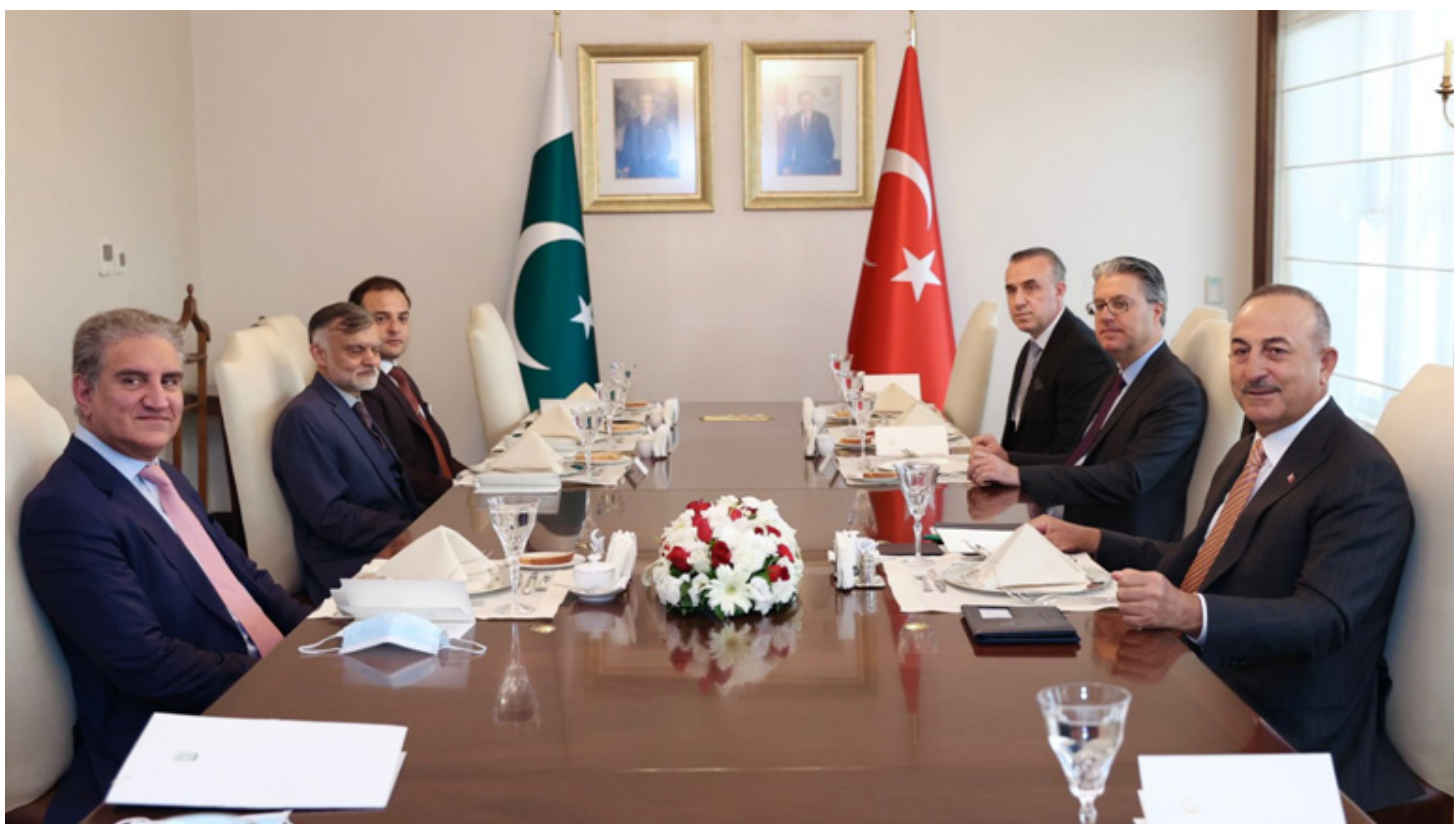
ANKARA: Foreign minister of Pakistan Shah Mehmood Quraishi in a meeting with Turkish counterpart on his way to New York.

Some 93 per cent of global road fatalities occur in low- and middle-income countries. Road traffic injuries are the leading cause of death for children and young adults aged 5-29 years.