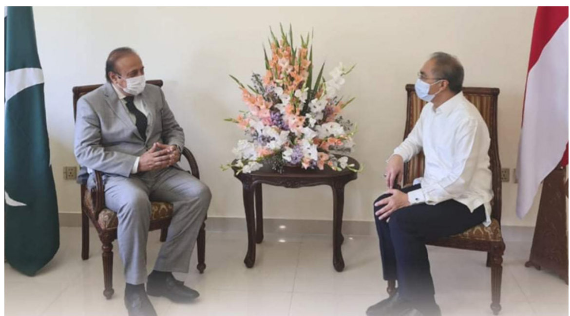
ISLAMABAD: Ambassador Adam M. Tugio of Indonesia held a meeting with Chairman, National Assembly Standing Committee on Foreign Affairs, Mr. Malik Ehsan Ullah Tiwana. - DNA

were rescued, with warships attempting to save the rest of the crew in "extremely challenging sea conditions". Navy helicopters managed, however, to rescue all 137 people stuck on another barge that also slipped its anchor and ran aground. One other barge and an oil rig were also adrift. Elsewhere, seven fresh casualties took the toll to 27 including a child crushed by a collapsing wall, an 80-year-old woman killed by a falling pole and a teenage girl by a crumbling roof. More than 16,500 houses were damaged, 40,000 trees were uprooted and 2,400 villages were without power. - APP