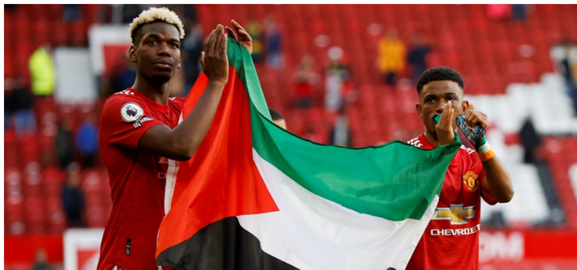
MANCHESTER: Manchester United's Paul Pogba (L) and Amad Diallo applaud fans while holding a Palestinian flag. - DNA

The association, which represents about 6,000 primary care doctors, made the appeal amid a jump in infections that has resulted in a shortage of hospital beds. - Foreign Desk