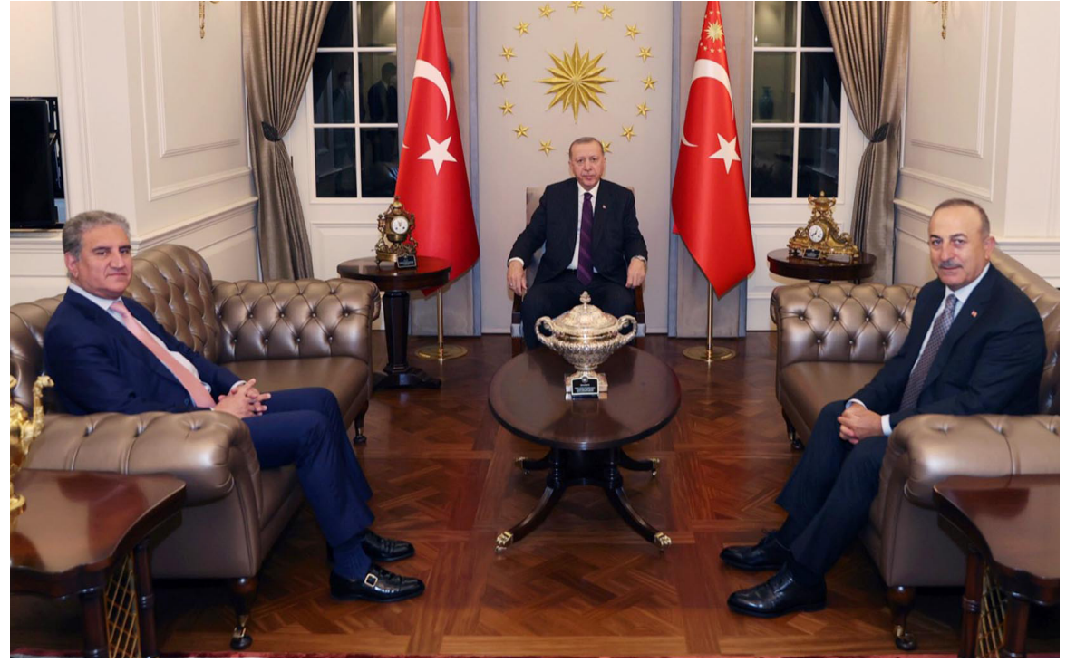
ANKARA: Foreign Minister Shah Mehmood Qureshi called on Turkish President Recep Tayyip Erdogan. Turkish Foreign Minister Mevlut Cavusoglu is also present on the occasion.

ISLAMABAD: Planning Minister Asad Umar inaugurated mass vaccination center in Islamabad Wednesday. Speaking on the occasion, along with Special Assistant to Prime Minister on Health Services Dr. Faisal Sultan, he said Seven thousand people will be vaccinated in a day at the newly inaugurated vaccination center. He said seventy five counters and 100 well trained people have been deployed to vaccinate the people. Asad Umar said decisions regarding marriage halls, educational institutions, and business centers will be issued on Tuesday. The Minister this campaign is meant to make the city corona free. Asad Umar vowed to achieve vaccination target at the earliest. He urged the public to get vaccinated to fight this dangerous pandemic. He said forty six hundred thousand people have been vaccinated so far.