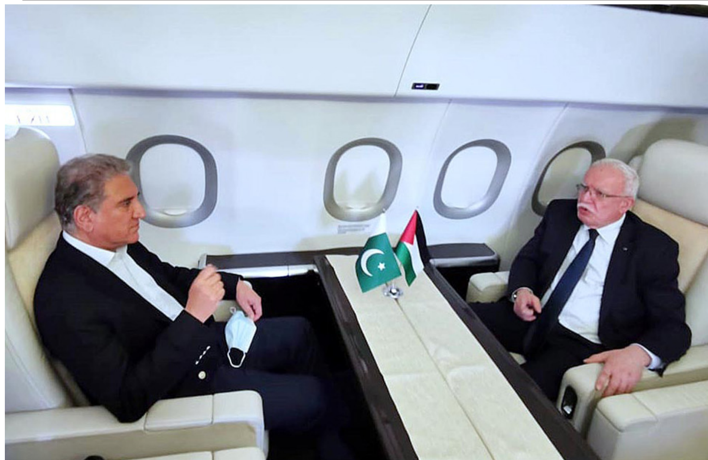
ANKARA: Foreign Minister Makhdoom Shah Mahmood Qureshi held a bilateral meeting with Foreign Minister of Palestine, Riad Al Maliki at airport before their joint departure to New York.

NEW YORK: Donald Trump and his family faced the increasing likelihood of criminal charges Wednesday after New York state's prosecutor said it was working with Manhattan investigators in its probe into the former president's business dealings. The office of New York state Attorney General Letitia James announced late Tuesday it was investigating the Trump Organization in a "criminal capacity." Previously, it had said its probe into possible tax, insurance and bank fraud was through civil proceedings, which do not carry the threat of an indictment or imprisonment. Trump denies wrongdoing, and has described the parallel criminal investigation by Manhattan's district attorney as "a continuation of the greatest political witch hunt in the history of our country." - Agencies