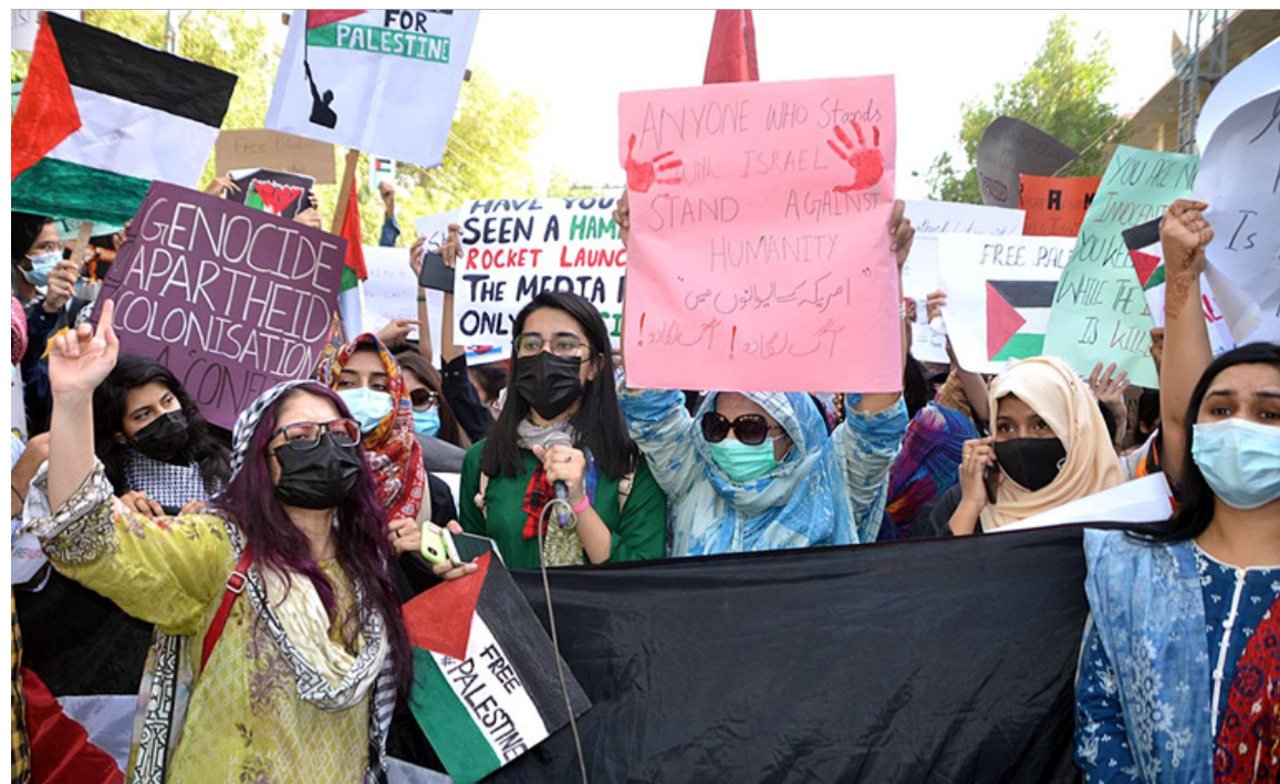
HYDERABAD: Students holding placards during a protest demonstration against Israeli attacks on Gaza in front of Press Club.