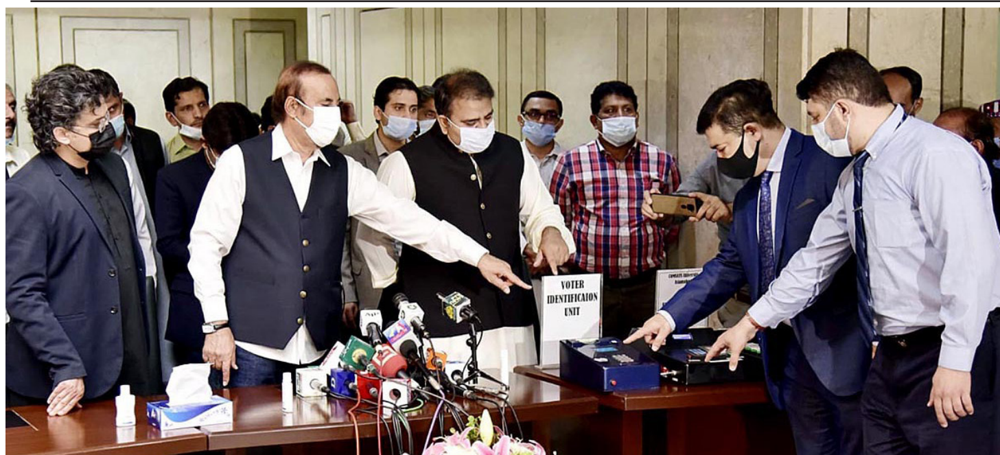
ISLAMABAD: Chaudhry Fawad Hussain, Federal Minister for Information and Broadcasting and Dr. Baber Awan, Advisor to Prime Minister on Parliamentary Affairs briefing the media persons about Electronic Voting Machine (EVM).

within the shortest possible time. Since international bookings are done through the internet therefore this is yet another ordeal the customers have to undergo. Most of the time the internet is not working or the connection is extremely slow thus taking more time in disposing of cases for international booking. Another customer who came to the GPO to get some information about driving license fee, told the government and especially the Communication Minister Murad Saeed claimed to have revolutionized the Post Offices, however the situation on ground was absolutely different. People still had to stand in long queues simply because there were not enough counters and staff. If that is the situation in the GPO, which is located right in the heart of the Capital, then what would be the situation in the rest of the country, he questioned.