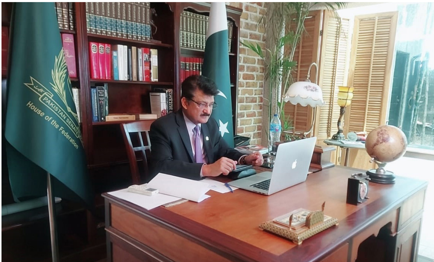
ISLAMABAD: Leader of the House in the Senate, Senator Dr. Shahzad Waseem addressing a virtual Youth Caucus organized by the center for Research & Security Studies (CRSS).

chair lifts for resorts would go a long way in promoting the tourism sector. He said that besides the cost of land, the development of a 4 to 5 star hotel was capital intensive primarily due to the extensive duties in place and much longer payback period. Therefore, he emphasized that the government should announce at least a 5-10 year tax holiday along with various other incentives for investment in the tourism industry. Since the return on investment in the hotel industry comes after 7 to 10 years, therefore a tax holiday of minimum 5-10 years was important to make this sector more lucrative for investors and a game changer for the economy.