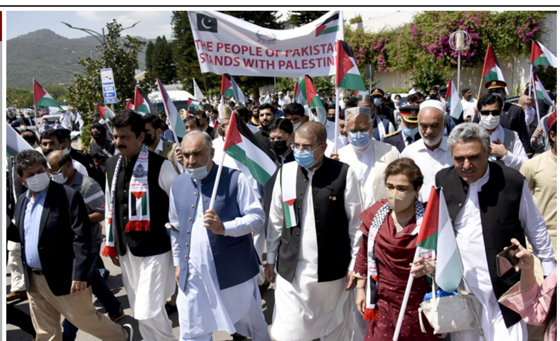
ISLAMABAD: Chairman Senate, Muhammad SadiqSanjrani and Speaker National Assembly AsadQasir leading rally of the parliamentarians to show solidarity with peoples of Palestine on current situation in Gaza Palestine, at parliament house.

Speaking on the occasion, businessmen leaders said, "In order to show solidarity with the Palestinians, we all strongly condemn the Israeli aggression." They said that international community should play its active role in stopping brutal violence against the oppressed Palestinians. They said that the brutal violence against the oppressed citizens of Palestine is a cowardly act that deserves maximum condemnation. They said that ruthless and indiscriminate use of force by Israeli army against the helpless and defenseless Palestinians is a serious and blatant violation of international laws and principles including human and fundamental rights. - APP