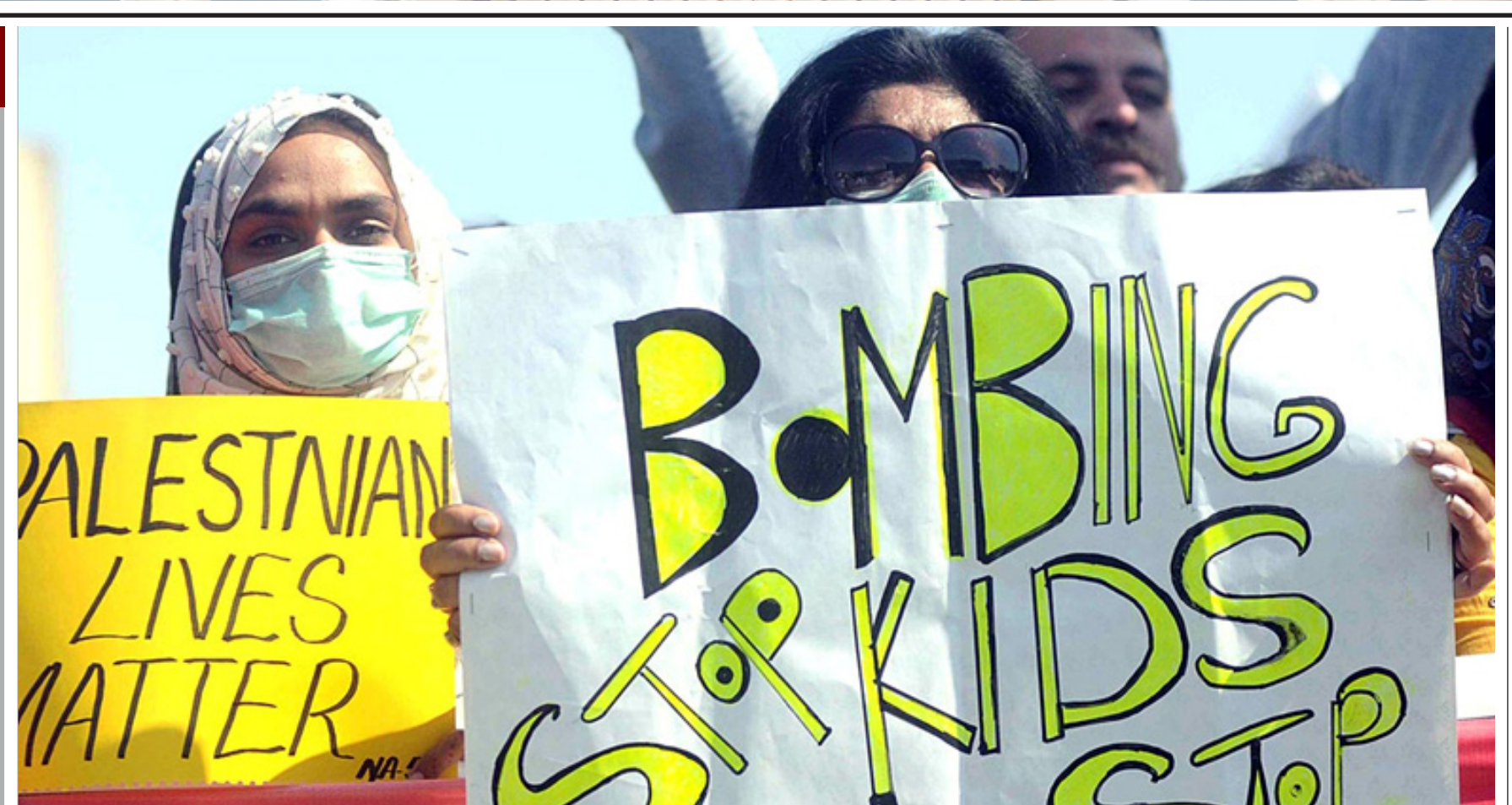
ISLAMABAD: People from different walks of life participating in a protest demonstration against Israeli attack on Gaza in front of National Press Club.

It may be mentioned here that the court had instructed the society's lawyer to submit cross arguments against the NAB reply in the case. The court had also or dered to unfreeze the bank accounts of society to meet its day to day expenditures.