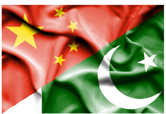
Recalling his visit to Pakistan in 2019 as an element of high level bilateral en-

Vice-President Chinese added that China attached immense importance to its ties with Pakistan and would continue developing bilateral strategic relations as envisaged by the leadership and peoples of two countries